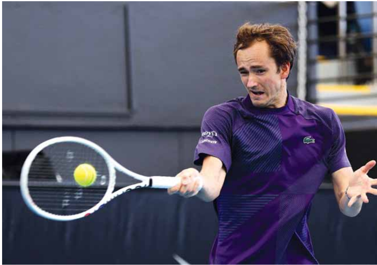
Russia's Daniil Medvedev in action during his second round match against Serbia's Miomir Kecmanovic at Memorial Drive Tennis Club in Adelaide yesterday.

She will meet Marketa Vondrousova for a place in the last four after the Czech player's dominant 6-0, 6-4 dismissal of Estonian Kaia Kanepi.