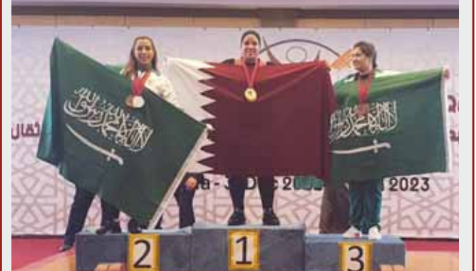
Qatar national team achieved 13 medals (9 gold and 4 silver) on the closing day of the Men's West Asian weightlifting Championship and 17th Men's and Women's Qatar Weightlifting Cup. The two events were organised by the Qatar Weightlifting Federation over four days with the participation of 100 weightlifters representing 15 countries.