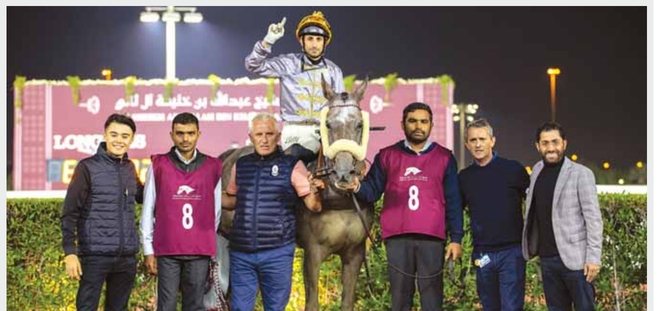
Connections of Meethag celebrate after the victory.