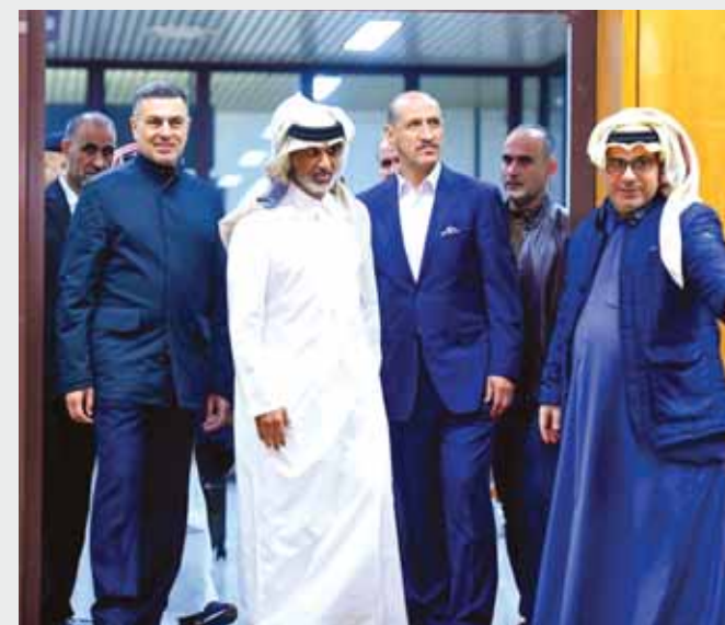
Qatar Football Association president Sheikh Hamad bin Khalifa bin Ahmed al-Thani with Iraq Football Association chief Adnan Dirjal in Basra yesterday.

Meanwhile, the Iraq Football Association said yesterday ninety percent of the tickets for the tournament have been sold electronically. The association's president Adnan Dirjal said that all preparations have been completed for the event and promised that the opening ceremony would be a major attraction. He said companies and teams from Germany, Italy, the Netherlands and other nations would participate in the opening spectacle, to showcase Iraq's rich history. Dirjal also confirmed that all stadiums are equipped with the latest technology, including VAR, which will be applied for the first time ever at the Arab Gulf Cup in conjunction with 43 Iraqi, Arab and foreign referees.