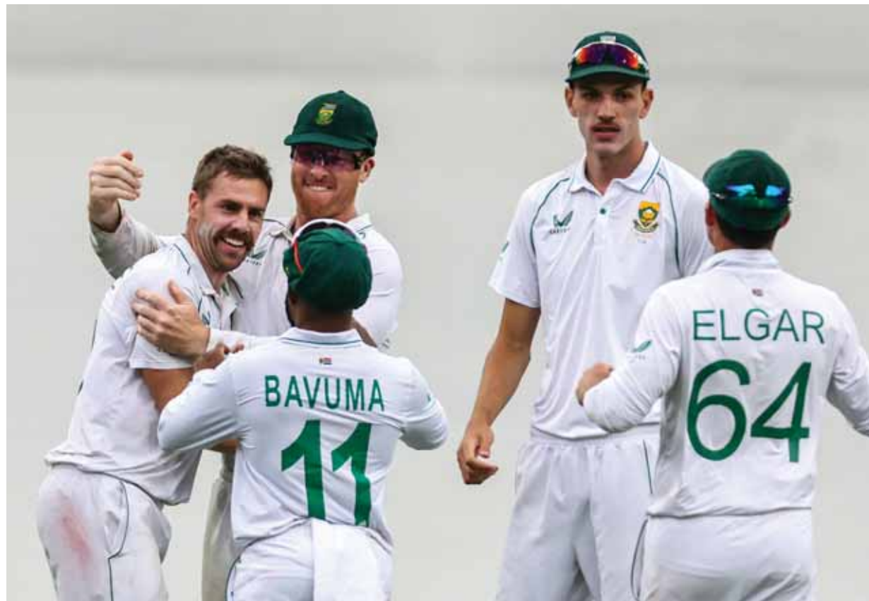
South Africa's Anrich Nortje celebrates with teammates after dismissing Australia's Marnus Labuschagne during the third Test in Sydney yesterday.

really good set there and that one obviously just kicked."