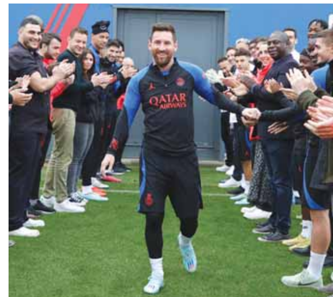
Lionel Messi is given a guard of honour by his PSG teammates and club staff at the training ground yesterday.

Seventeen days after guiding Argentina to an epic World Cup final victory over France, Lionel Messi reported back to work yesterday, his French club Paris Saint-Germain announced. The 35-year-old seven-time Ballon d'Or winner reported back to the club's training ground as they prepare for Saturday's French Cup tie at third tier side Chateauroux.