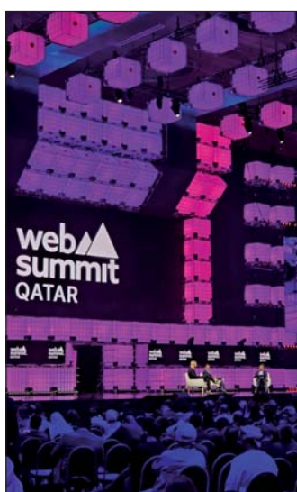
A session in progress at the centre stage of Web Summit Qatar 2024 yesterday.

A highlight is that 10% of startups have joined through Web Summit Qatar's Impact programme, which focuses on tech for good. A total of 358 startups will take part in 42 Mentor Hours ses-