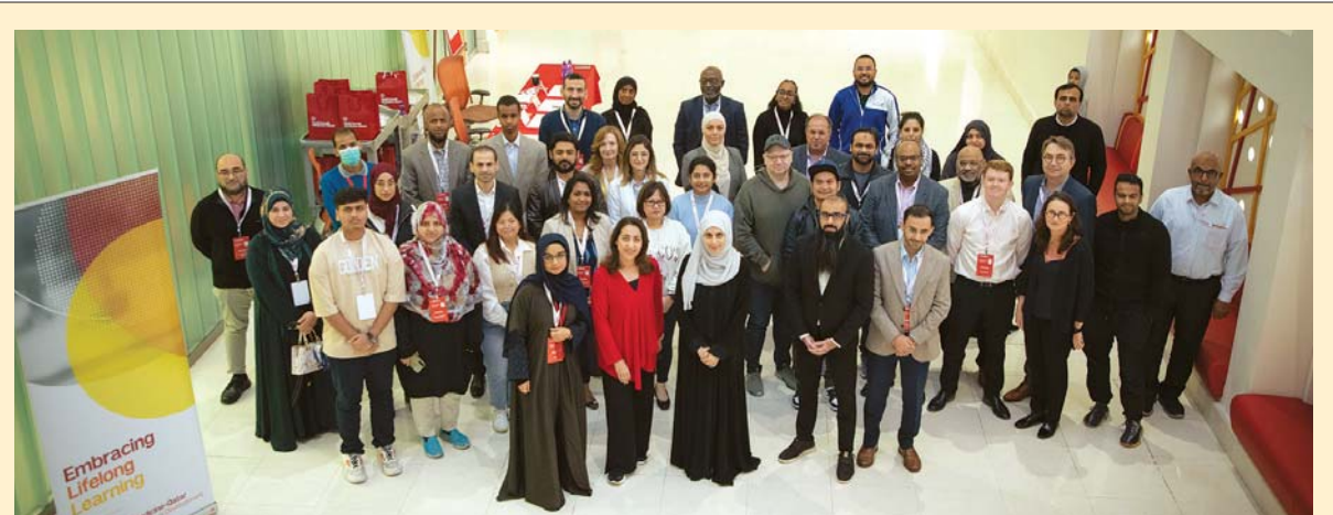
Speakers and attendees at the event.

HE the Minister of State for International Co-operation at the Ministry of Foreign Affairs Lolwah bint Rashid AlKhatir met yesterday with Irish Minister of State for European Affairs and Defence Peter Burke, on the sidelines of the High-level Segment of the 55th Session of the UN Human Rights Council, held at the UN office in Geneva. The meeting discussed co-operation aspects between the two countries, especially in humanitarian and development fields in Gaza and Sudan. They also discussed the need to resume support for the UN Relief and Works Agency for Palestine Refugees (UNRWA) to enhance its efforts in Gaza, the West Bank, Jordan, Lebanon, and Syria, in addition to the challenges that impede the entry of humanitarian aid into the Gaza Strip, and Qatar's initiative to evacuate and treat injured Palestinian victims of the war on Gaza. (QNA)