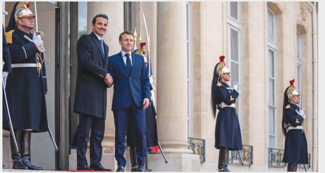
His Highness the Amir Sheikh Tamim bin Hamad al-Thani and French President Emmanuel Macron held an official talks session at the Elysee Palace in Paris yesterday. His Highness the Amir and the French president also held a bilateral meeting in which they discussed co-operation relations between the two friendly countries, in addition to discussing a number of issues of mutual interest. An official reception ceremony was held for His Highness the Amir upon his arrival at the Elysee Palace.