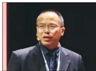
Cao Ming speaks at the Mobile World Congress 2024 in Barcelona on Monday.

(1) The 64T MetaAAU with Extremely Large Antenna Array (ELAA) supports multi-band operations, achieving 5Gbps eve-