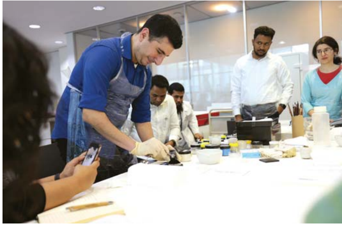
The project falls in line with Qatar Foundation's multiversity approach.

Under the project, QNL's scientific laboratory and Qeeri's Corrosion Centre will unite to conduct experiments and develop new methodologies to stabilise inks and metal-containing pigments used in old Islamic illuminated manuscripts. The unstable iron-gall ink represents one of the primary factors behind the chemical process responsible for the degradation of heritage documents, impacting a quarter of all Islamic manuscripts worldwide. How-