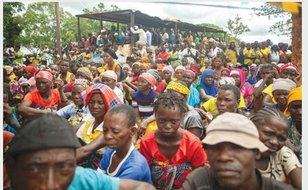
Displaced people from the province of Cabo Delgado gather to receive humanitarian aid from the World Food Programme (WFP) at the 21 de Abril Tribune School in the town of Namapa, Erati district of Nampula, Mozambique, yesterday. A new outbreak of violence occurred in northern Mozambique about two weeks ago, according to local sources and the International Organisation for Migration (IOM), a UN agency. The IOM estimates the number of displaced people who fled attacks in Macomia, Chiure, Mecufi, Mocimboa da Praia and Muimbe between December 22 and February 25 at 71,681 people.