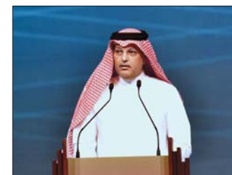
HE Mohamed bin Ali al-Mannai speaks at the launch event.

The Minister highlighted the initiative's six strategic pillars: Digital Infrastructure, Digital Government, Digital Technology, Digital Innovation, Digital Economy, and Digital Society. Com-