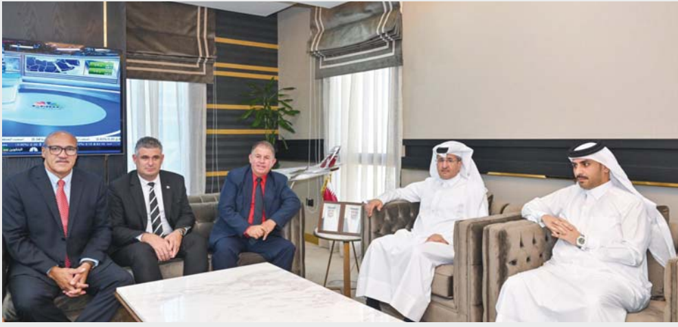
Mohamed Falah al-Hajri, in-charge of managing Qatar Civil Aviation Authority (QCAA), and President of the Institute of Aeronautics and Civil Aviation (IACC) of the Republic of Cuba Armando Luis Daniel Lopez, discussed areas of mutual co-operation in civil aviation. During the meeting, they discussed various issues related to civil aviation, safety, security, environmental protection, and enhancing sustainable development in line with the ICAO strategic objectives. They also explored ways to develop mechanisms for exchanging support and expertise between the two countries to address all current and future challenges in the aviation sector and achieve further growth and development in this field. (QNA)