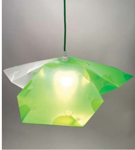
Bunch of Mottos

30); Msheireb to Milan FROMM. Studio, at M7 (until March 8); "The World As We Know It Is Changing" at Galleria, MDD (until today); "Cultural Kinship" at M7, Studio 7 (until March 30); "Crafting Uzbekistan: Tradition in Threads" at M7, Learning Space (until March 30); "Forgotten Spaces: An Immersive Installation of Carpets and Tapestries" at Galleria, MDD (until March 30); "Virtual Visions and DAUP" - Interactive Installation by Qatar University at Sahat Al Nakheel, MDD (until tomorrow); Jalset Sawa Booth by Studio EF at M7 - 1st Floor (until March 30); "Momenta