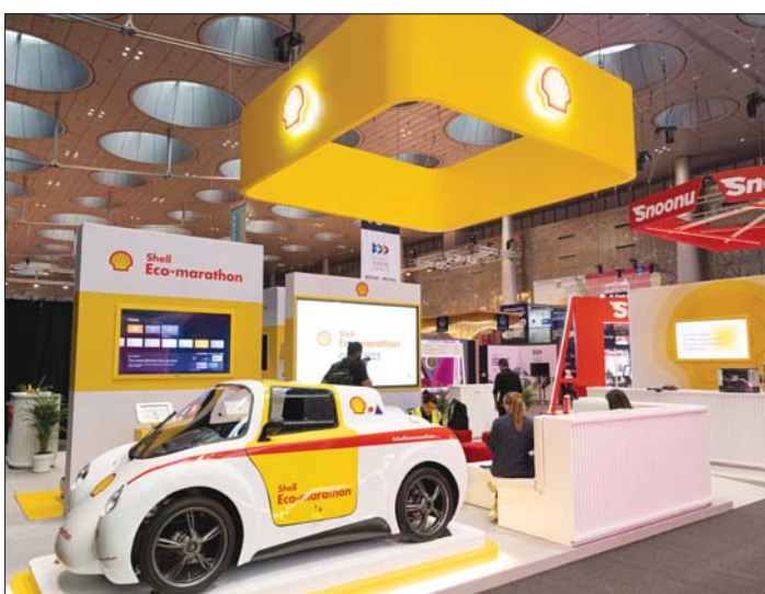
At the Shell booth at Web Summit Qatar 2024, visitors can get up close to a Shell Eco-marathon vehicle and learn more about the programme.