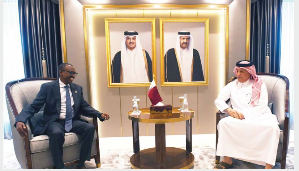
HE the Minister of State for Foreign Affairs Sultan bin Saad al-Muraikhi met with ambassador of the Republic of Djibouti to Qatar Tayeb Dbd Robleh. The meeting discussed aspects of bilateral co-operation. (QNA)