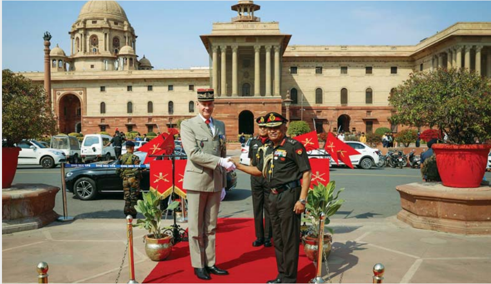
French army chief General Pierre Schill shakes hands with his Indian counterpart General Manoj Pandey during his ceremonial reception in New Delhi, India, yesterday.