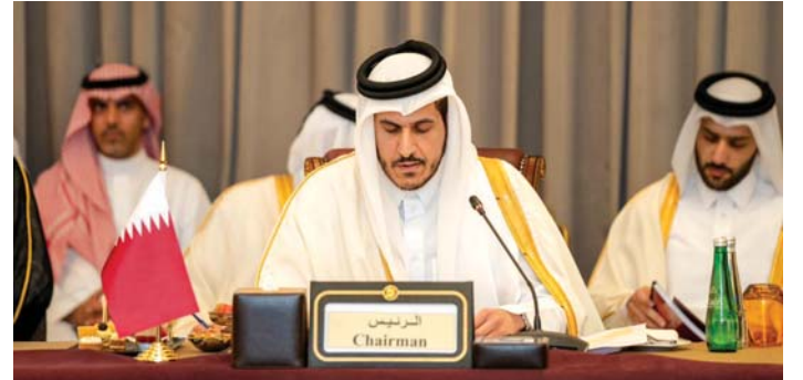
The delegation of Qatar is led by HE the Minister of Commerce and Industry Sheikh Mohamed bin Hamad bin Qassim al-Thani.

The meeting dealt with ways of co-operation and development regarding the free trade agreement between the two sides, emphasising the importance of concluding the negotiation rounds for the Free Trade Agreement, which began on June 22, 2020. On the sidelines of the 13th Ministerial Conference of the World Trade Organization, the Minister of Commerce and Industry participated in the coordination meeting of Arab Trade Ministers, with the participation of trade ministers from Arab member countries of the organisation and the attendance of Director-General of the World Trade Or-