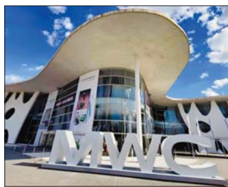
The venue of the Mobile World Congress 2024 in Barcelona.

proach for 5.5G equipment, based on "Native Green" design, improves energy efficiency tenfold. Verified in Zhejiang, China, it significantly reduces power consumption in both idle and active modes, achieving all-day energy savings.