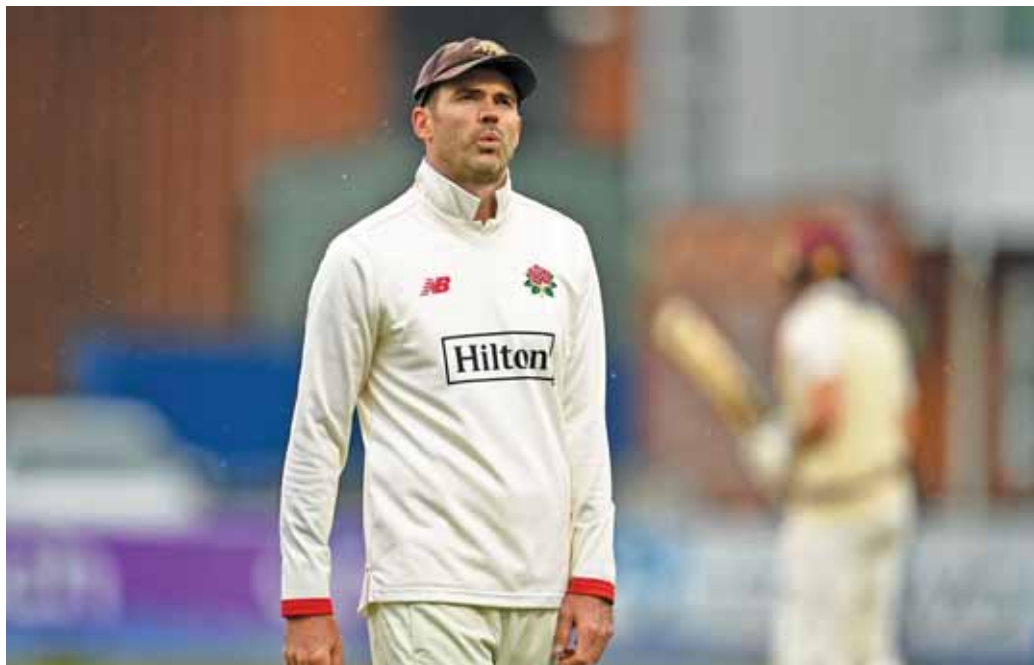
James Anderson will play his 188th and final Test against West Indies this month.

England have included three uncapped players in their squad for the first two matches of a three-Test series against the West Indies, with Jamie Smith selected