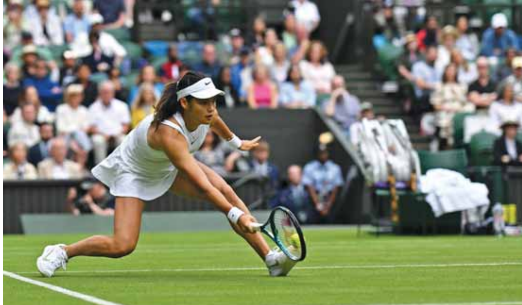
Britain's Emma Raducanu returns against Mexico's Renata Zarazua during their singles match on the first day of the 2024 Wimbledon Championships in southwest London yesterday.

British wildcard Yuriko Miyazaki followed Raducanu's victory as