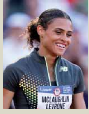
reporters. "The bigger the moment, the faster I run."

"I definitely thrive off pressure. I thrive off big moments," he told