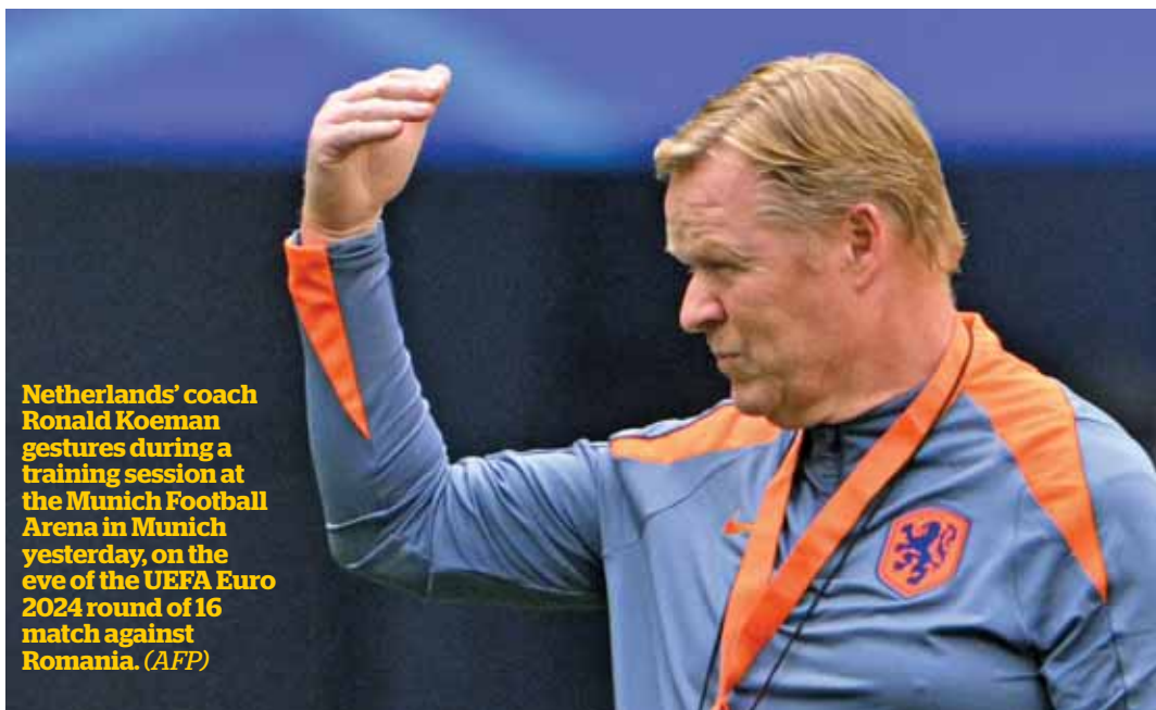
Netherlands' coach Ronald Koeman gestures during a training session at the Munich Football Arena in Munich yesterday, on the eve of the UEFA Euro 2024 round of 16 match against Romania.

"We will need to start fighting from the first few seconds."