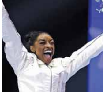
the immediate aftermath of Tokyo she had "never pictured going to another Olympic Games."

The 27-year-old told an exultant crowd in Minneapolis that in