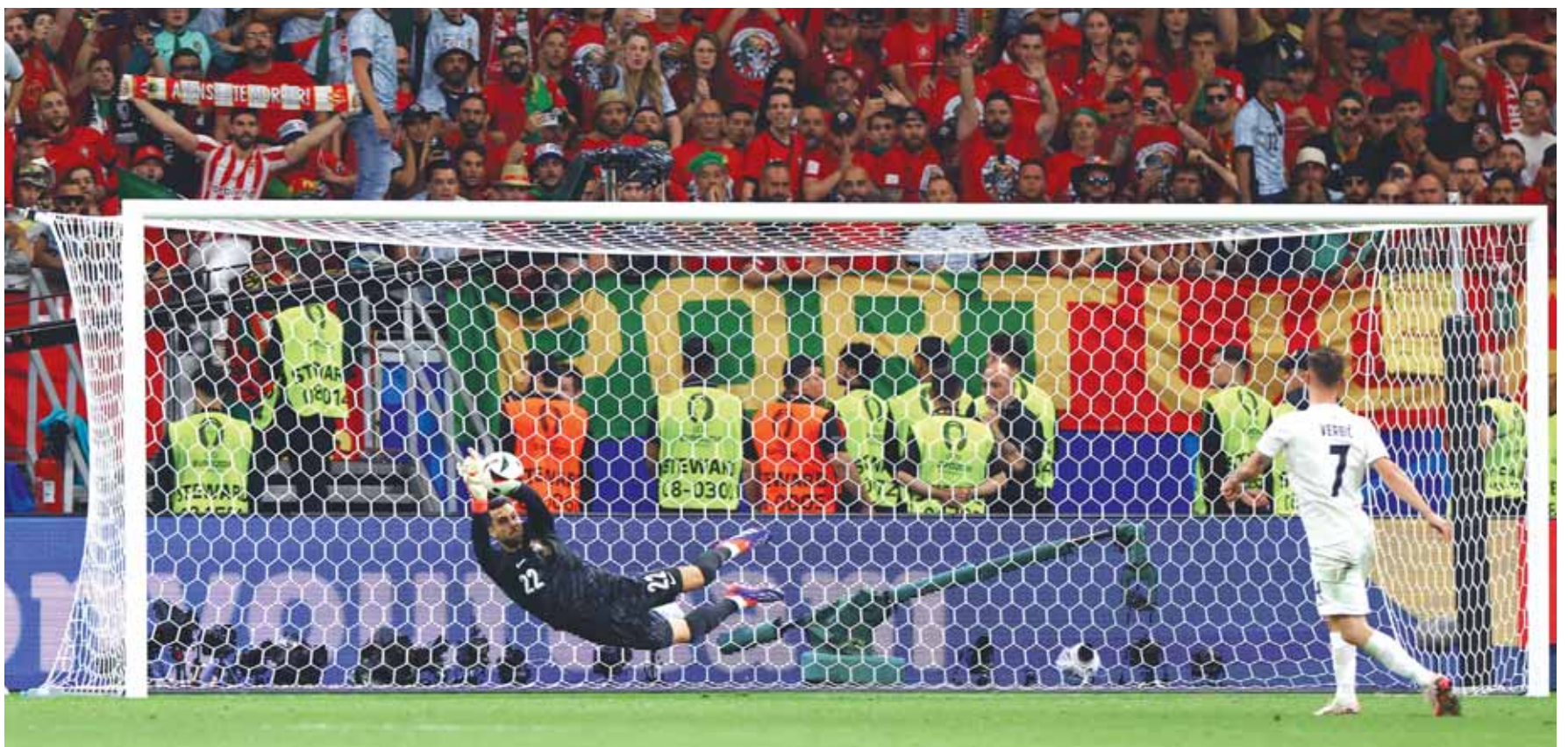
Portugal's Diogo Costa saves a shot from Slovenia's Benjamin Verbic during the penalty shootout in their Euro 2024 Round of 16 match in Frankfurt yesterday.

Costa then saved from Benjamin Verbic, setting Silva up to confidently slot home the winner to put Portugal through to the last eight and a meeting with the French in Hamburg on Friday.