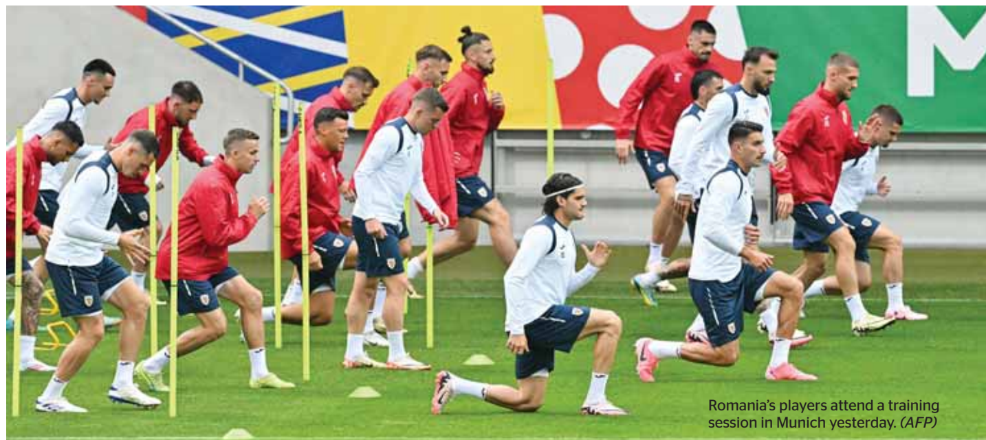
Romania's players attend a training session in Munich yesterday.

Inter Miami star Lionel Messi is joined by teammates Sergio Busquets, Jordi Alba and Luis Suarez on the 30-player lineup announced yesterday for the MLS All-Star Game. The league's top talents will face the Mexican League All-Stars on July 24 at Columbus, Ohio. Eight-time Ballon d'Or winner Messi, a 37-year-old forward who sparked Argentina to victory in the 2022 World Cup, scored 12 goals and added 13 assists in his first 12 matches this season for MLS overall leader Miami. Together with striker Suarez, midfielder Busquets and left back Alba, Inter Miami has a league-best 13-3 with five drawn record and 44 points over 21 matches. The roster was selected through a combination of fan, media and player voting as well as designations by All-Star coach Wilfried Nancy of the host Columbus Crew, the reigning MLS champions. The MLS lineup also includes 2023 MLS Most Valuable Player Luciano Acosta, a midfielder for FC Cincinnati, 2023 scoring champion Denis Bouanga, a striker for Los Angeles FC, Real Salt Lake forward Chicho Arango, forwards Diego Rossi and Juan Hernandez of Columbus and fellow front-liners Christian Benteke of DC United and Federico Bernardeschi of Toronto.