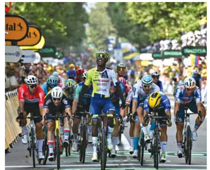
Intermarche - Wanty team's Eritrean rider Biniam Girmay cycles to the finish line ahead of second-placed Movistar Team's Colombian rider Fernando Gaviria (second right) and third-placed Lotto Dstny team's Belgian rider Arnaud De Lie (second left) to win the 3rd stage of the 111th edition of the Tour de France cycling race, 230.5km between Piacenza and Turin, in Italy, yesterday.