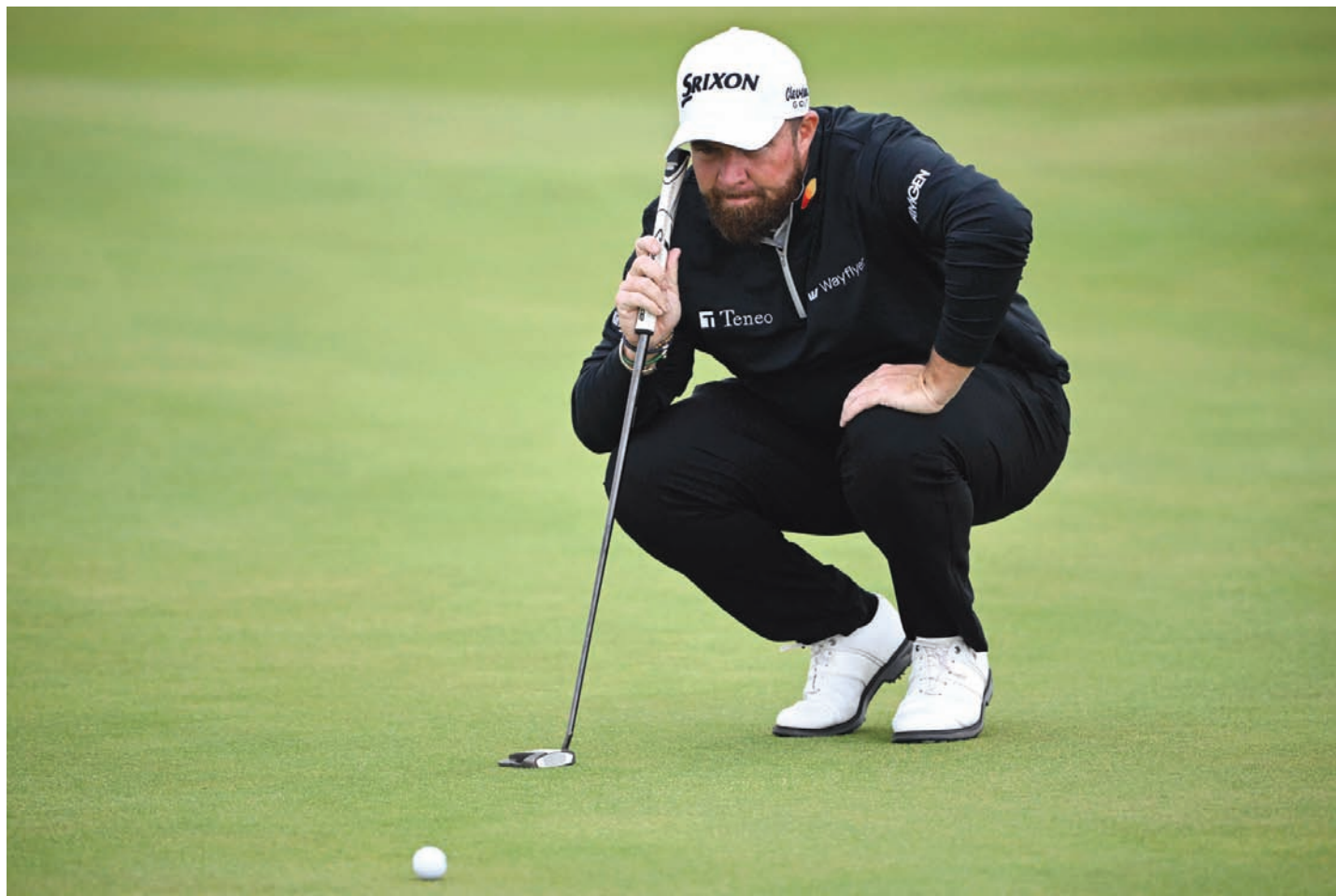
Ireland's Shane Lowry lines up his putt on the 3rd green during his second round of the 152nd British Open Golf Championship at Royal Troon on the south west coast of Scotland yesterday.

His only moment of concern was a double-bogey on the 11th but he quickly shrugged that off