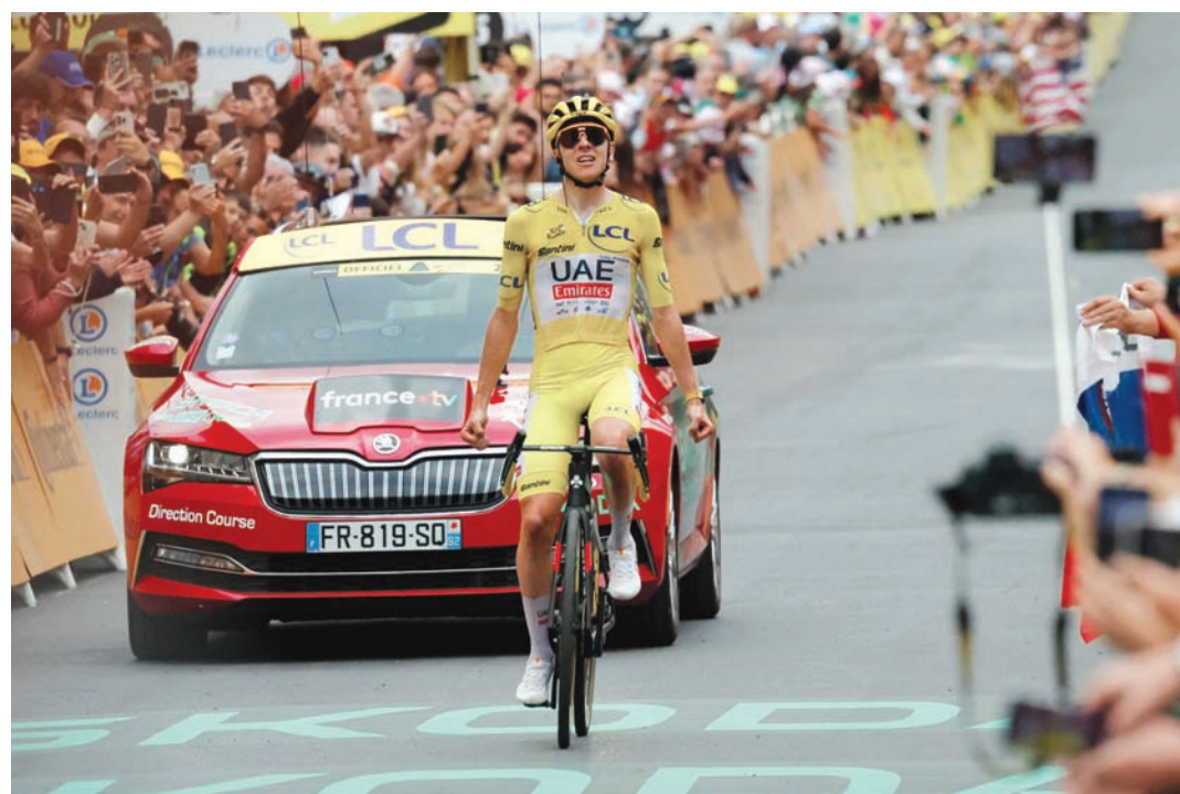
UAE Team Emirates' Tadej Pogacar celebrates winning stage 19 of the 111th Tour de France yesterday.

"I was a little bit empty in the last 2km. When I caught Carapaz