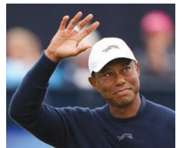
Tiger Woods acknowledges the crowd after finishing his second round yesterday.

Several players made use of the relatively benign early conditions including American Billy Horschel and South Africa's Dean Burmester after rounds of 68 and