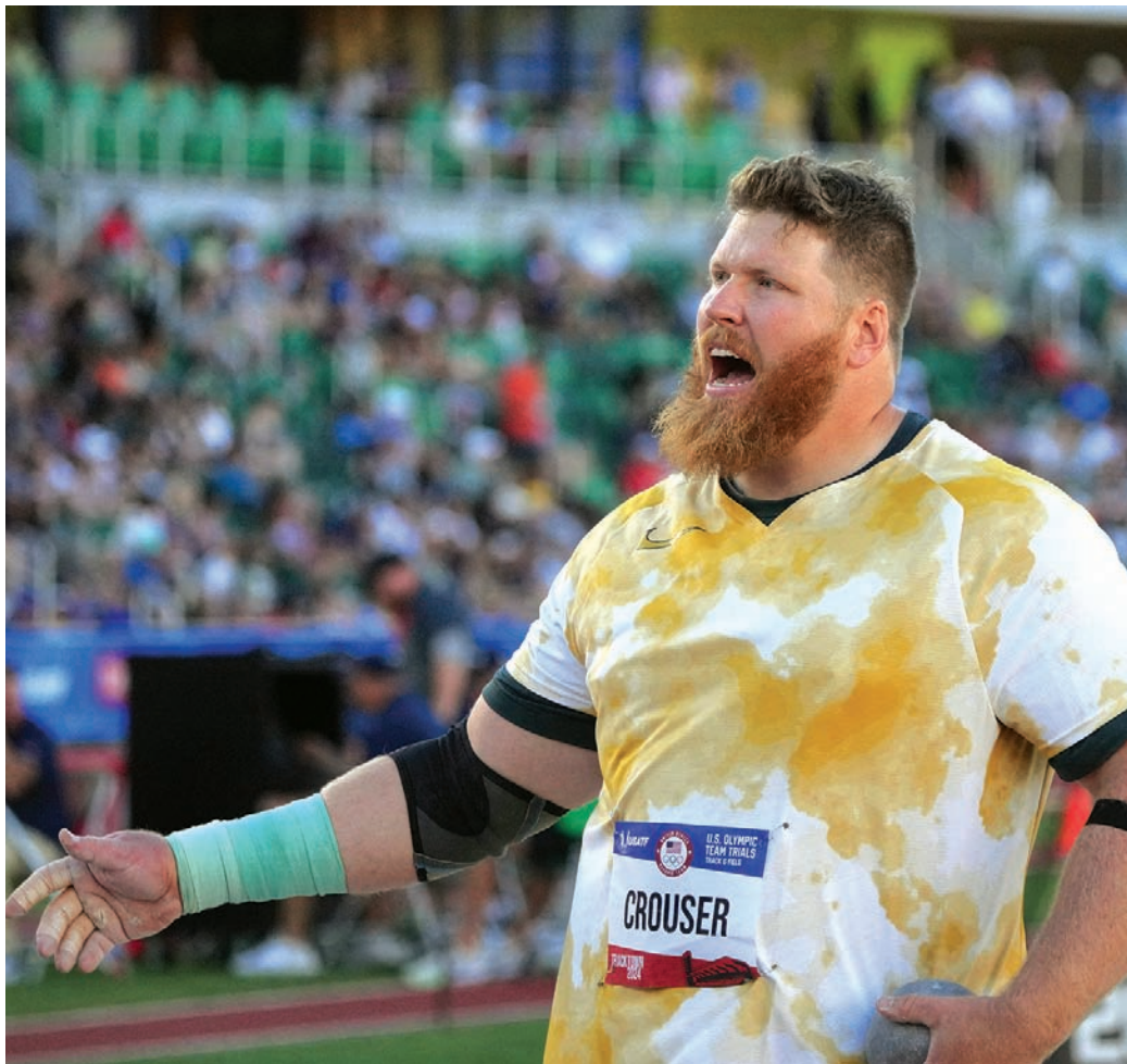
Ryan Crouser wins the shot put at 74-11 1/4 (22.84m) during the US Olympic Team Trials at Hayward Field.

Crouser, who comes from a family of throwers, added: "Measuring my progress coming