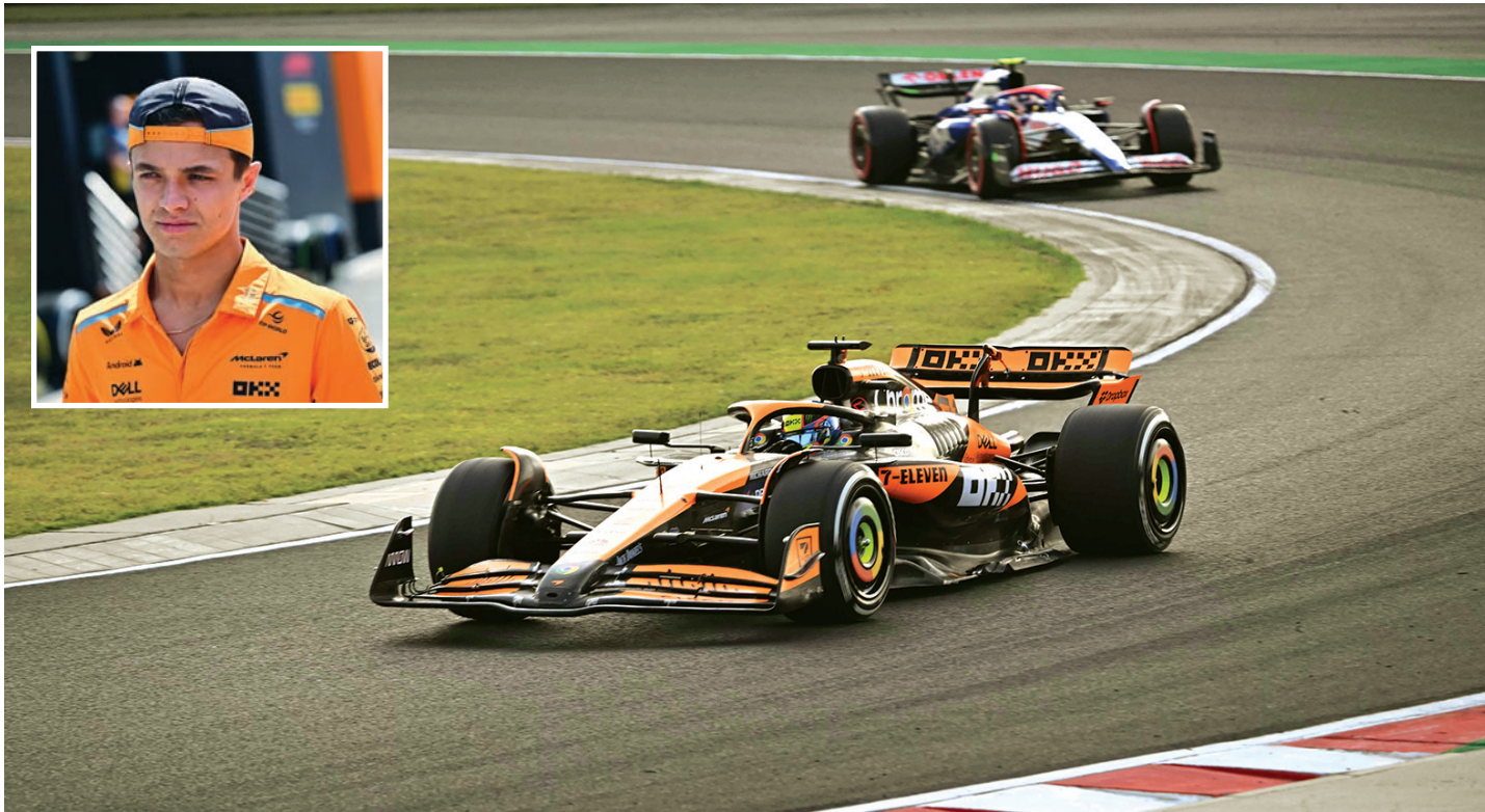
McLaren's Lando Norris (also inset) drives during the second practice session at the Hungaroring race track in Mogyorod near Budapest yesterday, ahead of the Formula One Hungarian Grand Prix.

'I THINK THIS WAS SERGIO'S BEST FRIDAY PERFORMANCE SINCE CHINA'