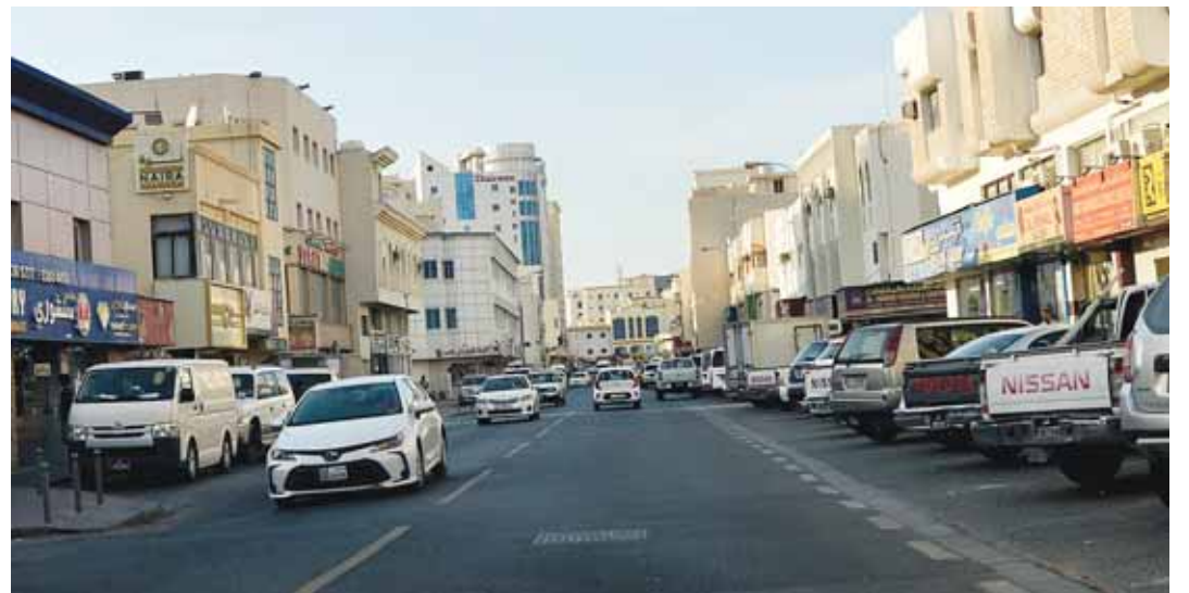
Najma Street mirrors other similar thoroughfares in and around Doha's bustling communities.

cap the working day with conversations over "Sulaimani" (black tea), coffee, or karak. These nightly get-togethers provide brisk business for the many cafeterias and small restaurants that populate the street. The colourful signage of business establishments that brightens Najma in the evenings gives its unique character and appeal to many customers – DIY enthusiasts and professionals alike – that troop the hardware stores, bicycle shops, building materials and contracting shops, and other small service-oriented enterprises. Looking for a mechanic for quick fixes and minor tune-ups?