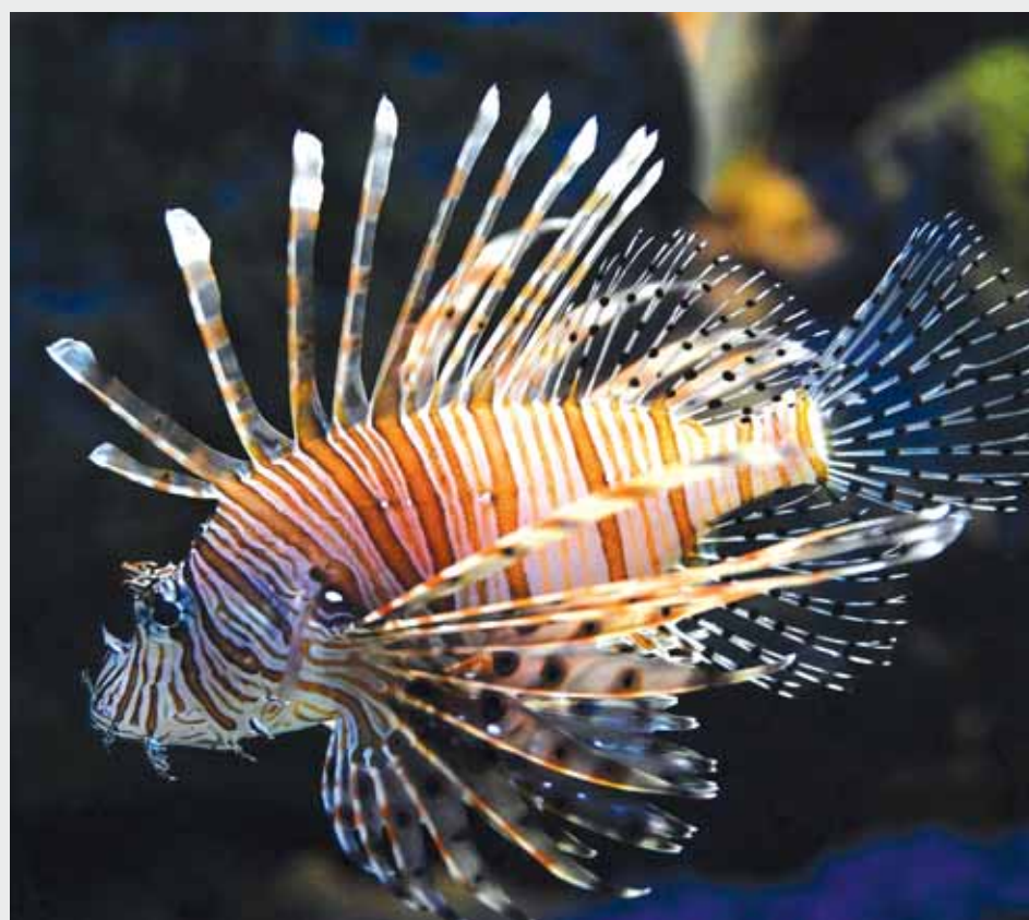
A Lionfish swims in an aquarium at the Scientific Center of Kuwait, in Kuwait City, yesterday.