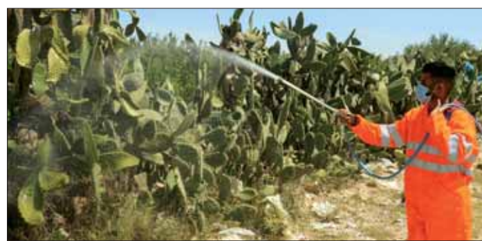
A man sprays prickly pear cacti infected by the cochineal insect, in the suburbs of Kairouan in northern Tunisia.

In 2016, the Moroccan government issued an "emergency plan" to combat cochineal infestation by