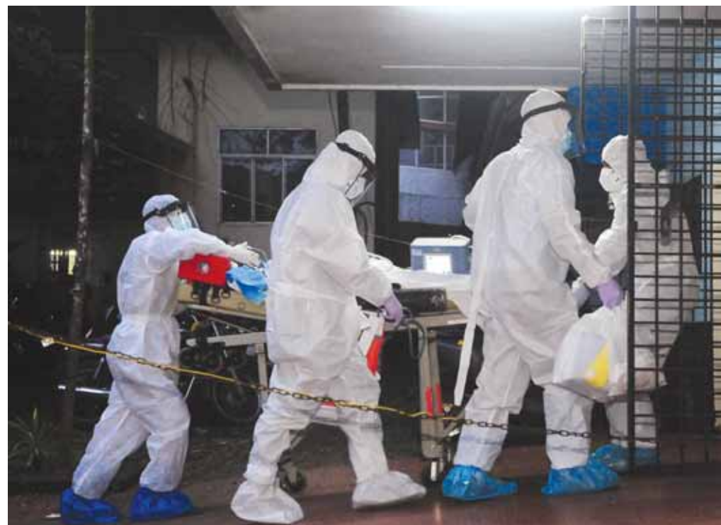
A patient, who according to medics is suffering from Nipah infection, is shifted to an ICU of Nipah isolation ward in Kozhikode Medical College in Kozhikode, Kerala, yesterday.

tended the curfew indefinitely, according to local media. Restrictions were eased for two hours yesterday to allow people to shop for supplies. Tanvir Hasan, a grocer in Dhaka, said: "As curfew eased, people swarmed in like bees. We just had couple of very busy hours." The clashes have injured thousands across the country in recent days, as police used tear gas, rubber bullets and sound grenades to disperse protesters throwing bricks and setting fire to vehicles. Experts attribute the unrest to stagnant job growth in the private sector and high youth unemployment, making public sector jobs with regular wage hikes very attractive among the group who make up nearly a fifth of the population. Bangladesh also faces economic difficulties and secured a $4.7bn bailout from the International Monetary Fund in January last year after struggling to pay for energy imports, which cut into its dollar reserves and fanned inflation. Hasina, 76, who won power for a fourth straight term in January, has been credited with turning around Bangladesh's economy and its garment industry. But critics also accuse her of authoritarianism, human rights violations, crackdowns on free speech and suppression of dissent, charges her party denies.