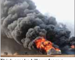
Thick smoke billows from a raging fire at oil storage tanks a day after Israeli strikes on the port of Yemen's Houthi-held city of Hodeidah yesterday.

Houthi military spokesperson Yahya Saree said earlier that the rebels' "response to the Israeli