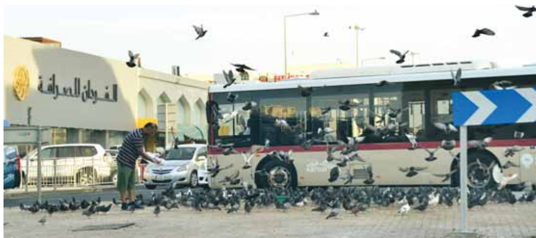
A man feeds a flock of pigeons along Najma Street.

Cinema and Film Distribution Company. The plans include Qatar's first-of-its-kind Cinematique Museum and efforts "to restore its past grandeur while integrating contemporary advancements and technology." Not only is the revival and refurbishment of Gulf Cinema seen as a game-changer, but local business owners in the area are anticipating new and larger crowds, boosting business and adding a unique cultural dimension to Najma's offerings.