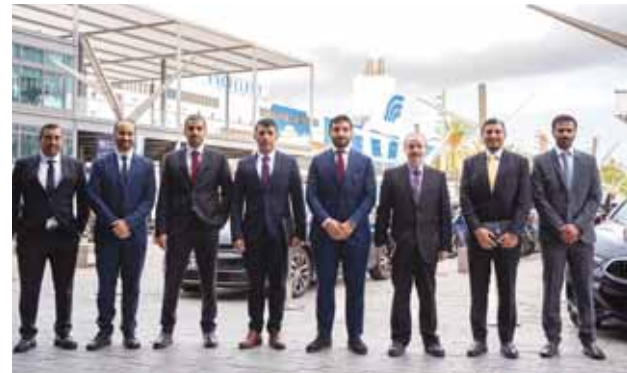
Representatives from Qatar Tourism, the Permanent Committee for the Management of Maritime Ports, and the General Authority of Customs took part in the field visit.

During the 2023-2024 season alone, Doha Port welcomed 73 ships.