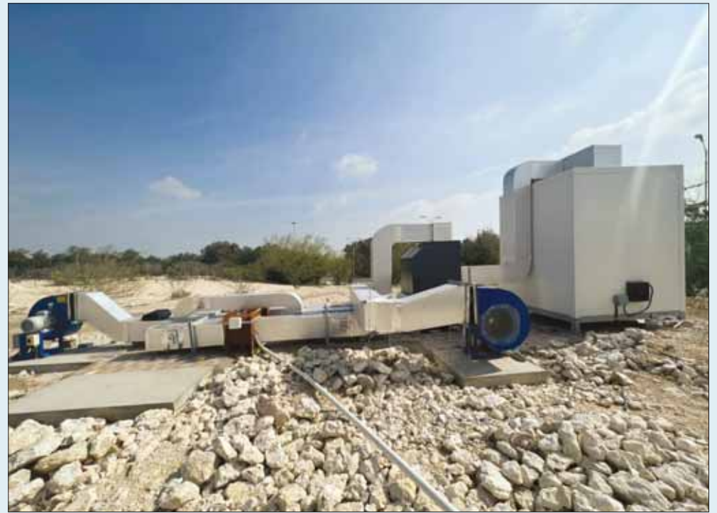
The model of sustainable cooling system for poultry houses.