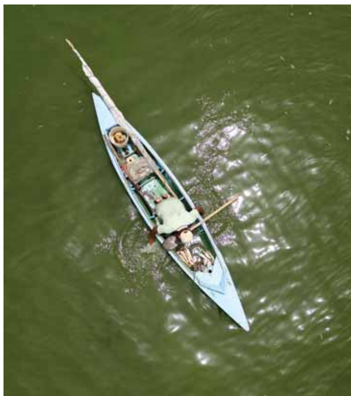
An aerial view of a fisherman sailing on Lake Maracaibo, in Maracaibo, Zulia State, Venezuela.

When AFP visited Puyuyo, only one table of the cafe was occupied - by crabbers playing dominoes