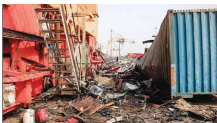
Debris litters a loading dock a day after Israeli strikes on the port of Yemen's Houthi-held city of Hodeidah yesterday.

90 ships since November which they say is to signal their solidarity with Palestinians in the Gaza war.