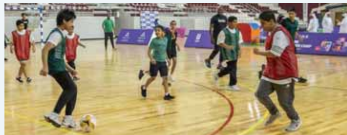
The Aspire Summer Camp's diverse programmes include sports, artistic and cultural activities, allowing young participants to discover their talents.