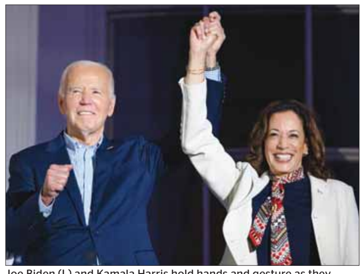
Joe Biden (L) and Kamala Harris hold hands and gesture as they watch the Independence Day fireworks display from the White House on July 4, 2024.

Lawmakers said they feared he could cost them not only the White House but also the chance