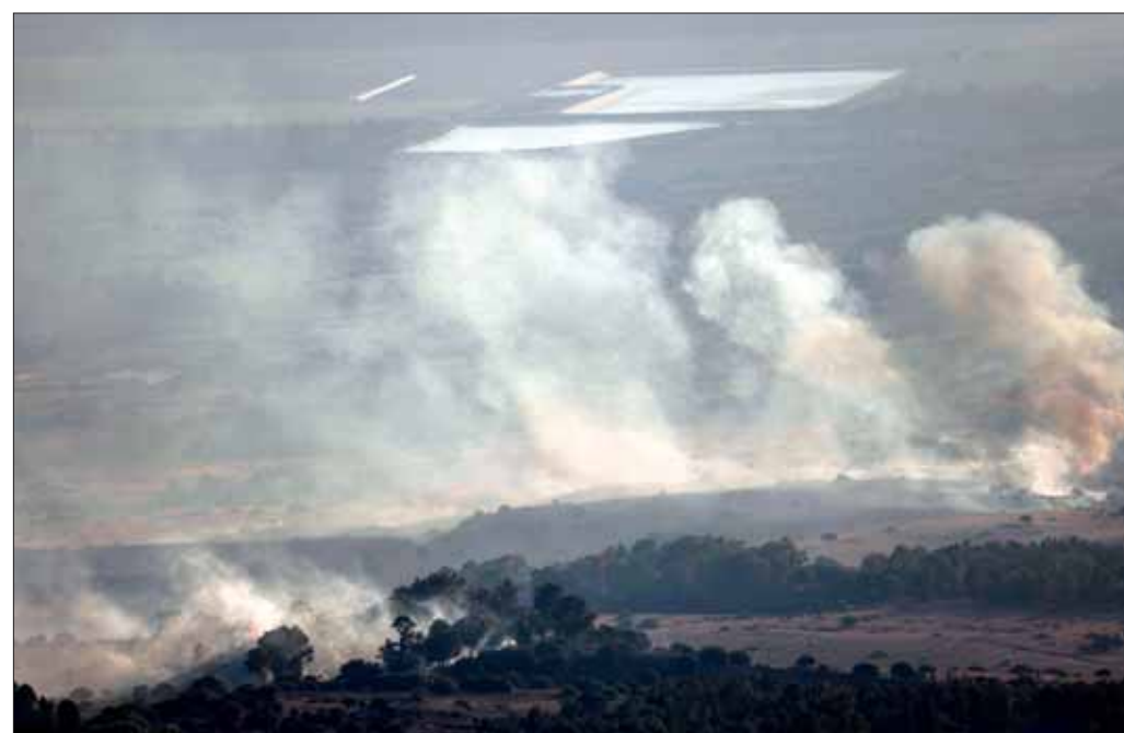
Smoke billows after a hit from a rocket fired from southern Lebanon over the Upper Galilee region in northern Israel, yesterday.