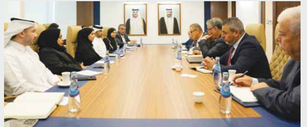
Palestinian Minister of State for Relief Affairs, Dr Basil Nasser, and Palestinian Minister of Planning and International Co-operation, Wael Zakout, met with representatives and officials of Qatar Fund For Development (QFFD), alongside its partners from Qatar Red Crescent Society, Qatar Charity and Education Above All Foundation. The meeting discussed ways to provide support and aid to the brotherly Palestinian people in Gaza. (QNA)