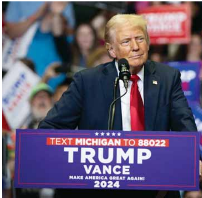
Trump at his campaign rally at the Van Andel Arena in Grand Rapids, Michigan.

through that again. It was so horrible," Trump said.