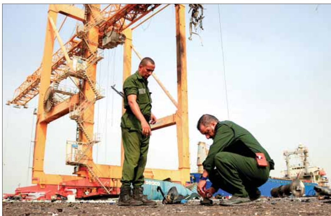
Members of security forces inspect the debris littering a loading dock a day after Israeli strikes on the port of Yemen's Houthi-held city of Hodeidah, yesterday.