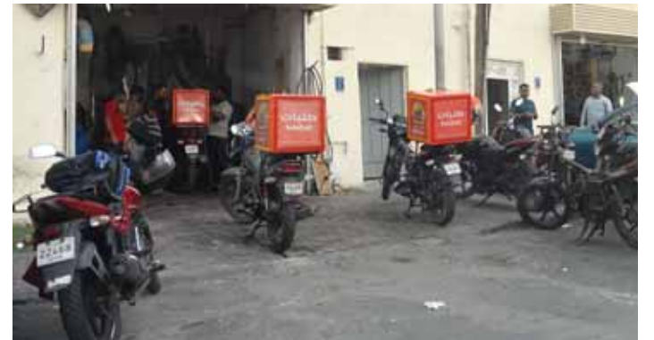
Repair shops come in handy for quick fixes.

Najma has quite a number of auto repair shops. Not even a stone's throw away are electronic repair and computer shops that provide different solutions – from malfunctioning gadgets, and broken air-conditioning (A/C) units, to maintenance and overhaul of old washing machines. As the summer season progresses, the hot weather and sweltering heat puts a lot of stress on residential A/C units. Najma's A/C technicians are dispatched even at a moment's notice to ensure that one's daily comforts are swiftly restored. Barber shops, as well as currency exchange houses and pharmacies, are often busy with clients. There are also a few shops that offer specialised services, such as the replacement of house or vehicle keys, photocopying and printing, and studio photography. Grocery stores of varied sizes, a handful of candy shops, and fruit and vegetable stores also provide the necessities for everyone, thus