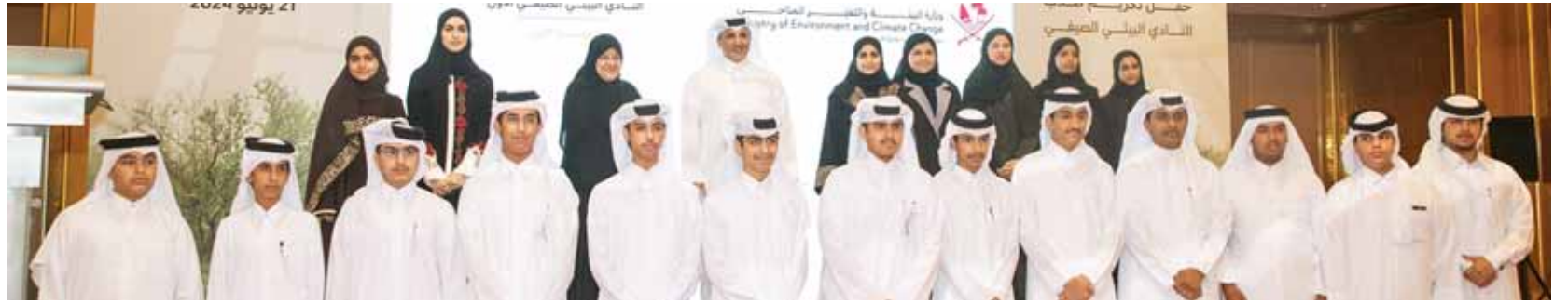
Snapshots from the ceremony.