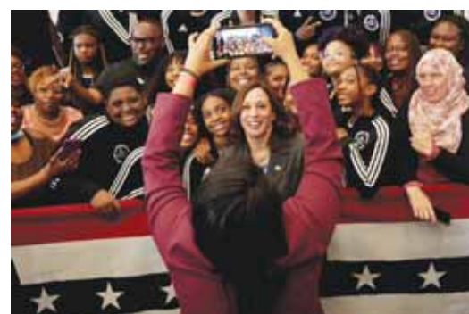
This picture taken in 2021 shows Vice-President Kamala Harris at a vaccine mobilisation event at Detroit's TCF centre.

The Trump campaign had already begun discussions about how it would redeploy campaign resources for the possibility of Biden's dropping out, a source