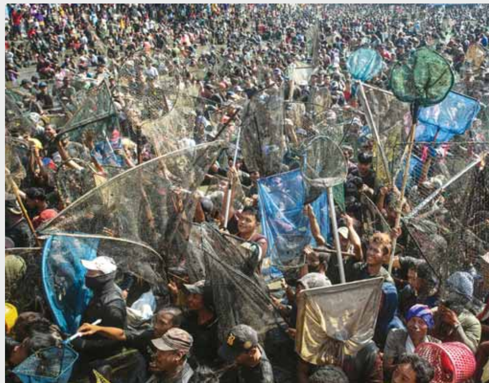
People try to catch about two tonnes of fish released by the city during an annual event to thank for this year's fishing harvest at Gemblegan Reservoir in Klaten, central Java, Indonesia, yesterday.