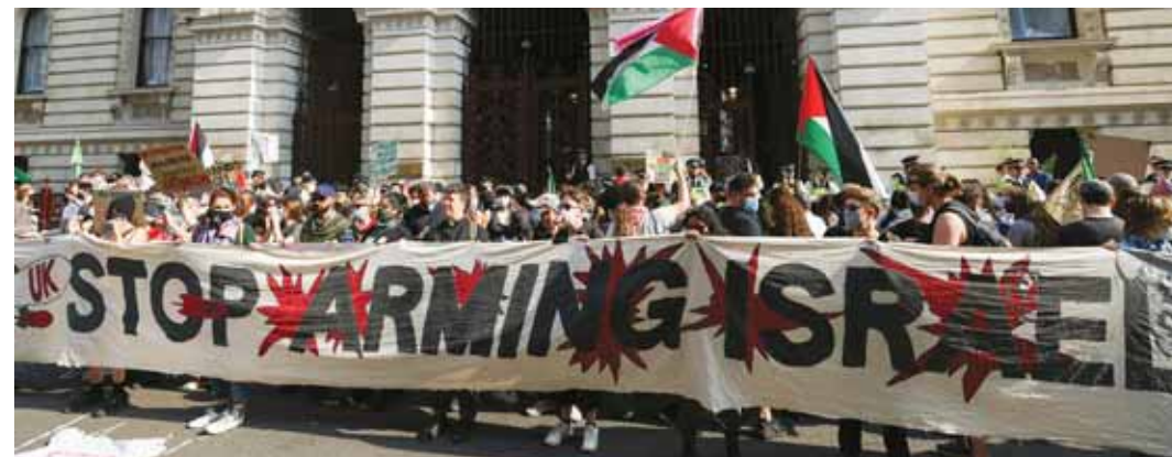
Pro-Palestinian demonstrators from 'Workers for a Free Palestine' gather outside the Foreign, Commonwealth and Development Office, in a protest against arms exports to Israel, in London, Britain, yesterday.

Labour was elected with a huge majority earlier this month, but lost some seats to pro-Gaza candidates.