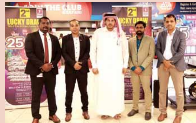
Safari announces winners of second draw.