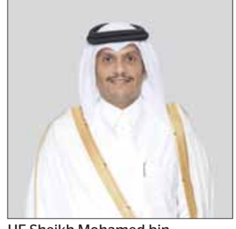
HE Sheikh Mohamed bin Abdulrahman bin Jassim al-Thani

During the call, they discussed bilateral co-operation ties be-