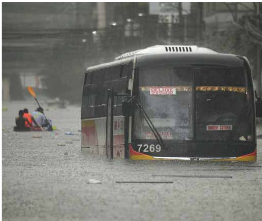
People paddle a boat past a half-submerged passenger bus along a flooded street in Manila yesterday.

The Philippines has reached an agreement with Beijing on its resupply missions to soldiers aboard a grounded naval vessel in the South China Sea, but will not submit to inspections from China, a top security official said. The Philippines and China, which have sparred repeatedly at sea this past year, have reached a "provisional arrangement" on resupply missions to the ship at the Second Thomas Shoal, as both sides agreed to ease tensions. Philippine national security adviser Eduardo Ano said, however, the arrangement does not include agreeing to Chinese vessels conducting "on-site" inspections. China has long been irked by the Philippine missions to its small contingent of troops aboard the rusty ship Sierra Madre, which was intentionally run aground in 1999 to try to reinforce Manila's territorial claim to the shoal. "There's no such kind of on-site inspection. What the two sides agreed are really a common understanding," Ano told a forum.