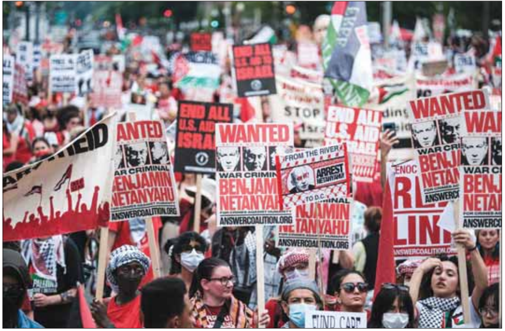
Demonstrators protest Israeli Prime Minister Benjamin Netanyahu's visit to the United States on Capitol Hill in Washington, DC, US, amid Israel's ongoing war against Hamas in Gaza. Page 11