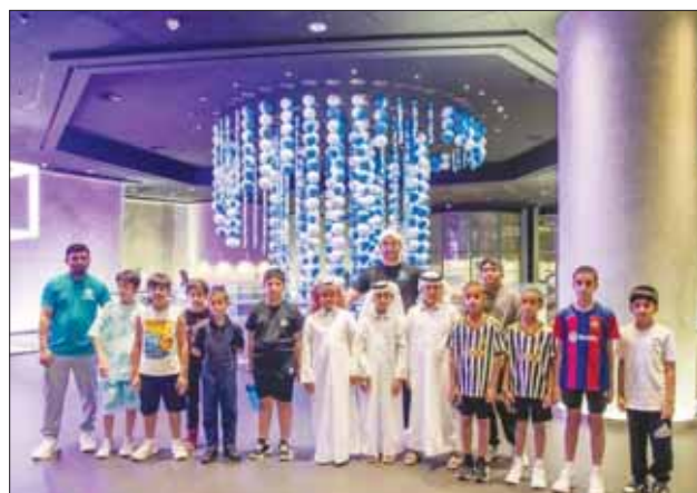
Aspire Zone Foundation (AZF) organised the first of a series of visits to the 3-2-1 Qatar Olympic and Sports Museum (QOSM). The children of Aspire Summer Camp learned about the different sec-