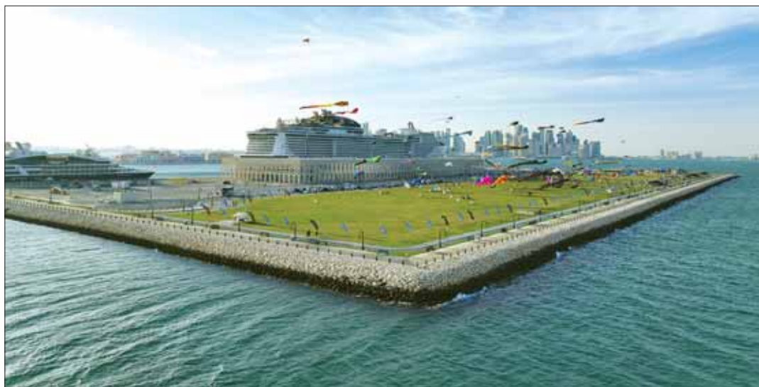
Old Doha Port offers a strategic and picturesque setting for visitors.