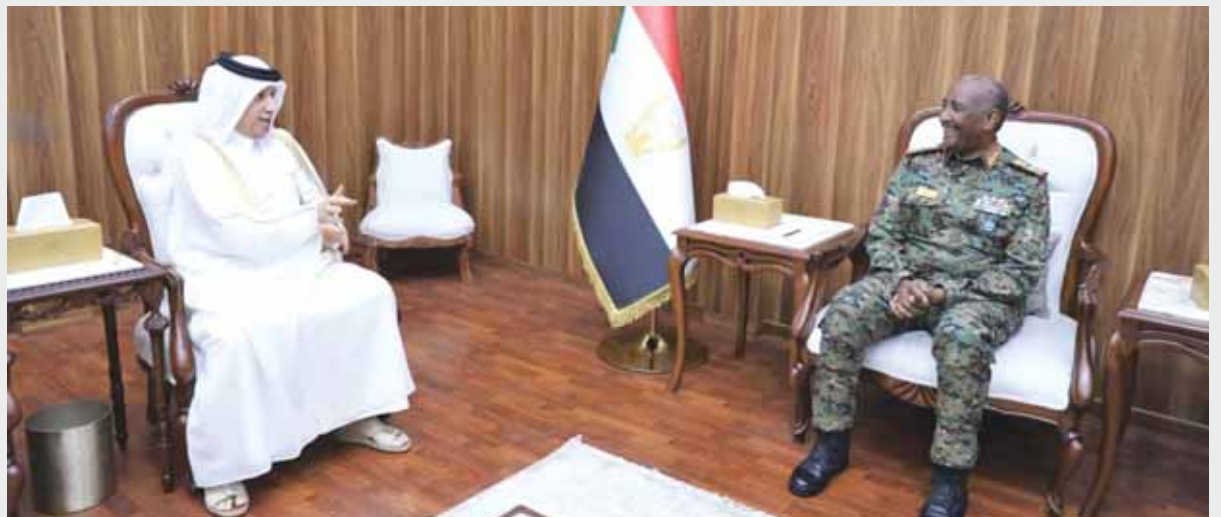
Chairman of the Transitional Sovereignty Council of Sudan Lieutenant General Abdel Fattah al-Burhan met yesterday in Port Sudan with HE the Minister of State for Foreign Affairs Sultan bin Saad al-Muraikhi. Discussions during the meeting dealt with bilateral relations and means to support and enhance them. (QNA)