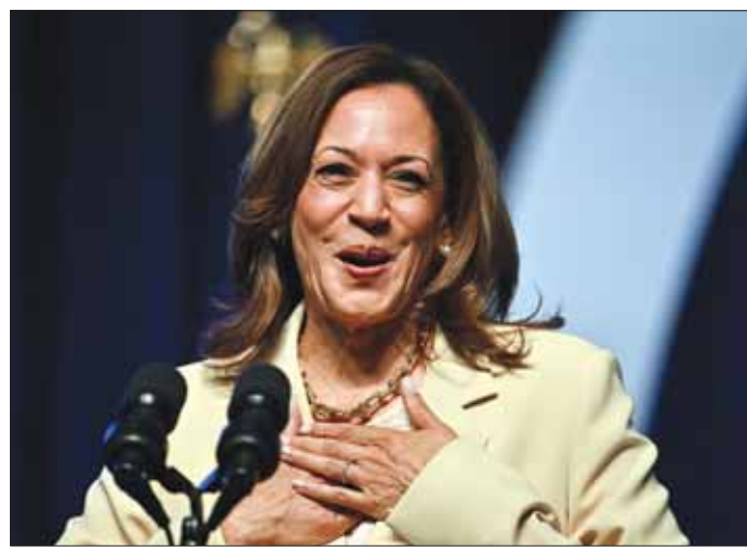
US Vice-President Kamala Harris during the Zeta Phi Beta Sorority Inc's Grand Boule event in Indianapolis, Indiana, yesterday.

The Trump campaign has insisted it is prepared for Harris' candidacy, arguing she serves as a proxy for Biden on the economic and immigration policies that contributed to his sinking popularity with voters. Harris spoke at an event in Indianapolis hosted by the Zeta Phi Beta Sorority, which was founded at Howard University, the historically Black college she attended. She hopes to tap sororities' multi-generational network of Black women — who