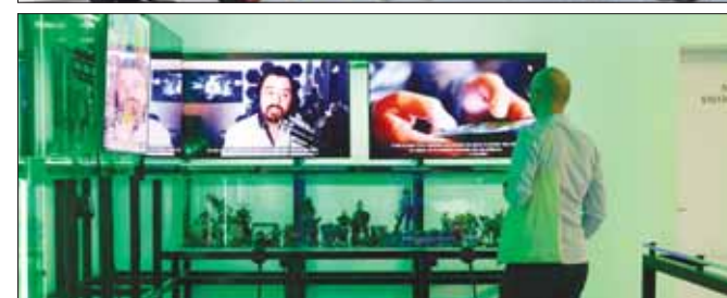
The exhibition takes a sociological look at competitive gaming.