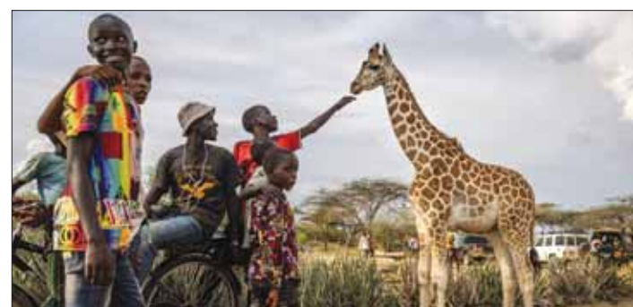
A boy touches a baby giraffe roaming at the community celebrations to honour the arrival of several wild giraffes as part of a wildlife translocation exercise in Ruko Conservancy.

While the East African nation is renowned for its spectacular wildlife, its northern counties such as Baringo are more often in the news for banditry and ethnic clashes.