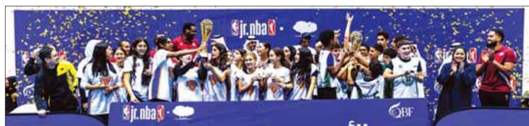
The winning teams with the trophies.

Hundreds of young basketball players have developed both their sporting skills and their life skills during the inaugural Jr NBA League in Qatar and the NBA's Her Time to Play programme at Qatar Foundation (QF)'s Education City.