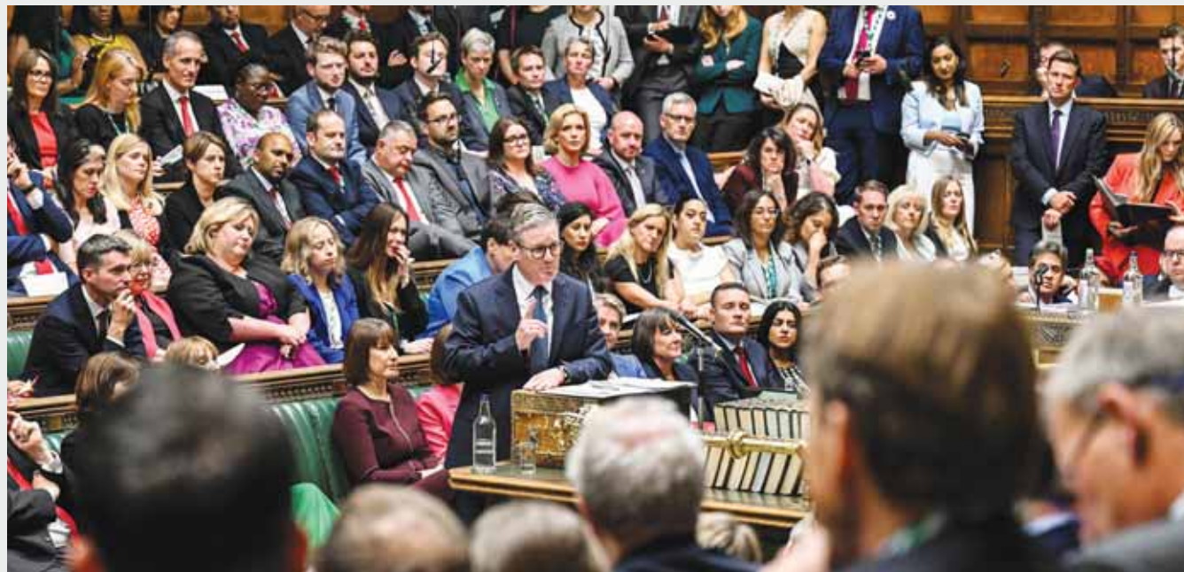
Britain's Prime Minister Keir Starmer speaks during Prime Minister's Questions at the House of Commons in London, Britain, yesterday. Starmer's first experience of being on the receiving end of prime minister's questions passed without the typical barrage of hostile questioning yesterday, but he faced pressure over his new government's approach to child poverty.