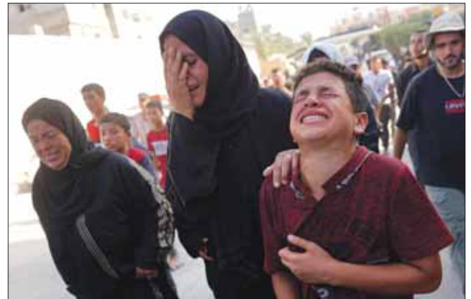
A distressed Palestinian woman and boy arrive at the Nasser hospital after Israeli forces targeted the northeastern district of Khan Younis, in the southern Gaza Strip, yesterday.

Local health authorities confirmed that the Palestinian death toll from the Israeli onslaught since October 7 has risen to 39,090 reported fatalities, with an additional 90,147 individuals sustain-