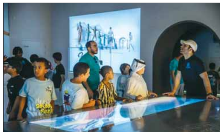
tions of the museum in a unique educational, cultural and entertainment experience. They also participated in fun sports activities that enhanced their skills and team spirit. Aspire Summer Camp