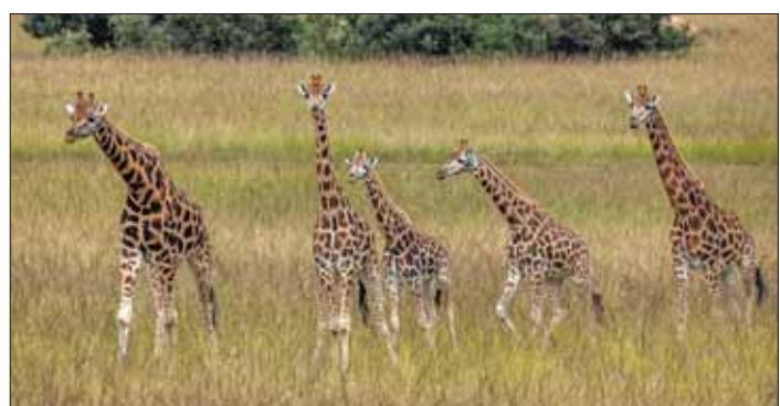
A herd of giraffes moves together during a translocation exercise for wild giraffes in a farm near Eldoret.

"Back 20 years before, Pokot and Ilchamus had a conflict that erupted