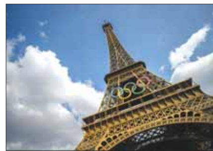
Olympic rings on Eiffel Tower ahead of the Paris 2024 Olympic Games in Paris.

In fact, France has already had a boom in messaging app and social media-driven drug deliveries since pandemic lockdowns pushed the trade off the street and onto