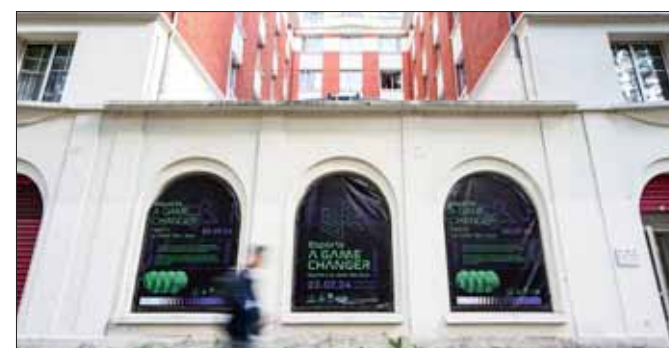
Esports | A Game Changer Exhibition in Paris.