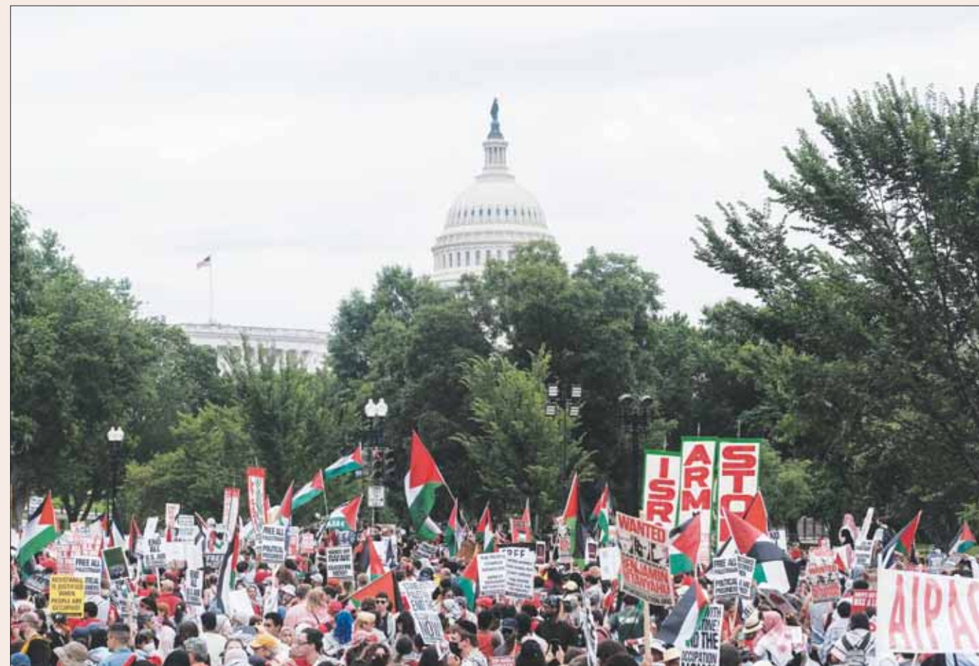
Protesters demonstrate on Capitol Hill in Washington, DC yesterday.

Thousands of protesters opposed to Israel's war in Gaza, some carrying Palestinian flags, gathered near the US Capitol yesterday ahead of a speech by Israeli Prime Minister Benjamin Netanyahu to members of Congress.