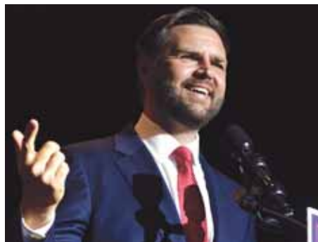
JD VANCE: In a 2022 podcast, Republican candidate Donald Trump's running mate said: "I really don't care what happens to Ukraine one way or another".

The Prussian military theorist Carl von Clausewitz famously taught us that war is a contest of political wills. Armies and battalions certainly count, but they often are not what matters in the end. The outcome in Afghanistan was not decided by which side had more artillery ammunition. Again, if you believe that firepower is everything, you must also believe that Taiwan should just go ahead and surrender.