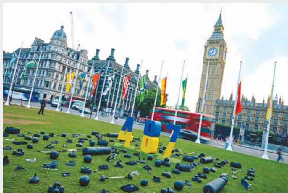
Sporting equipment representing the disciplines of some of the 487 fallen Ukrainian athletes, are pictured in Parliament Square, opposite the Houses of Parliament in central London yesterday, at an installation paying tribute to the Ukrainian athletes who have lost their lives due to the 2022 invasion of Ukraine by Russia. Ukraine is set to have only 140 athletes competing at this year's Olympic Games in Paris, the smallest representation ever in Ukraine's Olympic history.