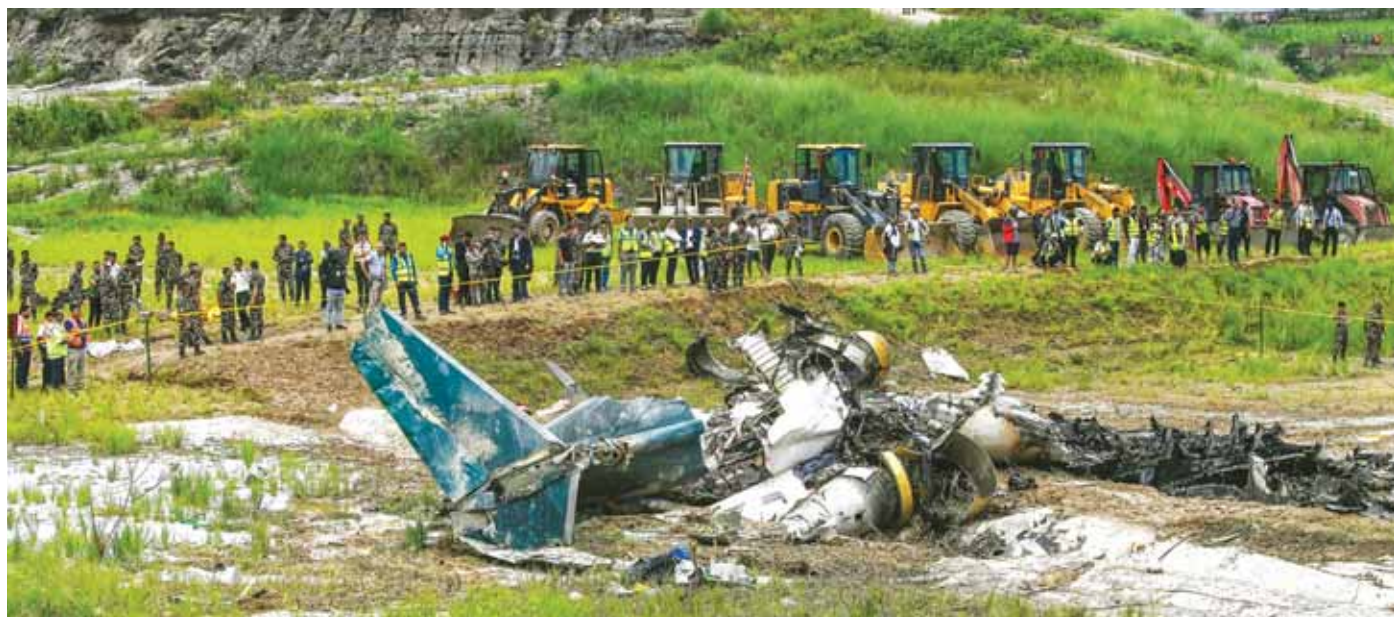
Army personnel and other officials stand around the debris of a Saurya Airlines' plane after it crashed during takeoff at the Tribhuvan International Airport in Kathmandu yesterday.