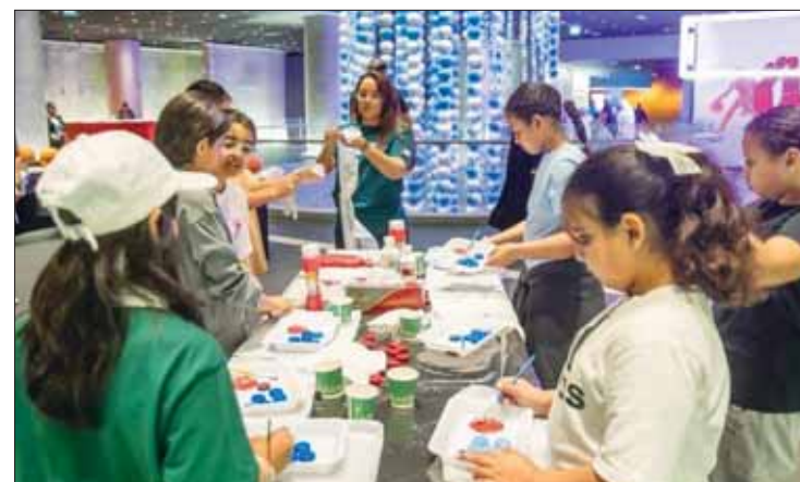
activities will continue until August 8 and include a series of field visits to various destinations in the country. This edition of the camp comes in partnership with