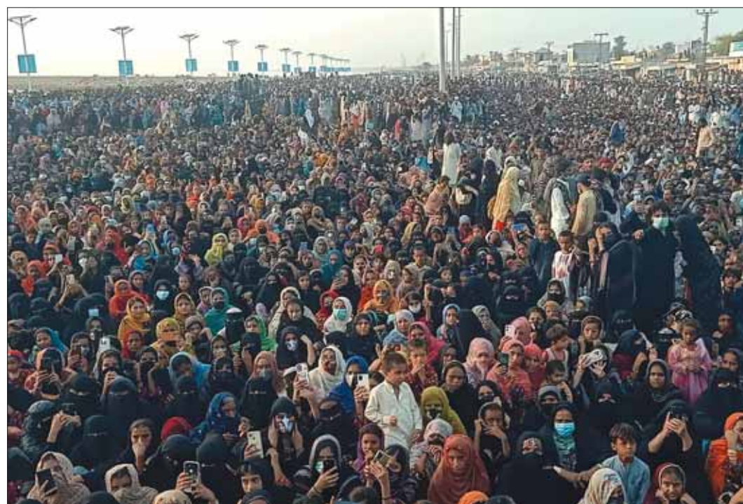
People from the Baloch community take part in a demonstration demanding greater rights in Gwadar of Pakistan's Balochistan province on Sunday.

won the most votes in May's regional election but fell short of a majority. The Socialists, led locally by Salvador Illa, got 42 seats in Catalonia's 135-seat chamber. The party's usual coalition partner, the far-left Sumar alliance, won six, while the ERC had 20. Parties wanting to form a government need 68 seats in a first round of voting in the chamber and a simple majority in the second.