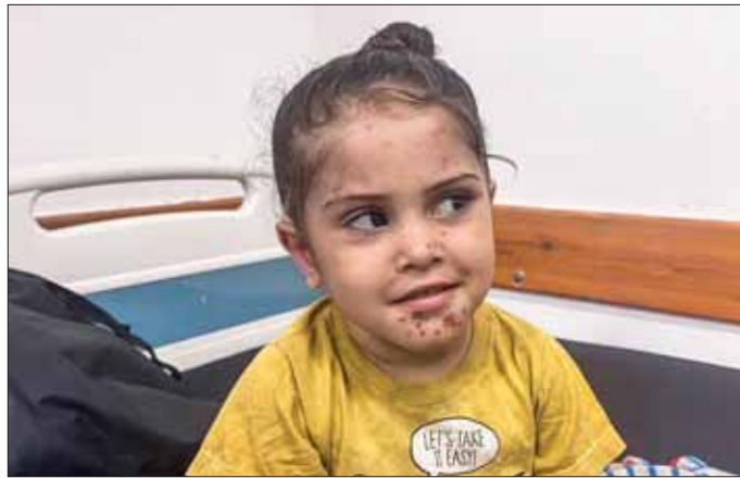
A Palestinian girl with a skin disease looks on as she receives treatment at Nasser hospital, amid the Israel-Hamas conflict, in Khan Younis in the southern Gaza Strip, yesterday.

Hundreds of thousands of people have converged on Deir Al-Balah, a small city in the centre of the enclave that is the only major area yet to be stormed, many