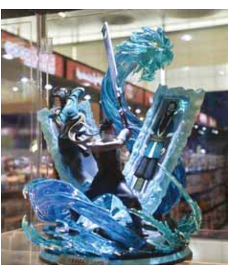
Zabuzaba and Haku from Naruto.