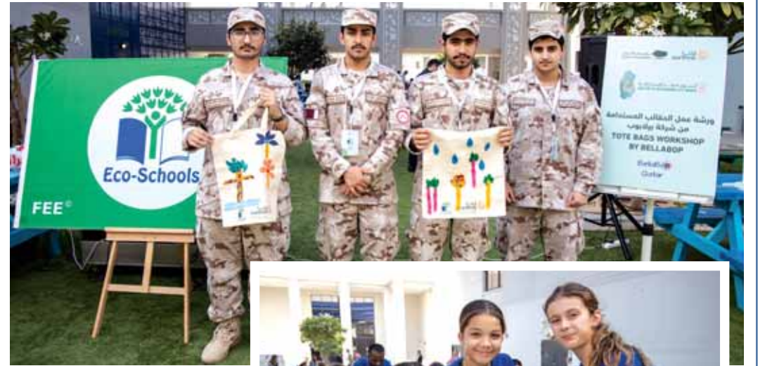
Boys who took the role of eco-entrepreneurs and created bags from wasted fabric.

Right: Girls taking part in one of the activities of the Eco-School programme.