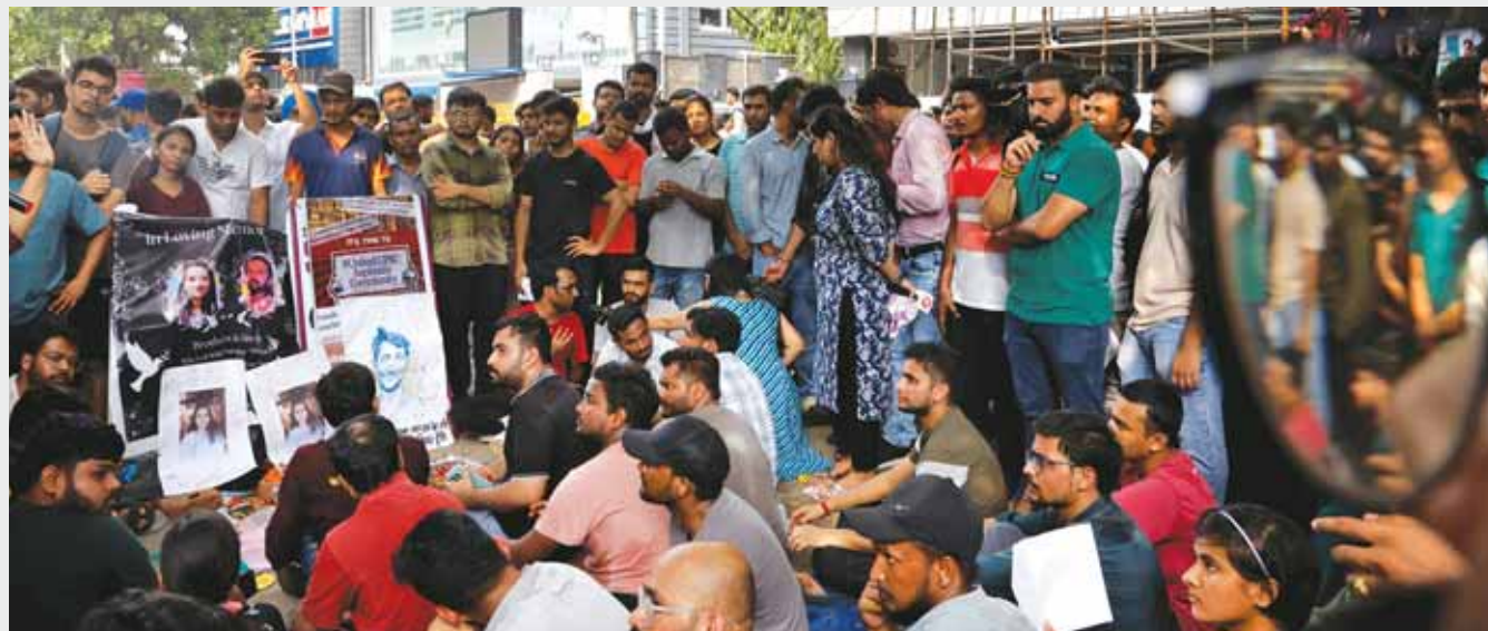
Demonstrators attend a protest yesterday outside a coaching centre after the death of three students, who according to local media reports died after a basement of the coaching centre got flooded during rains on Saturday, in New Delhi, India.