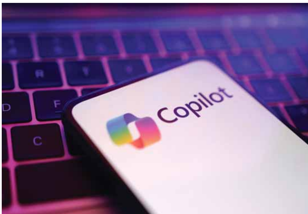
Copilot logo is seen in this illustration.

Microsoft's Spataro said the subscription price reflects the value Copilot brings customers and the cost of running the service. Asking the assistant to summarize a trove of financial documents requires much more computing horsepower than making edits to a Word document. "We feel like it's not just an incremental feature enhancement," he said, but "the culmination of a couple of decades of information technology innovations".