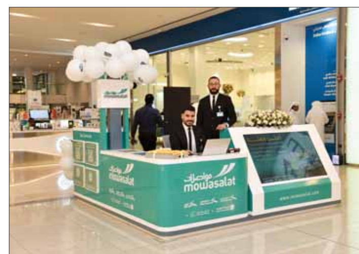
The new Karwa kiosk at Doha Festival City.

Mowasalat (Karwa) has opened its new permanent kiosk at Doha Festival City, offering a seamless experience of multiple services. The second such kiosk by Karwa provides guidance for Karwa Public Transport, Karwa Taxi, Doha Limousine, and Karwa Academy services.