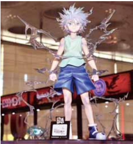
A figure of Killua from the manga and anime series Hunter x Hunter.