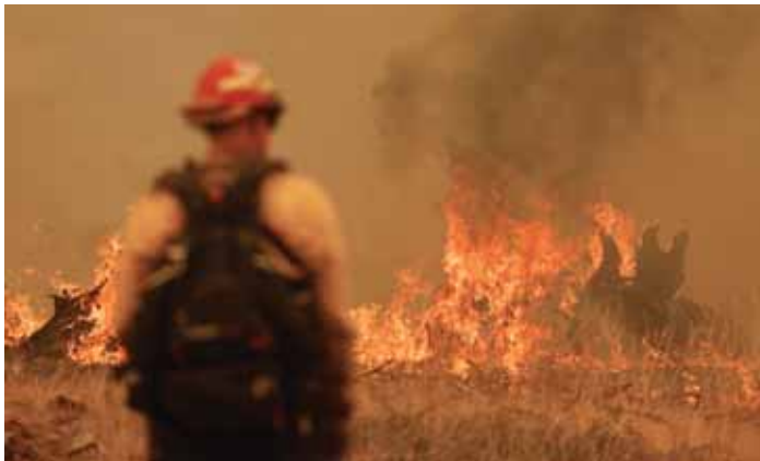
A firefighter monitors flames as the Park Fire burns near Paynes Creek, California.