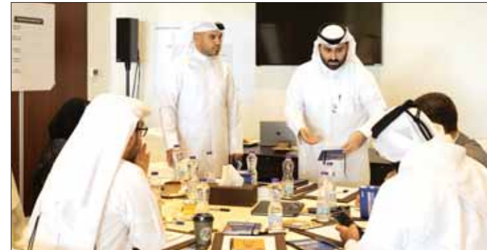
The programme aims to support the design of national and institutional RDI-related policies.

The Mumaken programme offers three specialised tracks namely: Track (A) is intellectual property and Technology Transfer. This