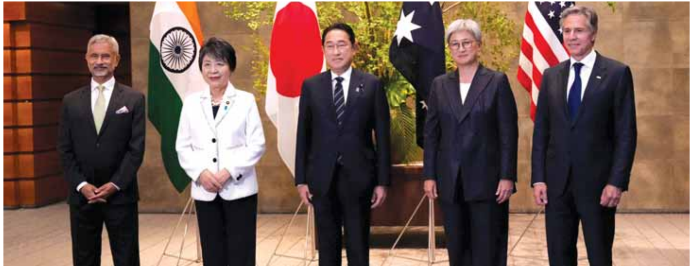
Japanese Prime Minister Fumio Kishida (centre) poses for photos with Australian Foreign Minister Penny Wong (second right), Indian Foreign Minister S Jaishankar (left), Japanese Foreign Minister Yoko Kamikawa (second left) and US Secretary of State Antony Blinken (right) at the prime minister's office after the four ministers participated in their Quad meeting in Tokyo yesterday.

Wickremesinghe also set the groundwork for Sri Lanka to start debt restructuring talks with its official creditors and bondholders.