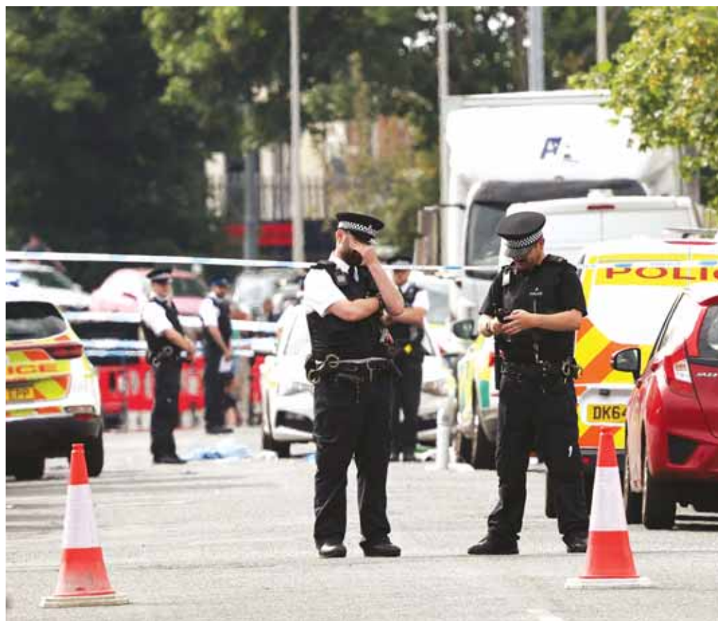
Police officers stand guard on Hart Street in Southport, northwest England, yesterday following a knife attack.

Britain's government yesterday said it was restarting talks aimed at securing free trade agreements with India and countries in the Gulf Co-operation Council. Prime Minister Keir Starmer, whose Labour Party returned to government after 14 years in opposition, has made economic growth the central mission of his government. Trade talks were paused during the election. "Restarting talks is the first step towards agreeing the high-quality trade deals the UK needs to give businesses access to international markets, boost jobs and deliver that growth," the government said. The trade department said the first round of negotiations under the new government were expected to take place in the autumn and would include fresh talks with Israel, South Korea, Switzerland and Türkiye. Britain already has FTAs with those four countries which were rolled over when it left the European Union in 2020, but had previously launched talks aimed at updating the agreements.