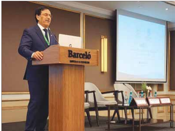
digital transformation and ways to overcome them.