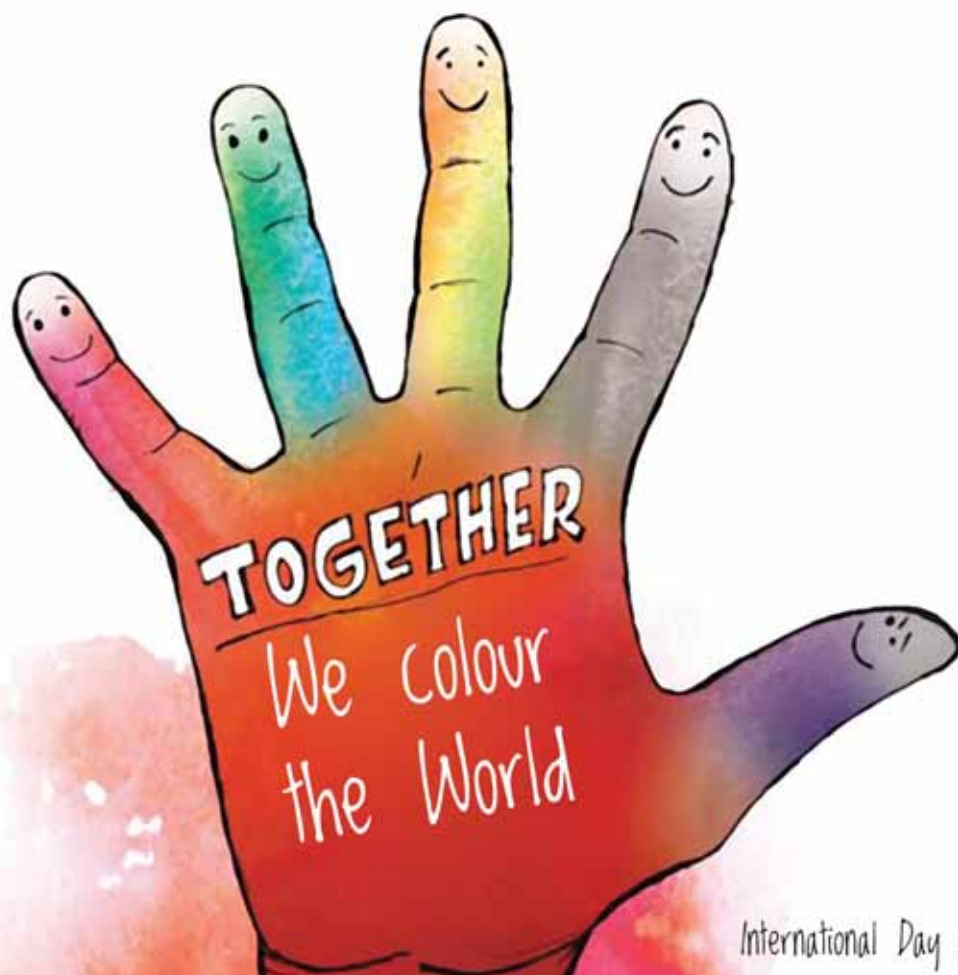
International Day of Friendship