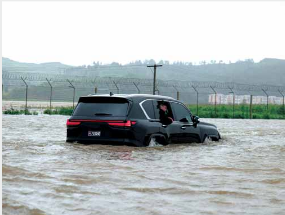
North Korea's leader Kim Jong-un looks out from a car as he inspects the area for flood damage after record-breaking heavy rains in the city of Sinuiju, North Pyongan province.