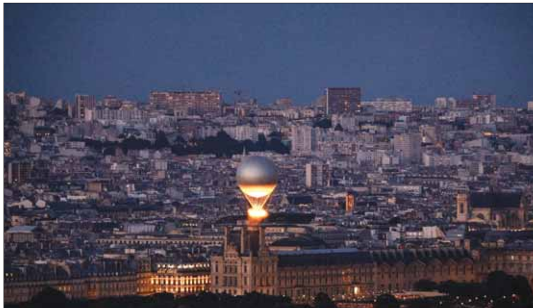
The Olympic cauldron is lit with the Olympic flame as it flies above Paris while attached to a balloon.