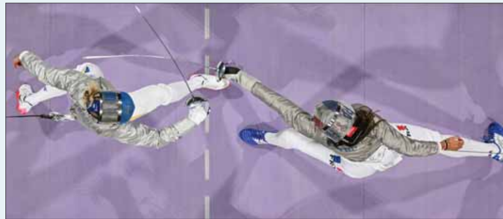
An overview shows Ukraine's Olga Kharlan (left) and France's Sara Balzer competing in the women's sabre individual semi-final bout during the Paris 2024 Olympic Games at the Grand Palais.

From literary heroes D'Artagnan to Cyrano de Bergerac, French authors have treated readers round the globe to the cut and thrust of swordplay — and centuries later it has lost nothing in its art in a spectacular fencing show at the Paris Games.