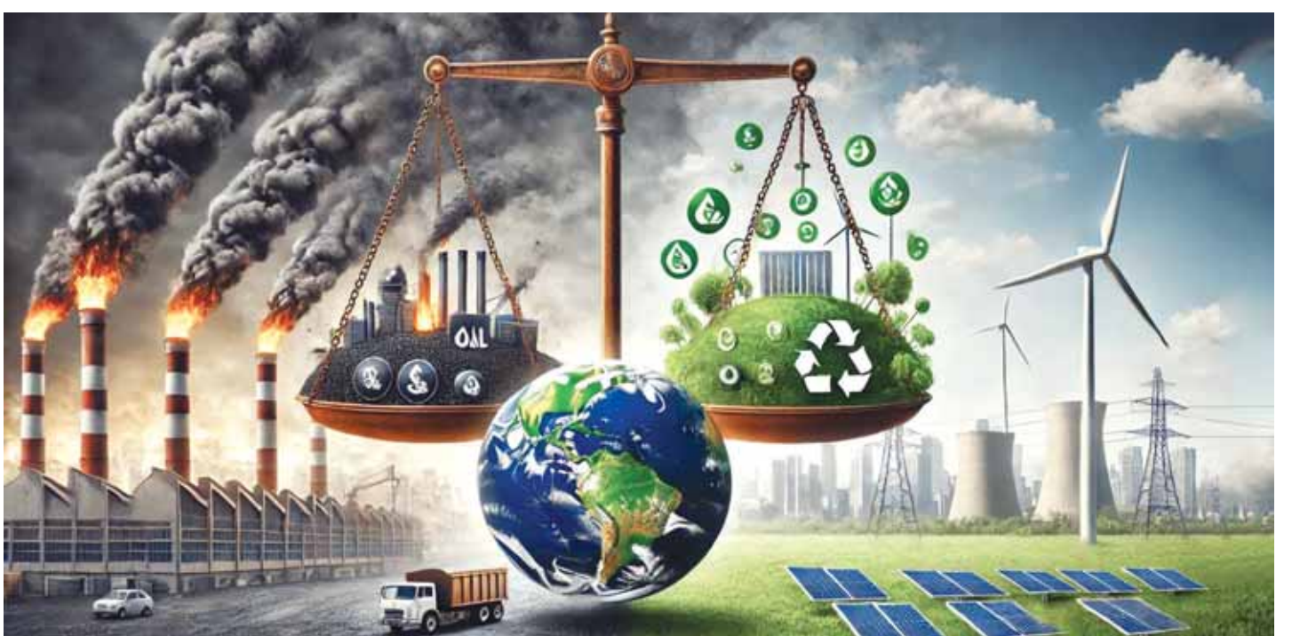
In a world where burning fossil fuels causes more damage than it adds in value to GDP, each tonne of coal or barrel of oil consumed ultimately destroys collective prosperity.

• Gernot Wagner is a climate economist at Columbia Business School and the author, most recently, of Geoengineering: The Gamble.