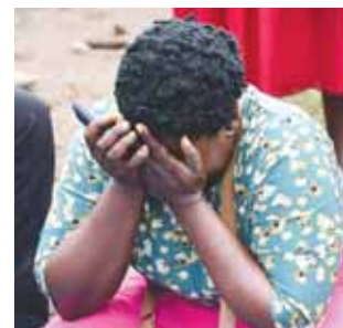
A woman reacts near the scene where a heap of garbage buried houses after a landslide in the Lusanja village, outside Kampala.