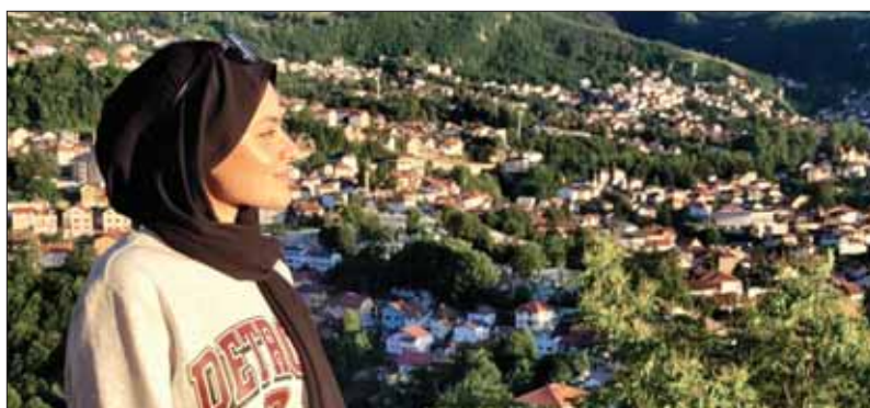
The students explored the pivotal role of social justice initiatives in post-conflict recovery.

As key food exporters, some of the Asean member states also play a vital role in supporting Qatar's food security efforts to achieve its National Vision 2030, Wong added.