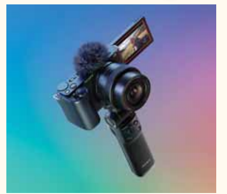
The new Sony Vlog Camera.

The upgraded large-capacity Z battery (NP-FZ100) allows continuous movie recording for up to 195 minutes per charge.