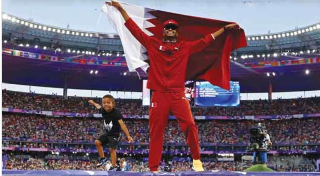
Men's high jump bronze medallist Mutaz Essa Barshim of Qatar celebrates at Paris 2024 Olympics, yesterday. Sport Page 1