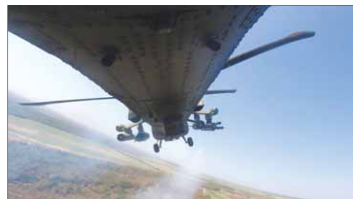
A Russian military helicopter fires following Ukraine's incursion into the border area in the Kursk region, Russia, in this still image from video released yesterday.

Russia's national anti-terrorism committee said late Friday it was starting "counter-terror operations in the Belgorod, Bryansk and Kursk regions...in order to ensure the safety of citizens and suppress the threat of terrorist acts being carried out by the enemy's sabotage groups."