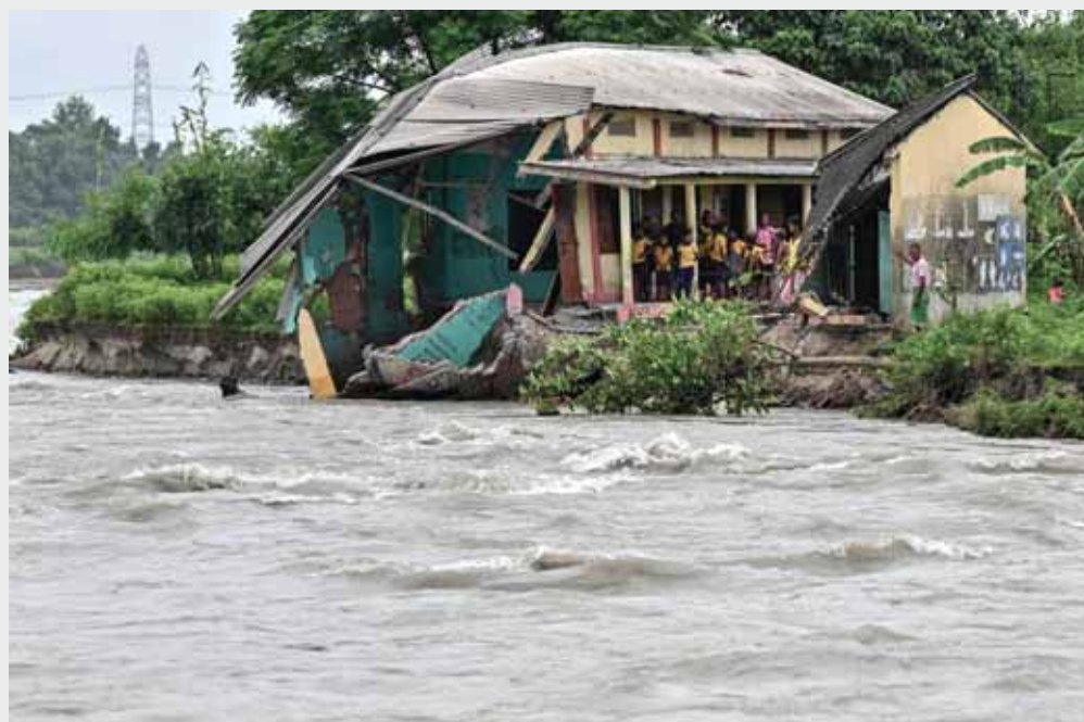
Students and villagers stand near a partially collapsed government school following severe soil erosion after an increase in the water level of the Sermanga river during monsoon season in the New Banglajhora village of Kokrajhar district in India's Assam state yesterday.