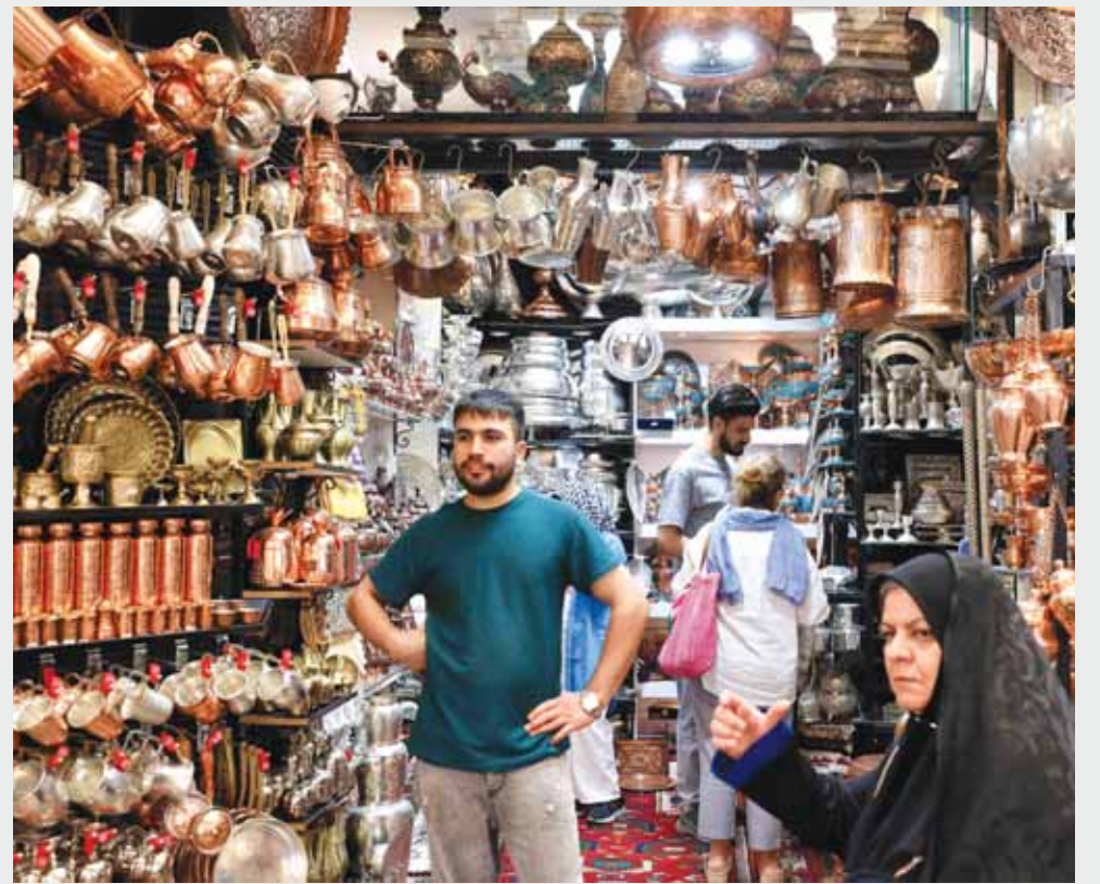
People at Tajrish Bazaar in the Iranian capital Tehran yesterday.