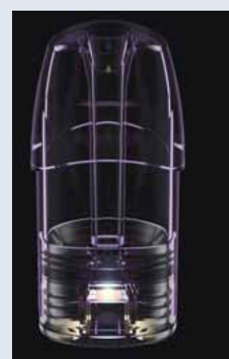
A mock-up of Greentank's heating chip inside a vape part.

"Coming out of that stigma is going to be very difficult for the sector." — Reuters