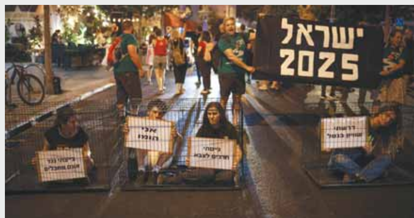
Anti-government activists protest outside the Likud party headquarters in Tel Aviv calling the government to resign yesterday, amid the ongoing Israeli war on Gaza.