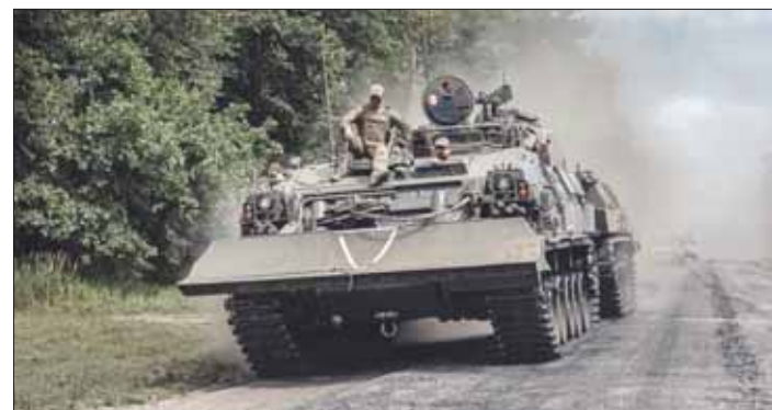
Ukrainian servicemen ride a military vehicle near the Russian border in Sumy region, Ukraine, yesterday.

Moscovites yesterday backed a tough response to Ukraine's shock border incursion, the most serious attack by a foreign army on Russian territory since the Second World War.