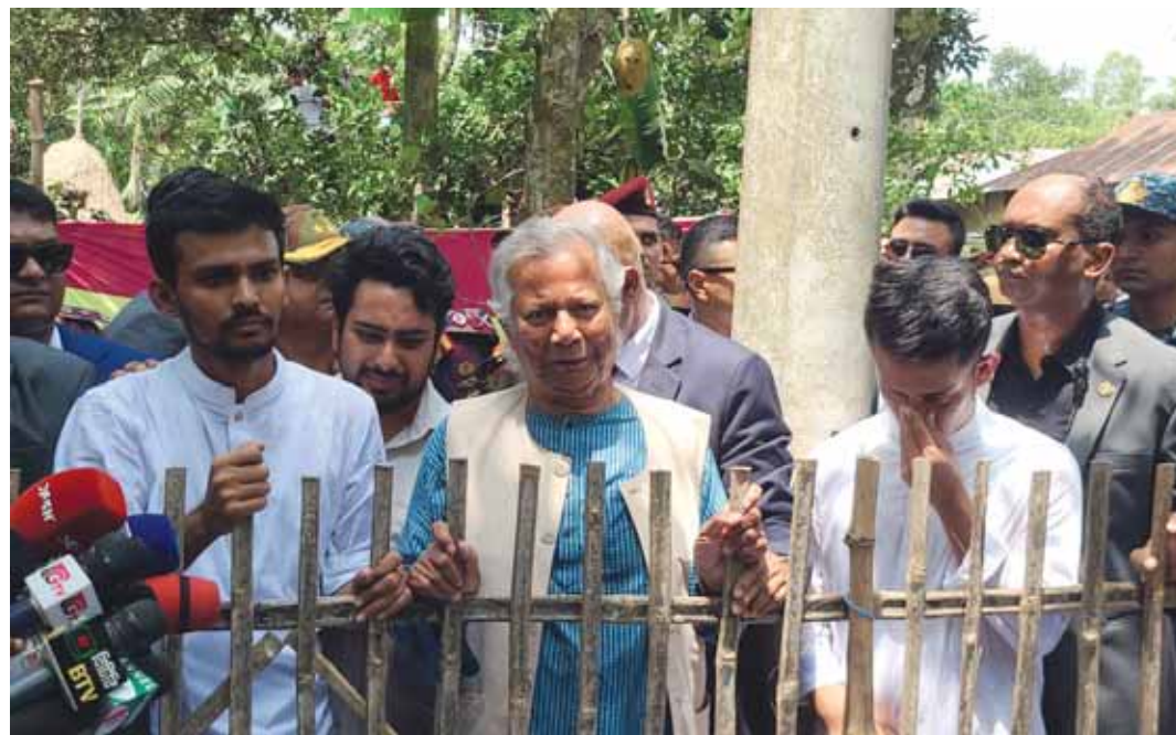
Nobel laureate and chief adviser of Bangladesh's new interim government, Mohamed Yunus visits Abu Sayeed's house, who was killed by police during the anti-quota protests, in Rangpur.

Complicating its efforts is a strike declared Tuesday by the police union, saying its members would not return to work until their safety was assured. Bangladesh's police force said more than half of the country's police stations had since reopened. They are being