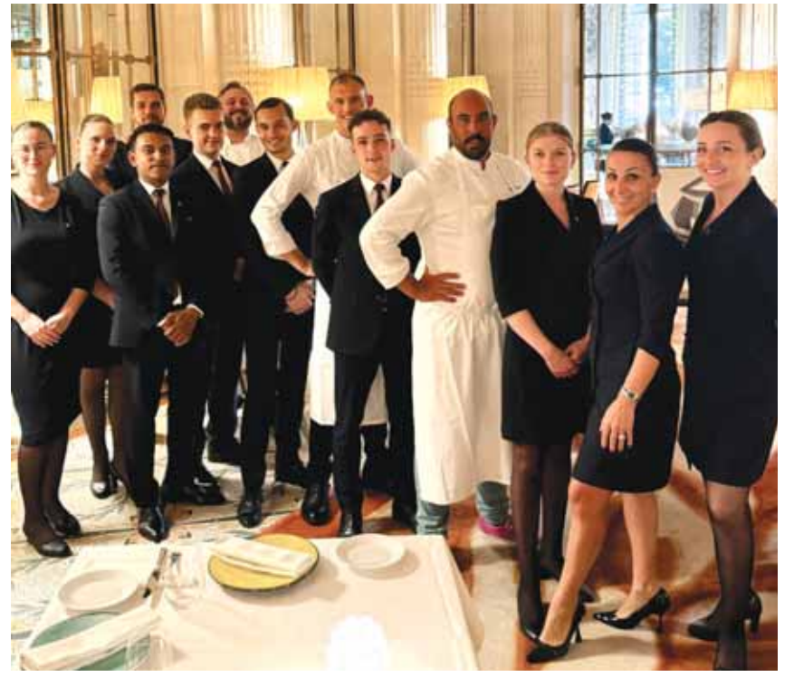
The Jiwan team in Paris.

As Jiwan returns to the NMQ on August 14, the success of the takeover is a milestone in its journey to promote Qatar's Middle Eastern cuisine on a global stage.