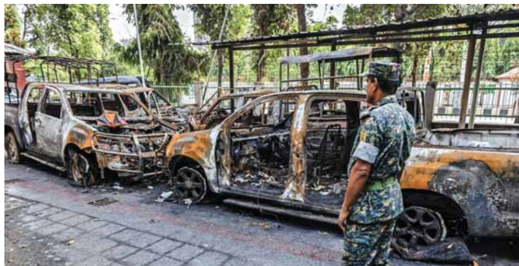
A member of the Bangladesh Army assesses the damages inside a police station vandalised and burned by protesters.