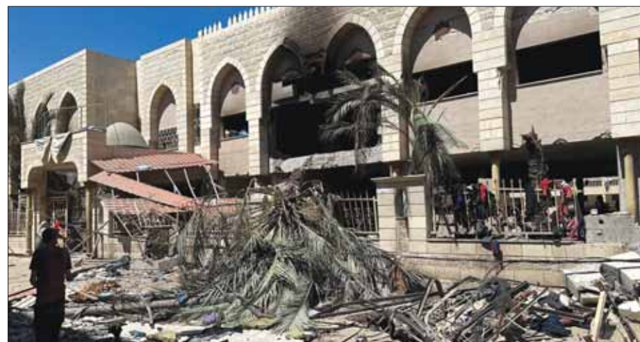
Palestinians look at damages at the site of an Israeli strike on a school sheltering displaced people in Gaza City yesterday.

"These actions highlight the dangerous criminal approach of the Israeli occupation forces and constitute a blatant violation of in-