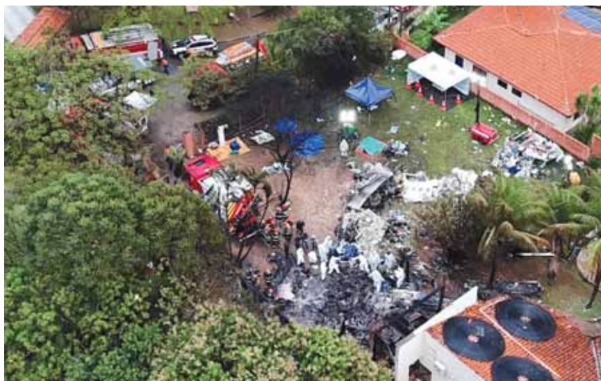
A drone view shows people working at the site of a plane crash in Vinhedo.

The plane had been in use since 2010 and