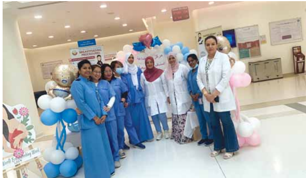
PHCC has also established educational booths at all health centres.

After six months, breastfeeding should continue alongside the introduction of complementary foods until the child reaches two years of age, as breast milk remains crucial in meeting some of the child's nutritional needs. Studies show that individuals who were breastfed are less likely to experi-