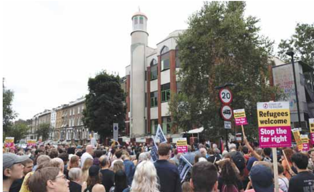
People hold signs at a protest against racism outside Finsbury Park Mosque in London.