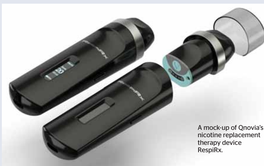
A mock-up of Qnovia's nicotine replacement therapy device RespiRx.