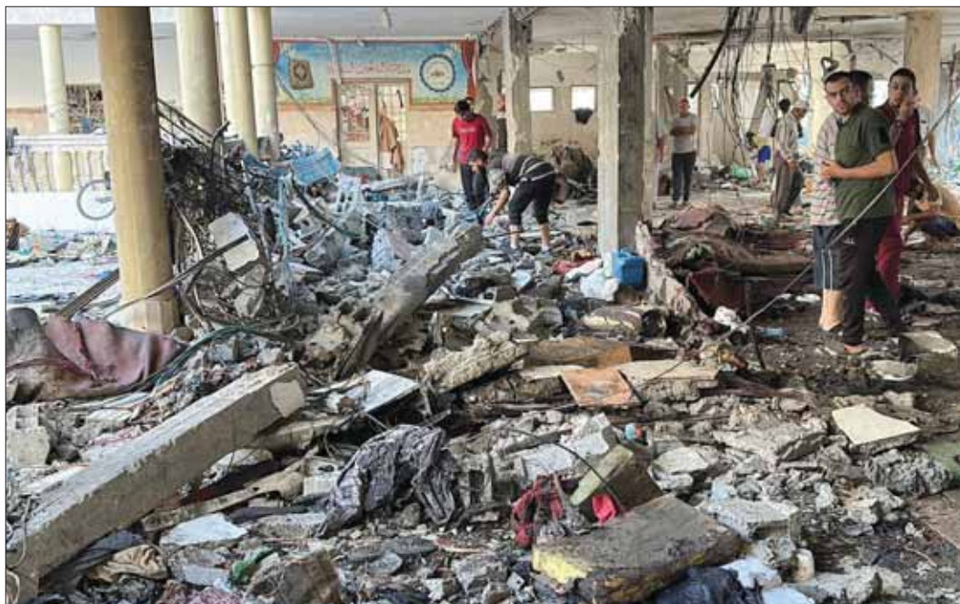
Palestinians inspect the site of an Israeli strike on a school sheltering displaced people, in Gaza City, yesterday.

"So far, there are more than 93 martyrs, including 11 children and six women. There are unidentified remains," Palestinian civil defence spokesperson Mahmoud Bassal told a televised press conference.