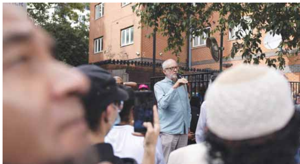
Independent MP Jeremy Corbyn attends a protest in London.