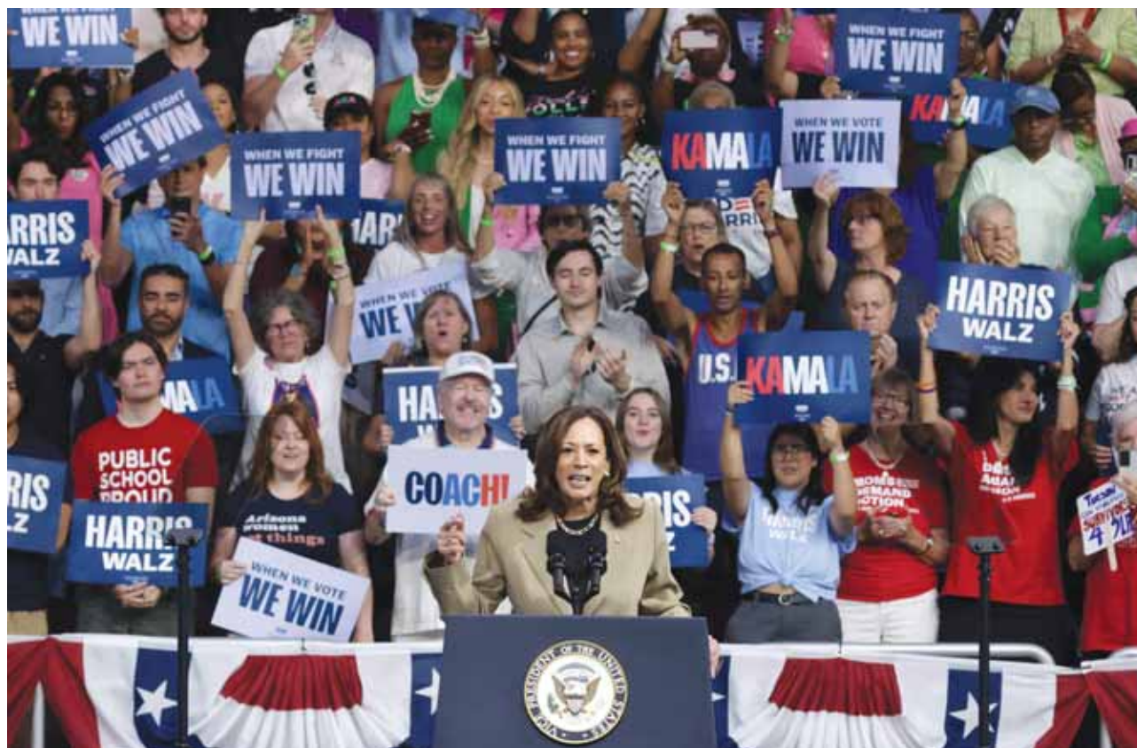
Democratic US presidential candidate Vice-President Kamala Harris speaks during a campaign rally at Desert Diamond Arena on Friday in Glendale, Arizona.

When asked about the prospects of a shrinking battleground map, the Trump team said its strategy hadn't changed