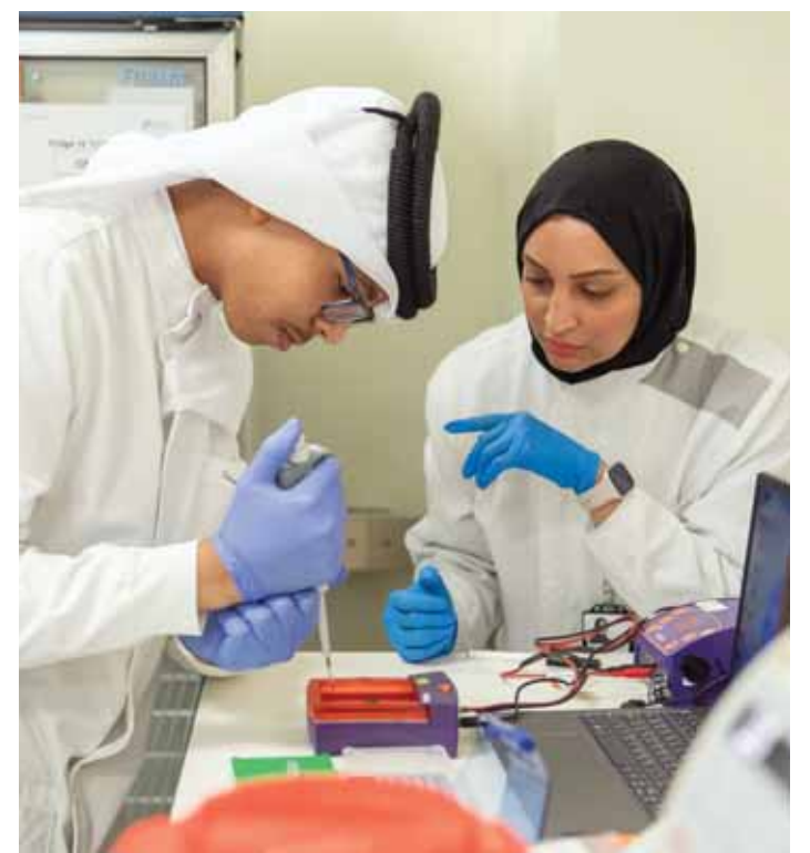
Snapshots from the programme.