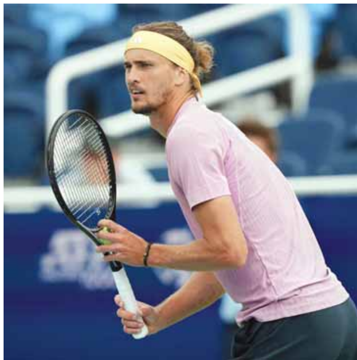
Alexander Zverev of Germany in action during his match against Karen Khachanov yesterday.