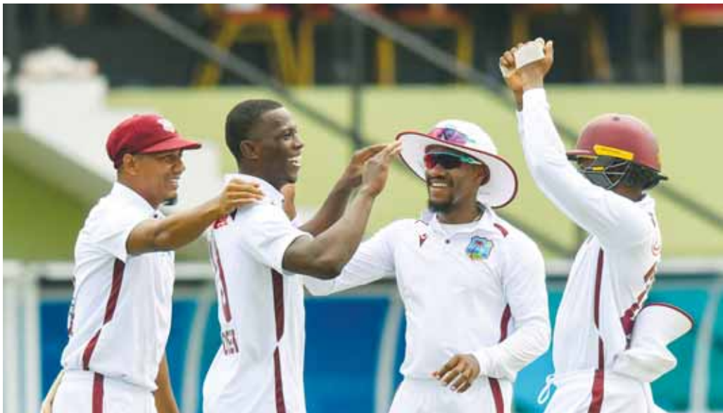
Shamar Joseph (second left), Gudakesh Motie (left) and Kavem Hodge (third left) of West Indies celebrate the dismissal of David Bedingham of South Africa during the first day of the second Test at Guyana National Stadium in Providence, Guyana, yesterday.