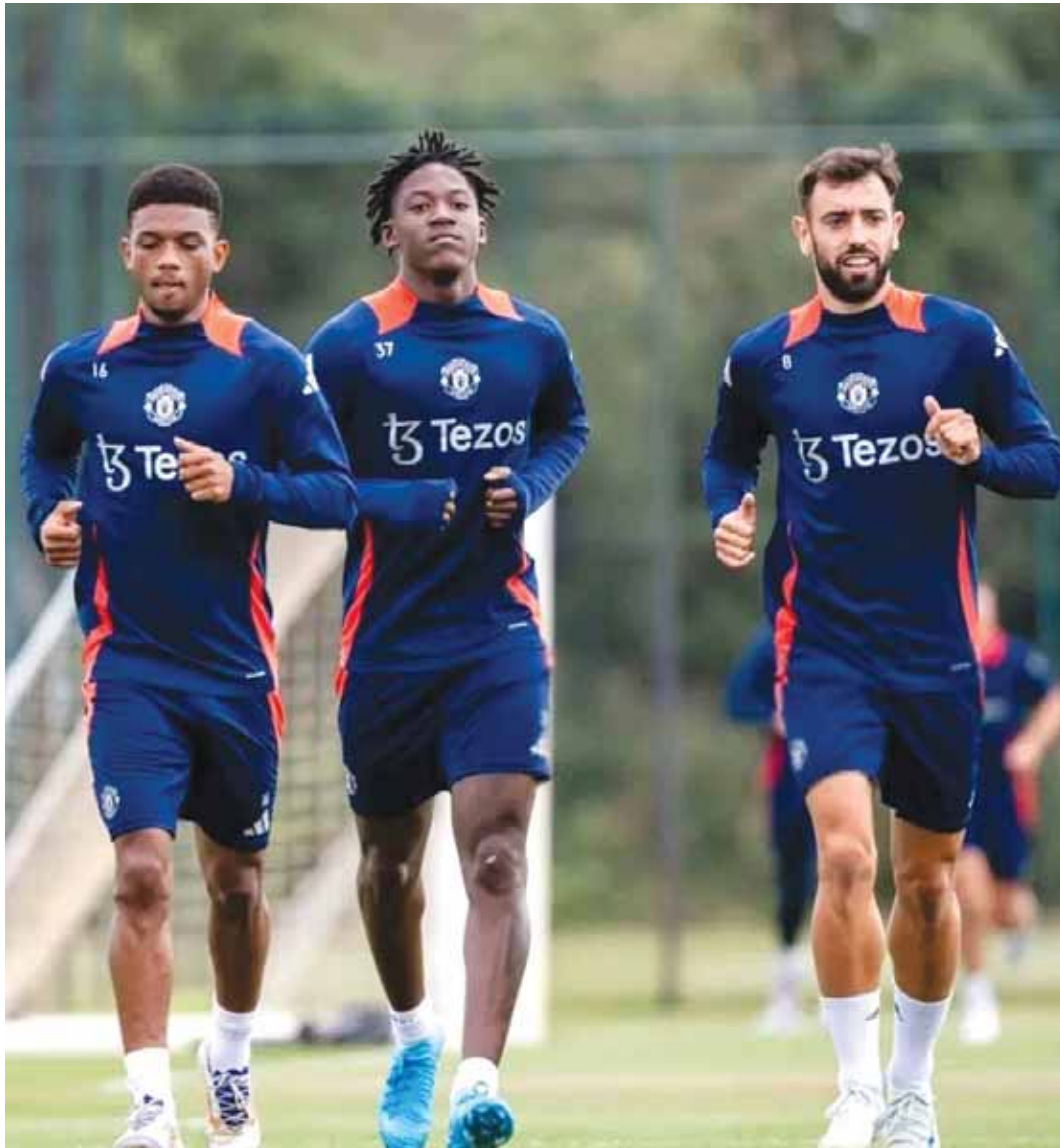
Manchester United players at a training session yesterday.

City's England trio of Kyle Walker, John Stones and Phil Foden, plus Spanish midfielder Rodri, only returned to training this week after competing in the Euro 2024 final and are unlikely to start against Chelsea.