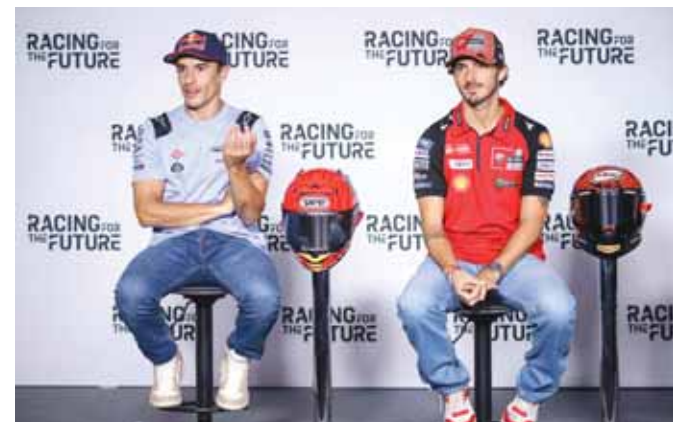
Gresini Racing MotoGP Spanish rider Marc Marquez (left) and Ducati Lenovo Team Italian rider Francesco Bagnaia attend a press conference at the Red Bull Ring in Spielberg, Austria, yesterday, ahead of the Austrian MotoGP Grand Prix weekend.

On the close title battle with Martin he reflected: "To be leading the championship now is not that important - it's like starting the season over again, we have 10 races to go and only three points in it."