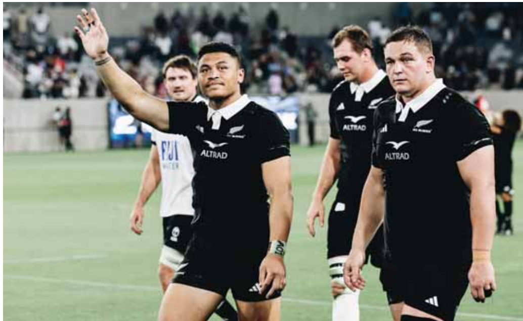
All Blacks players during one of their recent games in the build-up to the new season in San Diego last month. The All Blacks take on Argentina in their Rugby Championship match tomorrow.