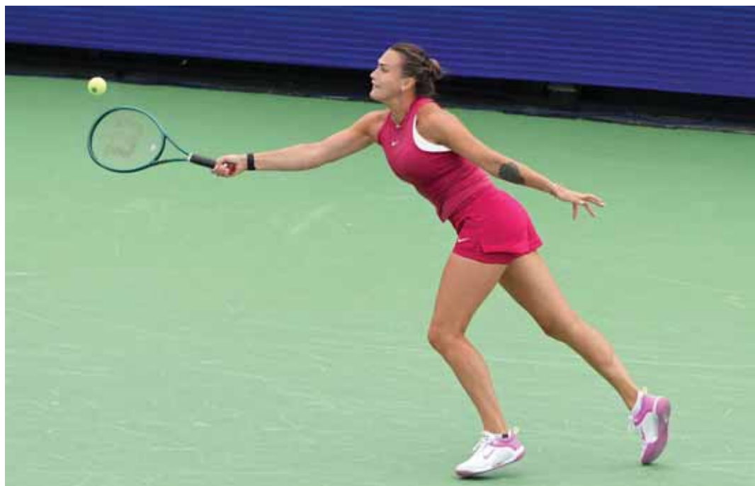
Aryna Sabalenka plays a forehand during her match against Elisabetta Cocciaretto of Italy during Day 5 of the Cincinnati Open at the Lindner Family Tennis Center in Mason, Ohio, yesterday.

Spain's Pablo Carreno Busta lined up as the German's next opponent after defeating Australian