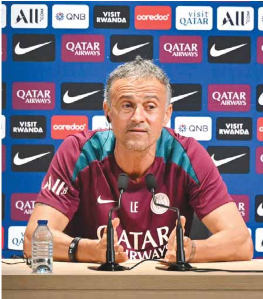
Paris St Germain coach Luis Enrique speaks at a press conference yesterday, on the eve of his team's Ligue 1 opener against Le Havre.

rare - there are players capable of playing in many positions, Lee (Kang-In), (Marco) Asensio, Warren Zaire-Emery, I have endless possibilities in the middle and in at-