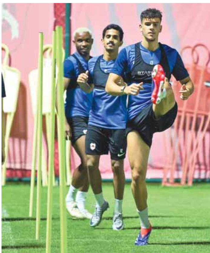
Al Rayyan players during a training session yesterday.