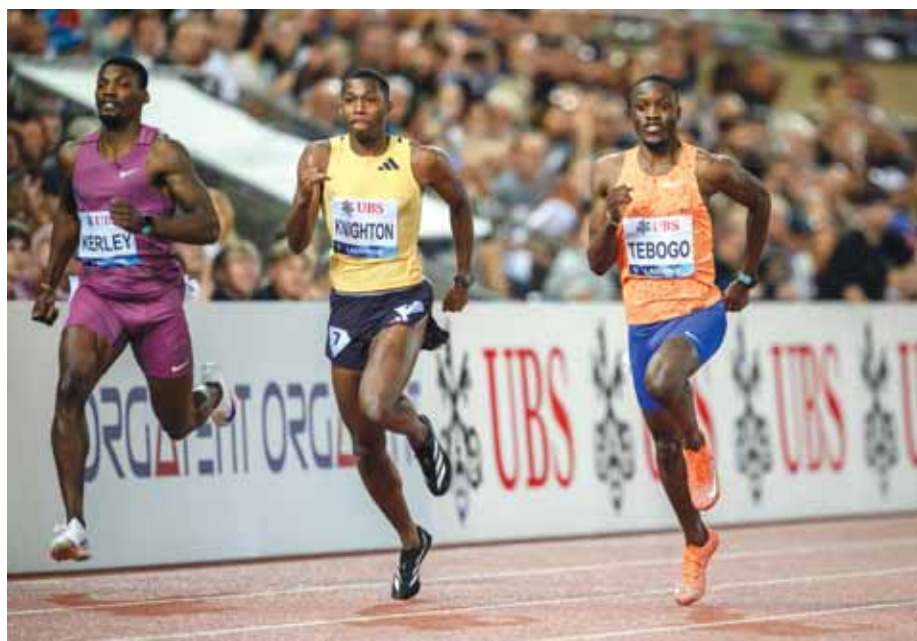
Botswana's Letsile Tebogo sprints to 200m victory ahead of United States' Erriyon Knighton and Fred Kerley at Diamond League meeting in Lausanne yesterday.

Perhaps the biggest upset was in the men's 110m hurdles as Olympic champion and