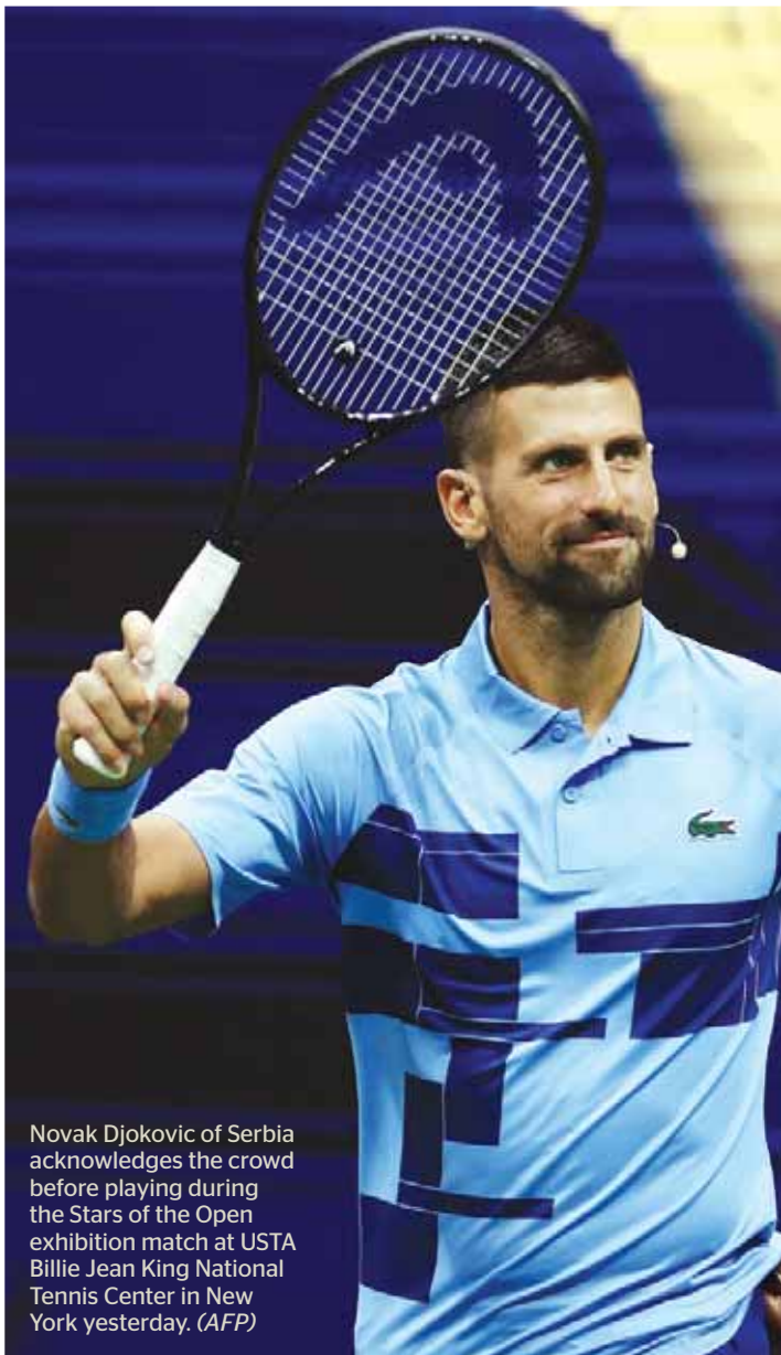
Novak Djokovic of Serbia acknowledges the crowd before playing during the Stars of the Open exhibition match at USTA Billie Jean King National Tennis Center in New York yesterday.

No woman has successfully defended her US Open title since Serena Williams in 2014. Five-time major winner and world number one Iga Swiatek, the 2022 champion in New York, made the Cincinnati semi-finals where she was defeated by Aryna Sabalenka. Sabalenka, the Australian Open champion, was runner-up to Gauff at the US Open last year, losing from a set up in the final.