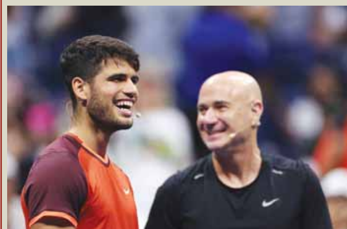
Andre Agassi (right) of the US and Carlos Alcaraz of Spain play against John McEnroe of the US and Novak Djokovic of Serbia during the Stars of the Open exhibition match at USTA Billie Jean King National Tennis Center in New York.

NEW YORK: Past US Open champions and fans' favourites treated an Arthur Ashe crowd to superstar matchups and hilarious mic'd-up interactions during the Stars of the Open at Flushing Meadows.