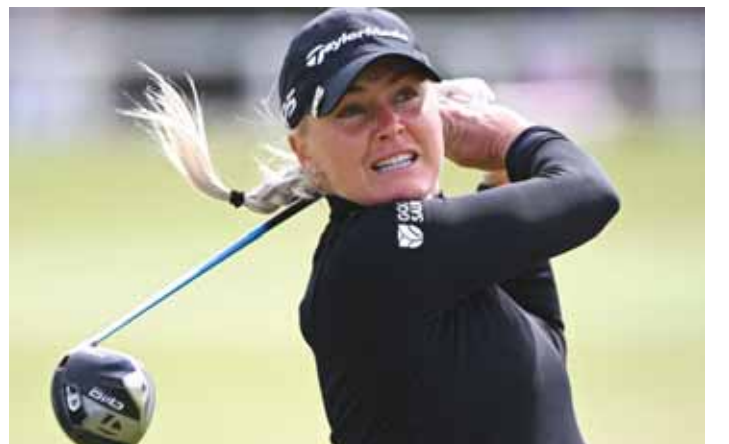
England's Charly Hull watches her drive from the 2nd tee on the opening day of the 2024 Women's British Open Golf Championship at St Andrews, Scotland, yesterday.

Hull, meanwhile, dramatically eagled her final hole, the ninth, to finish on one-under alongside Linnea Strom.