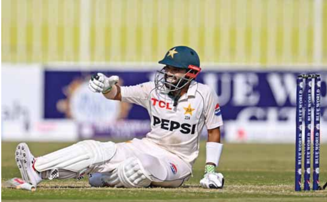
Pakistan's Mohamed Rizwan reacts during the second day of first Test against Bangladesh at the Rawalpindi Cricket Stadium in Rawalpindi yesterday.