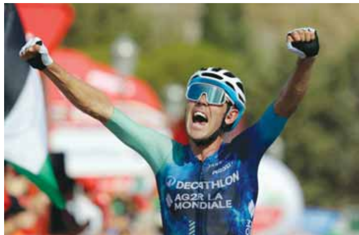
Decathlon AG2R La Mondiale Team's Ben O'Connor celebrates winning Stage 6 of Vuelta a Espana in Yunquera, Spain, yesterday.