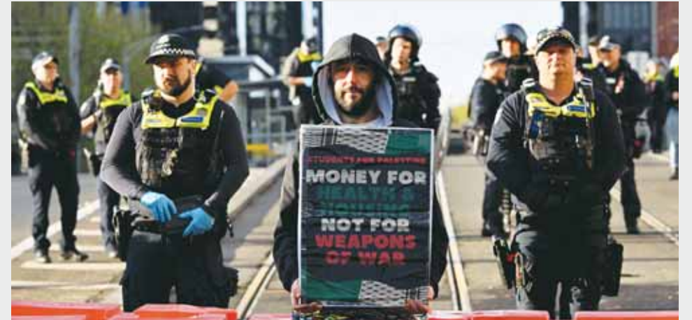
Anti-war groups protested outside the defence exhibition for a second day yesterday, after violent clashes between police and protesters on Wednesday injured several officers. Protesters marched through the city's streets as police set up new barricades to block the crowd entering the roads near the venue hosting the biennial Land Forces International Land Defence Exposition.