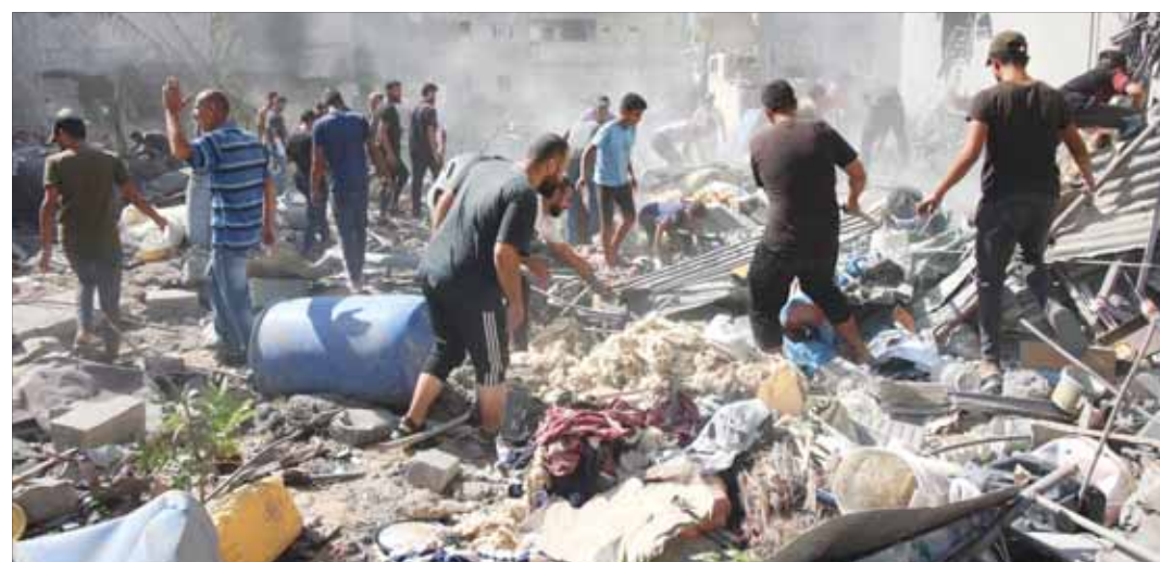
Palestinians search in the rubble for survivors at the site of an Israeli strike in the Shejaiya suburb east of Gaza City yesterday.

UNRWA later said six of its staff had been killed in two Israeli