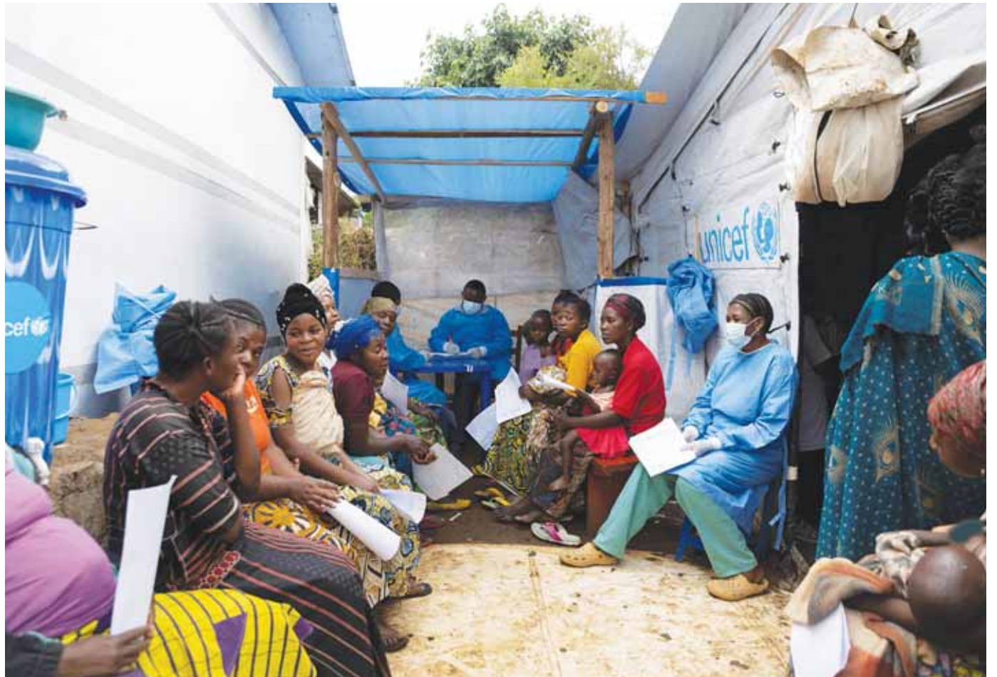
Suspected mpox patients wait for consultation at the mpox treatment centre at the Kavumu hospital in Kabare territory, South Kivu province of the Democratic Republic of Congo.

“Some of the vaccines could cost around $150 for a person to be fully vaccinated, a price that is unaffordable to most African countries,” a spokesperson for the Africa CDC team in DRC said. “So donated vaccines from countries is all the more important.”