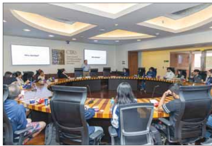
CIRS student event inside a US presidential campaign room.