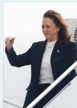
Harris disembarks Air Force Two at Charlotte Douglas International airport, North Carolina, yesterday.

Many Republicans were also not convinced about their candidate's performance in the debate in Philadelphia. Some 53% of Republican voters in the poll said Trump won the debate, compared to 91% of Democrats who said she was the victor.