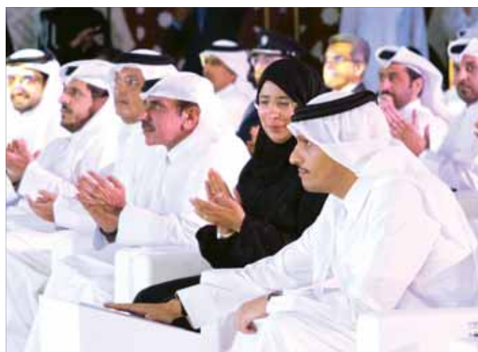
HE the Prime Minister and Minister of Foreign Affairs Sheikh Mohammed bin Abdulrahman bin Jassim al-Thani launches National Health Strategy 2024-2030 yesterday.

The National Health Strategy 2024-2030 outlines three strategic priority areas: Improved Population Health and Wellbeing, Excellence in Service Delivery and