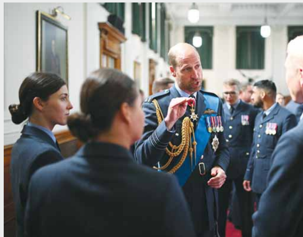
Britain's Prince William, Prince of Wales, speaks with people on the day of the Sovereign's Parade at the Royal Air Force (RAF) College in Cranwell, Britain, yesterday.