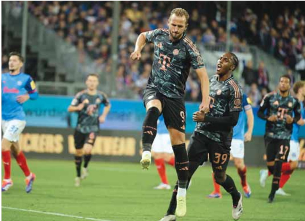
Bayern Munich's Harry Kane celebrates scoring their sixth goal and completing his hat-trick against Holstein Kiel at Holstein-Stadion, Kiel, Germany, yesterday.

Defending champions Bayer Leverkusen put their first defeat in 35 Bundesliga games behind them yesterday when they thumped Hoffenheim 4-1 with Victor Boniface bagging a brace.