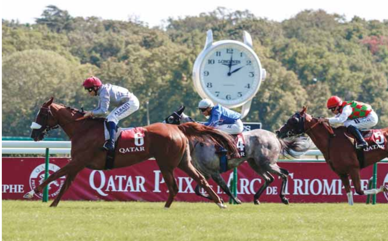
Two highlight races of the day are the Group 1 Qatar Prix Vermeille and Group 1 PA Qatar Cup - Prix Dragon.