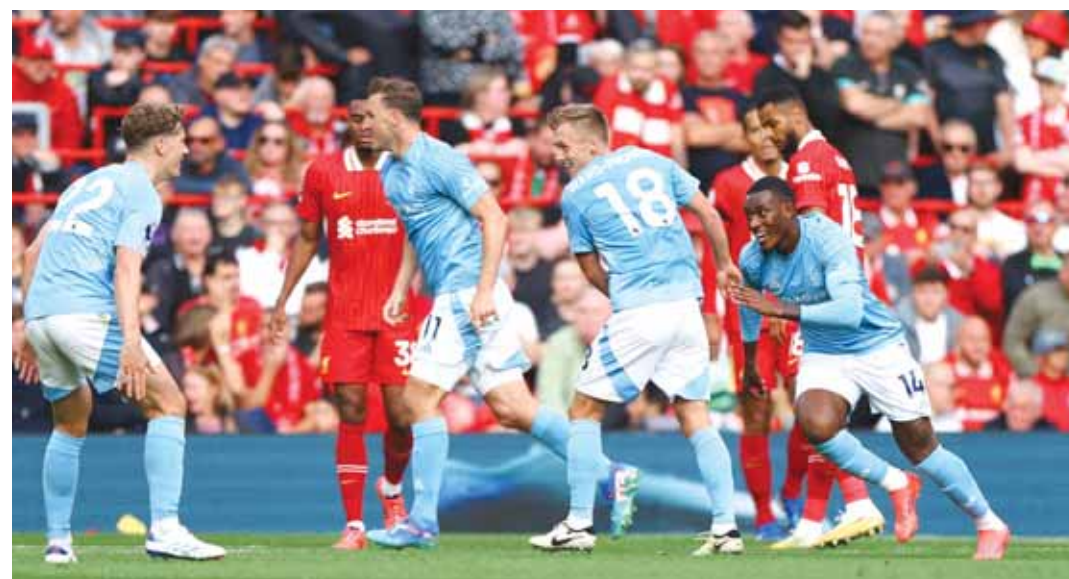
Nottingham Forest's Callum Hudson-Odoi (right) celebrates after scoring against Liverpool.