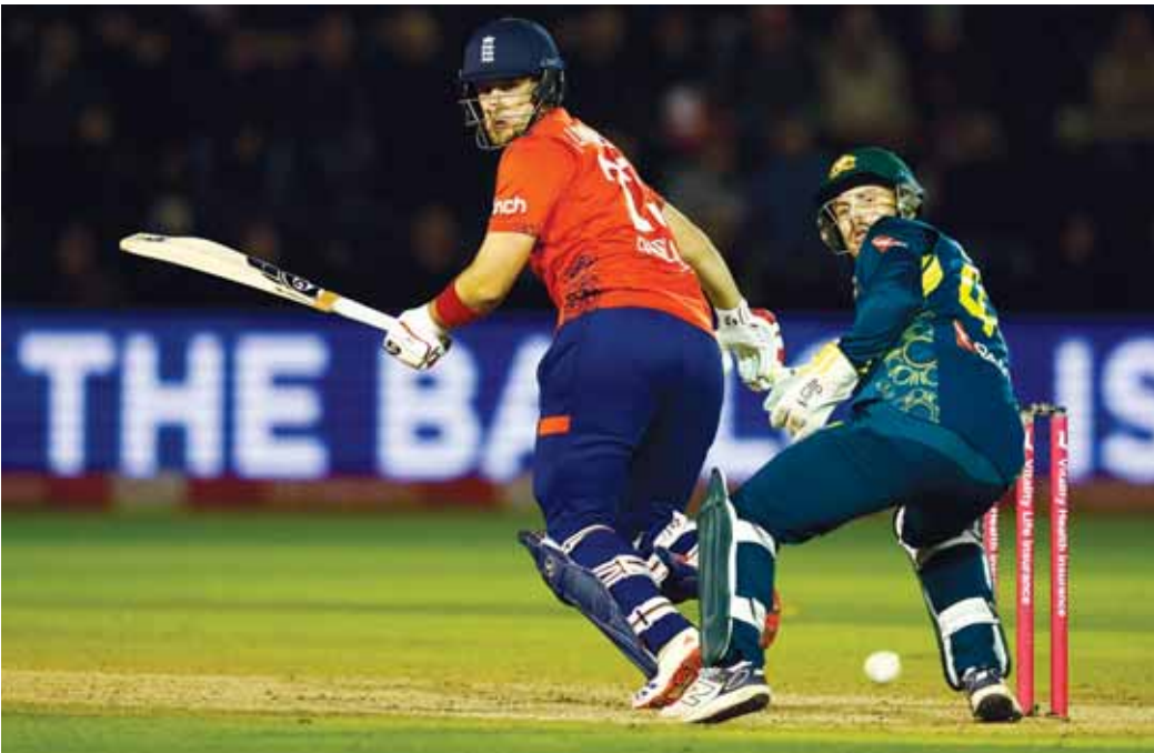
England's batsman Liam Livingstone in action against Australia during their second T20I at Sophia Gardens, Cardiff, on Friday.

"I feel like I'm in decent nick with bat and bowl. I'm enjoying my cricket, it's nice to play with a smile on my face," Livingstone, player of the match, told Sky