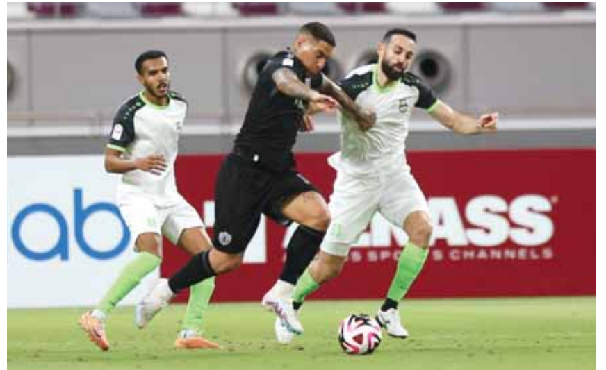
Al Ahli and Qatar SC players vie for the ball at the Khalifa International Stadium.