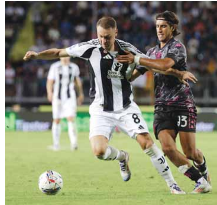
Teun Koopmeiners of Juventus is seen battling for ball possession against Empoli's Youssef Maleh during a Serie A match at Stadio Carlo Castellani, Empoli, Italy, yesterday.