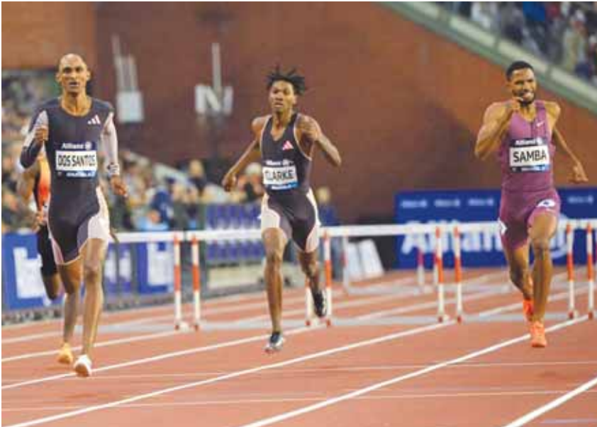
FROM LEFT: Brazil's Alison Dos Santos, Jamaica's Roshawn Clarke and Qatar's Abderrahman Samba compete in the 400m hurdles during the Diamond League finals at the Roi Baudouin Stadium in Brussels yesterday.

And she made no mistake at the King Baudouin Stadium, sprinting away to win in a meet record of 3min 54.76sec. "The world record was not on my mind today, my goal was to finish my Diamond League season in a good way and I did," said Kipyegon. "It was good race, but definitely not