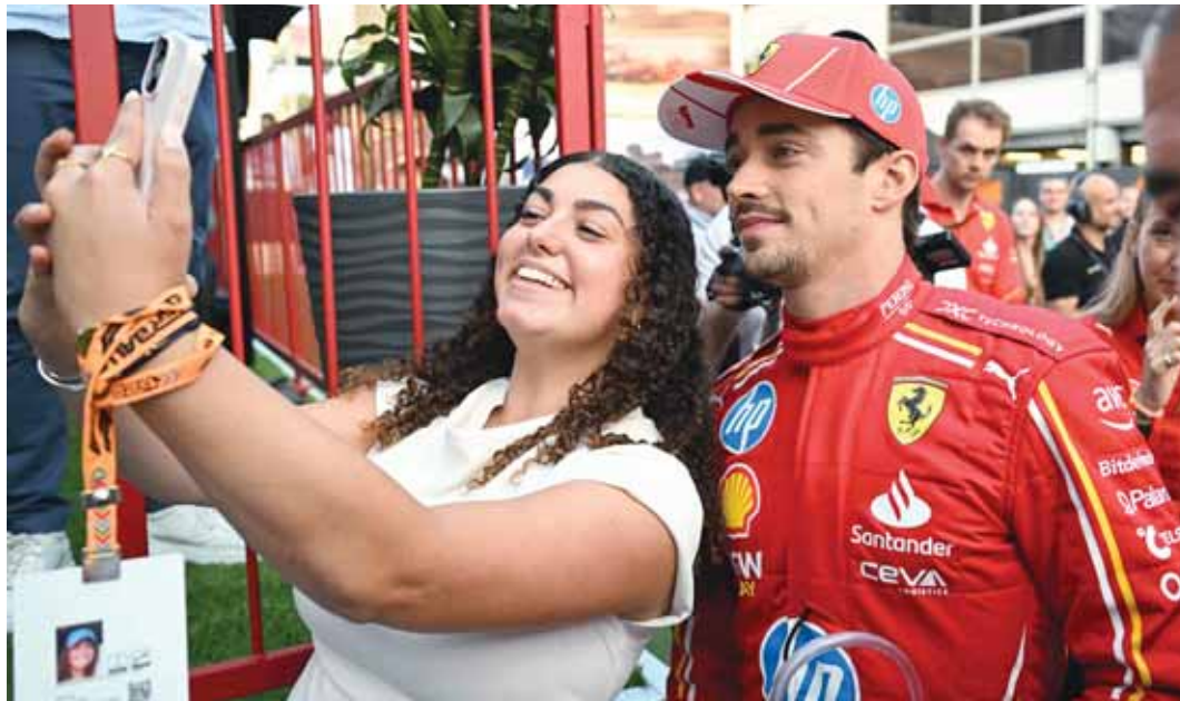
Ferrari's Monegasque driver Charles Leclerc poses for pictures with a fan after the qualifying session ahead of the Azerbaijan Grand Prix at the Baku City Circuit in Baku yesterday.

Norris could only watch as a spectator after going out at the first hurdle when a yellow flag was displayed briefly at the end of the first phase and scuppered his last at-