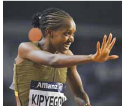
Kenya's Faith Kipyegon celebrates after winning the Women's 1500m final.

"I threw pretty well. It was a very solid performance, five times over 22 metres," Crouser said. "I just had not that big throw in me like the one Leonardo Fabbri had. He