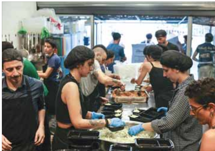
Volunteers work in a community kitchen to prepare meals for those who fled Israeli bombardment in southern Lebanon and found refuge in temporary shelters in Beirut, yesterday.

Landing in the US to address the UN General Assembly, Israeli Prime Minister Benjamin Netanyahu told reporters the military will keep hitting Hezbollah with