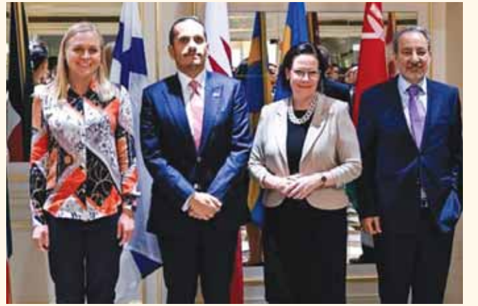
HE the Prime Minister and Minister of Foreign Affairs Sheikh Mohammed bin Abdulrahman bin Jassim al-Thani participated in the joint meeting of the GCC Foreign Ministers of the five Nordic countries, on the sidelines of the 79th session of the United Nations General Assembly in New York. The meeting dealt with bilateral co-operation and the means to enhance it, in addition to discussing several topics of joint interest.