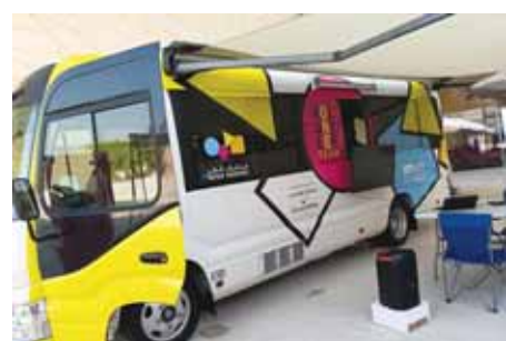
The buses will be used to transport volunteers.