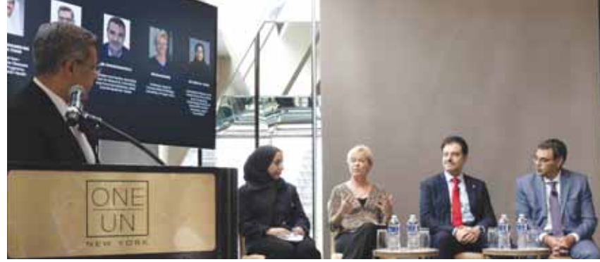
Panelists at the session.