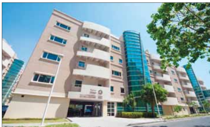
Enaya and Daam Specialised Care Center

"By valuing the insights of patients, families, and caregivers, we