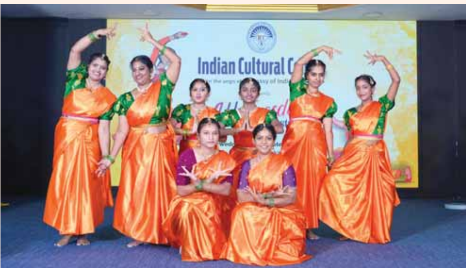
Colourful group dances captivated the audience at Indian Cultural Centre's Wednesday Fiesta which resumed after the summer break. ICC office-bearers and senior community leaders were present.