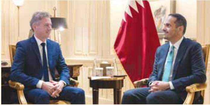
HE the Prime Minister and Minister of Foreign Affairs Sheikh Mohammed bin Abdulrahman bin Jassim al-Thani met with Prime Minister of the Republic of Slovenia Dr Robert Golob, on the sidelines of the 79th session of the United Nations General Assembly in New York. During the meeting, they discussed relations between the two countries and means to support and enhance them, in addition to a number of regional and international issues of common interest.