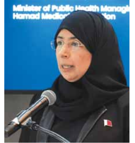
HE the Minister of Public Health Dr Hanan Mohamed al-Kuwari addressing the session.

an exceptional job in setting up a precision health system from the ground up in a short amount of time," she said. "More importantly, they haven't stopped there but are now looking to pass on their knowledge and lessons learned to other countries in the region and further, particularly less developed ones."