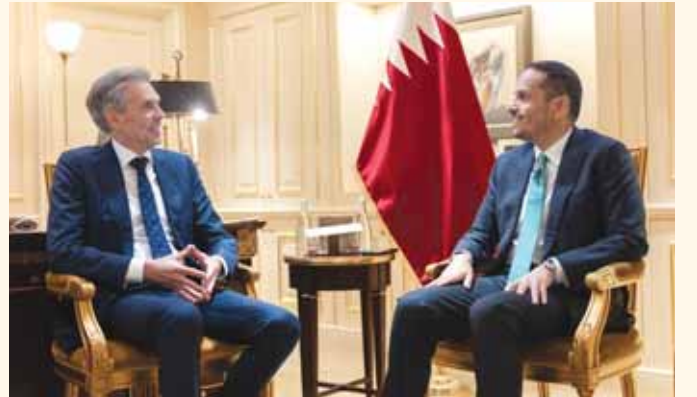
HE the Prime Minister and Minister of Foreign Affairs Sheikh Mohammed bin Abdulrahman bin Jassim al-Thani met with Prime Minister of Netherlands Dick Schoof, on the sidelines of the 79th session of the United Nations General Assembly in New York. They discussed relations between the two countries and ways to support and enhance them, in addition to a number of regional and international issues of common interest. (QNA)