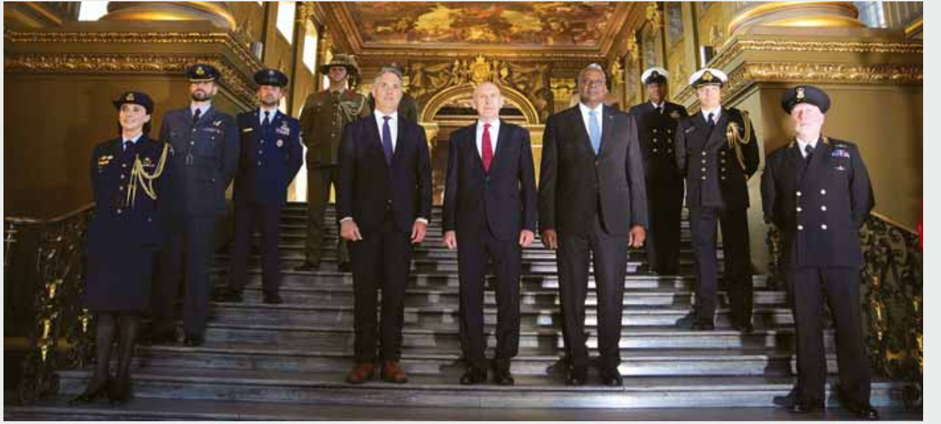
UK Defence Secretary John Healey, US Secretary of Defence Lloyd Austin, and Australian Defence Minister Richard Marles pose for a picture ahead of the AUKUS defence ministers meeting at Old Royal Naval College, Greenwich, London, yesterday.