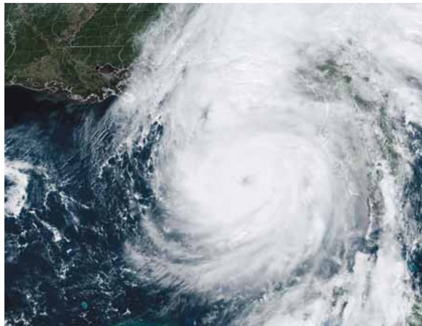
This image obtained from the National Oceanic and Atmospheric Administration (NOAA) shows Hurricane Helene yesterday. - AFP

Storm surge was forecast to reach 15-20' (4.6-6.1m) in the Big Bend area of Florida's Panhandle region where the storm is ex-