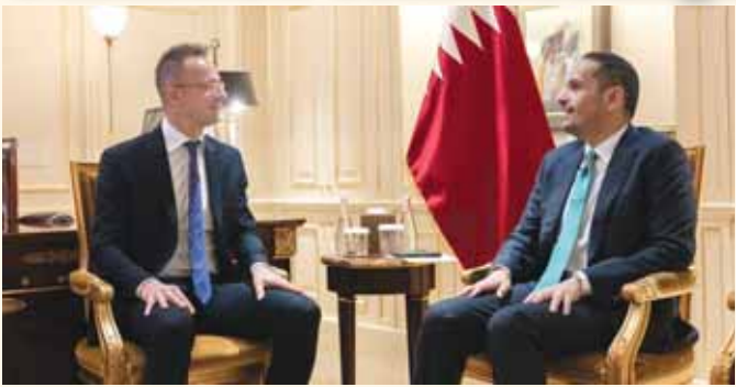
HE the Prime Minister and Minister of Foreign Affairs Sheikh Mohammed bin Abdulrahman bin Jassim al-Thani met with Minister of Foreign Affairs and Trade of Hungary Peter Szijarto on the sidelines of the 79th session of the United Nations General Assembly in New York. During the meeting, they discussed relations between the two countries and ways to support and enhance them, in addition to a number of regional and international issues of common interest.