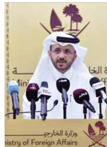
Dr Majid bin Mohammed al-Ansari briefing the media yesterday.

Dr al-Ansari praised the efforts of HE Lolwah bint Rashid AlKhatier, Minister of State for International Co-operation, in leading the negotiations and mediation processes, and the efforts of the parties