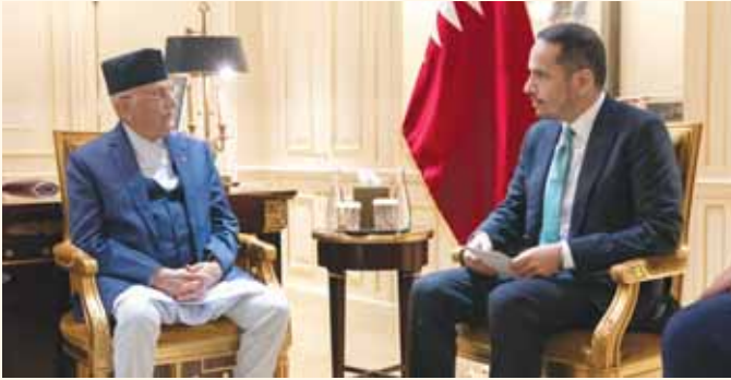
HE the Prime Minister and Minister of Foreign Affairs Sheikh Mohammed bin Abdulrahman bin Jassim al-Thani met with Prime Minister of Nepal Khadga Prasad Sharma Oli on the sidelines of the 79th session of the United Nations General Assembly in New York. During the meeting, they discussed relations between the two countries and ways to support and enhance them, in addition to a number of regional and international issues of common interest.