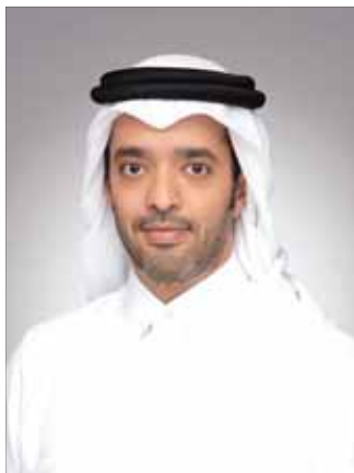
Saad bin Ali al-Kharji

"As we commemorate World Tourism Day 2024 under the