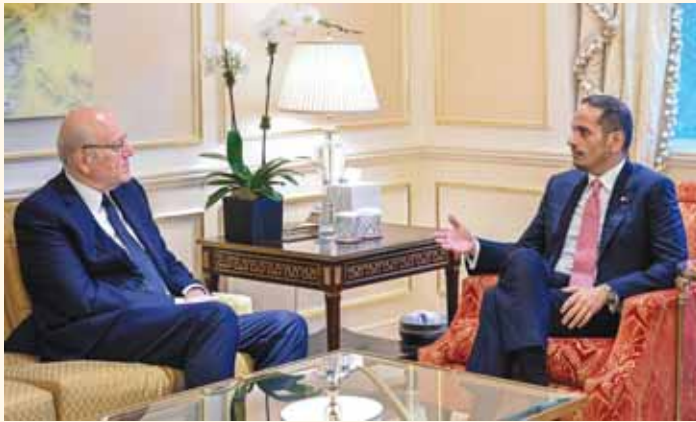
HE the Prime Minister and Minister of Foreign Affairs Sheikh Mohammed bin Abdulrahman bin Jassim al-Thani met with Caretaker Prime Minister of Lebanon Najib Mikati on the sidelines of the 79th session of the United Nations General Assembly in New York. The meeting dealt with bilateral co-operation between the two countries and the means to enhance it, in addition to the latest developments in Lebanon and ways to de-escalate, as well as several topics of joint interest.