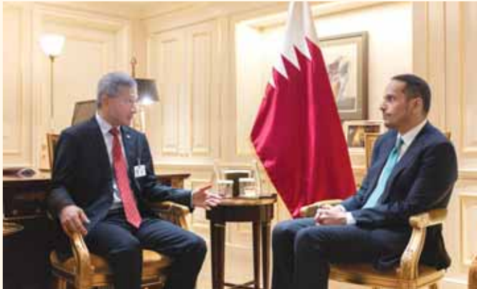
HE the Prime Minister and Minister of Foreign Affairs Sheikh Mohammed bin Abdulrahman bin Jassim al-Thani met with Minister of Foreign Affairs of Singapore Dr Vivian Balakrishnan. They discussed relations between the two countries and means to support and enhance them, in addition to a number of regional and international issues of common interest.