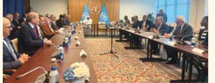
HE the Prime Minister and Minister of Foreign Affairs Sheikh Mohammed bin Abdulrahman bin Jassim al-Thani participated in the meeting of the Ministerial Committee assigned by the Joint Arab-Islamic Extraordinary Summit with UN Secretary-General Antonio Guterres, on the sidelines of the 79th session of the United Nations General Assembly in New York. The meeting dealt with developments in the Gaza Strip and the occupied Palestinian territories, ceasefire efforts, the release of prisoners and hostages, the sustainable entering of humanitarian aid to all areas of the strip without obstacles.