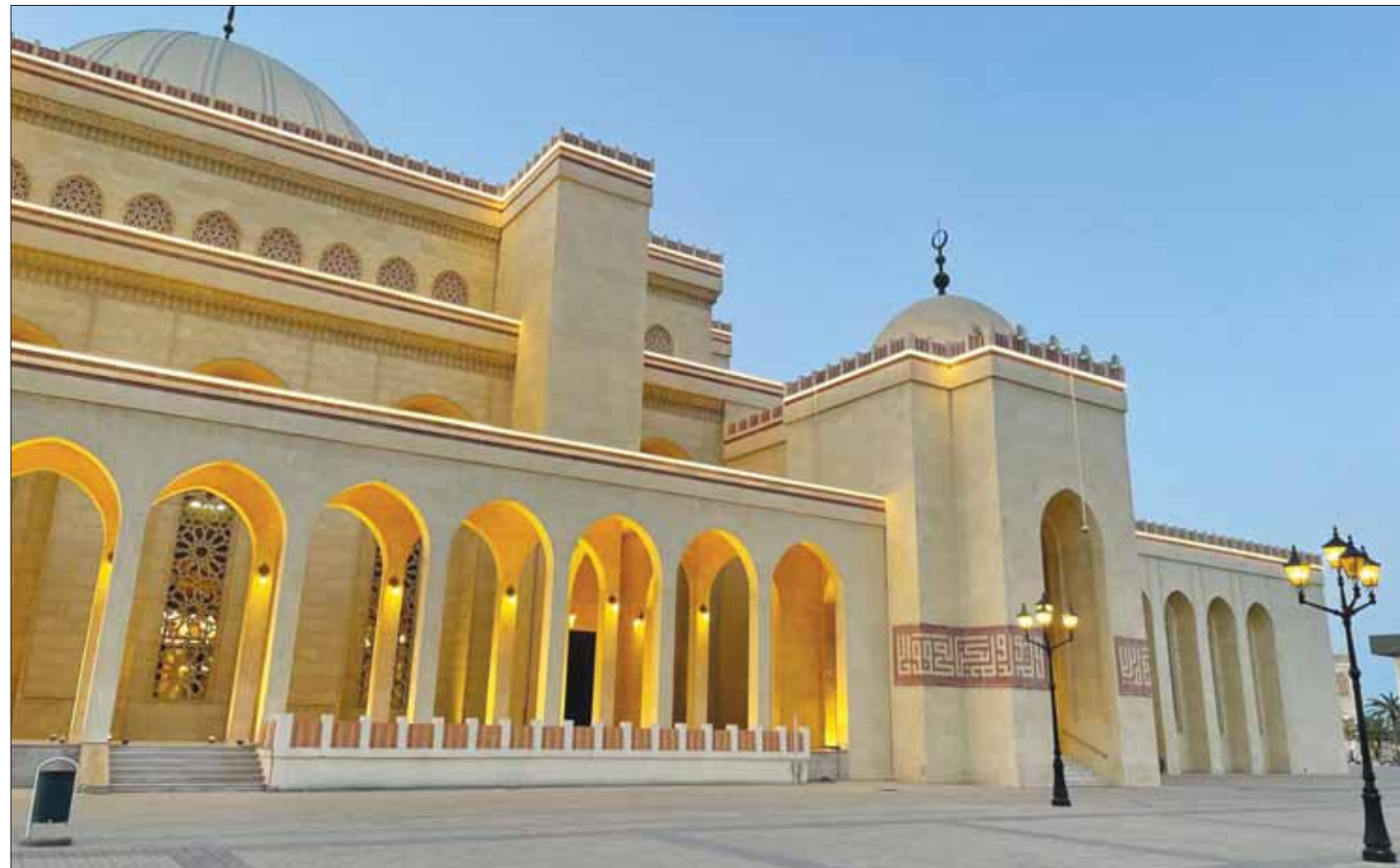
Ahmed Al Fateh Islamic Centre in Manama, Bahrain.

It is unique in that it was not used profusely before the Prophet Muhammad, sallallahu 'alaihi wa sallam , made its use popular. Although there were more than 400 herbs in use before the Prophet Muhammad, sallallahu 'alaihi wa sallam , and recorded in the herbals of Galen and Hippocrates, the Black Seed was not one of the most popular remedies of the