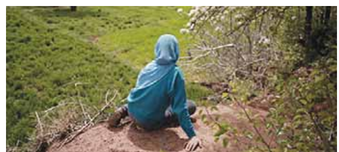
House in the Fields (Tigmi Nigren).

The events will conclude on October 3. - QNA