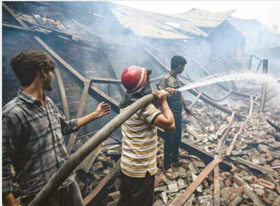
Firefighters extinguish a blaze which broke out at a textile factory in Amritsar, India, yesterday. The cause of the fire remains unknown at this time, and the extent of the damage has yet to be assessed.