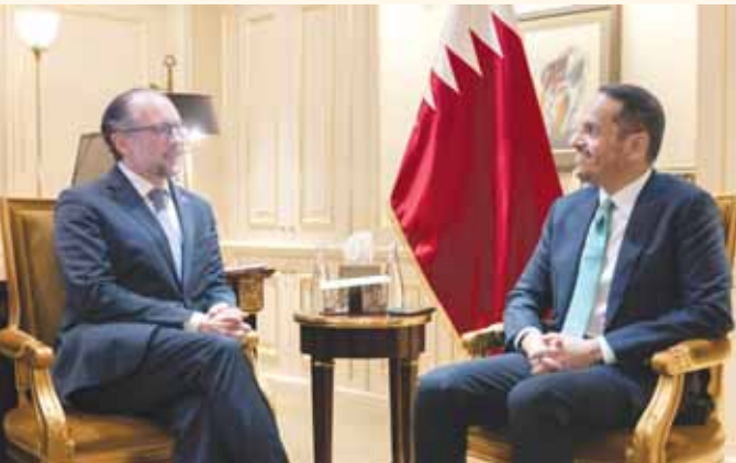
HE the Prime Minister and Minister of Foreign Affairs Sheikh Mohammed bin Abdulrahman bin Jassim al-Thani met with Federal Minister for European and International Affairs of Austria Alexander Schallenberg. They discussed relations between the two countries and means to support and enhance them, in addition to a number of topics of common interest.