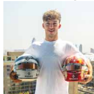
F1 driver Pierre Gasly holding two custom-designed racing helmets crafted by Qatari artists Shouq al-Mana and Alanoud al-Ghamdi in previous collaboration.

Alanoud's helmet, inspired by Qatari desert flora, fauna, and national symbols, was auctioned for charity