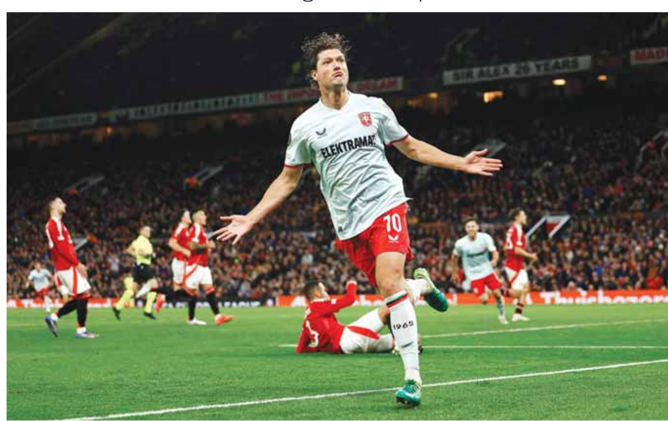
{\sf FC\ Twente's\ Sam\ Lammers\ celebrates\ after\ scoring\ against\ Manchester\ United\ in\ the\ Europa\ League.}

Instead it was the Eredivisie side who inflicted the discomfort, with a helping hand from another inconsistent United performance hot on the heels of their disappointing goalless draw at Crystal Palace last Saturday. Eriksen questioned whether United played with enough desire after their poor run in European competitions extended to