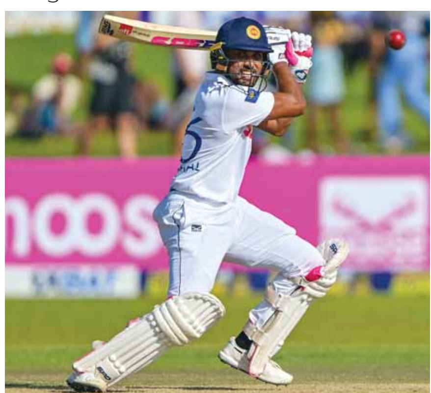
Sri Lanka's Dinesh Chandimal plays a shot during the first day of the second Test against New Zealand in Galle yesterday.

Sri Lanka 306 for 3 (Chandimal 116, Mathews 78 batting, Kamindu 51 batting, Phillips 1-33) vs New Zealand