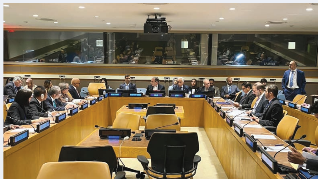
Qatar participated in the annual ministerial meeting of the Asian Co-operation Dialogue, on the sidelines of the 79th session of the United Nations General Assembly in New York. Qatar's delegation to the meeting was headed by HE Minister of State for Foreign Affairs Sultan bin Saad al-Muraikhi. (QNA)