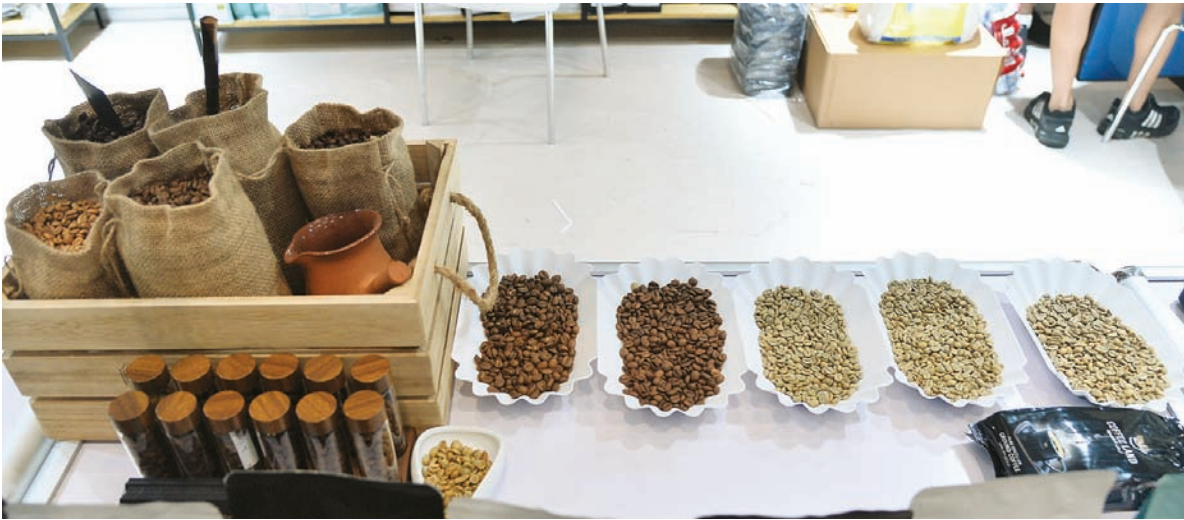
The exhibition features an array of educational activities and workshops.