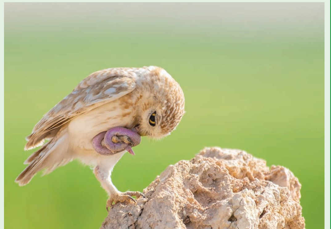
Third prize-winning entry.