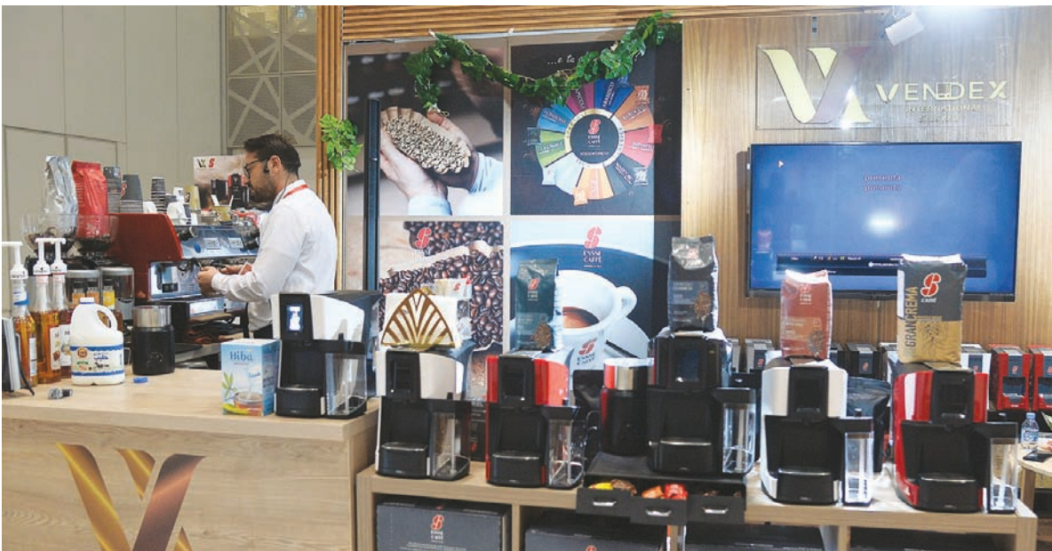
The exhibition at the DECC displays new coffee machines and equipment.

"The market here is strong, and customers demand quality," he said. "We maintain high standards, and visitors appreciate knowing exactly what they're buying."