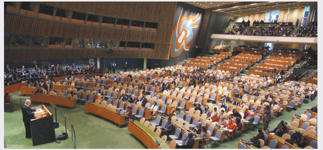
Empty seats are pictured as Israeli Prime Minister Benjamin Netanyahu addresses the 79th UN General Assembly in New York yesterday. Delegates representing Lebanon, Iran, the Palestinians and others exited the room as Netanyahu took the rostrum for his speech.