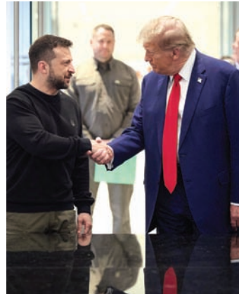
This handout photograph released by the Ukrainian presidential press service shows Zelensky and Trump during a meeting yesterday in New York.

"I presented him our Victory Plan, and we thoroughly reviewed the situation in Ukraine and the consequences of the war for our people," Zelensky wrote. "Many details were discussed. I am grateful for this meeting. A just peace is needed."