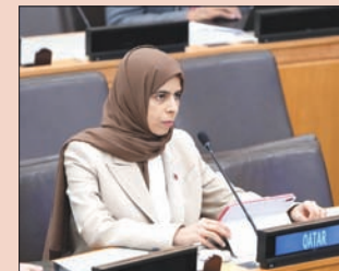
HE Lolwah bint Rashid AIKhatir addressing the meeting.

Addressing the meeting, HE AIKhatir announced Qatar's further $100mn pledge as part of its response to the humanitarian crisis in the Gaza Strip, including backing UNRWA. She called for a unified international community stance in support of UNRWA as a key humanitarian assistance provider in Gaza amid adverse systematic measures by the Israeli government.