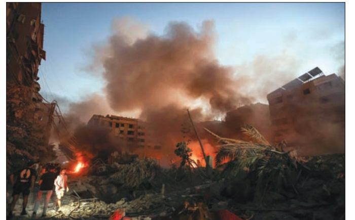
Smoke rises from the smouldering rubble at the scene of Israeli air strikes in the Haret Hreik neighbourhood of Beirut's southern suburbs yesterday.

While yesterday's strikes on south Beirut were not this week's first, they were by far the fiercest.