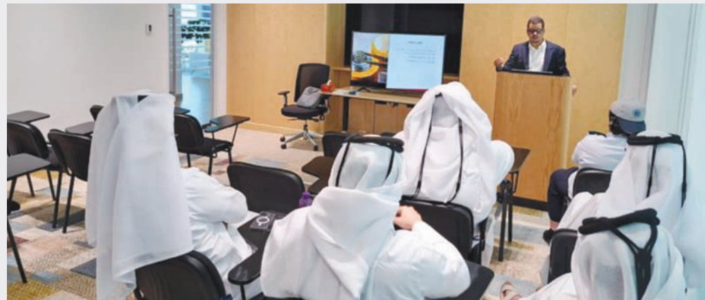
The Ministry of Environment and Climate Change organised a training course for the General Authority of Customs (GAC) employees on the basics of protection against radiation, and radiation-emitting devices. The Radiation Protection Department presented the course, which focused on the raising the capabilities of GAC employees by enhancing their awareness about the proper and safe methods of dealing with radioactive materials. The course also introduced them to such materials and how to deal with them safely.