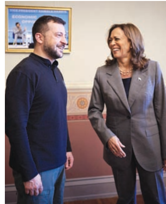
Harris with Zelensky at the Eisenhower Executive Office Building on the White House campus during their meeting on Thursday.

The meeting initially looked like it would be scrapped after Zelensky told New Yorker magazine in an interview that Trump "doesn't really know how to stop the war" and that his running mate JD Vance is "too radical".