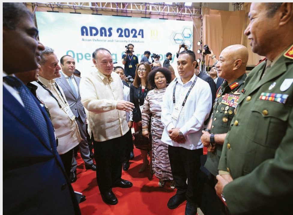
Philippines' Secretary of National Defence Gilberto Teodoro (centre left) talks to visiting foreign military officers at the Asian Defence and Security Exhibition (ADAS) in Manila.