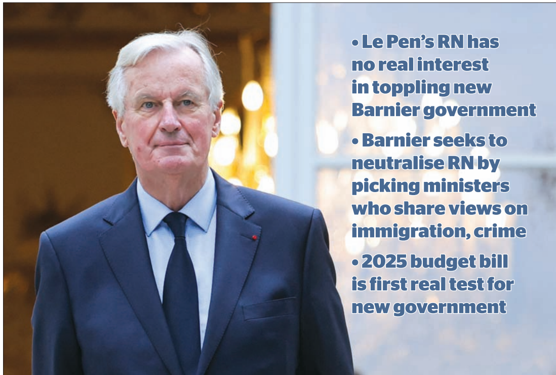
French Prime Minister Michel Barnier walks following a government seminar at the Hotel de Matignon in Paris yesterday.

“They want to calmly prepare to govern,” he said. The upcoming graft trial “will prevent Marine Le Pen from accelerating the