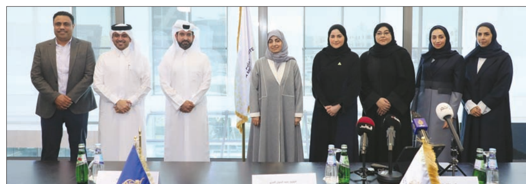
AJMI and Akhlaquna officials at the partnership announcement ceremony.