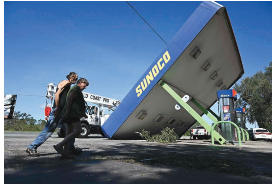
A gas station is seen after Hurricane Helene made landfall in Perry, Florida.