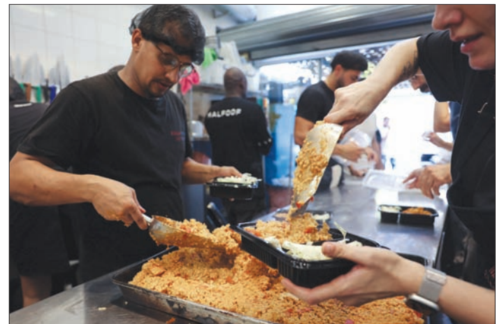
Volunteers at non-profit organisation 'Nation Station', prepare meals to be distributed for people who were displaced due to ongoing hostilities between Hezbollah and Israeli forces, in Beirut, Lebanon.

When the Israeli strikes across Lebanon intensified on Monday, forcing around 40,000 into shelters within days, the volunteers cooked more food without any funding, distributing it as an