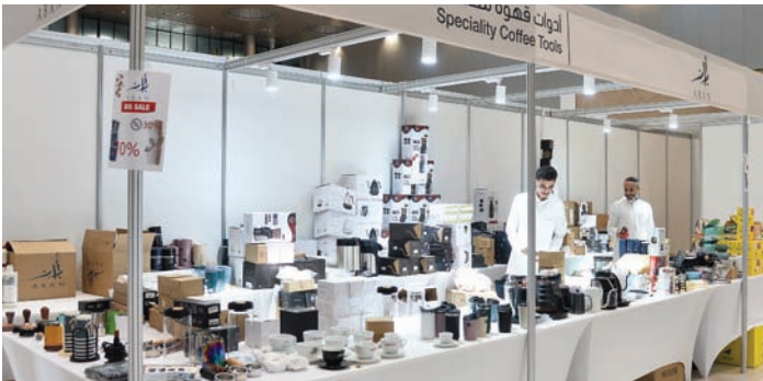
Several companies displaying their products at the exhibition.