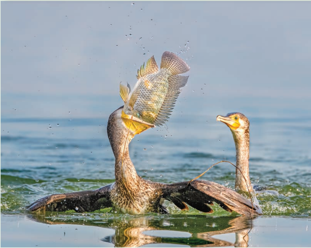
First prize-winning entry.