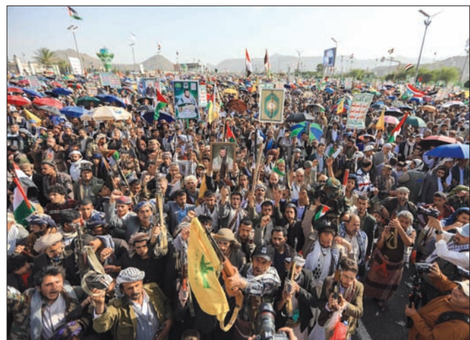
Yemenis lift anti-Israel and US placards as well as yellow flags of Lebanon's Hezbollah movement during a rally held in the Houthi-controlled capital Sanaa, yesterday, in protest against Israel's attacks on Lebanon and Gaza.