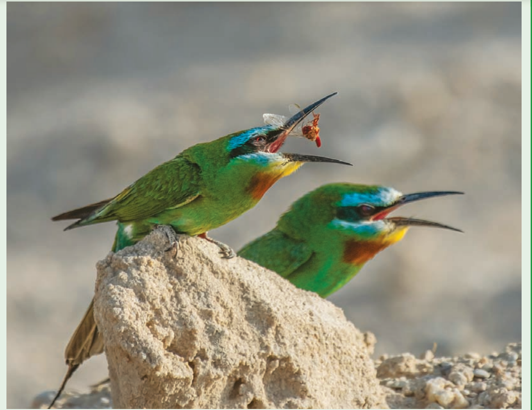
Second prize-winning entry.