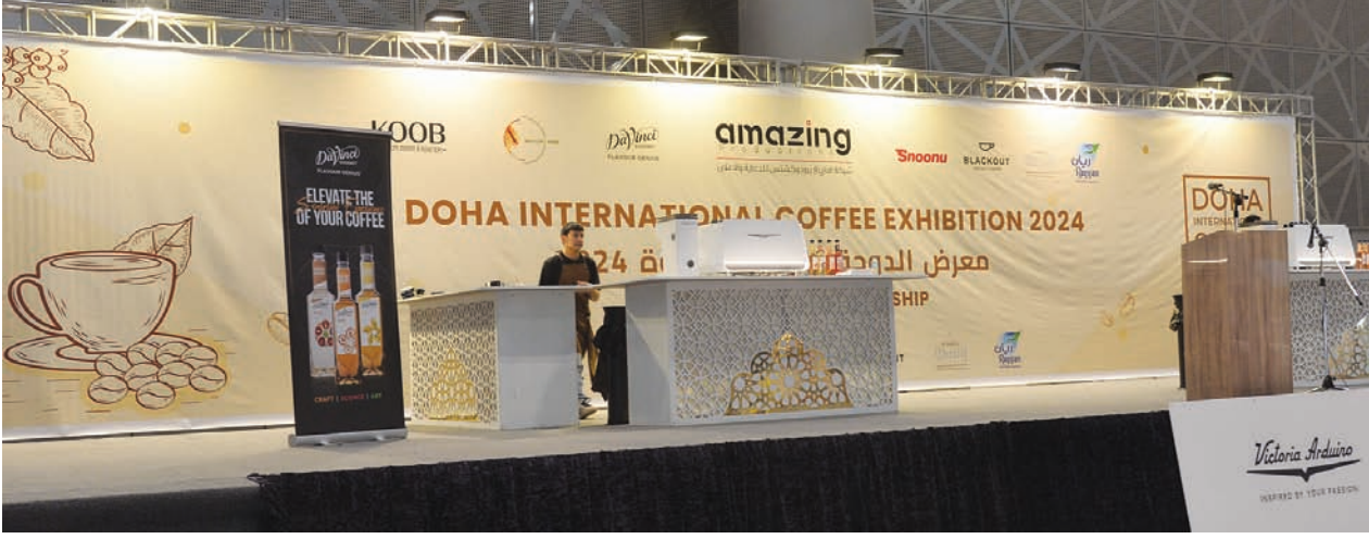
A significant draw for attendees was the barista competitions.