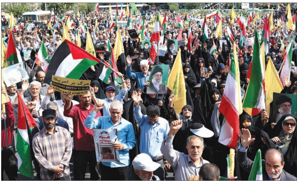
Iranians raise their national flag as well as Palestinian and Lebanon's Hezbollah flags during an anti-Israel protest in Tehran, yesterday.