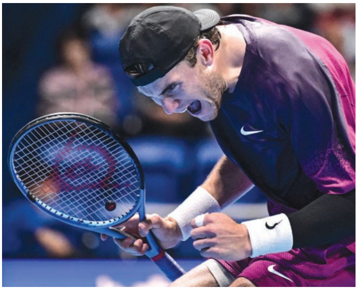
Britain's Jack Draper reacts after winning a point against Poland's Hubert Hurkacz at the Japan Open in Tokyo.