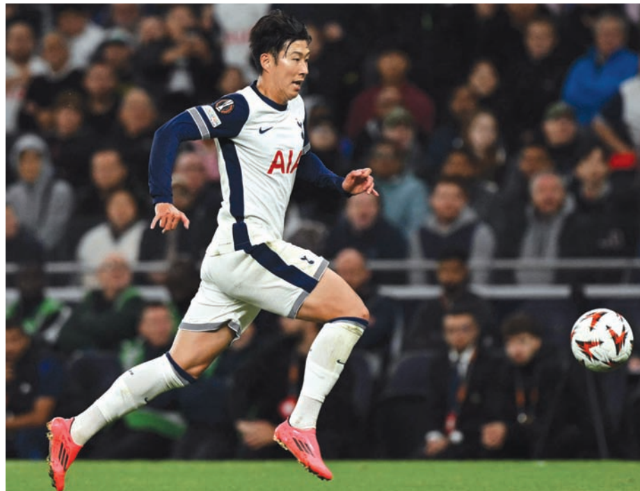
Tottenham Hotspur's Son Heung-min limped off with a hamstring injury in the 71st minute of Thursday's 3-0 win against Qarabag in the Europa League.

Postecoglou made it clear he wants the 32-year-old to stay, with Son into his 10th season at the club he joined from Bayer Leverkusen in 2015. "I don't always have the final say but certainly I like to think my input is significant on it," he said. "I think it is part of a broader discussion around Sonny but the way he is performing and leading the club at the moment, I certainly want him to stick around for a while."