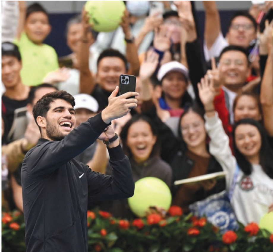
Spain's Carlos Alcaraz takes photos with fans after winning against France's Giovanni Mpetshi Perricard at the China Open in Beijing yesterday.

Zhang, who has won two Grand Slam doubles titles, made it successive victories by dismantling the American sixth seed Navarro in front of her joyous home crowd. Zhang, a former top 25 player who has been plagued by injury, faces Belgium's Greet Minnen next. "Another great win for my career because eve-