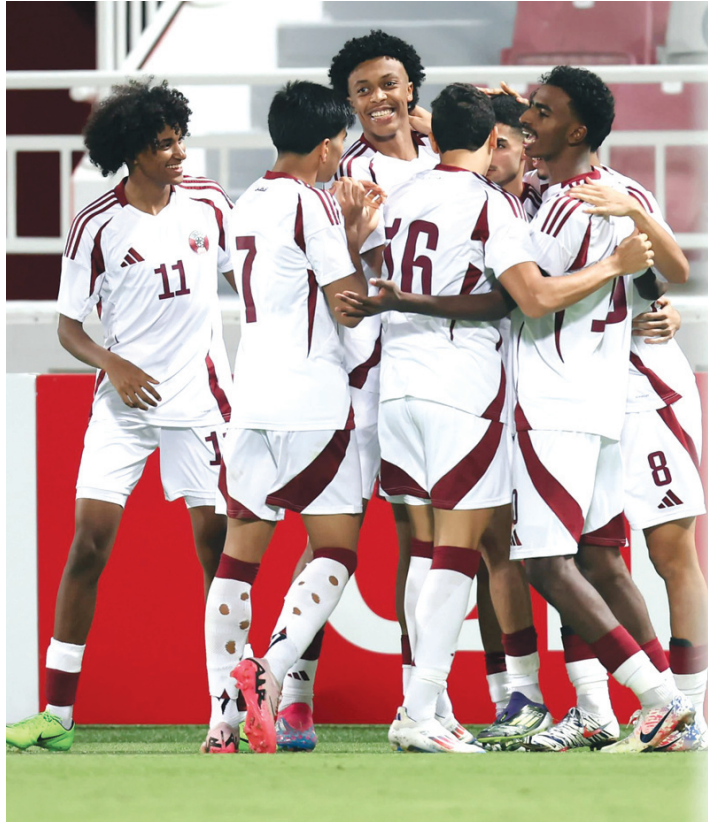
Qatar players celebrate a goal against Hong Kong in their AFC U20 Asian Cup qualifying match at Abdullah Bin Khalifa Stadium yesterday. Qatar won 2-0 for their second successive victory in the qualifiers. Right: Action from the Qatar vs Hong Kong match.

3-0 to Qatar, needed the points but soon had to concede to Jordan's superiority with the West