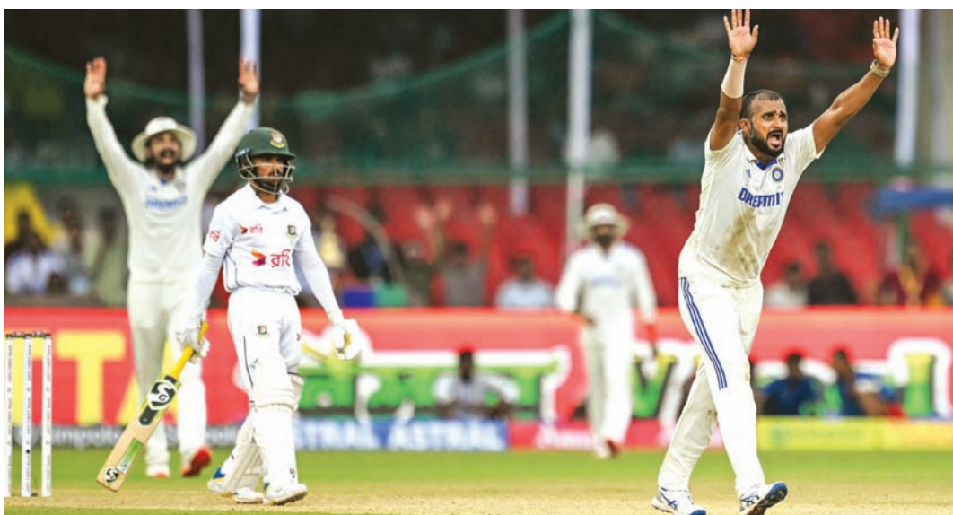
India's Akash Deep (right) appeals for a leg before wicket decision against Bangladesh's Mominul Haque during the first day of the second Test at the Green Park Cricket Stadium in Kanpur yesterday.

BRIEF SCORES (Day 1) Bangladesh 107 for 3 (Mominul 40 not out, Shanto 31, Akash Deep 2-34) vs India (yet to bat)