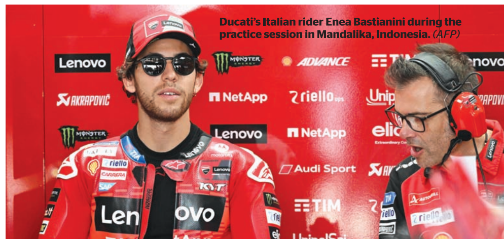
Ducati's Italian rider Enea Bastianini during the practice session in Mandalika, Indonesia.

The top 10 fastest practice times book their tickets for today's second qualifying session, which shapes the first four rows of the grid. This group are then joined by the two fastest riders from the first qualifying session. Qualifying shapes the grid for both the sprint race today and the main event GP tomorrow afternoon, with a maximum of 37 points available.