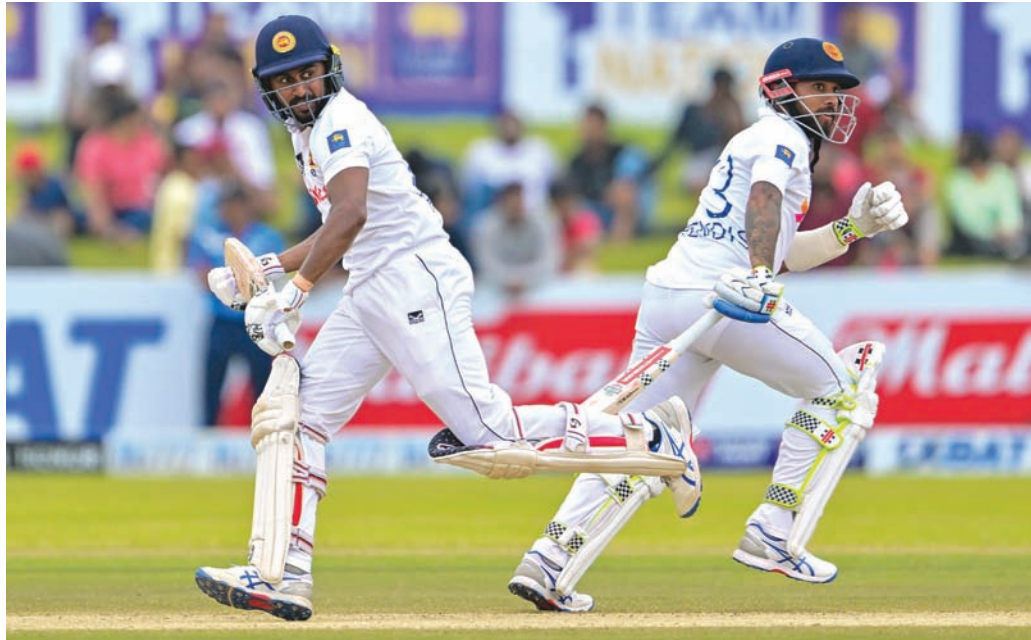
Sri Lanka's Kamindu Mendis (left) and Kusal Mendis run between the wickets during the second day of the second Test against New Zealand at the Galle International Cricket Stadium in Galle yesterday.

Kamindu, a 25-year-old Galle native, made an unbeaten 182 before the declaration alongside Kusal on 106.