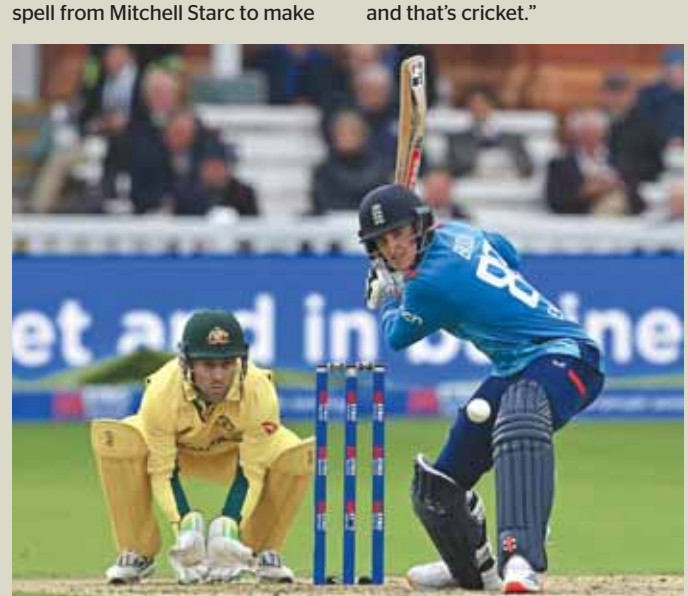
England's Harry Brook plays a shot for four runs during the fourth One Day International against Australia at Lord's in London on Friday. England won by 186 runs.