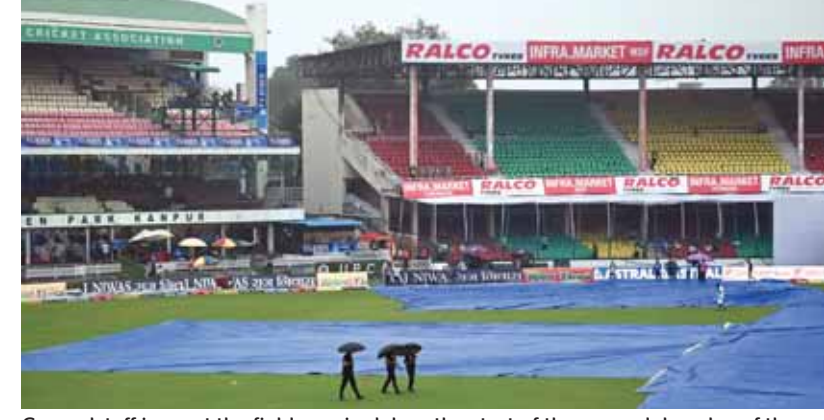
Groundstaff inspect the field as rain delays the start of the second day play of the second Test between India and Bangladesh at the Green Park Cricket Stadium in Kanpur yesterday.

India, who won the opening Test match in Chennai by 280 runs, need a draw to register their record-extending 18th consecutive Test series victory on home soil.