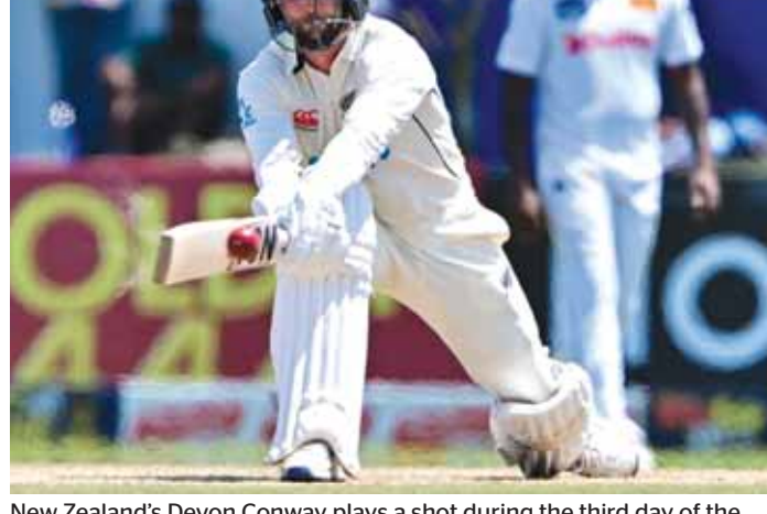
New Zealand's Devon Conway plays a shot during the third day of the second Test in Galle yesterday.

get to three figures. Jayasuriya will need to dismiss all five remaining New Zealand batsmen to equal the record for fastest bowler to 100 Test wickets, held since 1896 by England's George Lohmann who reached the milestone in his 16th Test.