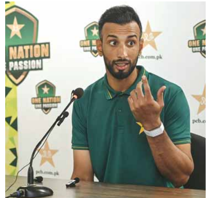
Pakistan's captain Shan Masood speaks during a press conference at the National Stadium in Karachi yesterday.

England swept the series 3-0 when they last visited Pakistan in 2022. "For me, pressure is a thing of privilege because leading your country is a great honour but with it comes responsibility," said Masood, whose captaincy tenure runs until May 2025. "If results are good then I will serve, if not then I will be punished. I don't run away from challenges and this coming series is also very challenging."