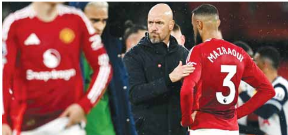
Erik ten Hag's Manchester United were outplayed 0-3 by Tottenham Hotspur on Sunday.

Former Liverpool and Spurs midfielder Jamie Redknapp said United had "no identity". "It gets to a point where you feel for the manager," he said. "He looks completely out of his depth and is struggling to motivate. It was so easy for Tottenham, they were so comfortable, so calm. Man Utd are going backwards, he can't complain any more. They have spent over £600mn (£800mn) and have his defenders in. They are