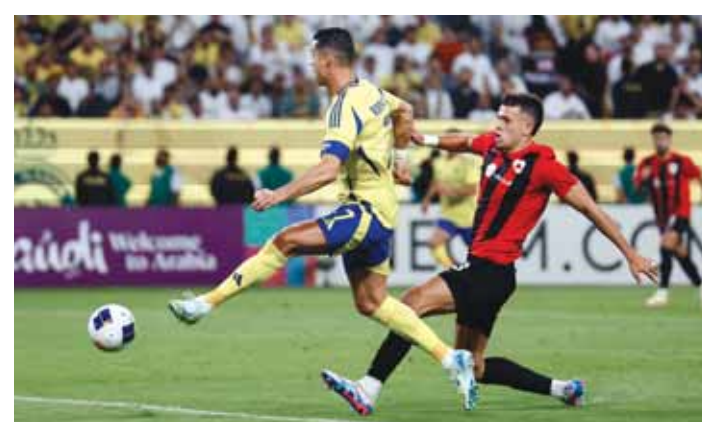
Al Nassr's Cristiano Ronaldo shoots at goal during his team's Asian Champions League, Group B, clash against Qatar's Al Rayyan at Al-Awwal Park, Riyadh, Saudi Arabia, yesterday.