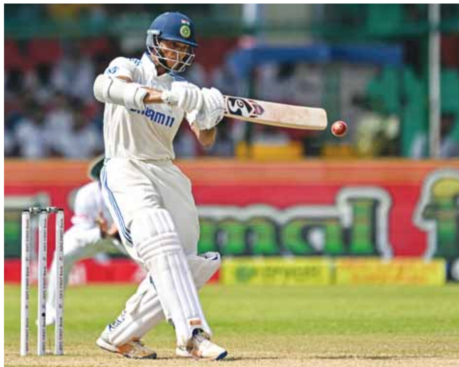
India's Yashasvi Jaiswal plays a pull shot during the fourth day of the second Test against Bangladesh at the Green Park Stadium in Kanpur yesterday.

Bangladesh spinners Shakib Al Hasan and Mehidy Hasan Miraz took four wickets each. "They played to a plan and I was surprised,"