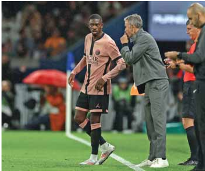
Paris Saint-Germain's Spanish head coach Luis Enrique gives instructions to French forward Ousmane Dembele (left) during the French L1 match against Stade Rennais FC at The Parc des Princes Stadium in Paris on September 27, 2024.

"If someone doesn't comply with the requirements of the team, it means that they are not ready," Luis Enrique told a press