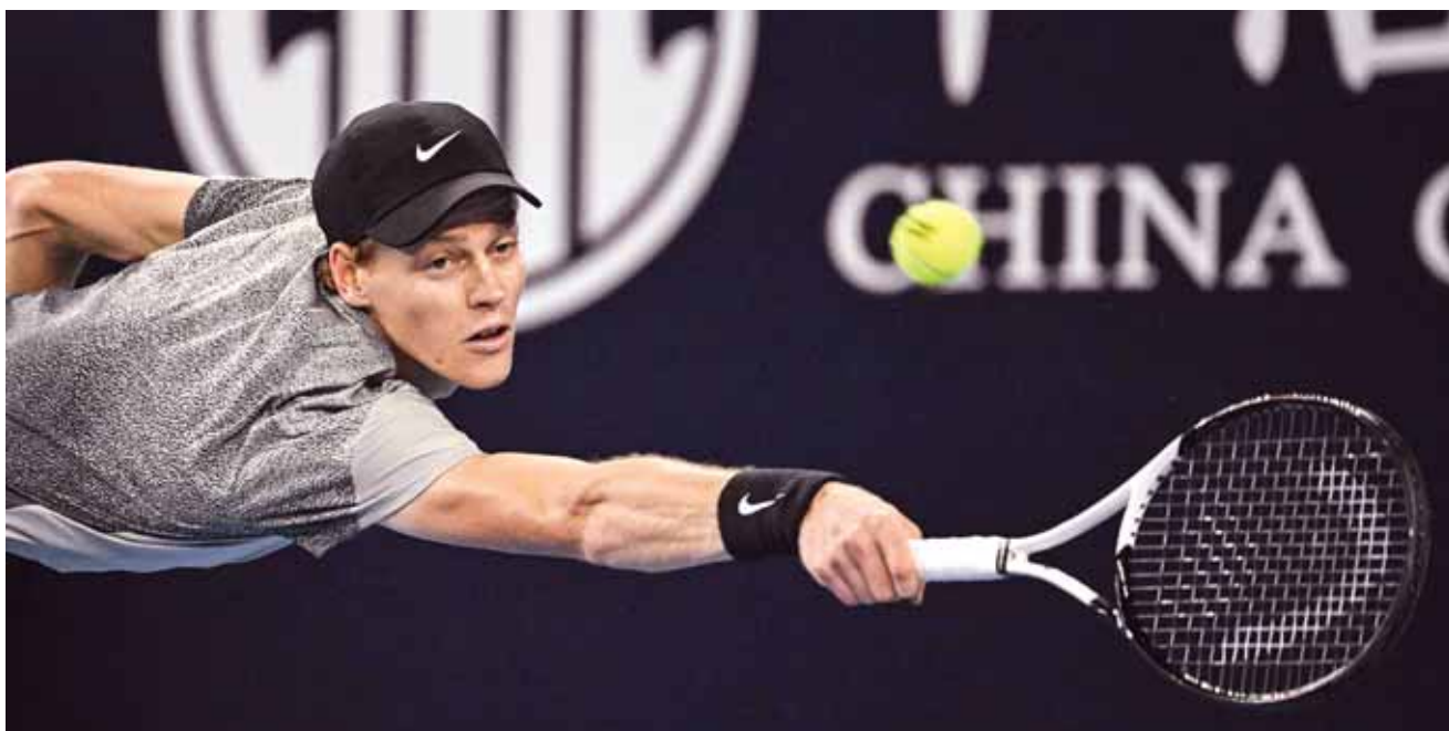
Italy's Jannik Sinner hits a return to Czech Republic's Jiri Lehecka during their quarter-final match at the China Open in Beijing.

Four-time Grand Slam champion Alcaraz plays last year's runner-up Medvedev after