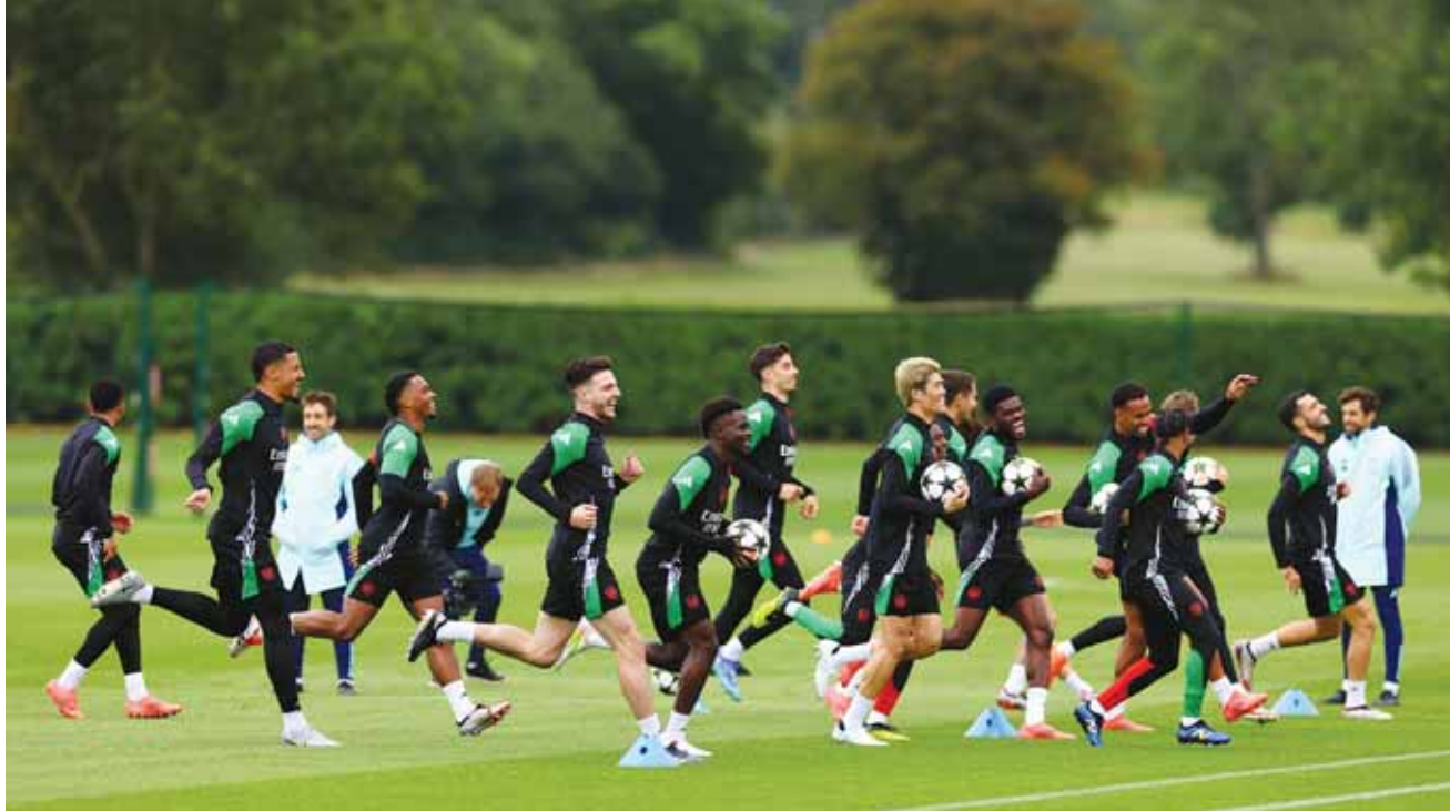
Arsenal players train in London yesterday, on the eve of their Champions League match against PSG.

Barcola is the leading scorer in the French top flight this term with six goals, two of