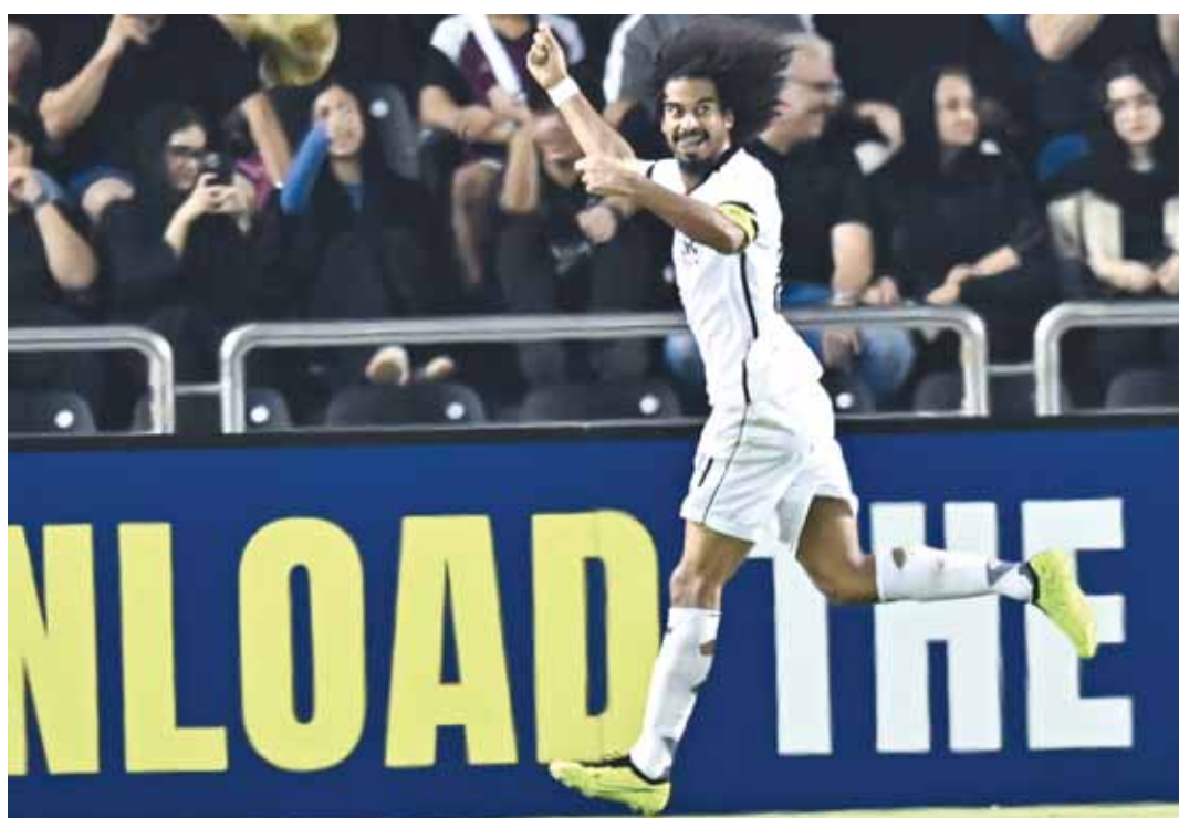
Al Sadd's Akram Afif celebrates scoring his team's second goal in the Asian Champions League, Group B, match against Esteghlal of Iran at Jassim Bin Hamad Stadium in Doha yesterday.

Afif said yesterday: "I want to congratulate Al Sadd fans for the victory. We will try to do well in all the matches and our