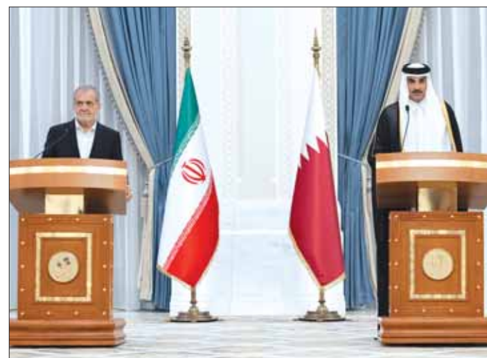
His Highness the Amir and the Iranian president addressing a joint press conference in Doha yesterday.

Hezbollah said it repelled an Israeli infiltration into southern Lebanon yesterday, as Israel reported eight soldiers were killed - its first losses since launching cross-border raids this week. A day after its military said it was conducting "targeted ground raids" in south Lebanon, Israel reported the first death of a soldier in the Israel-Hezbollah war, a toll that later rose to eight dead. Israel bombed Hezbollah's south Beirut stronghold, having dealt a significant blow to the group last week.