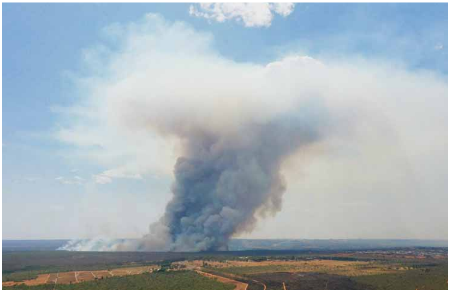
Smoke billows from a forest fire affecting the Brasilia National Park in Brasilia. Brazil is suffering the effects of a multiplication of fires from north to south in the midst of an extreme drought linked to climate change.