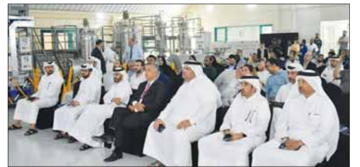
A view of the audience at the event.

mitment to combating climate change through actionable solutions tailored for harsh hot and humid climate encountered in many geographic locations across the world," Alhorr said.