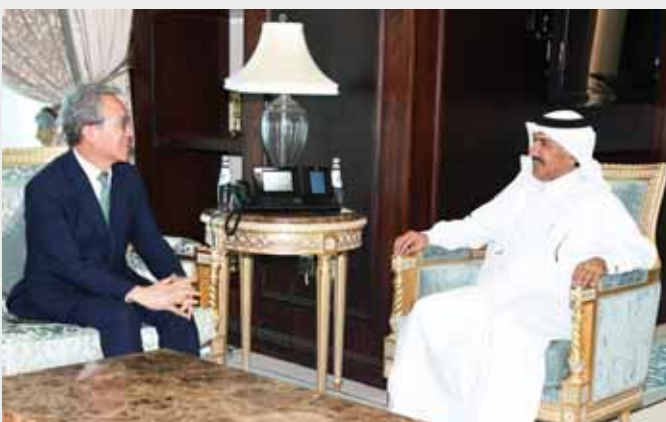
HE the Secretary-General of the Ministry of Foreign Affairs Dr Ahmed bin Hassan al-Hammadi met yesterday with Korean Deputy Minister for Public Diplomacy Hong Seok-in on the sidelines of the third summit of the Asia Co-operation Dialogue (ACD). During the meeting, the two sides discussed relations of bilateral co-operation between the two countries and ways to support and develop them. (QNA)