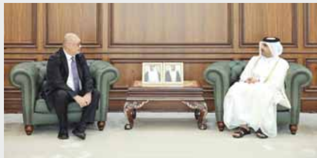
HE the Minister of Culture Sheikh Abdulrahman bin Hamad al-Thani met yesterday with the visiting Minister of Culture, Youth and Sports of the Sultanate of Brunei Darussalam Haji Nazmi Haji Mohamad. During the meeting, the two ministers discussed aspects of cultural co-operation. (QNA)