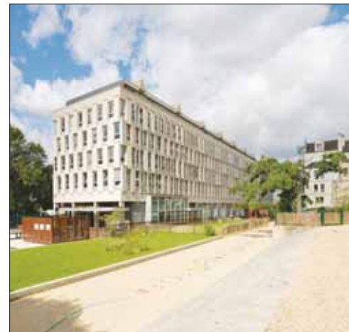
Paris residency building