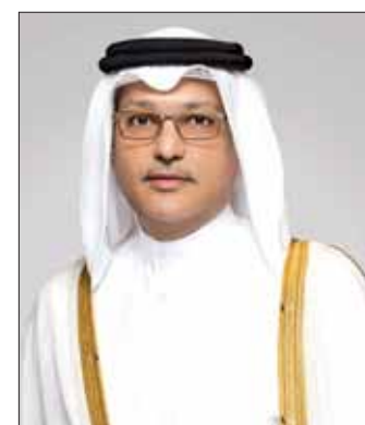
HE the Minister of Communications and Information Technology Mohammed bin Ali al-Mannai.

mobile technology across industries, highlighting innovations in AI, 5G, and digital infrastructure. We invite everyone to engage, explore and witness firsthand how connectivity is shaping the future for the Mena region."