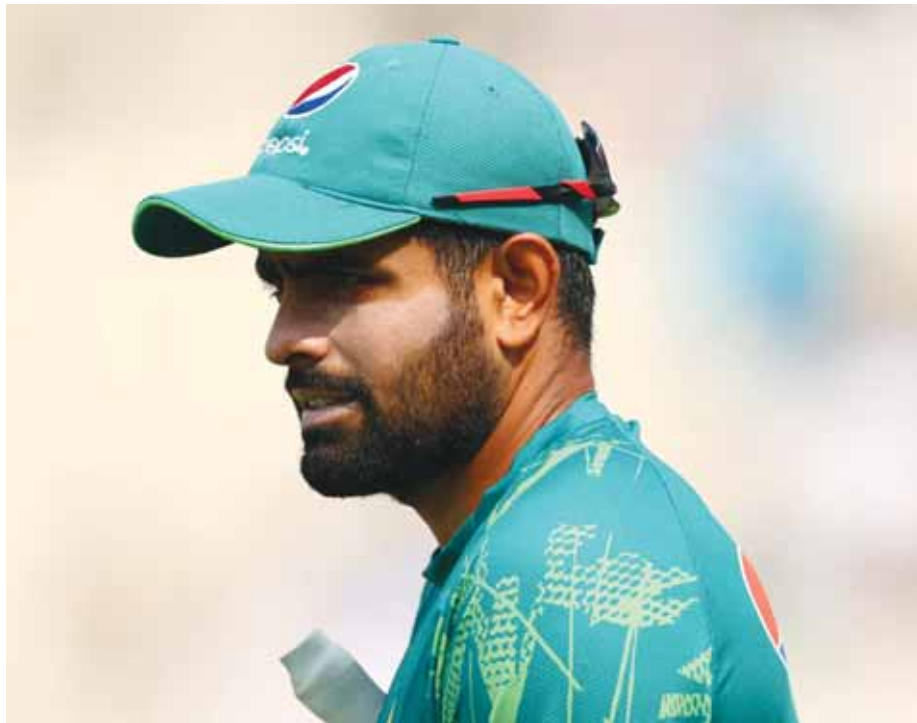
Pakistan's Babar Azam at the ICC Cricket World Cup 2023 in India.

Azam was captain when Pakistan crashed out of the T20 World Cup after a bruising loss to newcomers the United States.