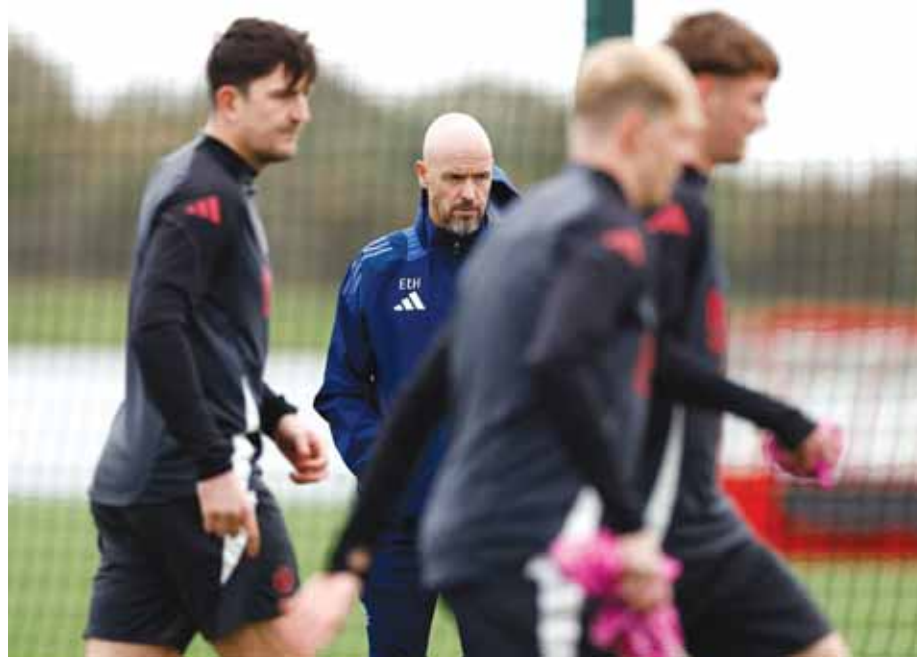
Manchester United manager Erik ten Hag looks on as his players train.

"We made in the summer togetherness, the ownership, the leadership, this agreement, and we are all behind it," added Ten Hag. "We know also what the strategy with young players in a transition period was and we know then also in which process you can come. This can hap-