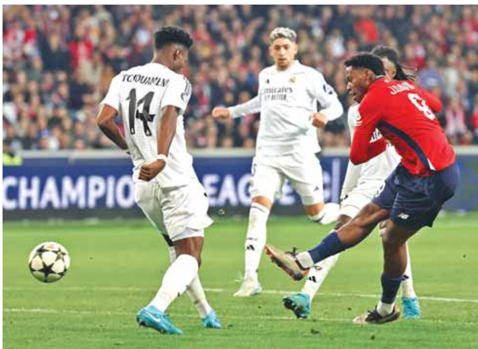
Lille's Jonathan David scores against Real Madrid during the UEFA Champions League group stage match at the Pierre Mauroy Stadium in Villeneuve-d'Ascq, northern France.

A mistake by Atletico's defence helped Akturkoglu open the scoring in the 13th minute and another error ended with a penalty which Di Maria converted. Bah extended Benfica's