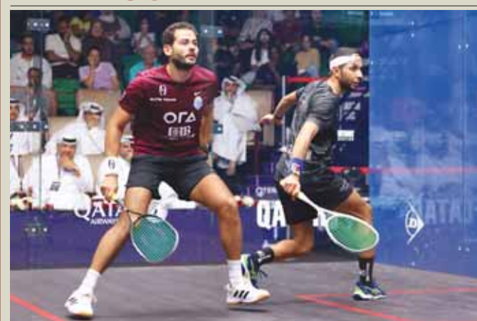
Egypt's Karim Abdel Gawad (left) in action against Qatar's Abdulla al-Tamimi at the QTerminals Qatar Classic.

DOHA: Egypt's former World No 1 Karim Abdel Gawad beat Qatari No 1 Abdulla al-Tamimi 11-7, 7-11, 11-8, 11-7 to book his spot in the quarter-finals of the QTerminals Qatar Classic.