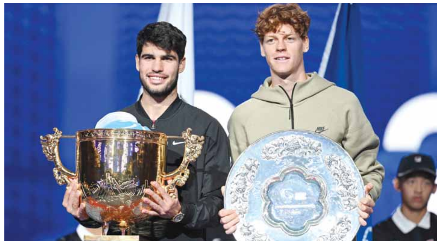
Spain's Carlos Alcaraz (left) celebrates with the title trophy after winning the final against Italy's Jannik Sinner at the China Open in Beijing yesterday.