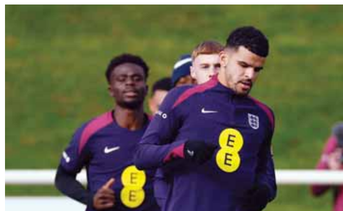
England's Dominic Solanke, Cole Palmer and Bukayo Saka during training at George's Park, Burton upon Trent, yesterday.

you're just playing football you obviously just want to make it but representing your country is a whole other level," he told a pre-match press conference.