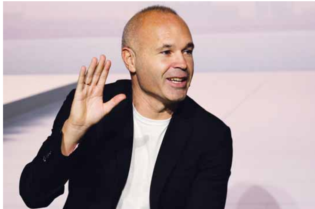
Spanish footballer Andres Iniesta gestures as he announces his retirement aged 40 during an event to celebrate his career at the America's Cup Experience venue in Barcelona yesterday.

Iniesta formed a devastating midfield with Xavi Hernandez and Sergio Busquets, becoming the standard-bearers of the "tiki-