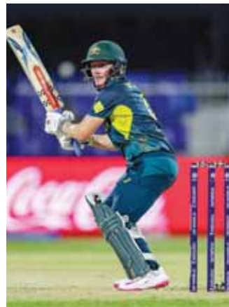
Australia's Beth Mooney in action against New Zealand during their T20 Women's World Cup match in Sharjah, UAE, yesterday. Mooney scored 40 off 32 deliveries as Australia won by 60 runs.

Australia continued their march towards a seventh Women's T20 World Cup title with a crushing 60-run win over New Zealand in their Group A match in Sharjah yesterday. After posting a tournament high 148-8 in their 20 overs with Beth Mooney top-scoring with 40, Australia stifled the New Zealand batters who folded for just 88 in 19.2 overs. Quick bowler Megan Schutt was the pick of the Australian bowlers, her return of 3-3 in 3.2 overs netting her the Player of the Match award. "We could have been smarter with the bat at the end, but we came out really well with the ball and I'm really happy with that," said Australia skipper Alyssa Healy. "Megan Schutt has been wonderful but I thought the whole attack tonight was unbelievable." Holders Australia, who have won six of the eight previous tournaments, top Group A while New Zealand slip to third, behind Pakistan but still above India on net run rate. After winning the toss and choosing to bat first, Healy gave her side the perfect start, smear-