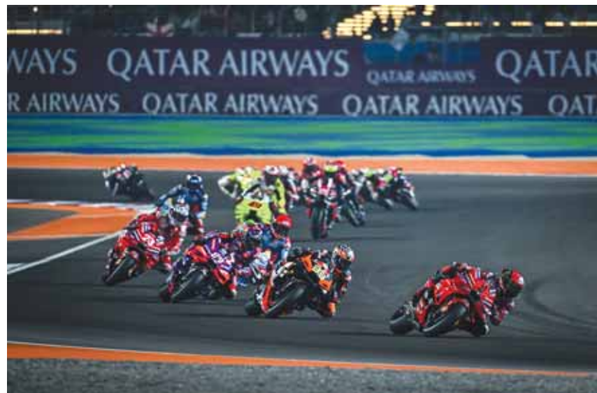
The MotoGP Qatar Grand Prix will showcase the world's top riders competing on the 5.4-kilometre Lusail International Circuit track.

For corporate and group requests, please