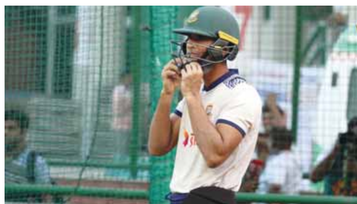
Former Bangladesh captain Mahmudullah Riyad is seen during a training session in New Delhi yesterday. Mahmudullah announced his retirement from T20I cricket.

Former Bangladesh captain Mahmudullah Riyad said yesterday his remaining two T20 matches in India will be his last international appearance in the format, vowing to play out with a "good show". The 38-year-old Mahmudullah, who quit Tests in 2021, is set to play his 140th T20 match for Bangladesh in the second game in New Delhi today. The tourists need to win in the Indian capital to keep the three-match series alive, after they lost the opener by seven wickets in Gwalior. "I am retiring from T20 cricket after the last game of this series," Mahmudullah told reporters. The final match of the series will be in Hyderabad on Saturday. "I was pre-decided before coming here. I had a chat with my family and with my coach and captain," Mahmudullah added. "It is the right time to move on from this format for me and the team as well and concentrate on the one-day game." Mahmudullah has been Bangladesh's warhorse after he made his international debut in 2007 in a one-day international against Sri Lanka in Colombo.