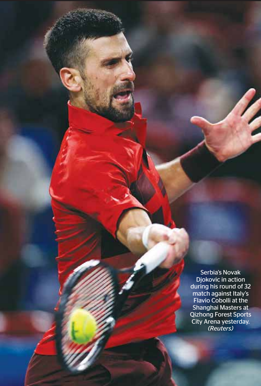
Serbia's Novak Djokovic in action during his round of 32 match against Italy's Flavio Cobolli at the Shanghai Masters at Qizhong Forest Sports City Arena yesterday.