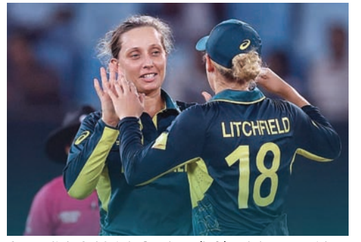
Australia's Ashleigh Gardner (left) celebrates with teammate Phoebe Litchfield against Pakistan in Dubai yesterday.

Wicketkeeper-batsman Muneeba Ali took charge. Invited to bat first, Pakistan lost regular wickets