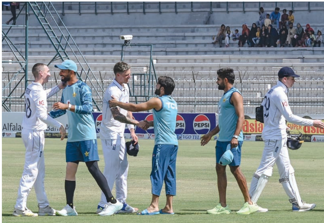
Players shake hands at the end of the first Test between Pakistan and England at the Multan Cricket Stadium yesterday.

England's pace bowlers peppered the two overnight batsmen