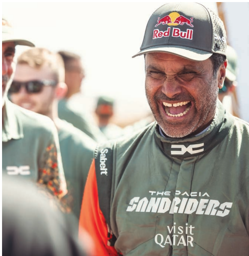
Nasser al-Attiah has a hearty laugh after winning his seventh Rallye du Maroc and his third consecutive FIA World Rally-Raid Championship (W2RC) title.

Al-Attiah's talent was tested to the full in Morocco, with Guillaume de Mevius, showing strength in taking the helm of the X-Raid Mini JCW. Both teams made Toyota race to keep up the pace, with al-Rajhi securing a respectable third place in the rally. The Saudi driver also took second place