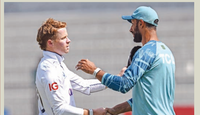
England's captain Ollie Pope shakes hands with Pakistan's skipper Shan Masood (right) at the Multan Cricket Stadium.

the trot and they have now gone 11 matches without victory on home soil since beating South Africa in 2021. Masood, who replaced Babar Azam as Test skipper in November and has lost all six of his matches at the helm, said he would not shy away from responsibility in the wake of the big defeat. "What hurts is that we're not getting the results that Pakistan deserves. "We're all trying hard. We're going to give it our all, and we're going to try and turn this around," he said. "We have to get this right as a squad and as a cricket playing nation." Pakistan will have a chance to set the record straight when the teams meet in the second of three games starting on Tuesday and Masood welcomed the quick turnaround. "The beauty of the game is it always gives you another chance. Life gives you another chance," he added. "The quick turnaround might be quite beneficial for us and we're all looking forward to it."