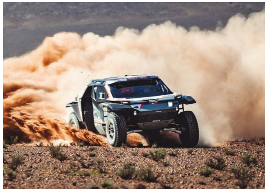
Al-Attiah won the shortened opening stage on Monday and never looked back, the Qatari star not encountering a single mechanical fault or puncture on his way to victory.