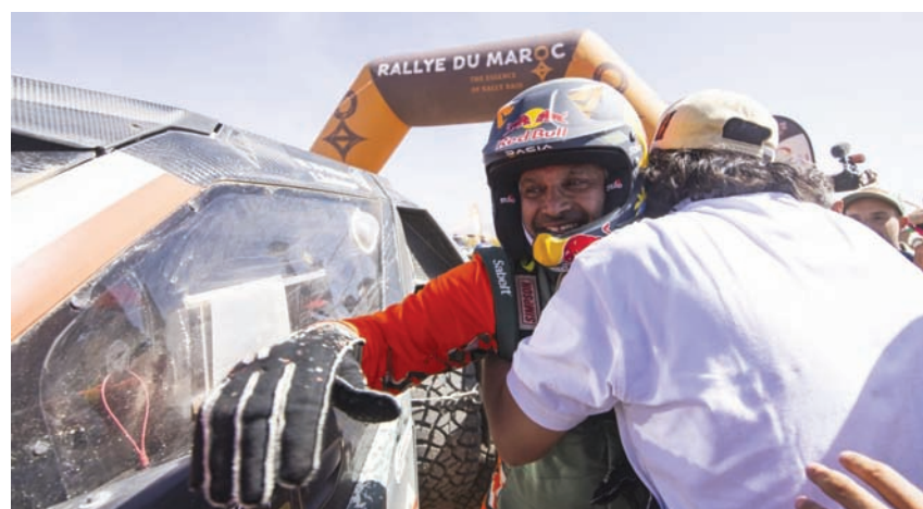
Al-Attiah won the shortened opening stage on Monday and never looked back, the Qatari star not encountering a single mechanical fault or puncture on his way to victory.