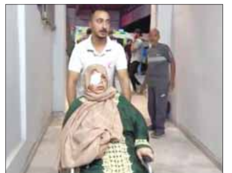
A member of the Palestine Red Crescent Society assists a wounded Palestinian in a wheelchair, during the evacuation of people from Kamal Adwan Hospital to Al-Shifa Hospital in Gaza City.

over half the territory's 2.3mn people, was bombed to rubble in the first phase of Israel's assault on the territory a year ago.