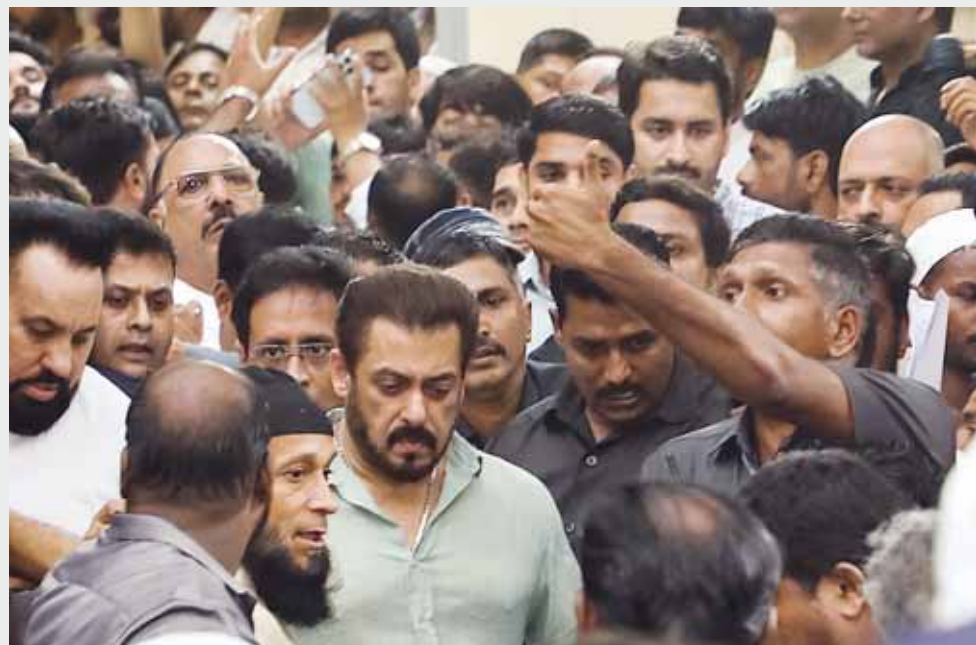
Bollywood actor Salman Khan (front centre) leaves after paying his last respects to the assassinated Indian politician and Nationalist Congress Party (NCP) leader Baba Siddique, in Mumbai, India, yesterday. Baba Siddique, 66, a local lawmaker and former minister in Maharashtra, was shot multiple times in the chest outside his son's office in Mumbai. Two suspected attackers have been arrested and police were searching for another.