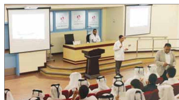
The campaign included a series of interactive educational workshops.

Students were also warned about the marketing tricks used by companies to market new tobacco products, emphasising that these products are not safe alternatives and are no less dangerous than traditional smoking methods. Awareness leaflets were also distributed to students and