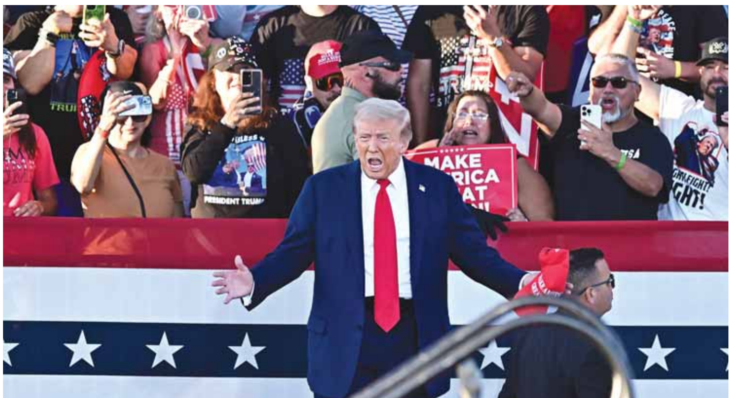
Former US president and Republican presidential candidate Donald Trump gestures as he arrives for a campaign rally at Calhoun Ranch in Coachella, California.

"He's trying to get elected," Laffer said. "He's thinking of what things can I do that would be good politically, and also be good for the economy." – Reuters