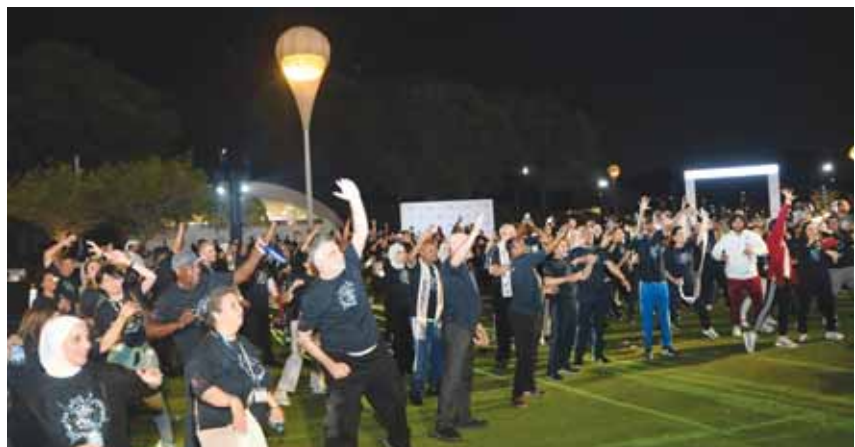
Participants warming up for the walk.

Sports legends played alongside children from Gaza who are recovering following medical care and support in Qatar, in a display of the unifying power of sport.