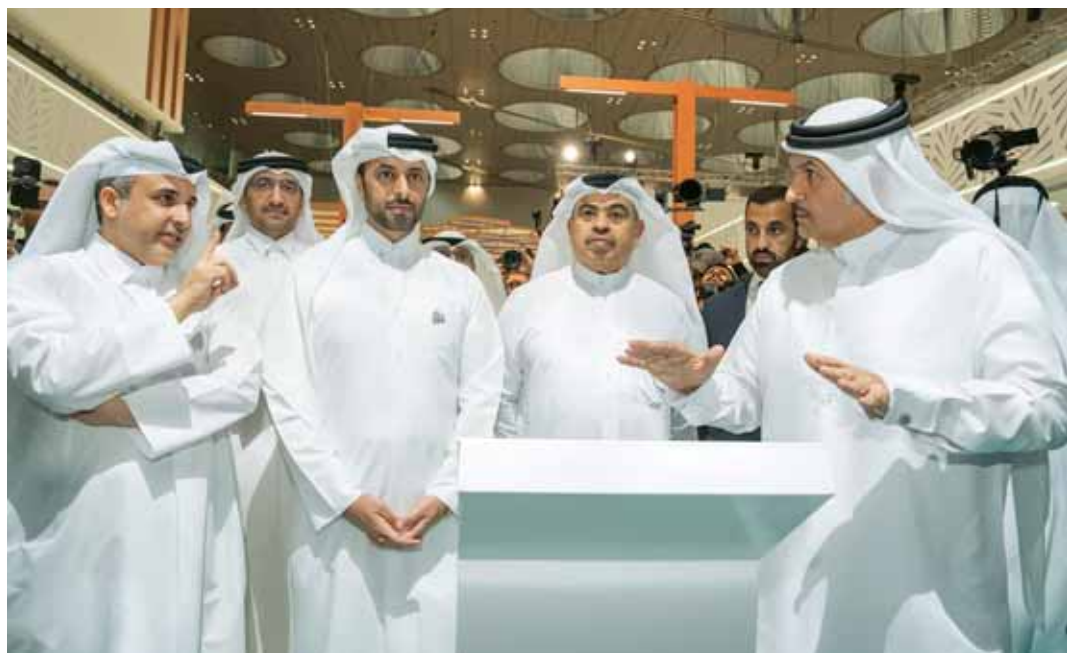
HE the Minister of Municipality Abdullah bin Hamad bin Abdullah al-Attiyah, who officially inaugurated Cityscape Qatar, listens to a briefing at the UDC pavilion yesterday as other dignitaries look on.