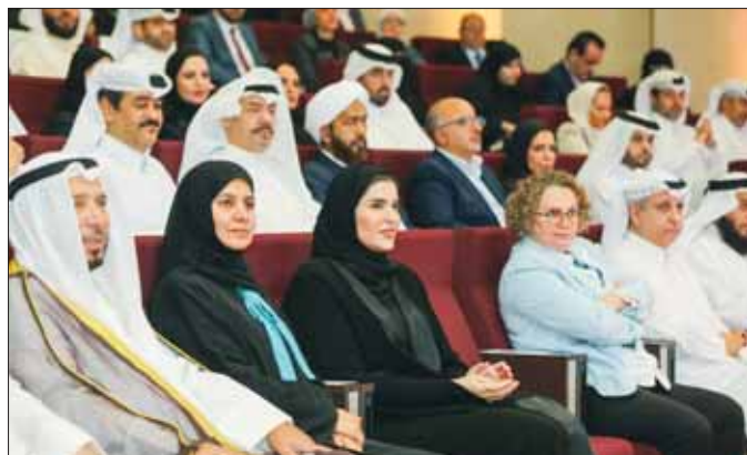
Dignitaries at the event.