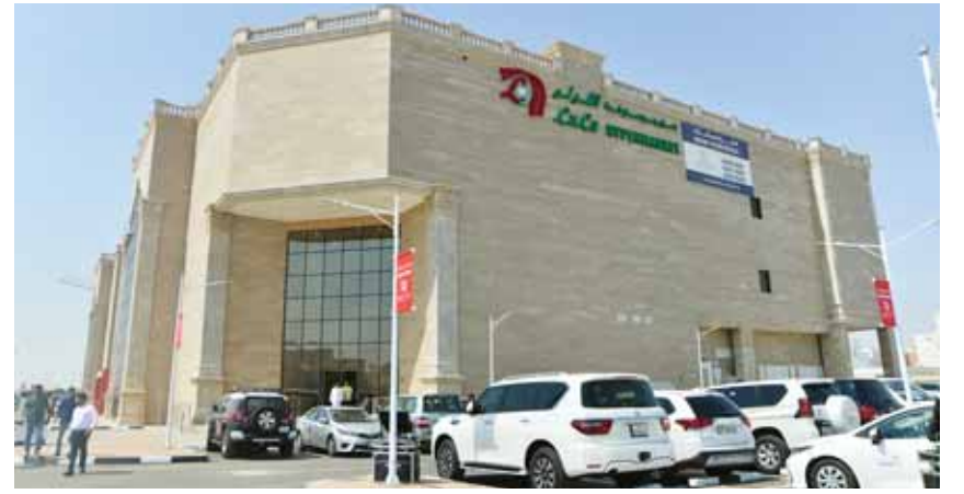
LuLu Group's 24th outlet in Qatar has opened at North Plaza Mall in Umm Al Amad.