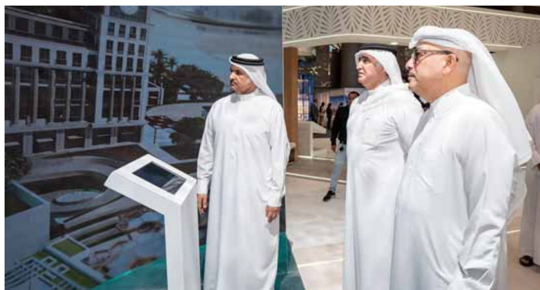
Designed with cutting-edge technology and breathtaking visual elements, the pavilion is a testament to UDC's commitment to excellence, luxury, and forward-thinking development.

ing 586 units and a 1,442-capacity parking facility, Crystal Residence is a family-friendly community designed to offer the perfect balance of privacy and modern lifestyle, making it an attractive investment in Qatar's real estate landscape.