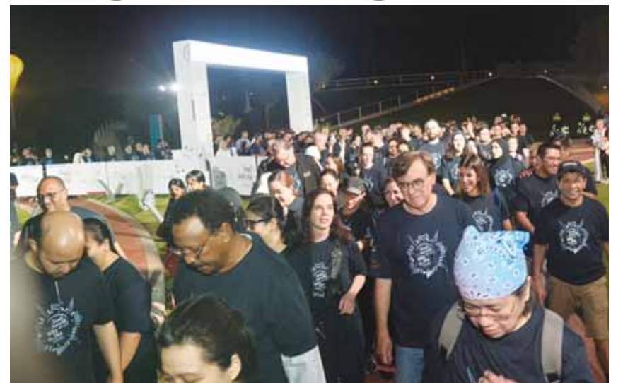
Large number of people took part in the walk.

walking the talk towards an active life for all," the official added. "Together we can break down barriers and create a culture in which physical activity is a fundamental part of everyday life."