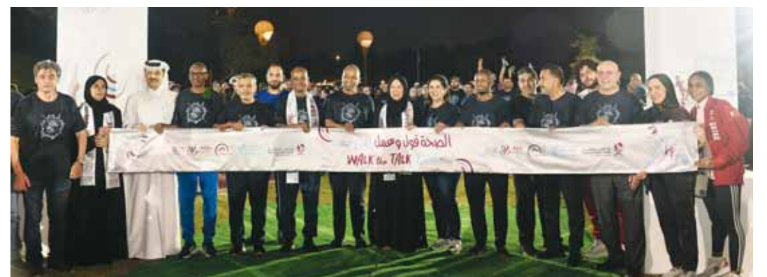
Dignitaries at the start of the walk.