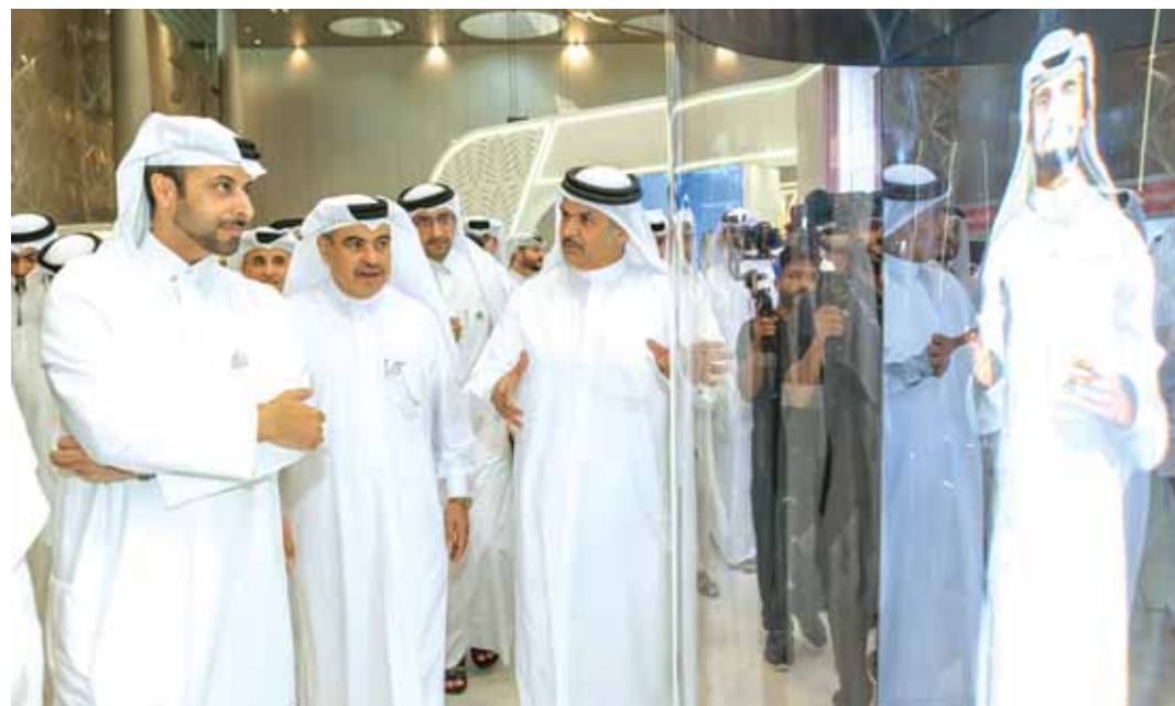
Visitors are given a glimpse into the future of luxury and sustainable living on Gewan Island, making UDC's pavilion a must-see destination at the exhibition.