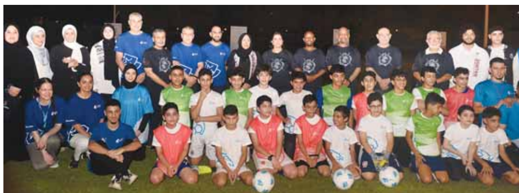
Dignitaries with the football team members.