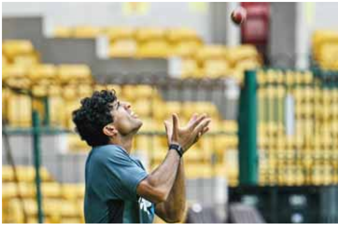
New Zealand's Rachin Ravindra attends a practice session ahead of their first Test against India at the M Chinnaswamy Stadium in Bengaluru yesterday. The first Test starts tomorrow.

In the IPL, he scored 222 runs for five-time winners Chennai, at a strike-rate of over 160. Having experienced cricket in India,