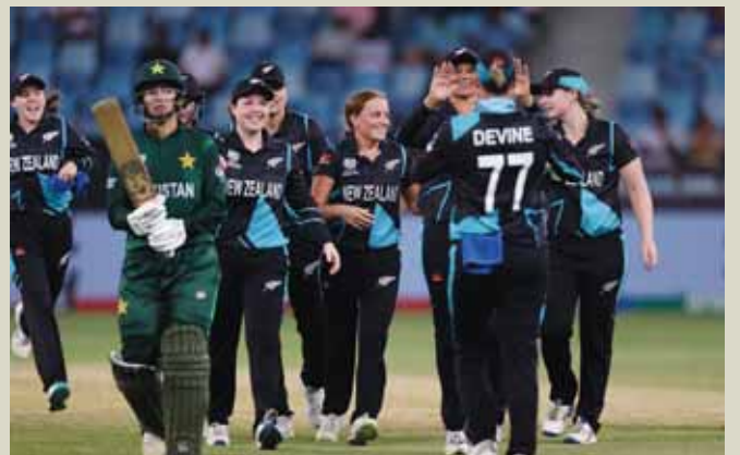
New Zealand team celebrate beating Pakistan in their ICC T20 Women's World Cup match in Dubai yesterday.

Dubai: Some fine bowling from Amelia Kerr and Eden Carson propelled New Zealand into the semi-finals of the Women's T20 World Cup with a 54-run thrashing of Pakistan in their last group match yesterday.