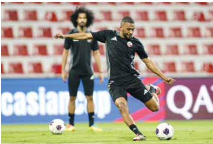
Qatar players during a team training session yesterday.