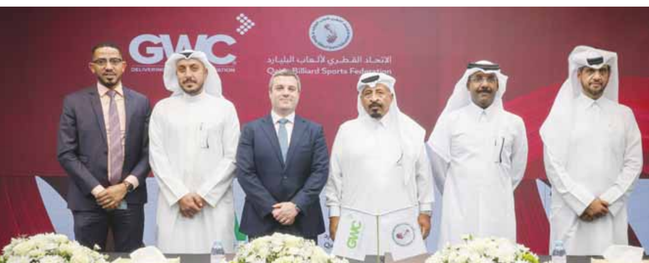
Gulf Warehousing Company and Qatar Billiard Sports Federation officials pose for a picture.

He added: "GWC is dedicated to enhancing Qatar's global sports presence by