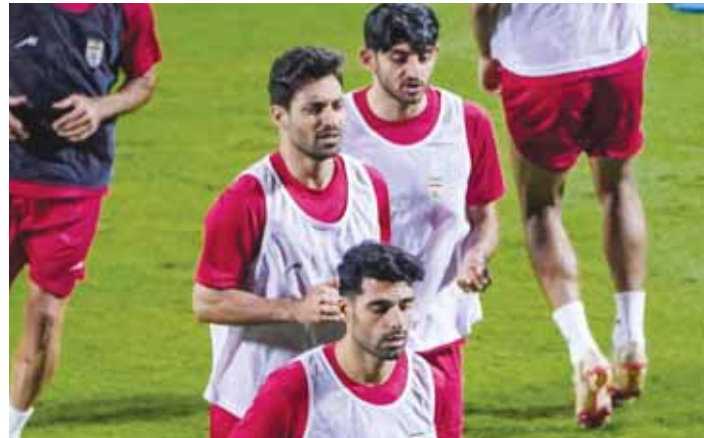
Iran players during a team training session at the Rashid Stadium in Dubai on the eve of their match against Qatar today.

"Akram Afif's teammates must avoid making mistakes against Iran who have great potential as individuals as most of their players are seen in action in European leagues," the former Qatar international, who represented the national side from 1984-2000, added.