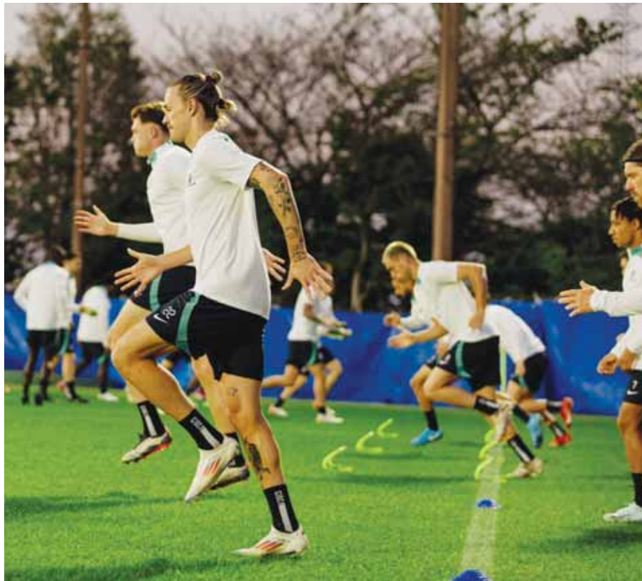
Australian players train in Saitama, Japan, yesterday, ahead of their World Cup qualifiers.