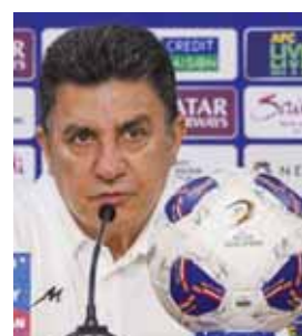
Iran coach Amir Ghalenoei addresses a news conference in Dubai yesterday.