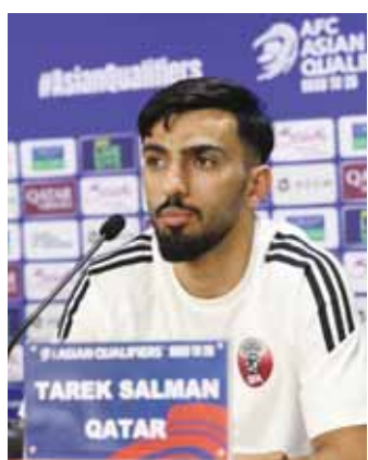
Qatar defender Tariq Salman takes questions during a news conference in Dubai yesterday.