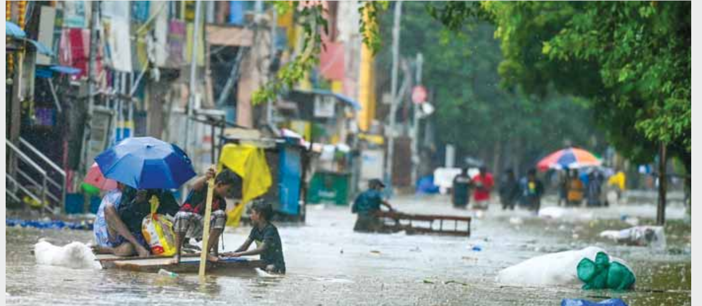
People wade through a flooded street amid heavy rainfall in Chennai, India, yesterday.