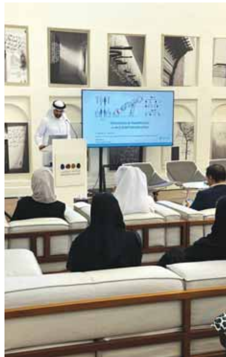
The event offered insights into the transformative potential of personalised care.

In addition, attendees had the opportunity to visit information booths and learn more about ongoing research projects and their implications for future healthcare models.