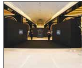
The Watches & Jewellery department embodies the store's vision of providing an unparalleled shopping experience

VIP room offers an intimate space for distinguished guests to explore collections with unparalleled exclusivity.