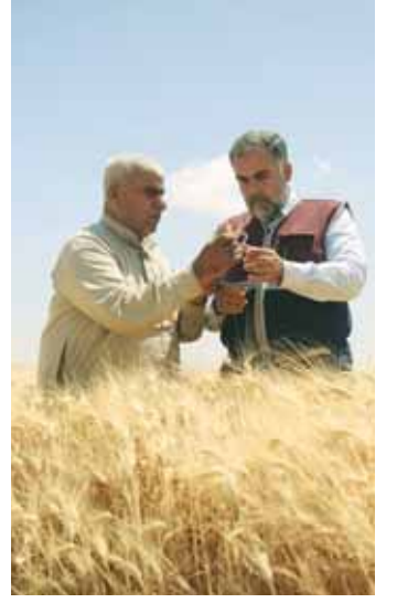
Right to Food for a Better Life and a Better Future is the theme for the World Food Day.

He reiterated that Qatar will continue its vital role in the international arena to support peace and stability and contribute to the peaceful settlement of conflicts and disputes by enhancing the educational process, strengthening international co-operation and solidarity in multilateral efforts and enhancing co-operation and dialogue to confront global challenges. - QNA