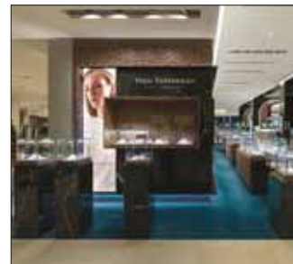
The newly designed section was conceived by the internationally acclaimed Swiss firm, Dobas Interior Design and Architecture