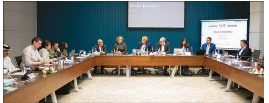
The event was organised in collaboration with the Journalism Masters Programme.

A total of 30 students from journalism and media programmes from various educational institutions in Qatar participated in the workshop.