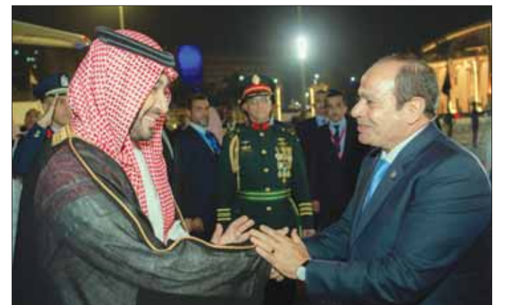
shows Saudi Crown Prince Mohammed bin Salman bidding farewell to Egypt's President Abdel Fattah al-Sisi at the end of his visit to Cairo, yesterday.

Yesterday's presidency statement said the two leaders reviewed efforts to develop economic partnership between Cairo and Riyadh particularly in investment, trade