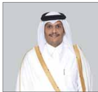
HE Sheikh Mohammed bin Abdulrahman bin Jassim al-Thani

Speaking to Qatar TV yesterday on the occasion of His Highness the Amir Sheikh Tamim bin Hamad al-Thani's address during the inauguration of the 53rd annual session of the Shura