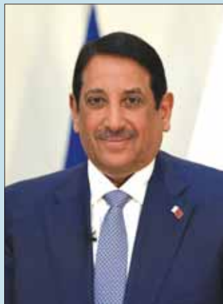
Abdulaziz bin Ahmed al-Jehani al-Malki

The summit will address many pressing issues on the regional and international scene, including security and stability in the Middle East and geopolitical conflicts, as well as trade, investment, combating climate change, industry, energy