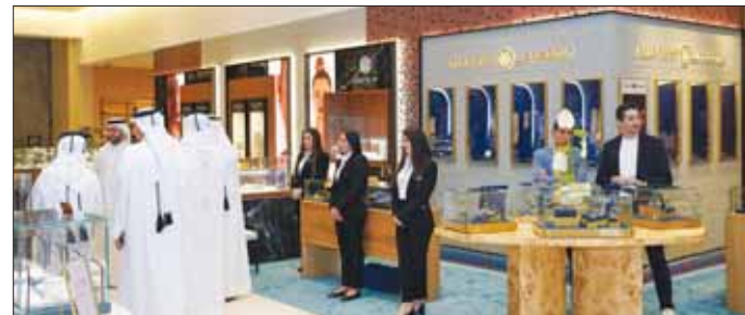
Azza Fahmy Jewellery's section also unveiled its new "Salon for Cultured Engagement" concept.

The design merges refined materials with geometric precision, creating a sophisticated ambience enhanced by rich textures and soothing colours. A private