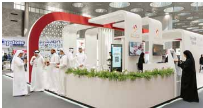
In partnership with key entities, including the Real Estate Regulatory Authority (Aqarat), the Ministry of Interior, the Ministry of Justice, and the Ministry of Municipality, the Government Pavilion showcased the strength of Qatar's real estate sector and the diverse range of investment opportunities available.

"The real estate sector plays a crucial role in driving economic diversification and developing a knowledge-based economy, aligning with the Third National Development Strategy 2024-2030 and Qatar National Vision 2030."