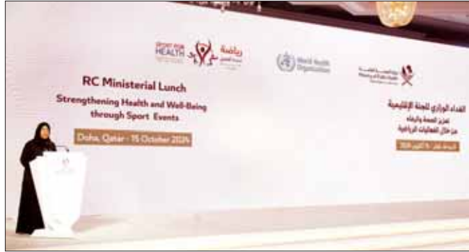
HE Dr Hanan Mohamed al-Kuwari, Minister of Public Health speaks at the event.

She stressed: "The Sport for Health model reflects a commitment to harness the transformative power of mega-sports events to create lasting improvements in public health and well-being," adding: "This report details our collaborative effort - a