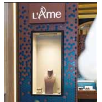
L'Âme, the exclusive Fifty One East brand, presented a space inspired by feminine grace, with pink gradients and gold accents against structured grey tones.

marked the official in-store debut of Annamaria Cammilli, an Italian jewellery house renowned for its sculptural designs and unique palette of eight shades of 18-carat gold. After its successful introduction at the Doha Jewellery & Watches Exhibition 2024, Annamaria Cammilli now joins Fifty One East's prestigious collection, bringing a new level of artistry to the Qatar market.