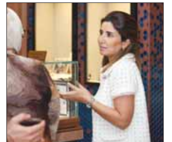
Each brand has been meticulously curated to provide a distinctive yet harmonious experience, with dedicated spaces that reflect their unique identities.