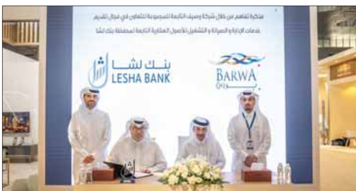
Lesha Bank signed two memorandums of understanding (MoU) with Barwa Real Estate and its subsidiary Waseef at Cityscape Qatar 2024. These MoUs are aimed at exploring potential collaboration opportunities between Lesha Bank and Barwa Real Estate in the investment domain.

UDC's robust project pipeline also includes the upcoming premium medical establishment The Pearl International Hospital, set to open in Q4 2024, providing world-class healthcare services to residents of The Pearl Island and surrounding areas. The company is also committed to maintaining a vibrant community on The Pearl Island, with a rich calendar of events aimed at driving footfall and adding value to retail businesses.