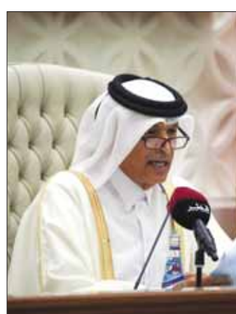
HE the Speaker of the Shura Council Hassan bin Abdullah al-Ghanem.

HE the Speaker of the Shura Council Hassan bin Abdullah al-Ghanem hailed the speech delivered by His Highness the Amir Sheikh Tamim bin Hamad al-Thani at the inauguration of the fourth ordinary session of the first legislative term, corresponding to the 53rd annual session of the Shura Council, noting the key achievements mentioned in the speech and the Amir's directives for the upcoming phase.