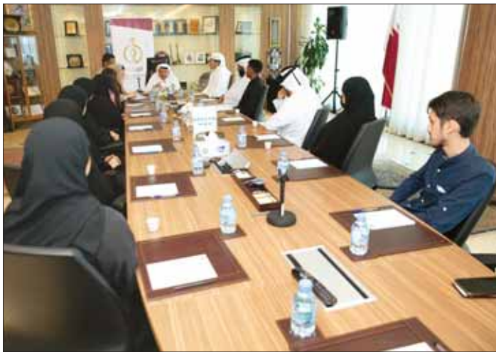
Scholarship Recipients with HE Sheikh Faisal bin Qassim al-Thani.

A l Faisal Without Borders Foundation hosted a ceremony to honour the graduates who benefited from the foundation's educational scholarships.