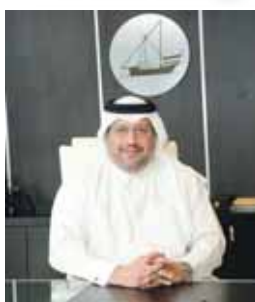
Faisal Abdulhameed al-Mudahka, Editor-in-Chief of Gulf Times