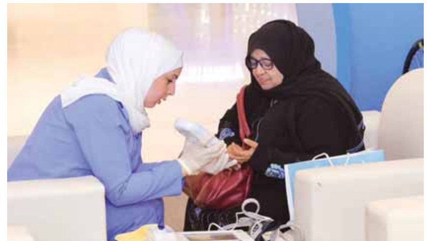
Leabaib is the third health centre to offer the pilot elderly care service.

Patients and their families understand that the elderly face increasing