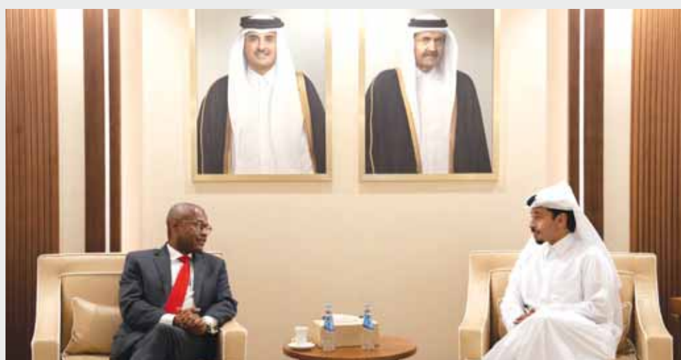
Acting Director General of the Qatar Fund for Development (QFFD), Sultan bin Ahmed al-Aseeri met yesterday with Minister of Tourism and International Transport of Barbados Ian Gooding-Edghill. The meeting discussed ways of co-operation in international transport. (QNA)