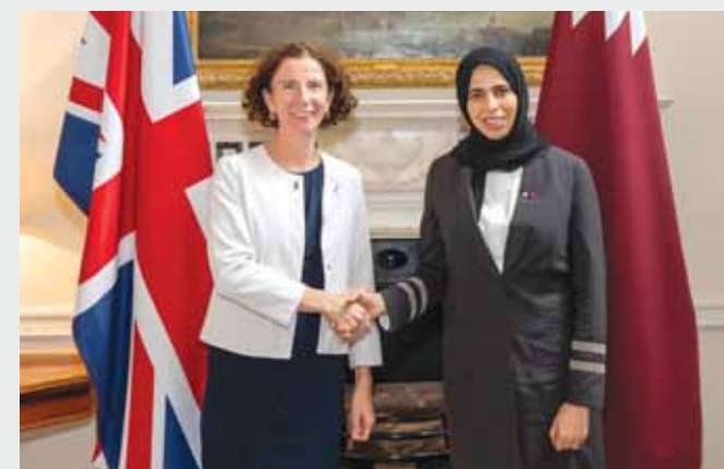
HE the Minister of State for International Co-operation Lolwah bint Rashid AlKhater met in London yesterday with UK Minister for International Development Anneliese Dodds. The meeting discussed co-operation relations between the two countries and ways to support and enhance them, especially in the field of development in the Gaza Strip, Lebanon and Syria. They also discussed projects included in the joint development portfolio between Qatar and the United Kingdom, in addition to the latest preparations for the upcoming Qatar-British Strategic Dialogue.