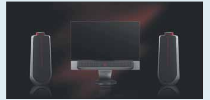
The Ferrari Collection Beovision Theatre & Beolab 50.

Danish soundcraft meets Italian flair as Bang & Olufsen, represented in Qatar by Modern Home, announced its second Special Edition Ferrari Collection, revealing three new masterworks.