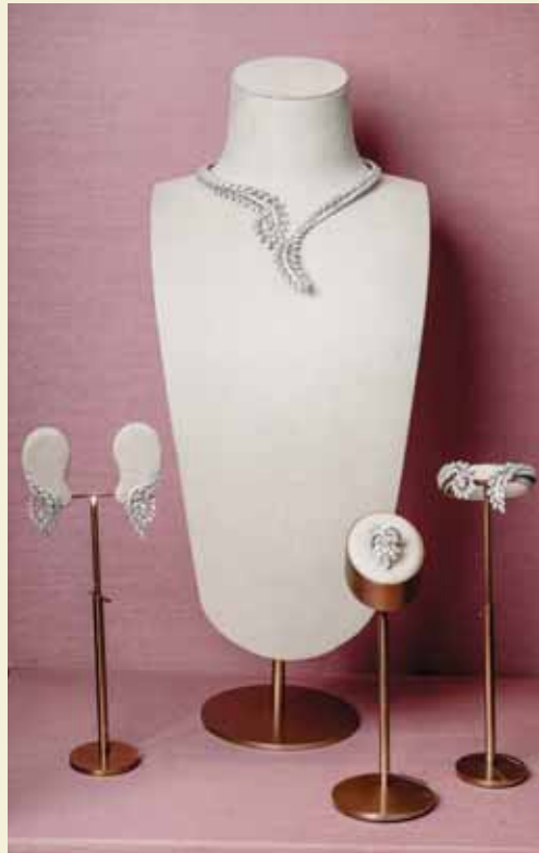
The exclusive gathering showcased Sartoro's stunning creations, offering a unique opportunity for attendees to explore the Maison's commitment to quality and elegance.

As a family business, the Maison's commitment to client relationships, founders' active engagement, and above-and-beyond client care contribute to a deeply personal and cherished journey for every individual.