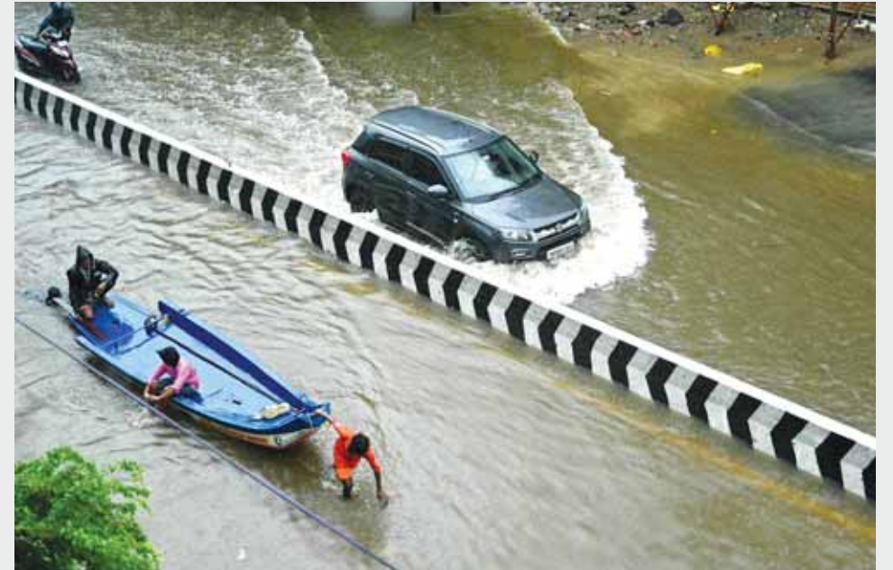
People wade through a flooded street amid heavy rainfall in Chennai, India, yesterday. Intense rain lashed southern India yesterday, with weather officials issuing a red alert warning of flash floods and landslides. India's meteorological department warned of "heavy to very heavy" rainfall expected in parts of the southern state of Tamil Nadu, Andhra Pradesh, Karnataka and Kerala. Heavy rain and strong winds have battered southern India since Tuesday forcing many schools shut and disrupting train services.