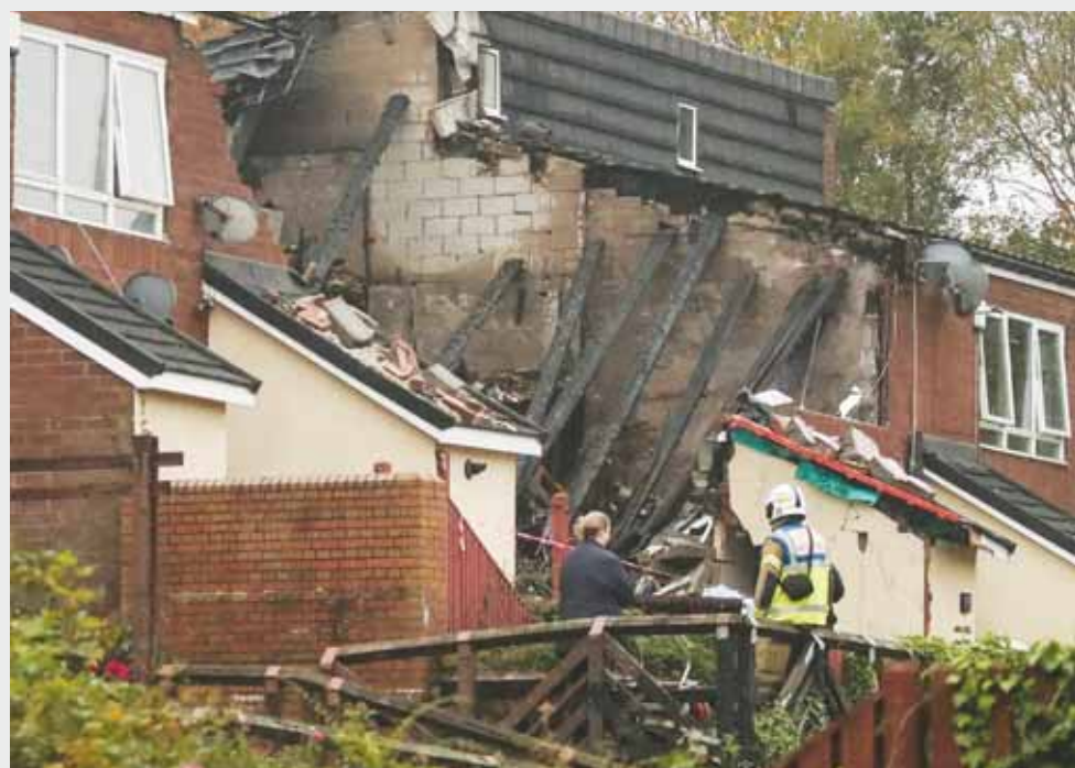
Firefighters and emergency services inspect the scene of an explosion in Benwell, Newcastle-upon-Tyne, northern England, yesterday. Northumbria police confirmed that a child had died and six people were taken to hospital following the explosion of a house.