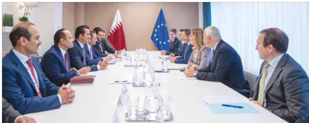
His Highness the Amir Sheikh Tamim bin Hamad al-Thani met yesterday in Brussels with President of the European Parliament Roberta Metsola, on the sidelines of the First Summit of the Co-operation Council for the Arab States of the Gulf (GCC) and the European Union (EU). The meeting dealt with bilateral relations and ways to enhance them, in addition to the latest regional and international developments of shared concern, especially the situation in the Gaza Strip, the occupied Palestinian territories and Lebanon, along with several topics on the summit agenda. The meeting was attended by HE the Prime Minister and Minister of Foreign Affairs Sheikh Mohammed bin Abdulrahman bin Jassim al-Thani, a host of members of the official delegation accompanying His Highness the Amir, alongside a number of members of the European Parliament.