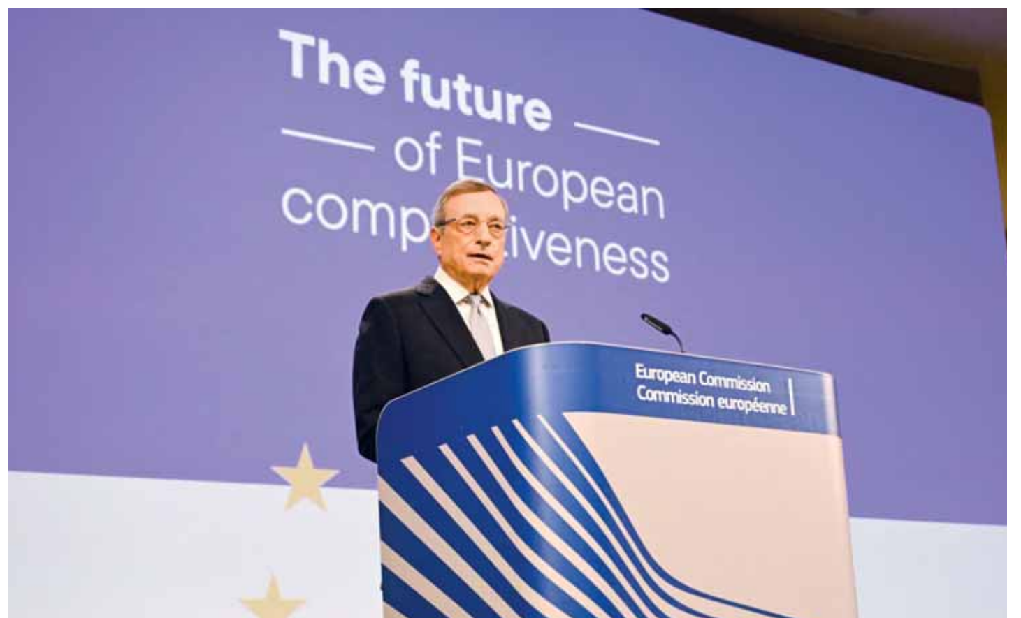
Italian former prime minister and economist Mario Draghi speaks during a joint press conference about the future of European competitiveness at the EU headquarters in Brussels on September 9, 2024.