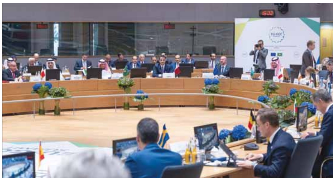
His Highness the Amir chaired Qatar's delegation to GCC-EU Summit in Brussels yesterday. Page 15