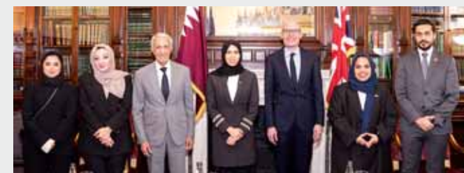
HE the Minister of State for International Co-operation Lolwah bint Rashid AlKhater met with Director of Global Health at the UK Foreign, Commonwealth and Development Office David Whineray. The meeting discussed global health issues, especially multilateral financing, ways to strengthen health systems and prepare for epidemics. In addition, they discussed a number of topics of common interest.