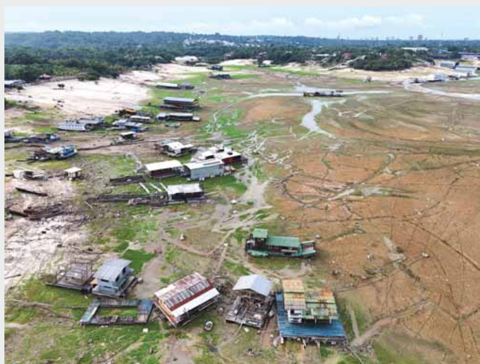
A drone view shows floating houses on the dry bed of the Taruma Acu river, tributary of the Rio Negro river, during what the national disaster monitoring agency Cemaden has already called Brazil's worst drought since at least the 1950s, near Manaus, Amazonas State, Brazil, yesterday.