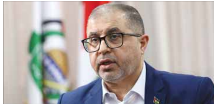
Basem Naim, a senior Hamas official in Gaza, speaks during an interview with Reuters in Istanbul, Turkey, yesterday.

"We cannot simply start negotiating new conditions added by (Israeli Prime Minister) Benjamin