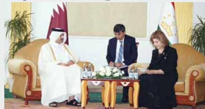
HE the Minister of Culture Sheikh Abdulrahman bin Hamad al-Thani met in Dushanbe yesterday with Tajikistan's Minister of Culture Matlubakhon Sattoriyen. The meeting discussed aspects of co-operation between the two countries in the cultural fields and ways to support and develop them. This took place on the sidelines of the Qatari Cultural Week in Tajikistan. (QNA)