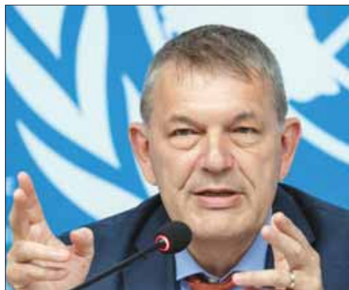
UNRWA chief Philippe Lazzarini.

"We have shown that we can have a polio cam-