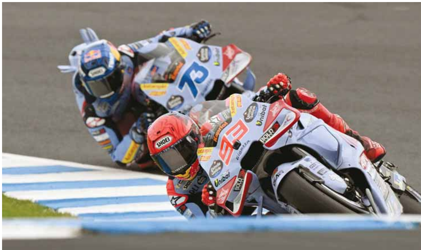
Gresini Racing MotoGP team rider Marc Marquez of Spain (right) speeds through a corner during a MotoGP practice session at the Australian MotoGP on Phillip Island yesterday.

MARQUEZ CLOCKED A BLISTERING FASTEST LAP OF 1MIN 27.770SEC