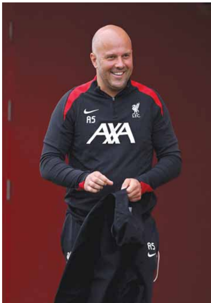
Arne Slot's Liverpool are top of the Premier League table with six wins in seven games but have had a relatively kind fixture list so far.

"Chelsea does really well, so if you look at the league table then they are the ones that might be our toughest opponent but it's not always about the league table sometimes, it's about the form on the day, it's about their game plan.