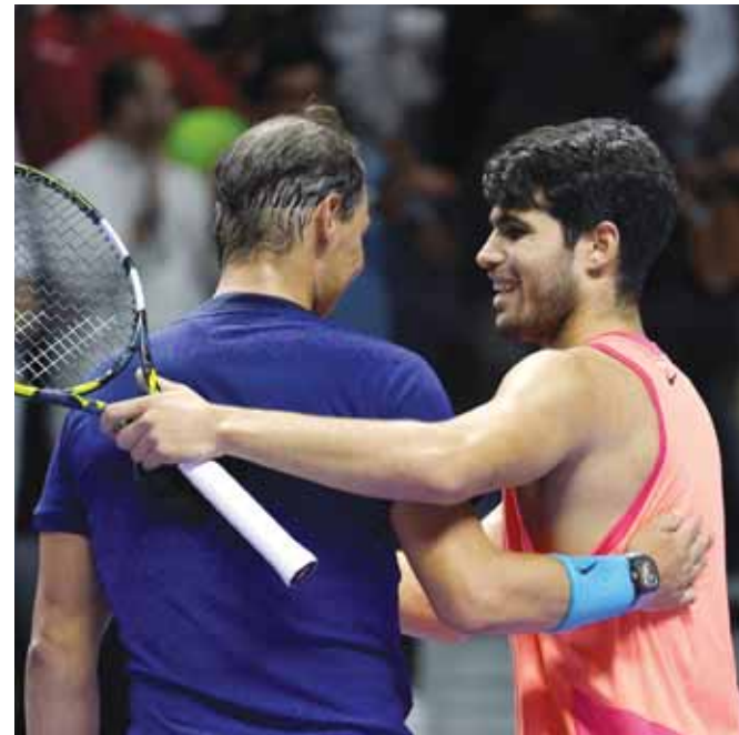
Spain's Carlos Alcaraz (right) embraces compatriot Rafael Nadal after winning the semi-final in Riyadh.

"Emotionally I'm sure I will be ready. In terms of physically, in terms of tennis level, I mean (there) remains a month" to prepare, he said, adding that he would not hesitate to speak up if he thought he could not compete well in singles.