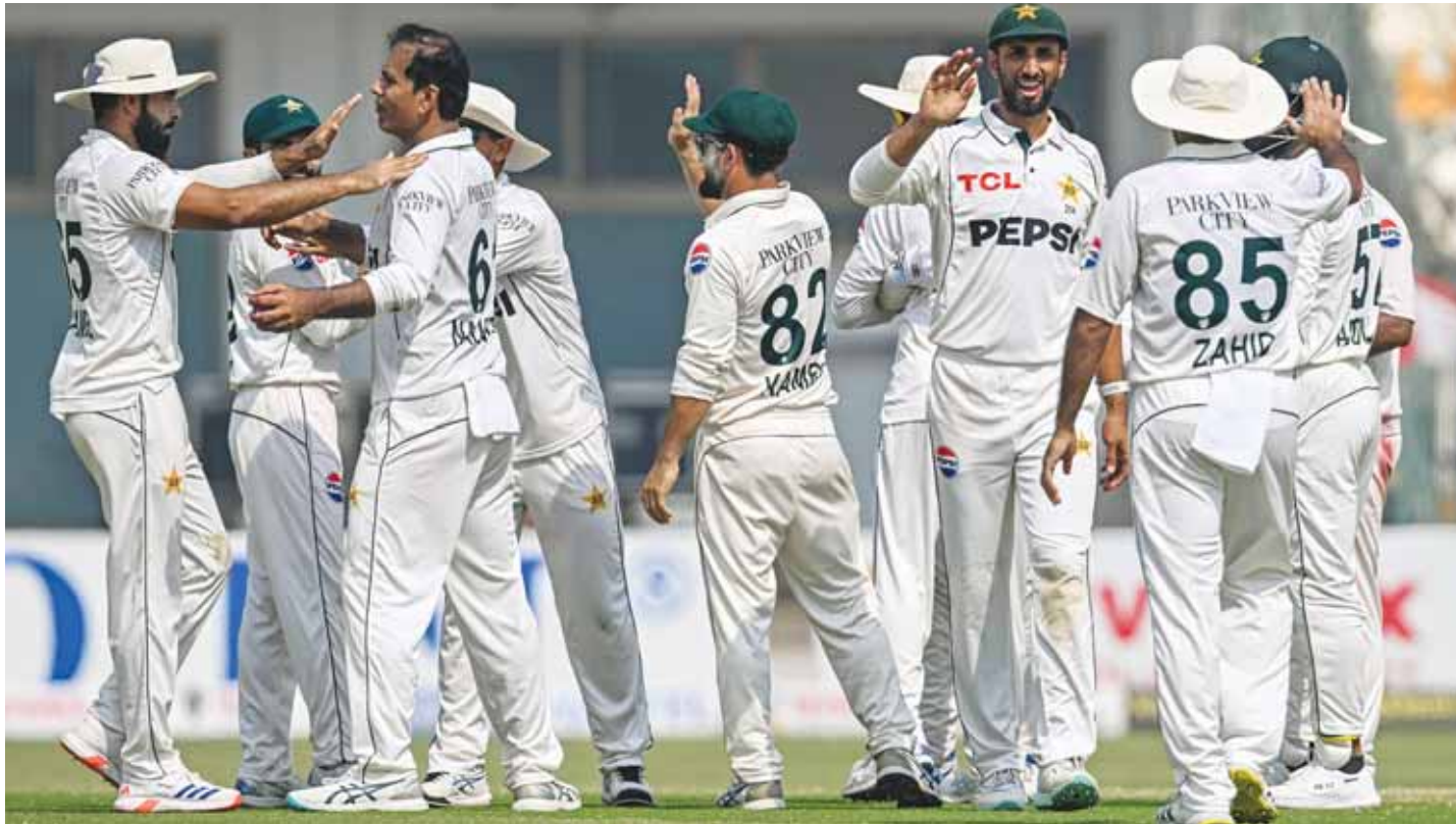
Pakistan's players celebrate winning the second Test against England at the Multan Cricket Stadium in Multan yesterday.

Pakistan's ploy of dropping ace batsman Babar Azam in one of four changes after the first Test and playing on a reused pitch with three spinners paid off handsomely. Azam's replacement, debutant