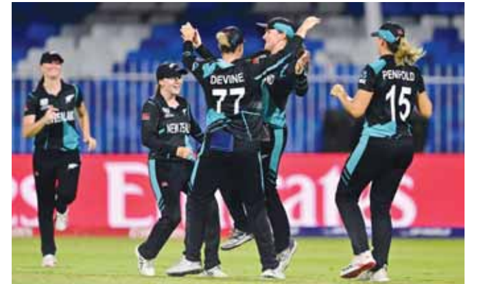
New Zealand's players celebrate after the dismissal of West Indies' captain Hayley Matthews during the ICC Women's T20 World Cup semi-final at the Sharjah Cricket Stadium in Sharjah yesterday.

BRIEF SCORES: New Zealand 128-9 in 20 overs (Georgia Plimmer 33, Suzie Bates 26, Isabella Gaze 20 not out; Deandra Dottin 4-22, Afy Fletcher 2-23) bt West Indies 120-8 in 20 overs (Deandra Dottin 33, Afy Fletcher 17 not out; Eden Carson 3-29, Amelia Kerr 2-14) by eight runs Player of the Match: Eden Carson (NZL)