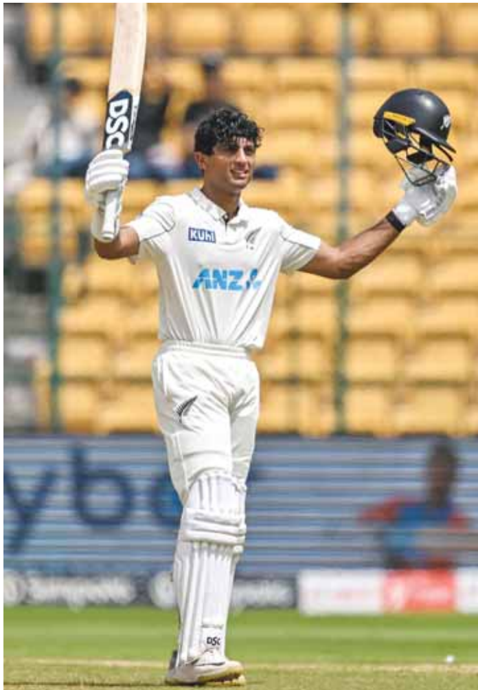
New Zealand's Rachin Ravindra celebrates after scoring a century during the third day of the first Test against India in Bengaluru yesterday.

Rohit smashed Matt Henry for four, six and four to raise his fifty