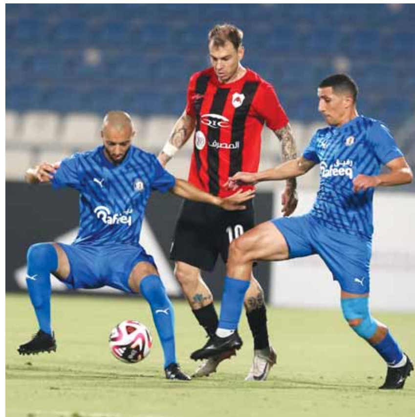
Al Rayyan scored a hard-fought 2-1 win over Al Khor at the Al Khor Stadium.

With scores levelled, tussle began to regain lead. In the 25th minute, Al Rayyan had a fine opportunity when following