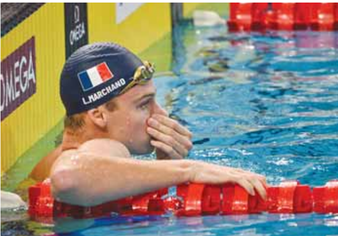
France's Leon Marchand reacts after winning the final of the men's 100m individual medley event during the World Aquatics Swimming World Cup in Shanghai yesterday.

"I don't really expect a lot of results, I'm just trying to have