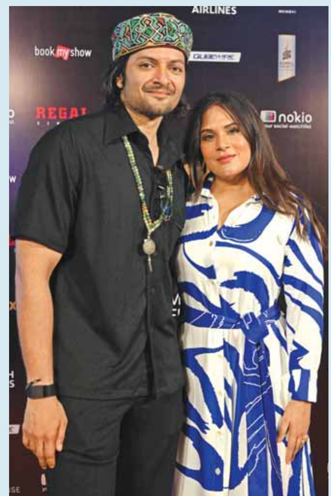
Bollywood actor Ali Fazal with his wife and actress Richa Chadha pose for photos as they attend the 'MAMI Mumbai Film Festival' in Mumbai yesterday.