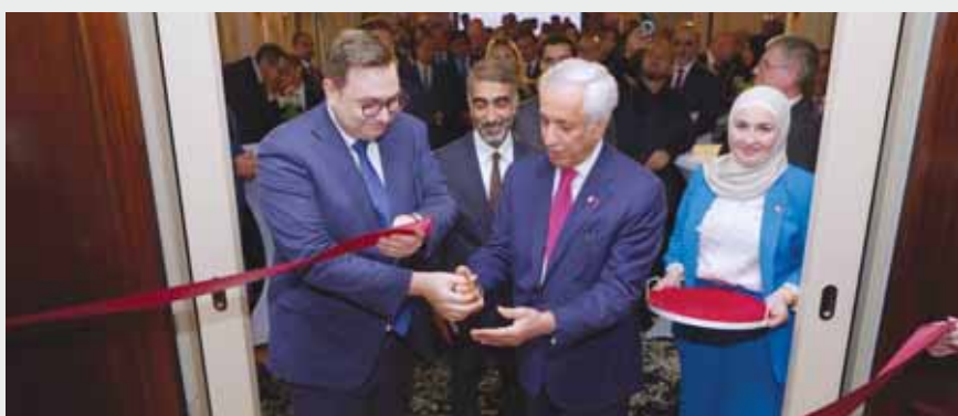
HE the Minister of State for Foreign Affairs Sultan bin Saad al-Muraikhi opened on Friday the premises of the Qatari embassy in Prague. The opening ceremony was attended by Czech Foreign Minister Jan Lipavsky, Qatar's ambassador Nasser bin Ibrahim al-Langawi, and a number of officials and heads of diplomatic missions accredited to the Czech Republic. (QNA)