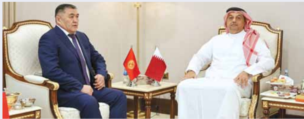
HE the Deputy Prime Minister and Minister of State for Defence Affairs Dr Khalid bin Mohammed al-Attiyah met with the visiting Deputy Prime Minister and Chairman of the State Committee for National Security of the Kyrgyz Republic, Lieutenant General Kamchybek Tashiyev and his accompanying delegation. An official reception ceremony was accorded to the Kyrgyz deputy prime minister at the Joint Special Forces Camp. Discussions during the meeting focused on topics of common interest, as well as co-operation relations between the two sides and ways to enhance and develop them. The meeting was attended by HE Commander of the Amiri Signal and Information Technology Corps, Major General Zayed bin Ahmed al-Kuwari; HE Commander of the Leader Mohammed bin Abdullah Al Attiyah Air College, Major General (Pilot) Salem bin Abdullah Nayef al-Dosari; and HE Commander of the Joint Special Forces, Major General Jassim bin Ali al-Attiyah along with a number of senior officials and officers from both sides. (QNA)