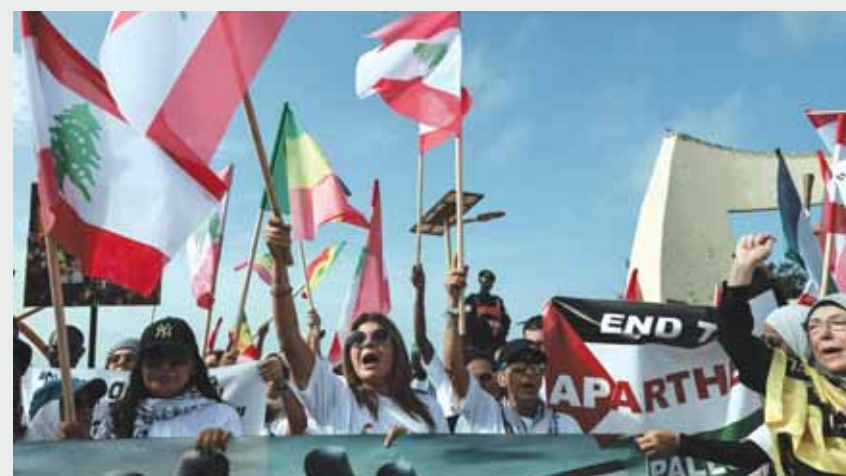
People shout slogans during a demonstration for justice and peace in Lebanon and Gaza, organised by a civil society group in Dakar, Senegal, yesterday.