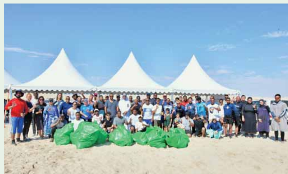
The Ministry of Environment and Climate Change has carried out a campaign to clean the beach and seabed of the Sealine area, with the participation of a number of volunteer divers. The campaign resulted in removing large amounts of accumulated waste and refuse materials at the seabed and the seashore. The campaign was organised by the Marine Protection Department in co-operation with the Natural Protectorates Department.