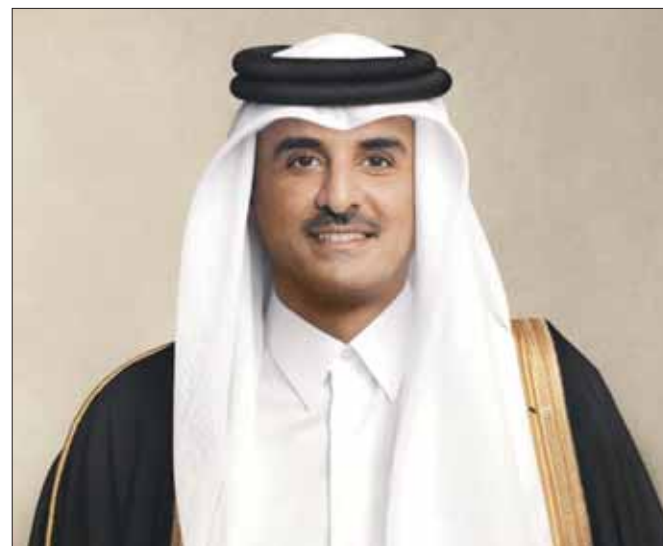
His Highness the Amir Sheikh Tamim bin Hamad al-Thani

The visits represent a new starting point for strengthening bilateral relations at various political and economic levels, with the two friendly countries being major EU heavyweights politically and economically. (QNA) Page 11