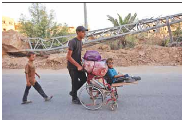
Displaced Palestinians, ordered by the Israeli army to leave the school in Beit Lahia where they were sheltered, arrive in Gaza City, yesterday.

It said the military operation caused "the death of two patients inside the Indonesian Hospital in