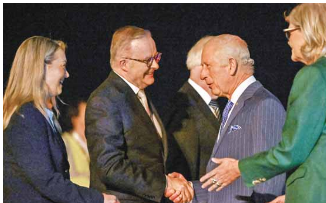
King Charles III and Queen Camilla greeted by the Prime Minister of Australia Anthony Albanese MP and his partner Ms Jodie Haydon while arriving at Sydney Airport, Australia, earlier this week.

Royal tours to far-flung domains are a vital way of kindling local support for the monarchy, and the political stakes for the royals are high. A recent poll showed about a third of Australians would like to ditch the monarchy, a third would keep it, and a third are ambivalent. Visiting British royals have typically embarked on weeks-long visits to stoke support, hosting grand banquets and parading through