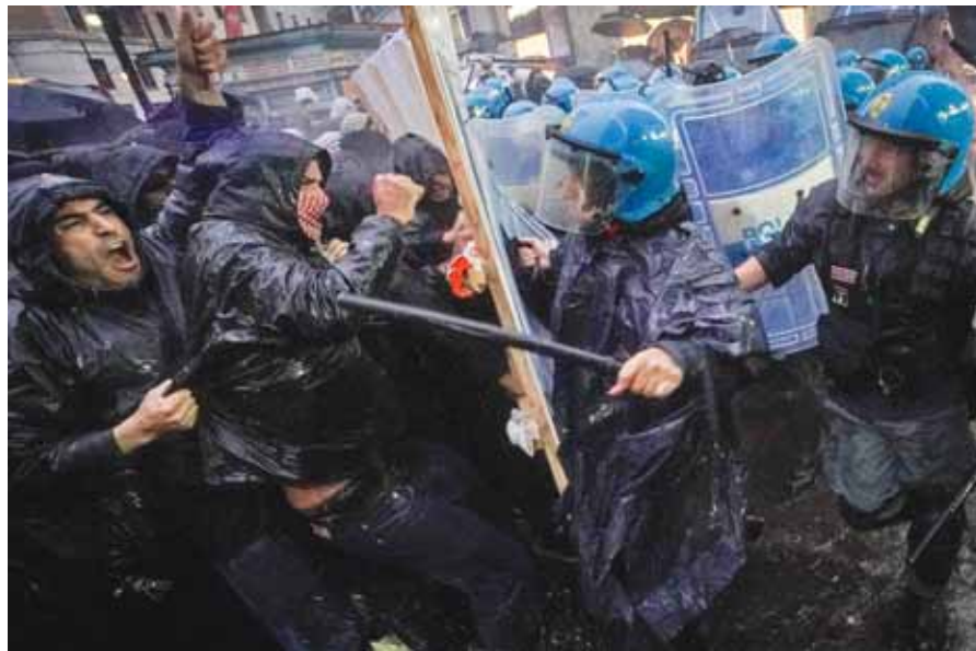
Demonstrators clash with police officers in Naples as the G7 Defence Ministers summit is being held.

Also in attendance were North Atlantic Treaty Organisation (Nato) chief Mark Rutte