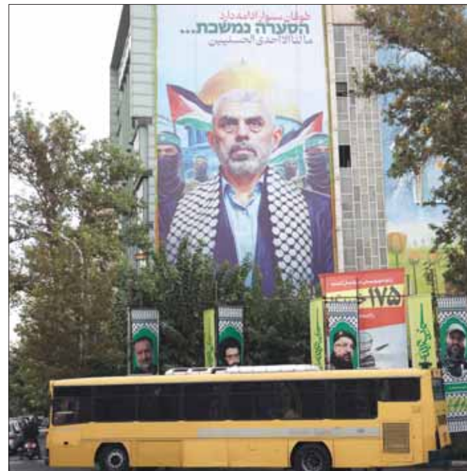
A billboard with a picture of the late Hamas leader Yahya Sinwar is displayed on a building in Tehran, Iran, yesterday.

"He was a shining face of resistance and struggle. With a steely resolve, he stood against the oppressive and aggressive enemy. With wisdom and courage, he dealt them the irreparable blow of October first week last year that has been recorded in the history of this region. Then, with honour and pride, he ascended to the heavens of the martyrs," said Khamenei. The "Axis of Resist-