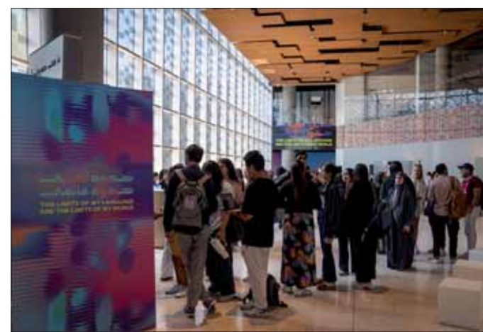
The event coincides with the ongoing exhibition on Arabic.