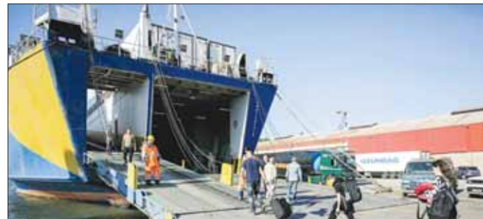
People evacuating from Lebanon board a ship bound for Turkey at the port of the northern city of Tripoli, yesterday.

launched an intense air campaign on Lebanon and later sent in ground forces after nearly a year of cross-border exchanges with the Hezbollah group over the Gaza war.