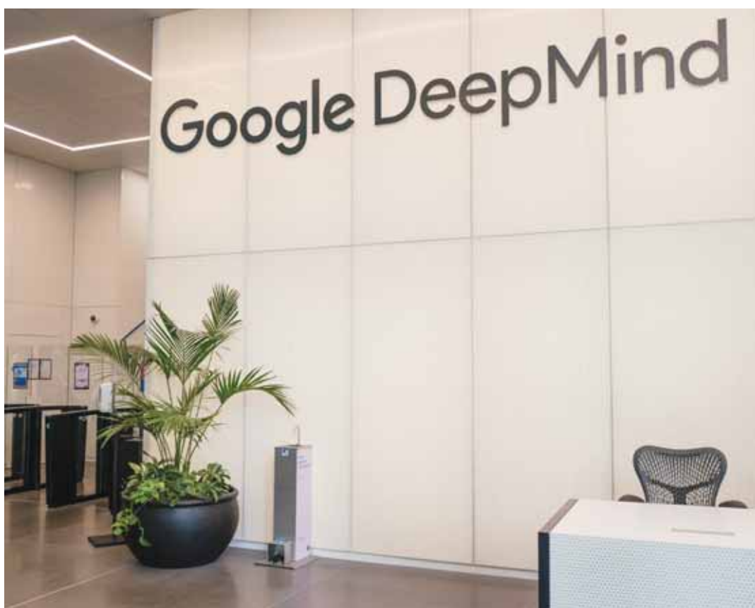
DeepMind's partner in developing AlphaFold is an intergovernmental research organisation funded by more than 20 member states of the European Union.