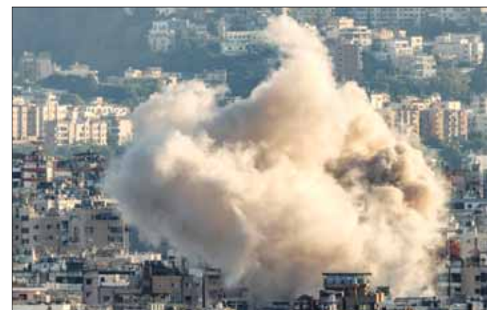
A cloud of smoke erupts following an Israeli air strike on Beirut's southern suburbs yesterday.

In a series of Hezbollah rocket salvos in Israel, one person was killed and at least nine injured, the Israeli ambulance service said. (Reuters)