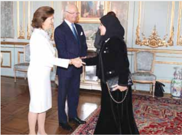
King Carl XVI Gustaf of Sweden, and Queen Silvia received Qatar's ambassador to Sweden Nadia bint Ahmed al-Sheebi during a reception hosted by the king at the Royal Palace. The event was attended by members of the Swedish royal family and high-ranking officials. (QNA)