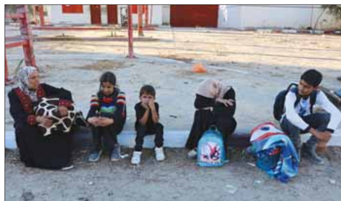
Displaced Palestinians, ordered by the Israeli army to leave the school in Beit Lahiya where they were sheltered, rest as they arrive in Gaza City yesterday.

In Jabalia, residents said Israeli army forces besieged several shelters housing displaced