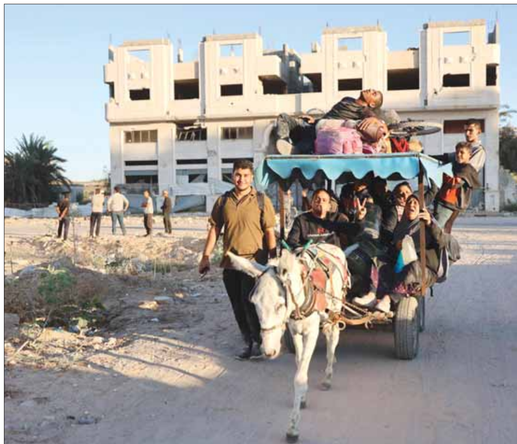
Displaced Palestinians, ordered by the Israeli army to leave the school in Beit Lahia, arrive in Gaza City.

In an earlier statement, the ministry said Israel had targeted the upper floors of the Indonesian Hospital, adding there were "more than 40 patients and wounded in addition to the medical staff"