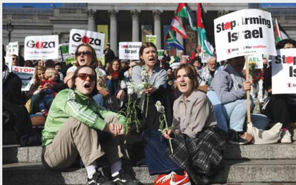
People attend a demonstration in support of Palestinians in Gaza, amid the ongoing Israel-Hamas conflict, at Trafalgar Square in London, Britain, yesterday.