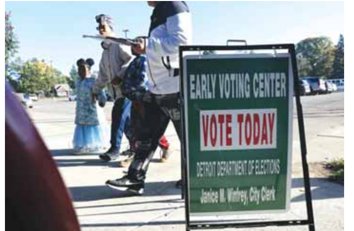
Residents participate in early voting at a community centre in Detroit yesterday. Detroit is the first Michigan community to have early voting.

Trump said he had not cancelled any events. However, an October 22 Na-