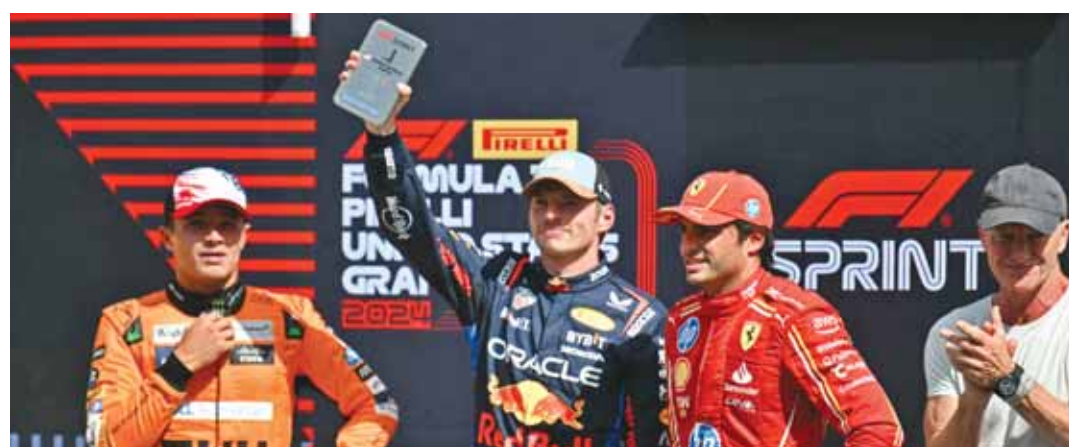
Left to right: McLaren's British driver Lando Norris, Red Bull Racing's Dutch driver Max Verstappen and Ferrari's Spanish driver Carlos Sainz Jr. pose with their trophies with British singer Sting after the United States Formula One Sprint at the Circuit of the Americas in Austin, Texas, yesterday.

Sainz said: "That was a good race with some very good battles and it had a lot going on! I was struggling with my tyres, but I saw Lando was too. And I made