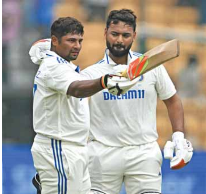
India's Sarfaraz Khan (left) celebrates with his teammate Rishabh Pant after scoring a century yesterday.

Sarfaraz, who hit his first ton in four Test appearances, fell soon after reaching 150 when he was caught at cover off Tim Southee.