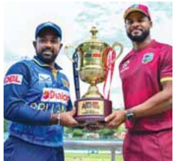
Sri Lanka's captain Charith Asalanka (left) and West Indies' captain Shai Hope pose with the ODI series trophy yesterday.

"We're looking at three spin options. We've got leg-spinners Wanindu Hasaranga and Jeffrey Vandersay, plus Dumith Wellalage... A couple of our batters can roll their arm over for some spin as well."