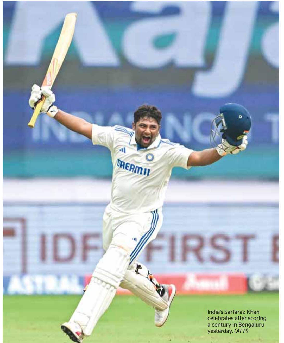
India's Sarfaraz Khan celebrates after scoring a century in Bengaluru yesterday.

BRIEF SCORES: Stumps New Zealand 402 and 0 for 0 need 107 runs to beat India 46 and 462 (Sarfaraz 150, Pant 99, Kohli 70, Rohit 52, O'Rourke 3-92, Henry 3-102, Ajaz 2-100)