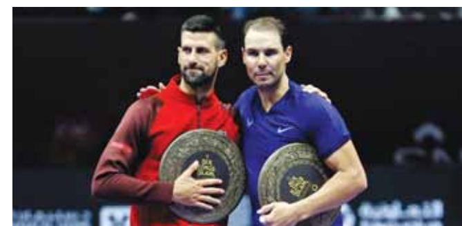
Serbia's Novak Djokovic and Spain's Rafael Nadal pose after their third-place match at the 6 Kings Slam in Riyadh yesterday.