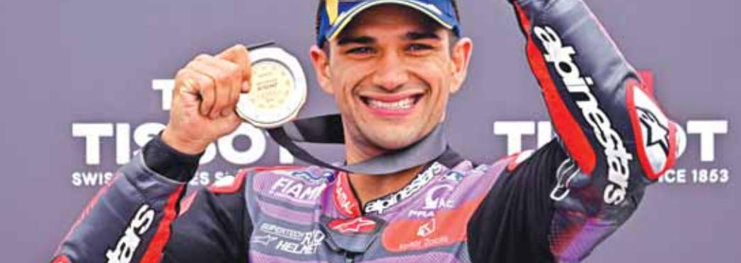
Prima Pramac Racing's Spanish rider Jorge Martin celebrates on the podium after winning the sprint race of the MotoGP Australian Grand Prix on Phillip Island yesterday.

could not catch Martin, who streaked away to open a 2.6sec lead at the halfway mark and cross the line 1.520sec clear.