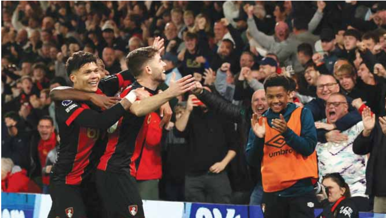
Bournemouth's Ryan Christie (right) celebrates with Evanilson after scoring against Arsenal in the Premier League.

United manager Ten Hag had defiantly slammed "fairy tales and lies" about his future at the club on Friday as the belea-