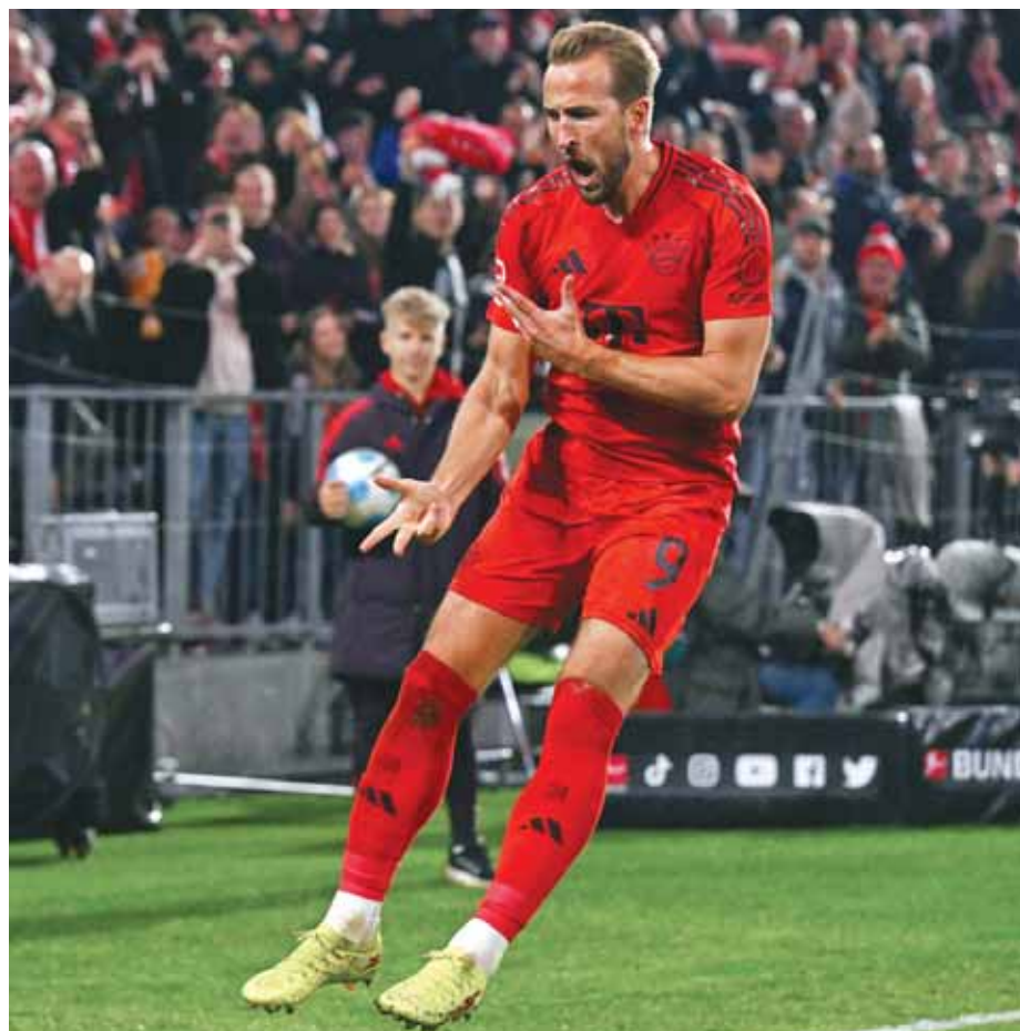
Bayern Munich's Harry Kane celebrates after scoring against Stuttgart in Munich.

Just five minutes later, the referee was sent to the video screen again, this time finding a penalty for Frankfurt, with Robert Andrich lightly touching Omar Marmoush's foot. Marmoush showed Boniface how it is done, blasting a low shot left to give the visitors the lead on 16 minutes. The Egyptian now has an in-