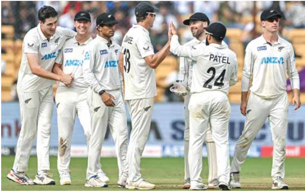
New Zealand's players celebrate after the dismissal of India's K L Rahul during the fourth day of the first Test at the M Chinnaswamy Stadium in Bengaluru yesterday.

NEW ZEALAND WILL ATTEMPT TODAY TO WRAP UP THEIR FIRST VICTORY OVER INDIA SINCE 1988