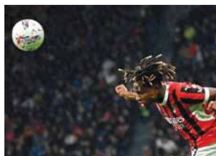
AC Milan's Samuel Chukwueze scores during the Serie A match against Udinese.

Their task was made difficult by Tijjani Reijnders being sent off in the 29th minute for a clumsy foul on Sandi Lovric who would have been clean through on goal had the Netherlands midfielder not clipped his heels. Tammy Abraham should have sealed the points for