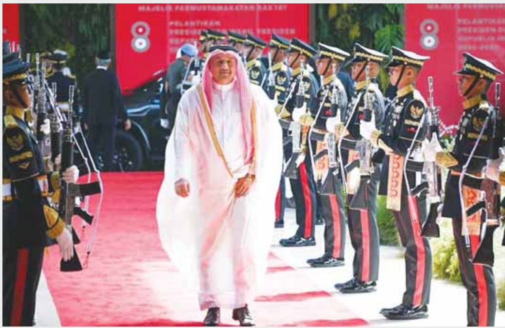
Qatar participated in the inauguration ceremony of Prabowo Subianto as president of Indonesia. HE the Deputy Prime Minister and Minister of State for Defence Affairs Dr Khalid bin Mohammed al-Attiyah represented Qatar. HE Dr al-Attiyah, along with his accompanying delegation, were welcomed upon arrival in Jakarta by Indonesian Minister of Investment Rosan Roeslani. He was accorded formal reception ceremony on this occasion. (QNA)