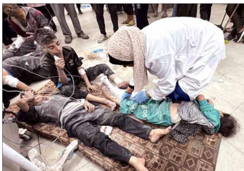
Wounded Palestinians receive treatment at the Kamal Adwan Hospital after an Israeli air strike in Beit Lahiya, yesterday.