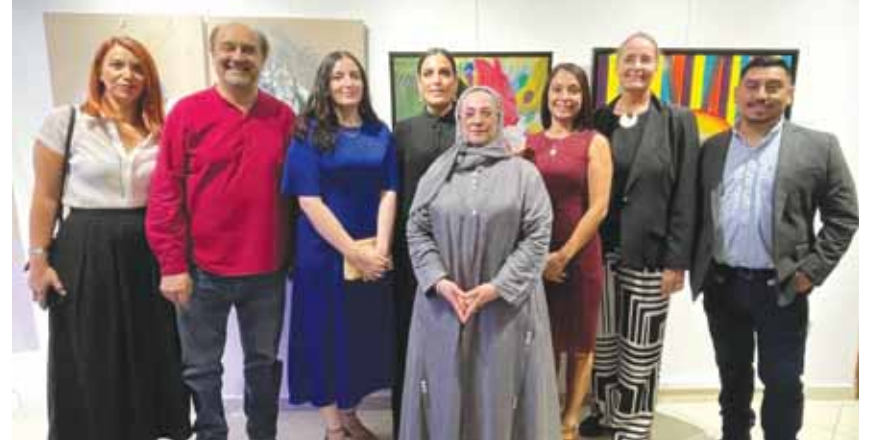
The exhibition presents a diverse roster of artists.