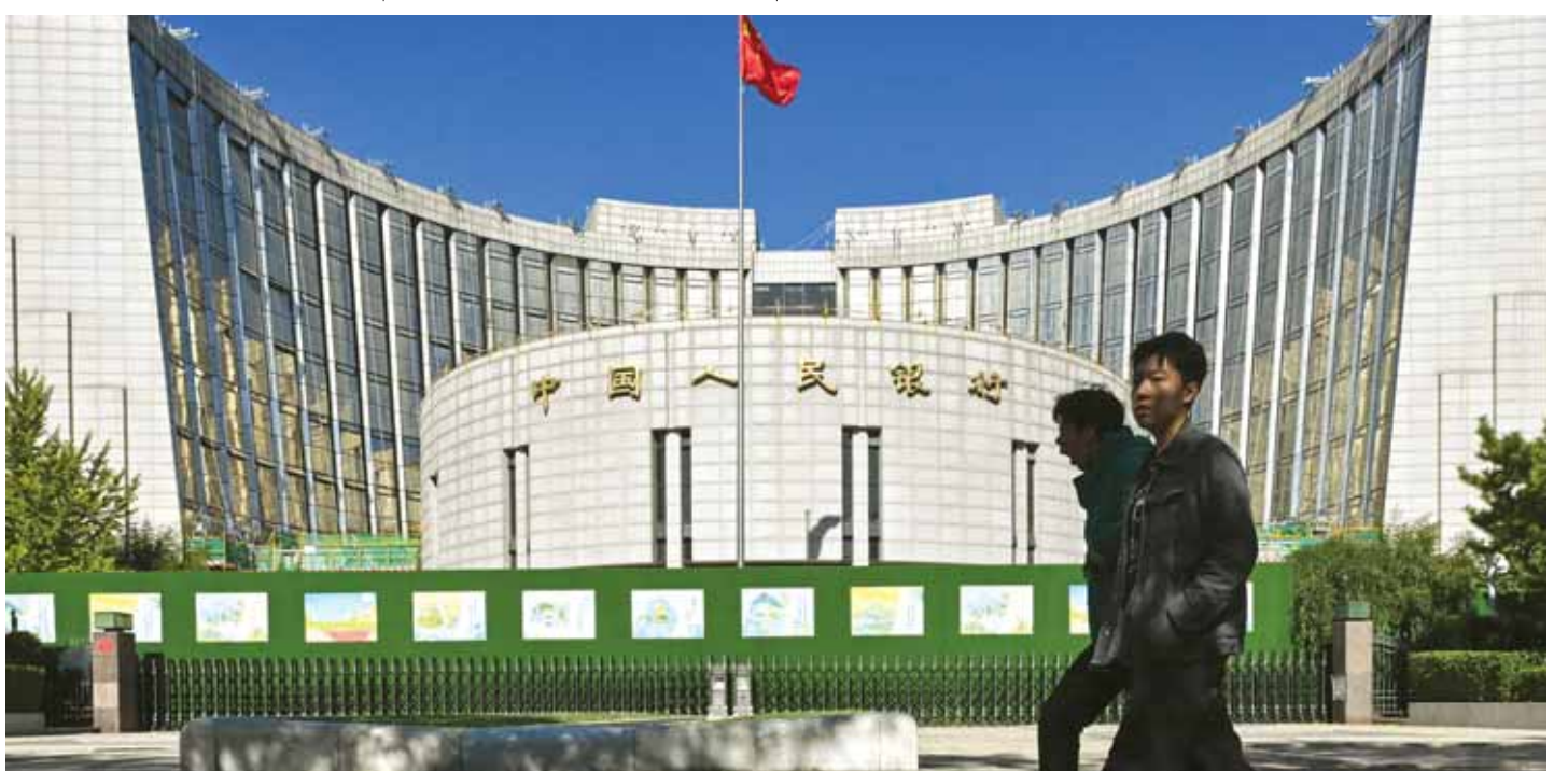
People walk past the People's Bank of China, the country's central bank, in Beijing. The PBoC recently lowered its key policy rate – the seven-day reverse repo rate – 20 basis points, from 1.7% to 1.5%.