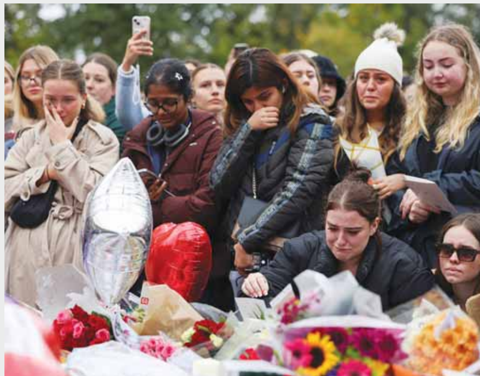
Fans react as they pay tribute to former One Direction singer Liam Payne, who was found dead after he fell from a third-floor hotel room balcony in Buenos Aires, in Hyde Park, London, Britain, yesterday.