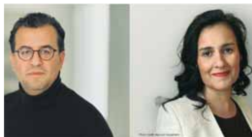
Hisham Matar and Kamila Shamsie.

His latest work, My Friends , continues his exploration of exile and human connection, receiving criti-