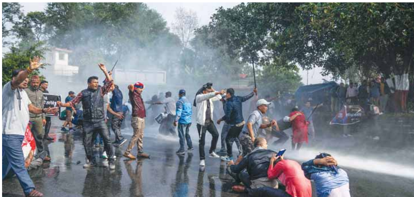
Police use water cannons to disperse supporters of Rabi Lamichhane, Nepal's former deputy premier, protesting after his arrest on fraud and organised crime charges, in Pokhara yesterday.