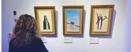
Al-Bader's pieces highlight the enduring connection to heritage amidst cultural assimilation.