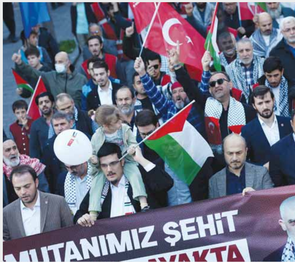
Pro-Palestinian demonstrators take part in a protest condemning the killing of Hamas leader Yahya Sinwar, in Istanbul, Turkiye, yesterday.