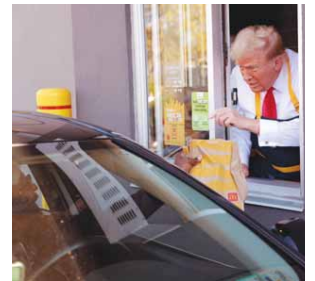
Right: Trump mans the drive-through line during his visit to a McDonald's restaurant in Feasterville-Trevose, Pennsylvania.

he would work at a McDonald's restaurant in Pennsylvania "just for fun" to mock Harris.