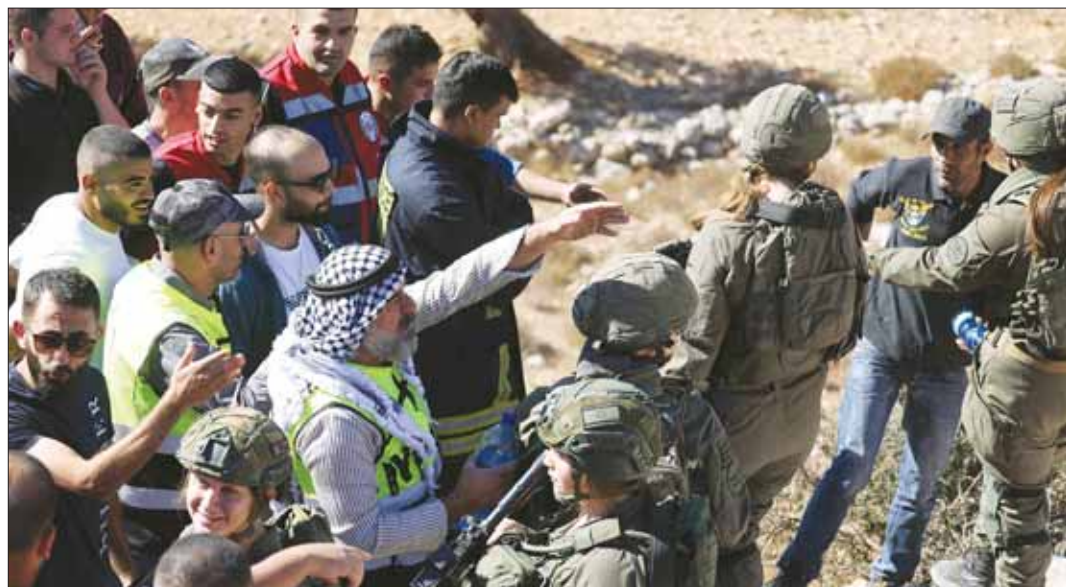
Israeli soldiers block the road in front of Palestinian farmers, preventing them from picking olives in their fields, in the village of Burqa, east of Ramallah in the occupied West Bank, yesterday.

Israel's retaliatory onslaught in Gaza has killed 42,603 people, a majority of them civilians, according to data from the health ministry in the Hamas-run territory, which the UN considers reliable. The ongoing war has reduced vast areas of Gaza to rubble, with about 68% of the territory's agricultural areas damaged by the conflict and farmers unable to fertilise or irrigate their land, the UN says.