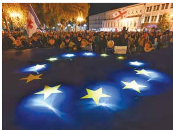
Protesters light a giant European Union flag during a pro-Europe rally in Tbilisi ahead of the parliamentary elections, which are seen as a crucial test for the country's democracy and its bid for EU membership.

Russia denies interfering and accuses Sandu's government of "Russophobia".