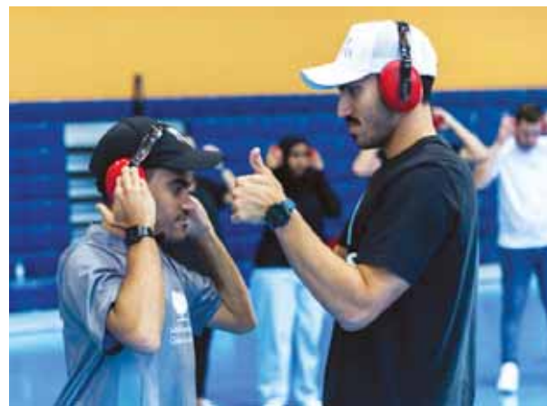
The workshops provide skills and techniques to help coaches work effectively with individuals with disabilities