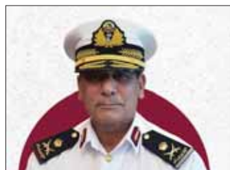
Major General (Navy) Hilal Ali al-Mohannadi

He added that the agreement signed between the ministries of defence of Qatar and Italy has opened the door wide for close and significant co-operation between the two countries in areas such as the acquisition of combat aircraft, helicopters, naval vessels, and advanced equipment like radar systems, in addition to training and joint exercises, particularly in training pilots and military