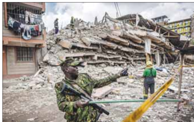
A Kenya Police officer gives instructions to bystanders to evacuate the area next to the rubble of a collapsed residential building at Kahawa West residential area in Nairobi, yesterday.