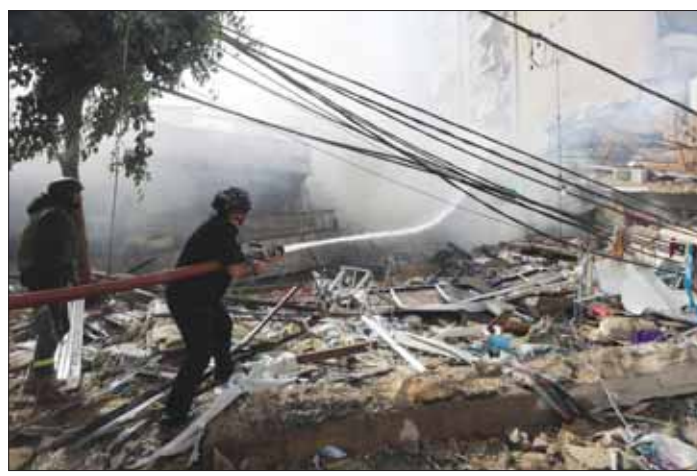
Civil defence members put out a fire at a damaged site, in the aftermath of Israeli strikes on Beirut's southern suburbs, yesterday.

Once again, families from south Beirut are forced to seek ref-