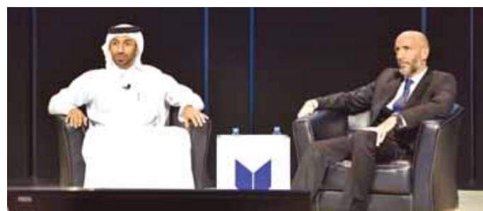
The event aimed to equip graduates with the necessary tools for career development.

event featured a carefully curated exhibition showcasing alumni-owned businesses, providing a unique opportunity to explore the entrepreneurial spirit within the university community.