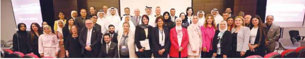
Some of the participants at the session.