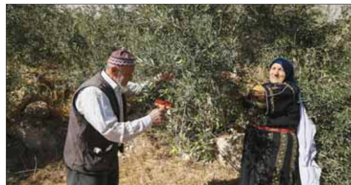
A Palestinian family picks olives from their trees in the village of Beit Awa, west of Hebron, in the occupied West Bank.