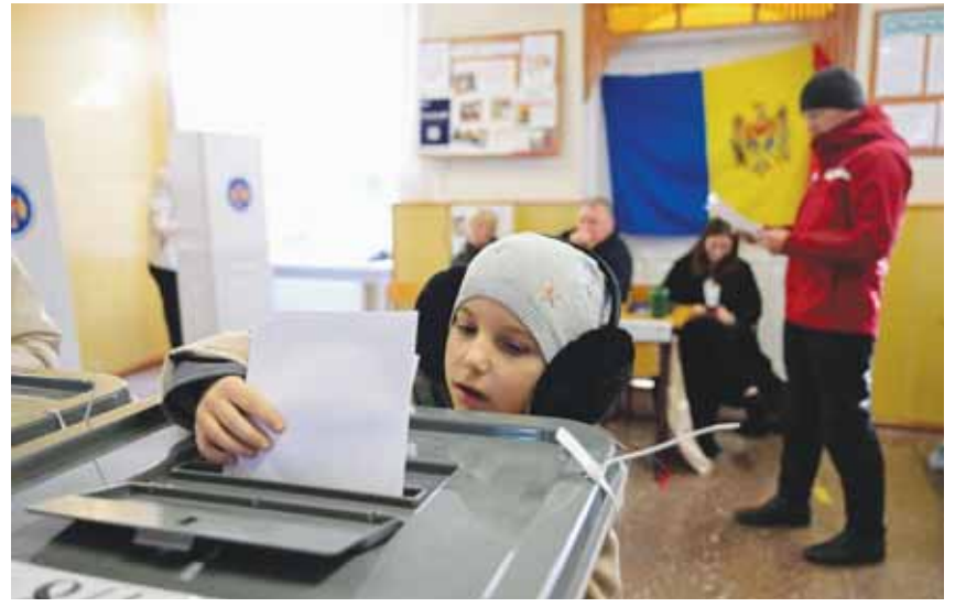
A child casts the ballot of a relative during the presidential election and referendum on joining the European Union at a specially designated polling station for the people living in Moldova's Transnistria region.

The 27-member bloc began membership talks with Chisinau this June.