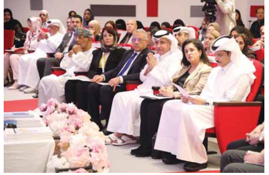
Dignitaries at the event.

orts among key stakeholders from different sectors to stimulate initiatives aimed at improving access to early detection and treatment in the Middle East. The session covered several topics, including the "Reality of Breast Cancer in the Region". Recent statistics were presented, showing that breast cancer is the most common cancer among women in the Middle East and North Africa (Mena) region. With over 131,000 reported cases in 2022, making it the leading cause of cancer-related deaths among women, breast