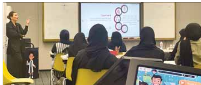
A session from the workshop.

Teachers were briefed on the latest specialisations in the field of precision medicine, including genetic counselling, pharmacogenomics and bioinformatics, and other topics. Participants were also familiarised with the 'Genome Heroes' game, which seeks to convey basic