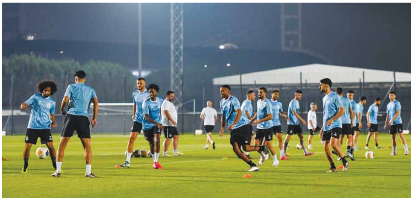
Al Sadd players during a practice session yesterday, on the eve of their AFC Champions League Elite tie against Iran's Persepolis at Hamad Stadium in Doha.

QATAR'S AL RAYYAN HOPE TO END THEIR LOSING RUN AGAINST SAUDI ARABIA CLUBS