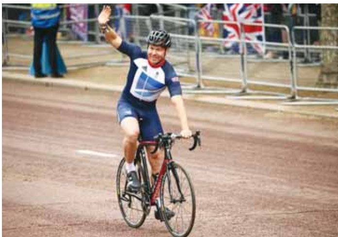
British cyclist Chris Hoy takes part in a parade during the Platinum Jubilee Pageant, marking the end of the celebrations for the Platinum Jubilee of Britain's Queen Elizabeth II in London on June 5, 2022.

"It's the closest I've come to, like, you know, why me? Just, what? What's going on here? It didn't seem real. It was such a huge blow, when you're already reeling.