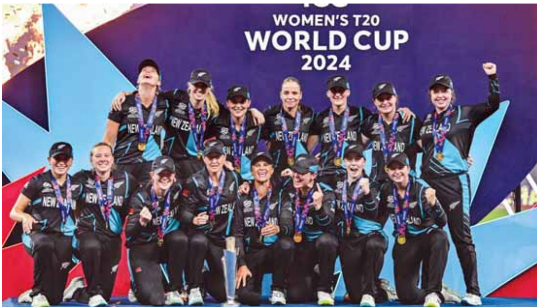
New Zealand's players celebrate with the trophy at the end of the ICC Women's T20 World Cup final match against South Africa at the Dubai International Cricket Stadium yesterday.

When Devine was leg before to Nadine de Klerk on review, the innings appeared to be faltering but the arrival of Brooke Halliday lifted the tempo as she added 57 in sev-