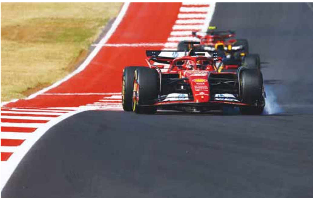
Charles Leclerc of Monaco driving the Ferrari SF-24 on track during the Formula One Grand Prix of United States at Circuit of The Americas in Austin, Texas.

Verstappen has now extended his lead over Norris to 57 points in the drivers' championship with five races left this season.