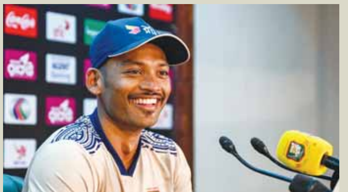
Bangladesh's captain Najmul Hossain Shanto addresses a press conference on the eve of their first Test against South Africa at the Sher-e-Bangla National Cricket Stadium in Dhaka yesterday.

Dhaka: The absence of Shakib Al Hasan has come as a relief to South Africa as they embark on a two-test series in Bangladesh but stand-in captain Aiden Markram does not expect the challenge to be any easier. Bangladesh's best-known cricketer was due to bow out in the tests in Dhaka, starting today, and Chittagong, but has not returned home following public anger over his silence during deadly protests in the country. Shakib, 37, was a member of parliament for the Awami League led by Sheikh Hasina, whose 15-year rule as prime minister ended in August with her fleeing to India.