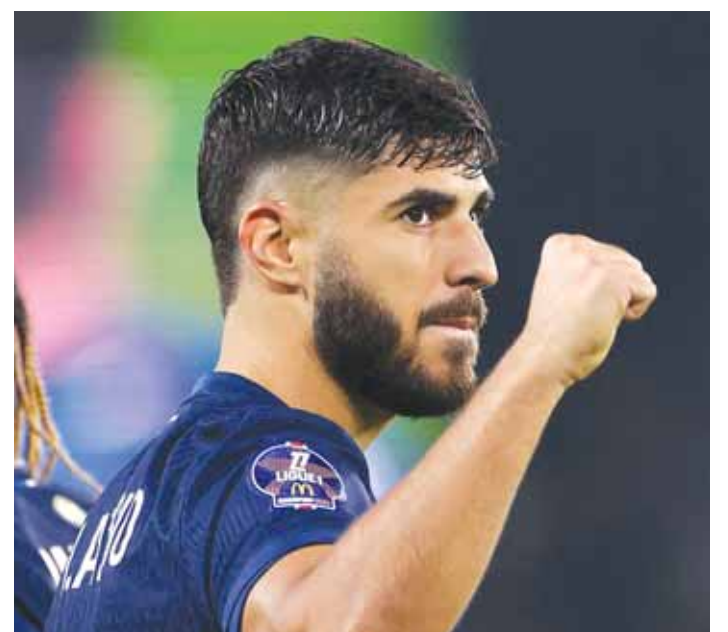
PSG forward Marco Asensio celebrates after scoring his team's second goal during the French L1 match against RC Strasbourg Alsace at the Parc des Princes Stadium in Paris yesterday.

Marseille go to Montpellier on Sunday, when other matches include Lyon at Le Havre and high-flying Reims at Auxerre.