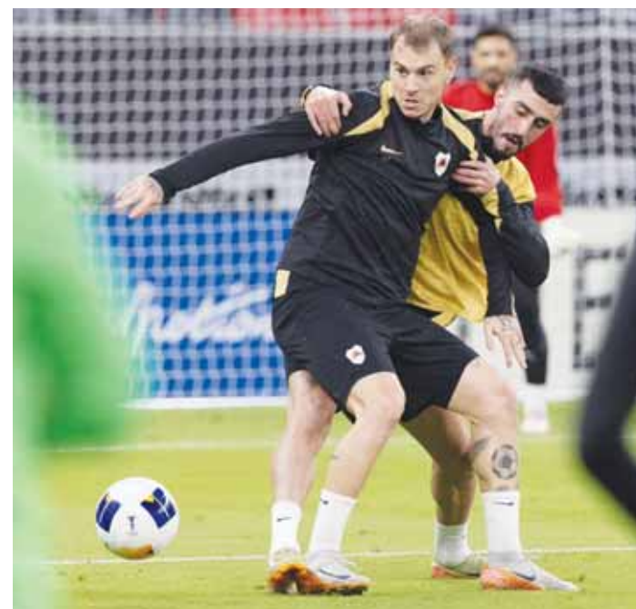
Al Rayyan players during a training session yesterday. Al Rayyan hosts Saudi Arabia's Al Ahli in an AFC Champions League Elite clash at Ahmad Bin Ali Stadium today.

Al Rayyan are still in search of their first points after suffering defeats to Al Hilal SFC and Al