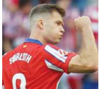
Atletico Madrid's Alexander Sorloth celebrates scoring an equaliser during the La Liga match against Leganes in Madrid yesterday.

played his part in Atletico's triumph, after Sorloth's clever flicked finish from Axel Witsel's cut-back helped the hosts pull level in the 69th minute.