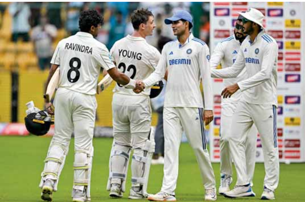
New Zealand's Rachin Ravindra (left) and Will Young (second left) are congratulated by Indian players after their team's win at the end of the first Test at the M Chinnaswamy Stadium of Bengaluru yesterday.

"The work we did in the first and second innings with the ball and bat really set the game up for us. It's a proud moment for this group and one we'll celebrate."