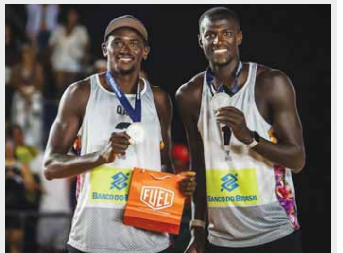
Cherif Younousse and Ahmed Tijan had to settle for runner-up spot at the Volleyball World Beach Pro Tour Joao Pessoa Elite16 in Brazil on Sunday. The Qatari duo lost to Tokyo Olympic champions Anders Mol and Christian Sorum of Norway 27-25, 17-21, 17-19 in the final after almost seventy minutes of action. Reigning Olympic champions David Ahman and Jonatan Hellvig of Sweden took bronze. Mol and Sorum were just two points away from having to settle for silver when Cherif and Tijan built a 13-10 lead in the tie-breaker, but came back to win the thrilling clash. It was the 14th duel between the teams and the tenth time that a tie-breaker was needed to determine the winners.