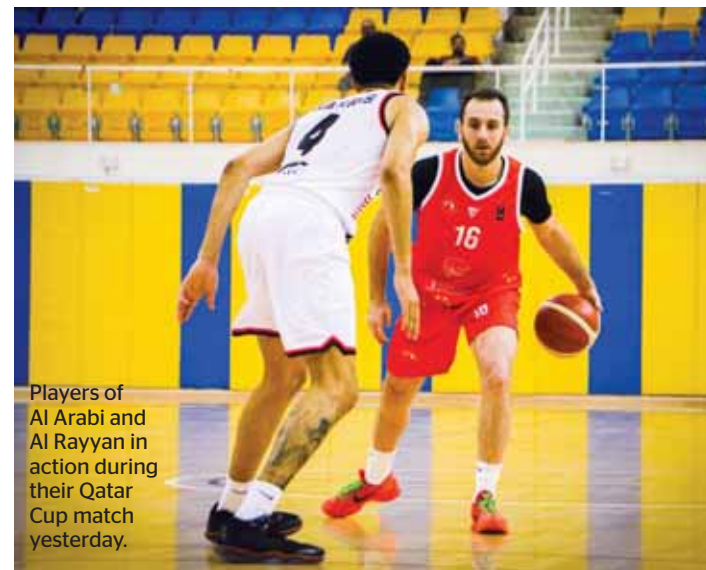
Players of Al Arabi and Al Rayyan in action during their Qatar Cup match yesterday.