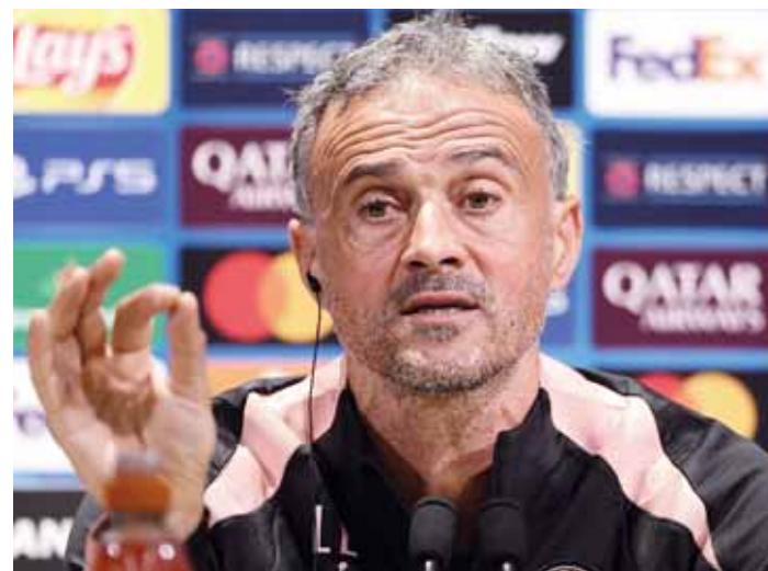
PSG coach Luis Enrique reacts during a press conference.

"I think we played really well against Girona. I understand that we didn't compete in the way that we wanted against Arsenal but I was pleased with what I saw," Luis Enrique said. "That goes for the whole season."