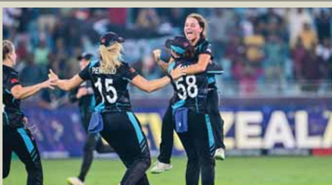
New Zealand's players celebrate their victory at the end of the ICC Women's T20 World Cup final against South Africa in Dubai.

On Sunday, New Zealand crushed the mighty India by eight wickets