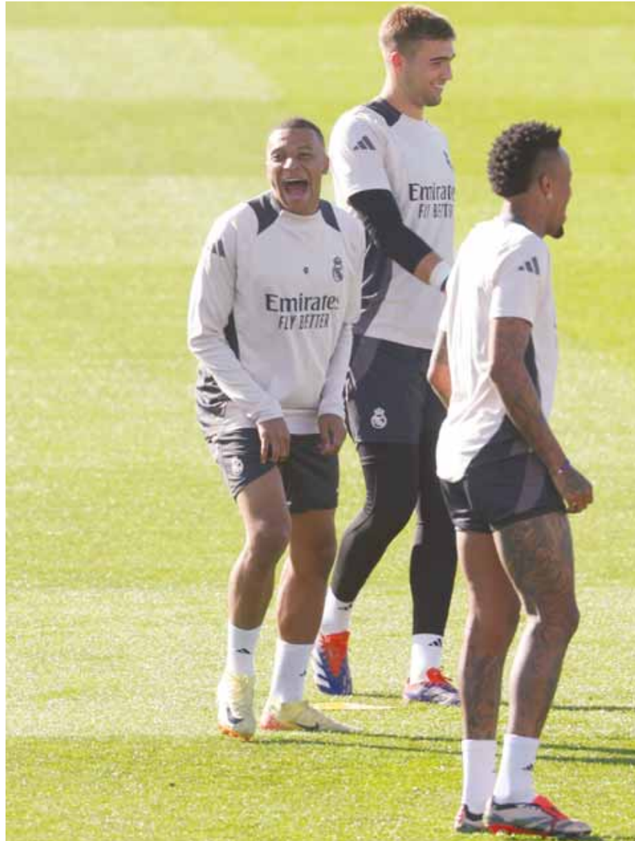
French forward Kylian Mbappe (left) has scored eight goals for Real Madrid in 12 games across all competitions this season.

"We find it harder to play a game based on possession and control because we don't have players with characteristics to play in reduced spaces. A back and forth game suits us well, but we're focussed on defending better as we