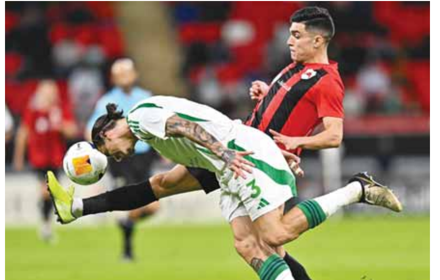
Al Rayyan lost to Al Ahli at the Ahmad Bin Ali Stadium.