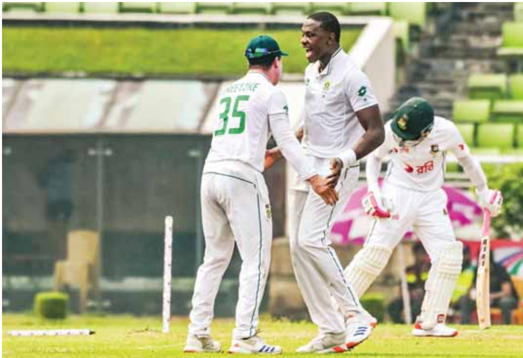
South Africa's Kagiso Rabada (centre) celebrates with teammate after taking the wicket of Bangladesh's Mushfiqur Rahim (right) during the first day of the first Test at the Sher-e-Bangla National Cricket Stadium in Mirpur, Dhaka, yesterday.

"With 16 wickets on day one, I'd say it's leaning towards the