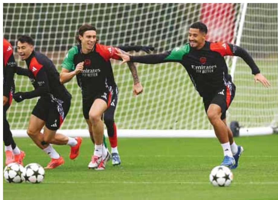
Arsenal's William Saliba (right), Riccardo Calafiori (centre) and Gabriel Martinelli during a training session in London yesterday.

Arteta also addressed the issue of red cards, after Saliba became the third Gunners' player to be sent off in eight Premier League games this season, following dismissals for Declan Rice and Leandro Trossard. "Playing with 10 men, obviously that is an issue," he said. "The