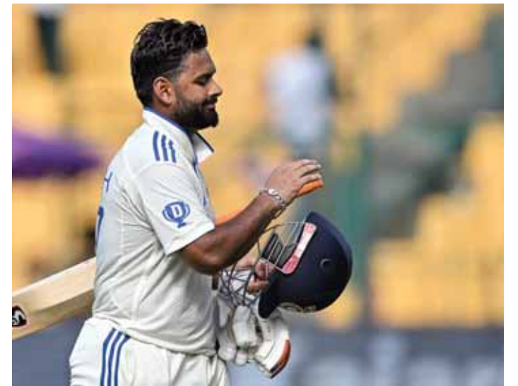
India's Rishabh Pant walks back to the pavilion after his dismissal during the fourth day of the first Test against New Zealand at the M Chinnaswamy Stadium in Bengaluru on Saturday.

This will be only the third Test match played at the MCA stadium in Pune. The first Test match there was played in 2016 and was won by Australia by a large margin of 333 runs.