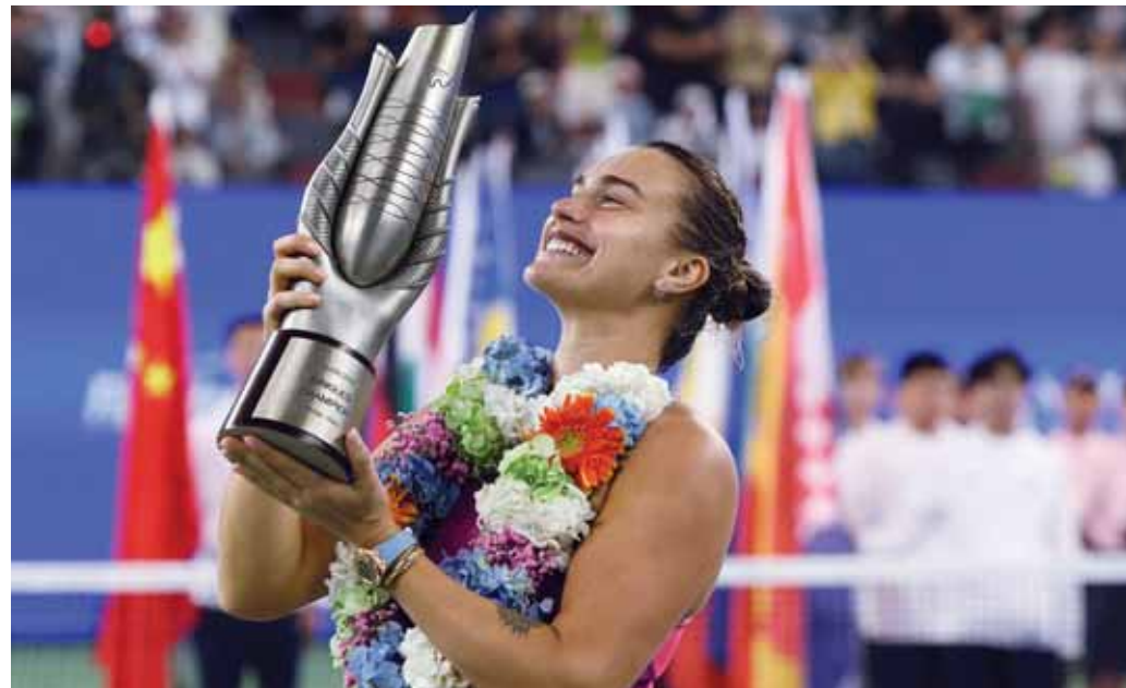
Belarus' Aryna Sabalenka celebrates with the trophy after winning her final match against China's Qinwen Zheng at the Wuhan Open on October 13, 2024.

The Finals will be held on hard courts in Riyadh from Nov. 2-9 and feature the top eight singles players and doubles teams.