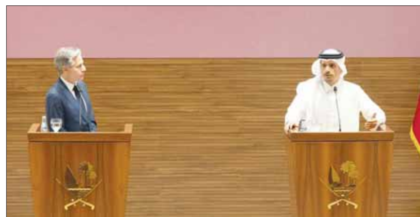
HE the Prime Minister and Minister of Foreign Affairs Sheikh Mohammed bin Abdulrahman bin Jassim al-Thani addressing a joint press conference with US Secretary of State Anthony Blinken in Doha yesterday.

"Unfortunately, in the past few days, we have seen an increase in Israeli attacks on the Gaza Strip, especially in the northern region. We condemn this siege on northern Gaza and the systematic bombing of hospitals and refugee camps. We have seen the situation develop into the dropping of explosive barrels on our brothers in Gaza. We believe that this painful phase that we are going through in the region must end as soon as possible in order to protect the innocent and civilians in the region." To Page 6