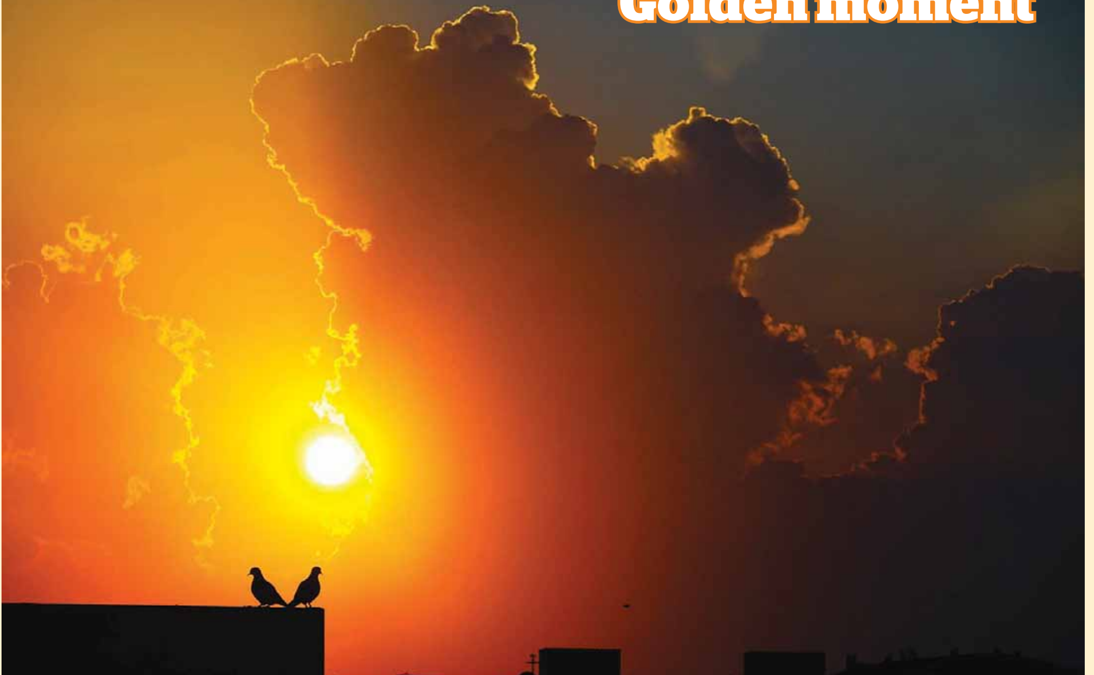
A pair of doves caught in a pensive moment shortly before sunset in Doha, to the backdrop of a spectacular cloud formation.