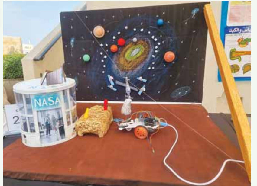
Students from various schools in Doha present scientific models at the exhibition.

Organisers noted that the event serves as a launch pad for promising young talent, providing recognition and encouragement for the next generation of scientists and innovators.