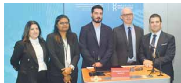
QPHI officials at the event.

Left: Some of the researchers who attended the programme.