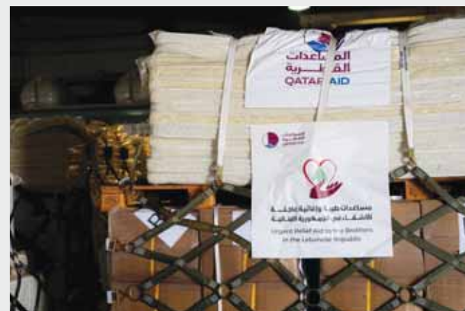
A Qatari Amiri Air Force aircraft arrived yesterday at Rafic Hariri Airport in Lebanon, carrying food, medical, and relief aid provided by the Qatar Fund for Development (QFFD), as part of the air bridge operated by the State of Qatar to provide relief to the fraternal Lebanese people as a result of the humanitarian crisis they are currently experiencing due to recent developments. The aid was received by the diplomatic staff of Qatar's embassy and representatives of the Lebanese government. (QNA)