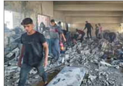
Palestinians inspect the site of an Israeli strike on a school in Nuseirat in the central Gaza Strip yesterday.

Medics at the Indonesian Hospital, one of three facilities still operating in the area, said one of their colleagues was killed by Israeli