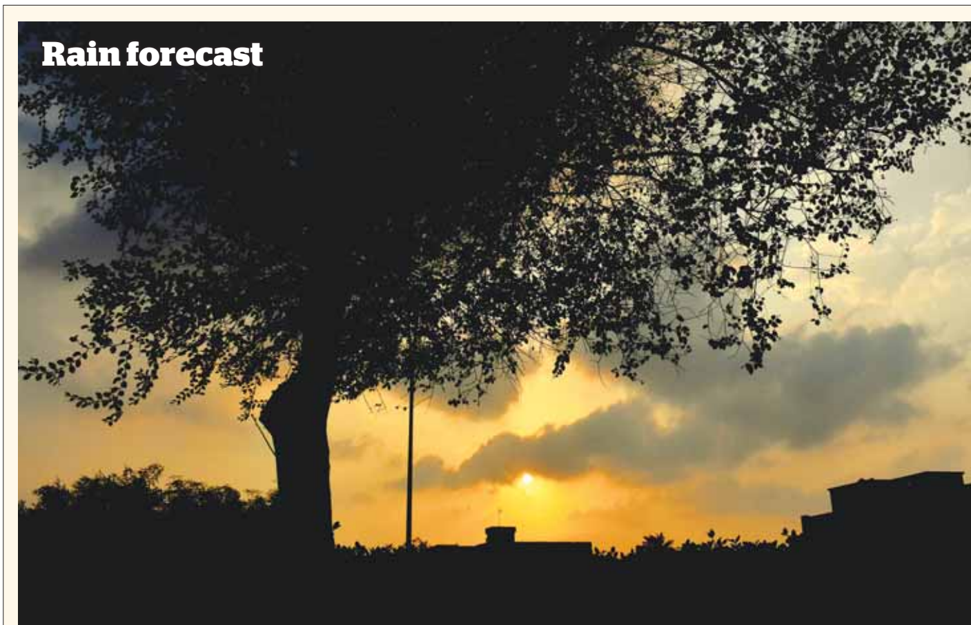
Light to thundery rain was reported from multiple locations across Qatar yesterday, the Met office said. For today, there is a thundery rain warning, associated with strong wind at places, both inshore and offshore. Yesterday's minimum and maximum temperatures were in the 23-30C and 32-38C range, respectively. Today's forecast for minimum and maximum temperatures are in the 26-28C and 30-33C range, respectively. Pictured is a sunset scene from Doha with rain clouds yesterday.

A specialised interactive session titled 'Case Study: An Integrated and Community-Based Approach to Combating NCDs,' will provide a practical platform to implement the strategies discussed during the workshop. The event is expected to draw significant interest from specialists as it addresses crucial aspects of public health management and the prevention of these diseases, which are essential to improving quality of life and reducing the economic burden imposed by NCDs.