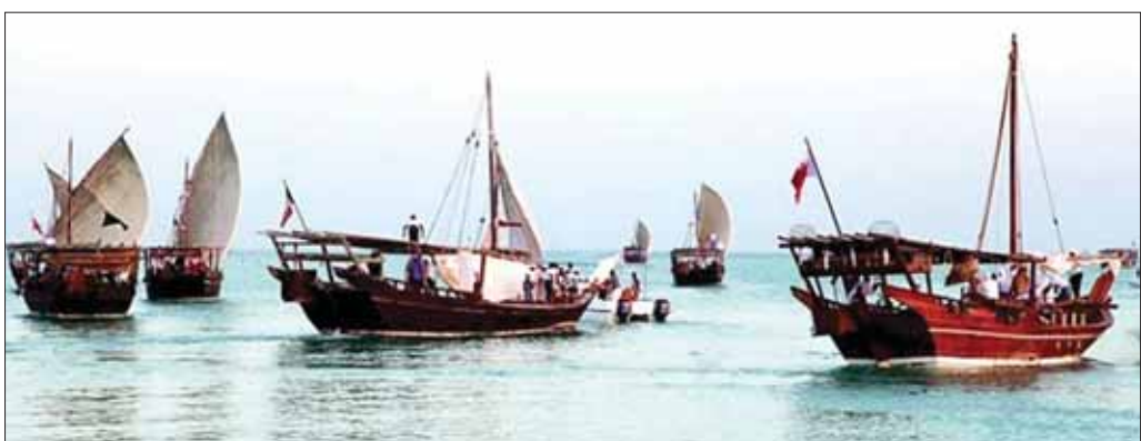
File photo of Qatari traditional boats.

He confirmed the formation of a distinguished team for this trip, and spoke of his great confidence in the success of the mission. He also said that the trip is expected to last for a month and two days, depending on the wind speed and transportation conditions. He pointed out that participation in the Sharjah Festival will end on January 7.