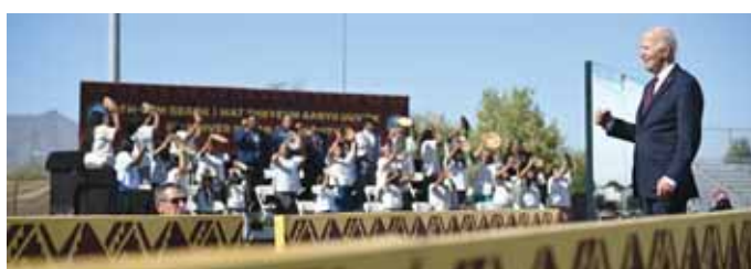
Biden gestures after speaking at the Gila River Crossing School in the Gila River Indian Community, in Laveen Village, near Phoenix.

when a pro-Palestinian protester shouted: "How can you apologise for a genocide while committing a genocide in Palestine?"