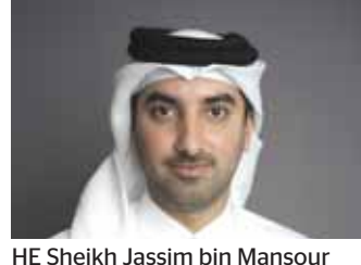
HE Sheikh Jassim bin Mansour bin Jabor al-Thani

The new headquarters features an advanced studio, the first of its kind in the region, equipped with the latest digital technologies for producing high-quality creative content to serve government institutions and boost their communi-