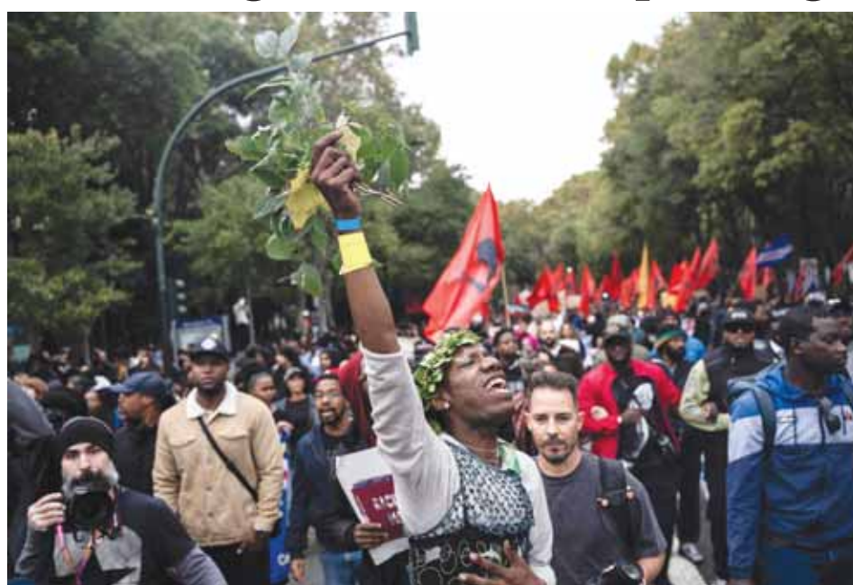
People shout slogans as they take part in a demonstration in Lisbon against police use of force and racism following a week of unrest sparked by the shooting of a black man by officers.

"This is not the first time one of our young people has been killed and there is no justice," he told AFP, while adding that he regretted the past week's violence.