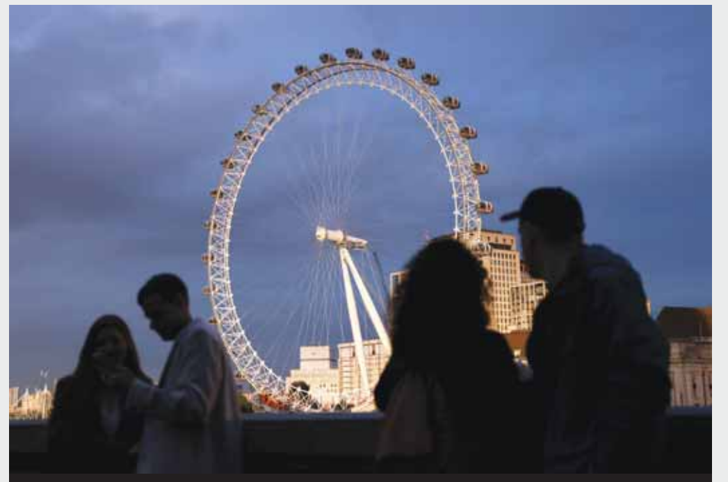
People look at the London Eye in London, Britain.