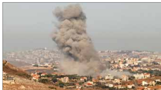
Smoke rises from the site of an Israeli air strike that targeted the southern Lebanese village of Kfar Roummaneh yesterday, amid the ongoing war between Israel and Hezbollah.

lier reported "the explosion of a large quantity of explosives in Lebanon" that was strong enough to trigger earthquake warnings in large parts of Israel.