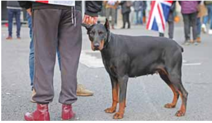
A person with a dog attends an anti-immigration protest, in London.

of anti-racism campaigners and trade unionists also took place nearby, with marchers carrying banners saying "Refugees Welcome" and "Smash the Far Right". Police officers were drafted in from around the country to avert