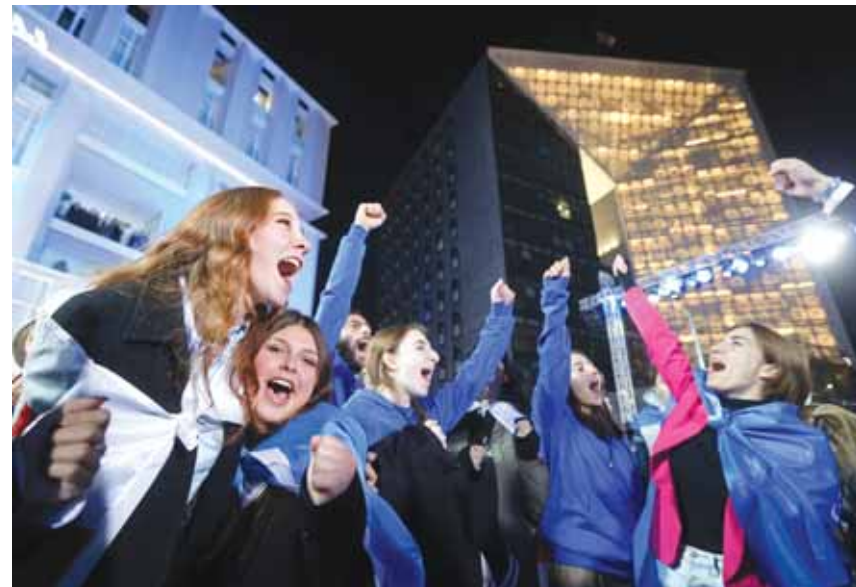
Supporters of the Georgian Dream party celebrate at the party's headquarters in Tbilisi after the announcement of exit poll results in parliamentary elections.

Georgian Dream's adoption of a controversial "foreign influence" law early this year targeting civil society sparked weeks