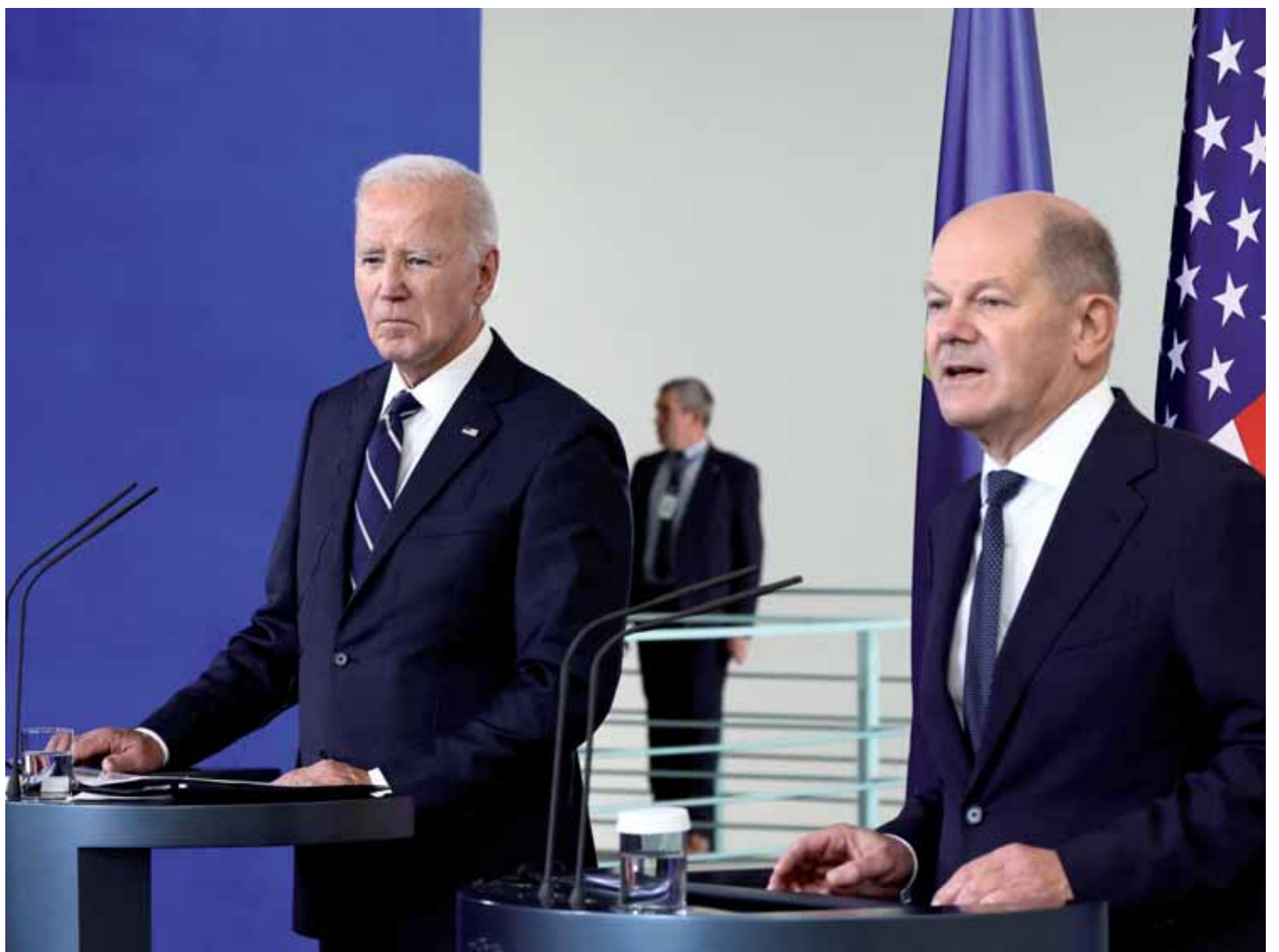
German Chancellor Olaf Scholz and US President Joe Biden give statements at the Chancellery in Berlin, Germany, on October 18.

• Friedrich Merz is Leader of the Christian Democratic Union.