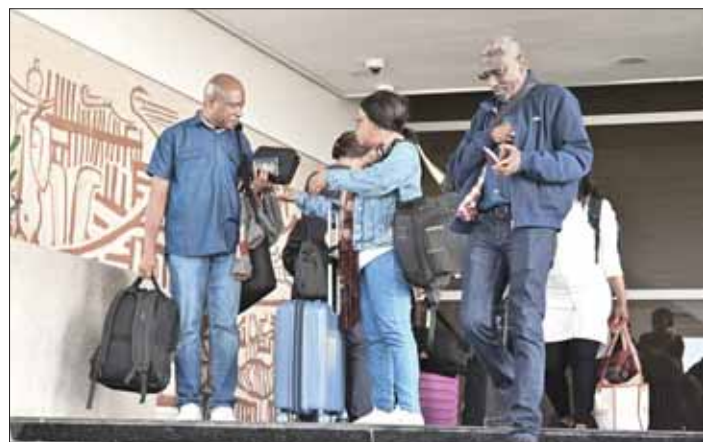
Ivorian diplomatic personnel repatriated from Lebanon due to the conflict between Israel and Lebanon carry their belongings during their arrival from Beirut at Felix Houphouet Boigny International Airport in Abidjan, yesterday.

engaged in counter-terrorism efforts, particularly along Ghana's northern border. "The Government of Ghana, through its State Security and Intelligence agencies, conducts continuous operations to prevent any terrorist infiltration or cross-border movement of militants and has been doing so over the years with notable successes," the statement said. Ghana shares a 600-km border with Burkina Faso, a country at the heart of an insurgency linked to Al Qaeda and Islamic State that has killed thousands and displaced millions across West Africa's Sahel region south of the Sahara. Insurgents have gained ground over the past 12 years despite costly foreign-backed military efforts to push them back.