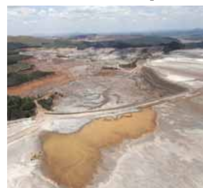
This picture taken in 2015 shows a general view of a dam in Mariana, Brazil, owned by Vale SA and BHP Billiton Ltd that burst.

Brazil on Friday signed a 170bn reais ($29.85bn) compensation agreement with miners BHP, Vale and Samarco for the Mariana dam collapse in 2015, one of the country's worst environmental disasters.