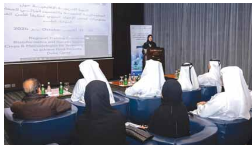
Director of the Agricultural Research Department at the Ministry of Municipality, Hamad Saket al-Shammari, emphasised the significance of peaceful atomic energy applications in agriculture, highlighting its critical role in addressing global food needs and fostering self-sufficiency in food production

technologies in agriculture align with environmental sustainability goals by minimising pesticide use and optimising water consumption, helping to protect natural resources for future generations.