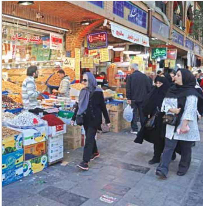
Iranians walk in Tehran Bazaar after several explosions were heard in the capital, yesterday.

Iran confirmed Israel targeted military sites in Tehran province as well as other areas, saying the