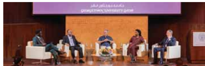
A panel discussion during the Open House.

T he Georgetown University in Qatar (GU-Q)'s 2024 Admissions Open House got underway with over 200 prospective students and their families in attendance.