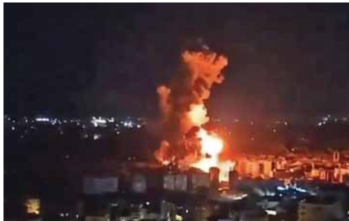
Explosions seen near Tehran, amid an Israeli attack on Iran, yesterday.

Israeli aircraft were reduced to firing a "small number of long-range missiles with very light warheads from a distance", inside the US-patrolled airspace of neighbouring Iraq, it added. Page 7