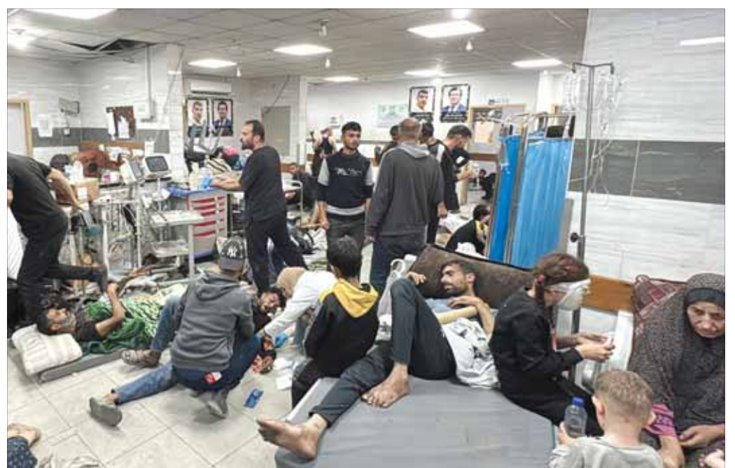
Wounded Palestinians receive treatment at the Kamal Adwan Hospital in Beit Lahiya the northern Gaza Strip yesterday.