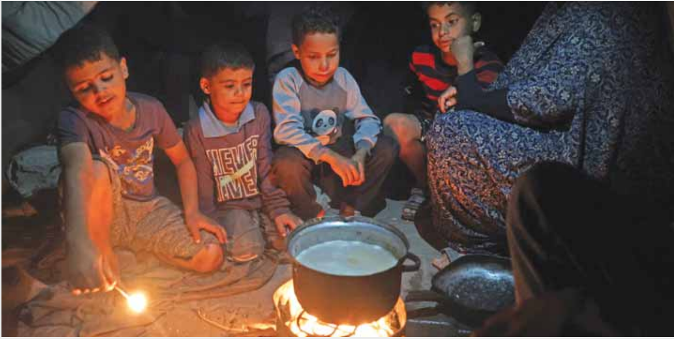
Palestinian children wait for a meal as they sit around a fire in the Bureij camp for Palestinian refugees in the central Gaza Strip, yesterday, amid the ongoing war between Israel and Hamas.