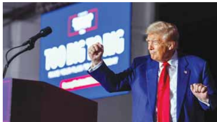
Trump dances on stage during a campaign rally at Suburban Collection Showplace in Novi, Michigan.

Trump, who swept the three Blue Wall states in his shock victory in 2016 only to see Joe Biden reclaim them for Democrats four years later, is strategising that clawing back one or more of the trio and winning the other so-called Sun Belt swing states would propel him back into the White House.