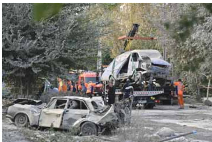
Municipal workers remove a destroyed car on the site of a Russian missile strike in Dnipro, eastern Ukraine.

"After everything that was said in Kazan, Russian murderers returned to their usual business," Ukrainian President Volodymyr Zelensky said yesterday. "This proves once again that aggression cannot be stopped by talking, but only by decisive actions in defence of the state."