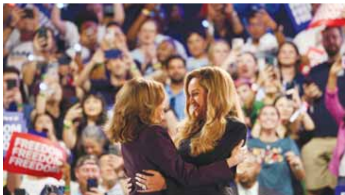
Beyonce and Harris embrace as they attend the vice-president's campaign rally in Houston, Texas.

Polls show a dead heat in the race's final days, and with more than 38mn people nationwide already casting early ballots, Ameri-