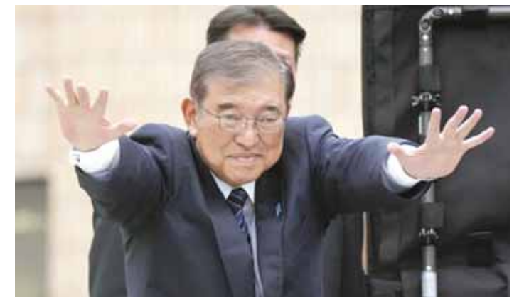
Japan's Prime Minister Shigeru Ishiba, leader of the Liberal Democratic Party, gestures at a campaign event in Tokyo.

Ishiba has set this threshold as his objective, and missing it would undermine his position in the LDP and mean finding other coalition partners or leading a minority