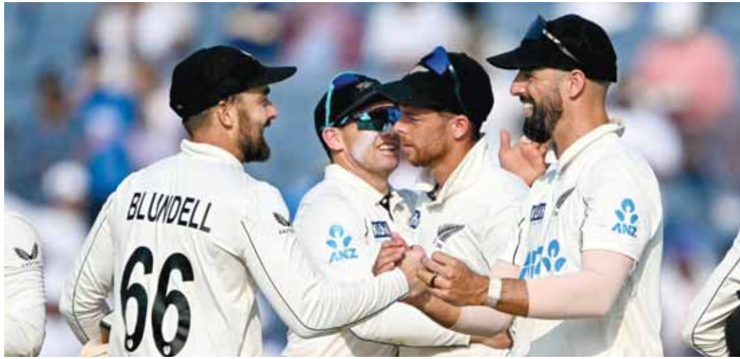
New Zealand's Tom Blundell (left), captain Tom Latham (second from left), Mitchell Santner (second from right) and Daryl Mitchell celebrate after their win against India on the third day of second Test in Pune yesterday.

India's highest successful run chase at home was the 387-4 they scored to beat England in Chennai