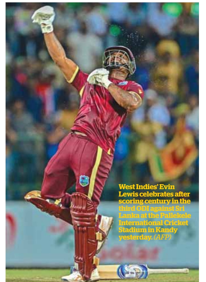
West Indies' Evin Lewis celebrates after scoring century in the third ODI against Sri Lanka at the Pallekele International Cricket Stadium in Kandy yesterday.

BRIEF SCORES: (23 overs) West Indies 196 for 2 (Lewis 102*, Rutherford 50*, Asitha 1-39) beat Sri Lanka 156 for 3 (Kusal 56, Nissanka 56, Chase 1-20) (DLS method)