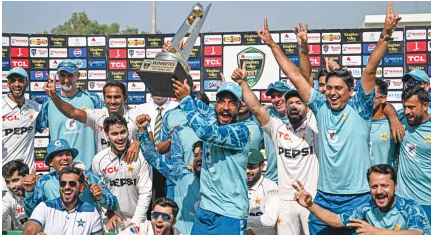
Pakistan's players and team officials celebrate with the series trophy after winning the third and final Test against England at the Rawalpindi Cricket Stadium in Rawalpindi yesterday.

Pakistan's spin skills leave England to reflect on muddled approach