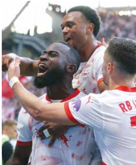
Leipzig's Lutsharel Geertruida (left) celebrates with teammates after scoring against Freiburg in the Bundesliga.

In yesterday's late game, Bayer Leverkusen were held 2-2 at Werder Bremen despite twice taking the lead. Bremen's Marvin Ducksch's 74-minute goal cancelled out Victor Boniface's opener. Leverkusen retook the lead three minutes later, Felix Agu blasting the ball into his