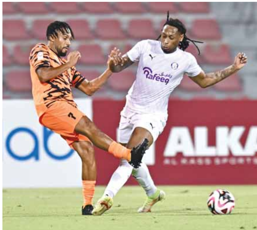
Umm Salal were held to a goalless draw by bottom-placed Al Khor at the Grand Hamad Stadium.