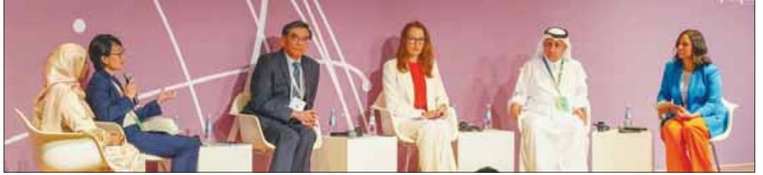
Panellists at a session.