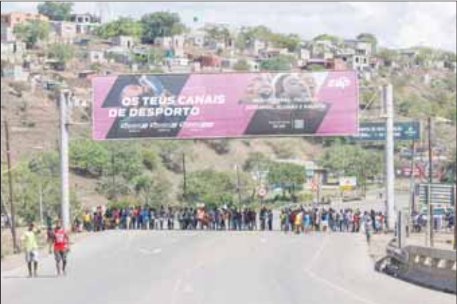
Protesters gather in the road towards the Ressano Garcia border post between Mozambique and South Africa, yesterday.

There was no confirmation from authorities but locals contacted by AFP also said police had opened fire on the crowd.