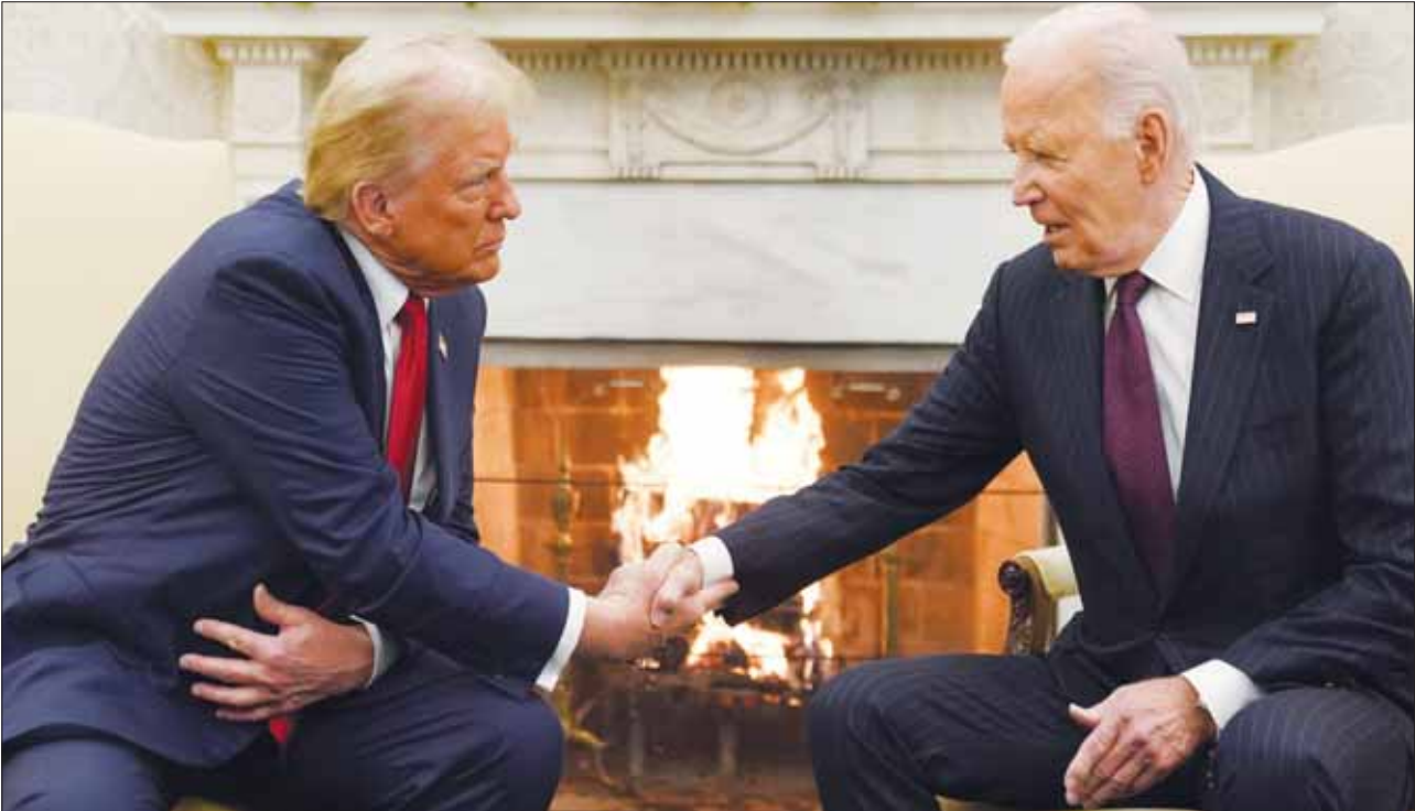
US President Joe Biden (right) shakes hands with President-elect Donald Trump in the Oval Office at the White House in Washington yesterday.

First lady Jill Biden joined Biden in greeting Trump on his arrival. The White House said she gave Trump a handwritten letter of congratulations for his wife, Melania Trump, and "expressed her team's readiness to assist with the transition." Biden, 81, has portrayed Trump as a threat to democracy, while Trump, 78, has portrayed Biden as incompetent. Trump made false claims of widespread fraud after losing the 2020 election to Biden.