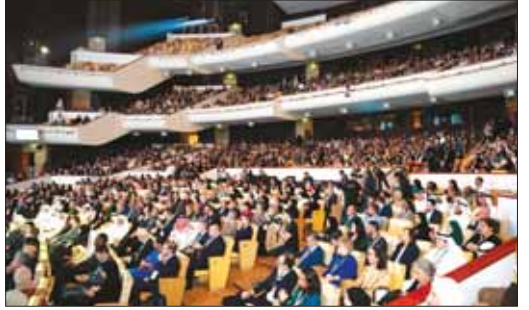
The delegates at the opening session.

"People don't think they might be susceptible to breast or cervical cancer," he said. "But nobody is shielded. And while there has been tremendous progress over the last few decades, there is still much