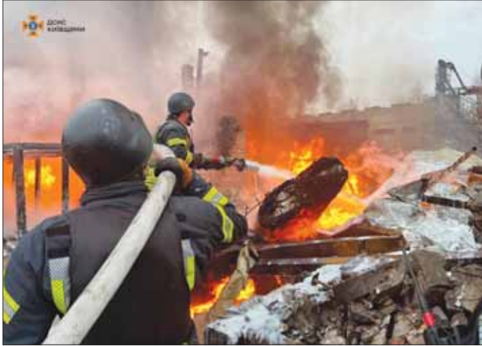
Firefighters work at the site where an industrial area was hit by a Russian missile strike in Kyiv region yesterday.

AFP journalists heard explosions ring out over Kyiv and saw dozens of residents seeking shelter in an underground metro station in the centre of the capital.