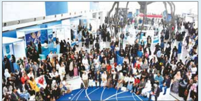
A session at WISH yesterday.

finding a balance between supporting the domestic agenda, as