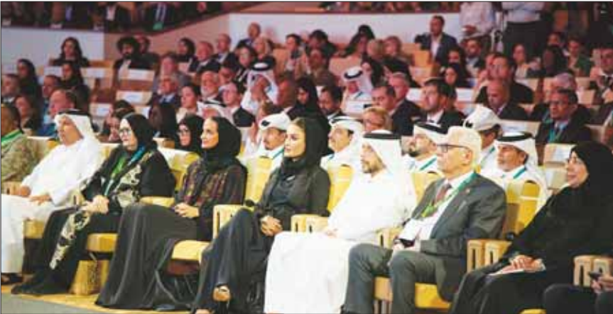
Her Highness Sheikh Moza bint Nasser and other dignitaries at the opening of the 7th edition of the biennial World Innovation Summit for Health (WISH).