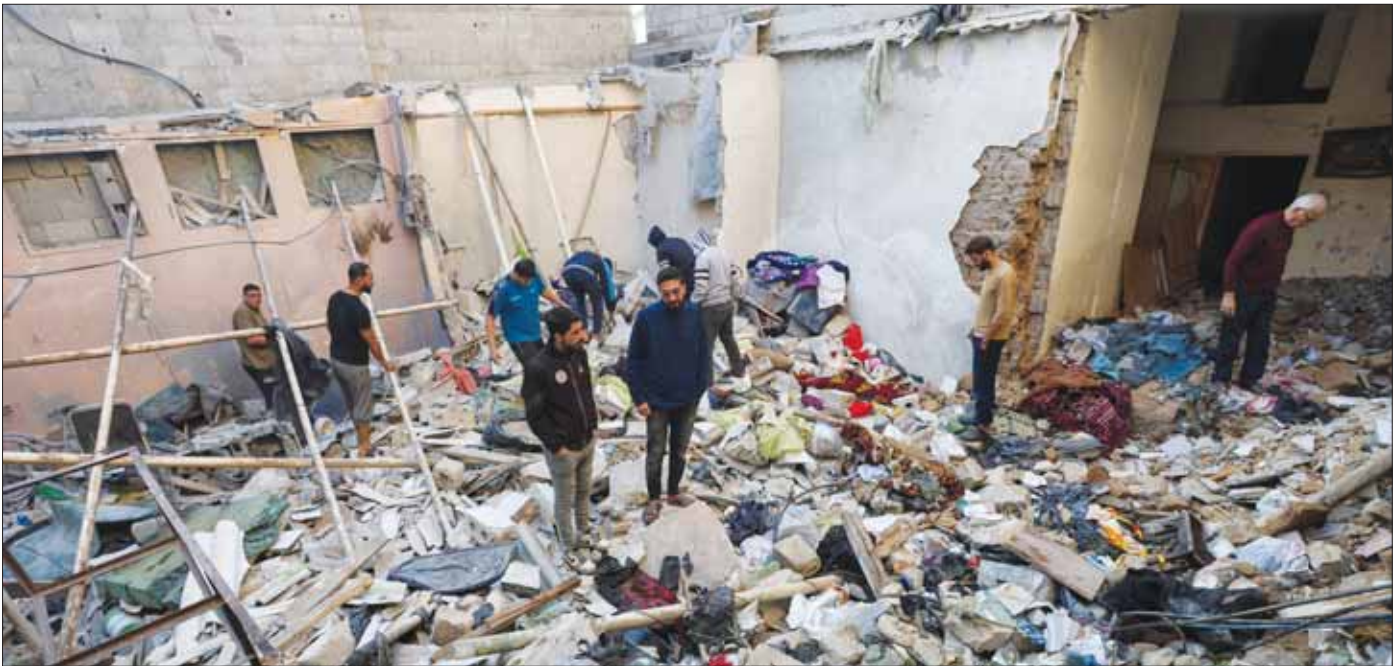
Palestinians inspect the site of an Israeli strike on a house in Nuseirat in the central Gaza Strip, yesterday.