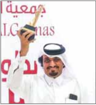
young falconer category (6-10 years). The value of these prizes ranged from QR2,000 to QR6,000.

The 6th Ras Laffan Falcons Championship concluded yesterday. The championship was organised by Al Gannas Qatari Society and sponsored by Ras Laffan Community outreach Programme and the supporting companies. The concluding day witnessed the finals of Al Da’aw (falcons speeding) competitions with three top winners taking home cash prizes of QR60,000, QR50,000 and QR30,000, respectively. Encouragement prizes were given to the winners of the promising falconer category (11-14 years), and those of the