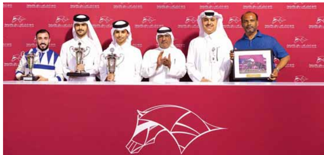
Connections of Return To Senders celebrate after the seven-year-old horse won Rowdat Rashid Cup at the Al Rayyan Park yesterday.