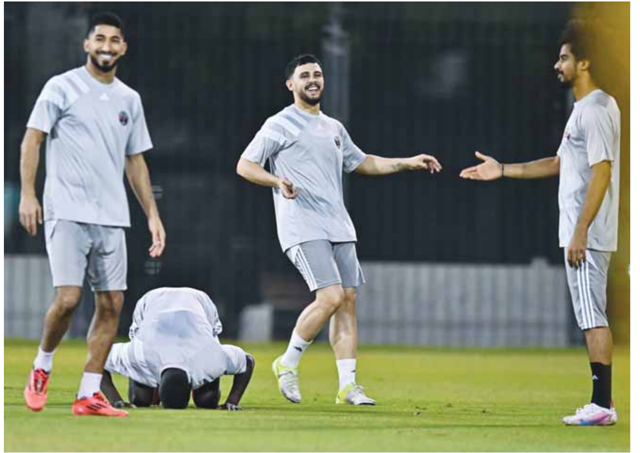
Qatar players share a light moment during a training session at the Aspire yesterday, on the eve of their World Cup qualifying match against Uzbekistan.