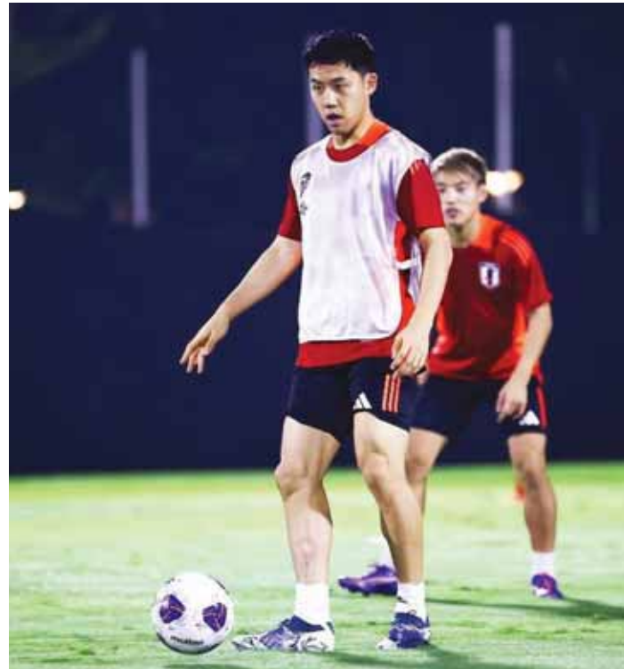
Japan midfielder Wataru Endo trains in Jakarta yesterday, ahead of his team's 2026 World Cup qualifying match against Indonesia.

With the third Asian qualifying round nearing the halfway point, Japan are five points clear at the top of Group C from Australia and