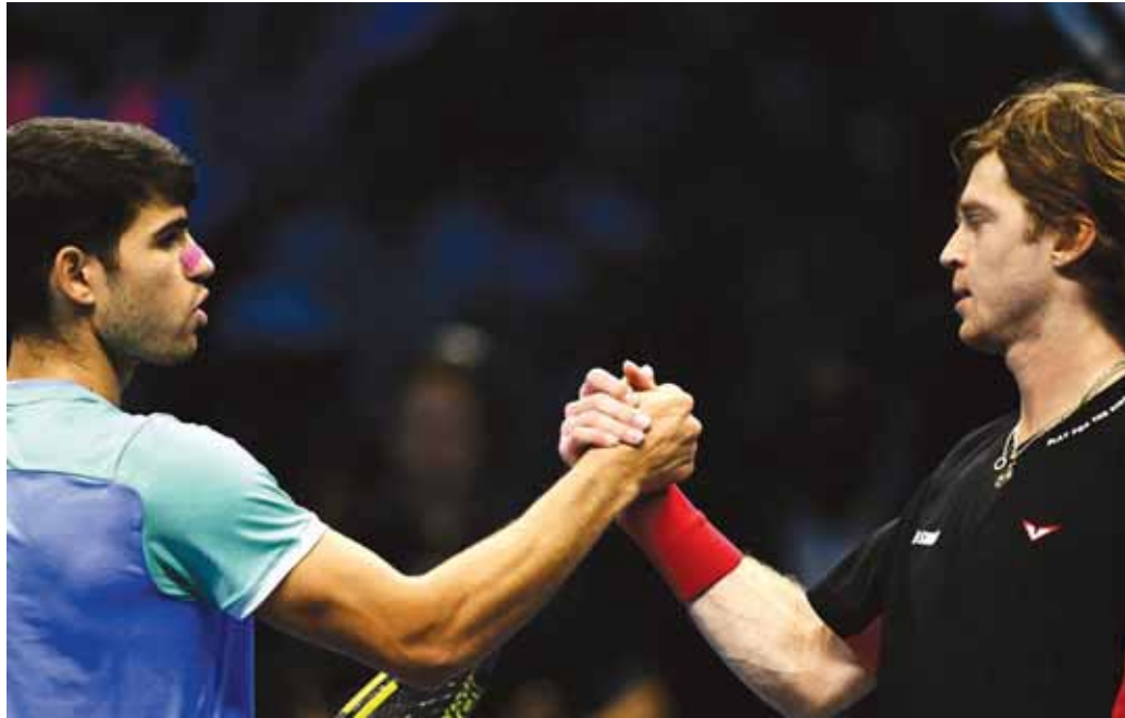
Spain's Carlos Alcaraz (left) shakes hand with Russia's Andrey Rublev after winning his match in the ATP Finals in Turin yesterday.

Both players served well to take the match into a high-octane tiebreak in which Alcaraz forged ahead but had to fend off two set points before sealing victory.