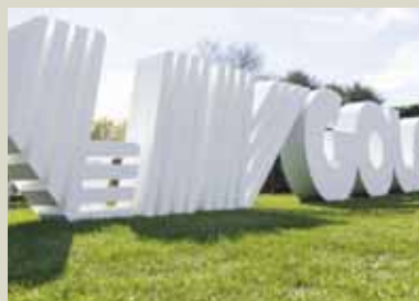
The league also unveiled the dates for four of its returning tournaments: June 27-29: LIV Golf Dallas, Maridoe Golf

Players will battled for the 2025 LIV Golf League championship there, also looking to secure their positions for 2026. Team-event seedings also will be determined there.