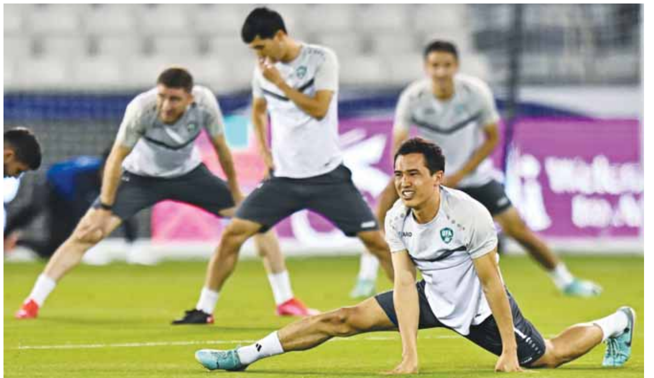
Uzbekistan players train at the Jassim Bin Hamad Stadium yesterday.

"If we manage to beat Qatar, our chances will improve even further," he said. "We're fully focused on getting those three points. Qatar is right behind us in the standings. We must do everything we can to keep