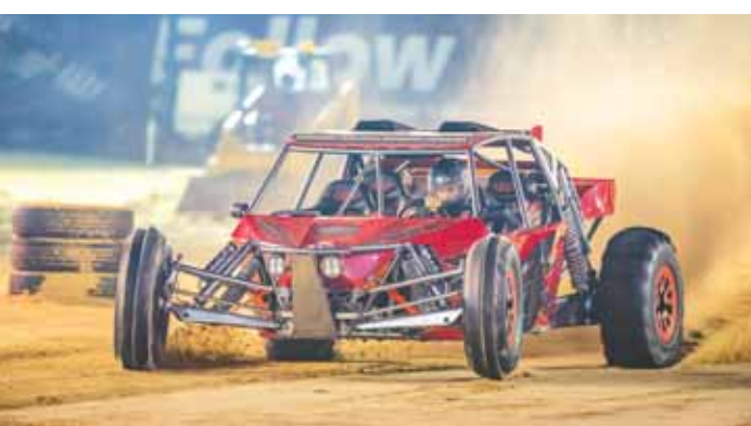
Action from last edition of Qatar Sand Drag Race Competition.