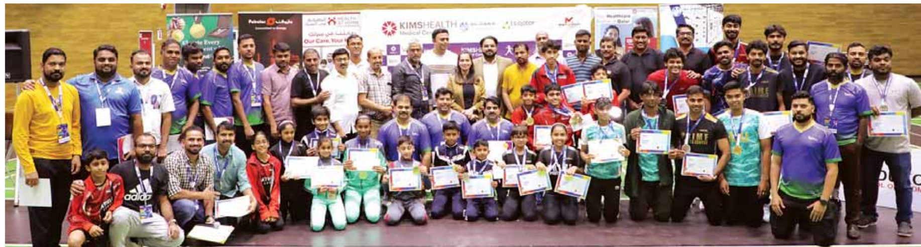
The 2nd International Open Badminton Tournament, organised by Expats Sportev over four days, drew hundreds of badminton enthusiasts from various nationalities and top academies across Qatar. Competitions were held in 22 categories, offering singles and doubles matches for players of different grades and ages, from children to adults.