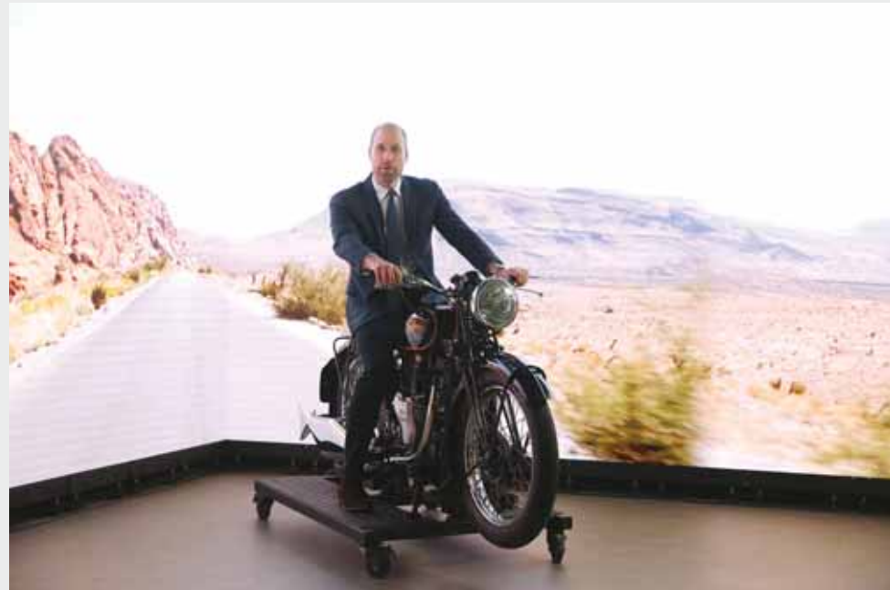
Prince William tries out a motorbike in the state-of-the-art Virtual Production Studio, where students are developing their skillsets in virtual production, during a visit to Ulster University's Belfast City Campus Centre. The prince was briefed on the work being carried out to solidify Northern Ireland as a global leader of creative excellence and innovation by developing and upskilling the future workforce and expanding technological capabilities.