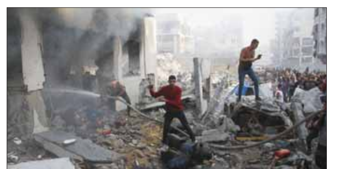
Palestinians inspect the damage at a school sheltering displaced people, after it was hit by an Israeli strike, in Gaza City yesterday.

A UN-backed assessment at the weekend warned famine was imminent in northern Gaza, the site of an intense Israeli offensive since early October.