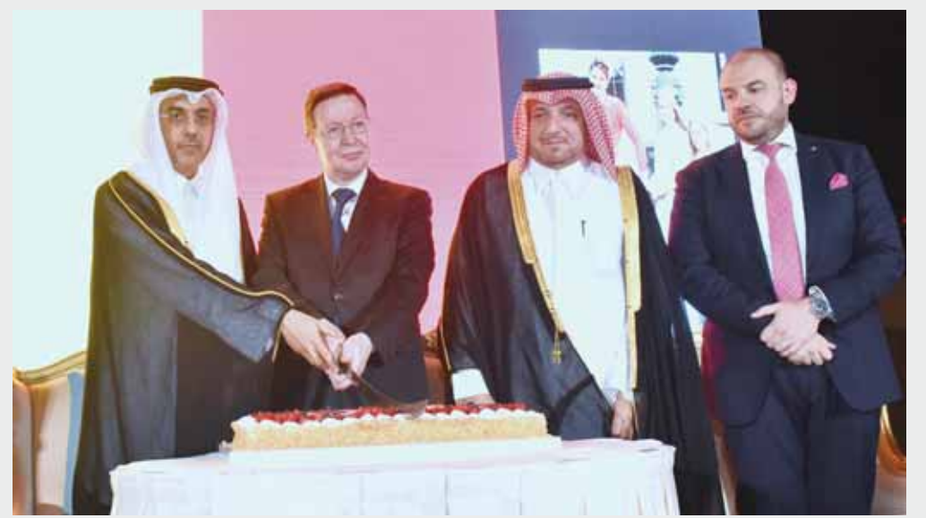
Belgium ambassador William Asselborn is joined by Qatar's Minister of Labour HE Ali bin Saeed bin Smaikh al-Marri in cutting a ceremonial cake yesterday at a reception on the occasion of the King's Day 2024. Ministry of Foreign Affairs' Department of Protocol director ambassador Ibrahim Fakro and other dignitaries were present.