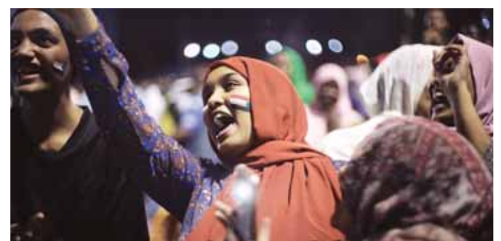
A still from Sudan Remember Us .

The documentary delves deep into the untold stories of Sudan, bringing forward young voices of resilience, dignity, and hope in the face of turmoil, and highlights the strength of the Sudanese people in their struggle for peace and unity. The film premiered at the Venice Film Festival earlier this year. In a press statement, DFI CEO and fe-