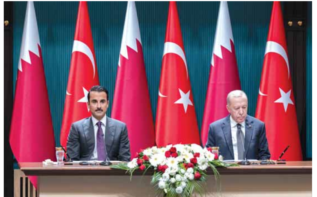
His Highness the Amir Sheikh Tamim bin Hamad al-Thani with Turkish President Tayyip Erdogan in Ankara yesterday.

The third session in Doha in 2017 resulted in agreements and MoUs on mutual legal assistance in criminal matters, university research collaboration, central banking, tourism, legal training,