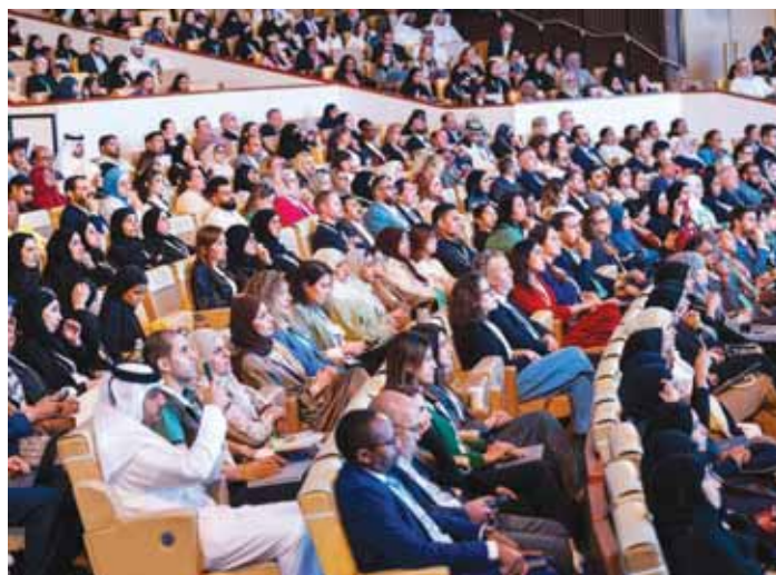
A view of the audience at WISH 2024 yesterday.

Cardiovascular disease (CVD) is the world's leading cause of death - taking more than 20mn lives per year, with up to 80 percent of these deaths occurring in low and middle-income countries. Most