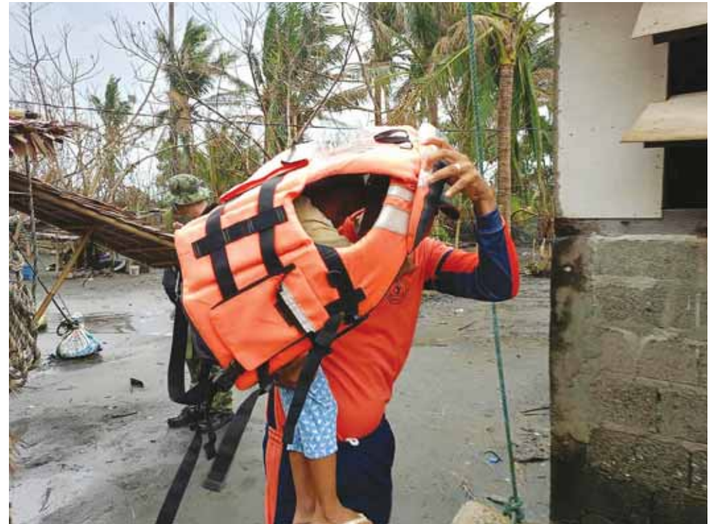
A rescuer carries a young resident during a forced evacuation operation in Buguey town, Cagayan province, north of Manila, ahead of super typhoon Usagi's landfall.

But investors worry his desire to revisit the terms of the IMF bailout could delay future disbursements, making it harder for Sri Lanka to hit a key primary surplus target of 2.3% of GDP in 2025 set by the IMF.