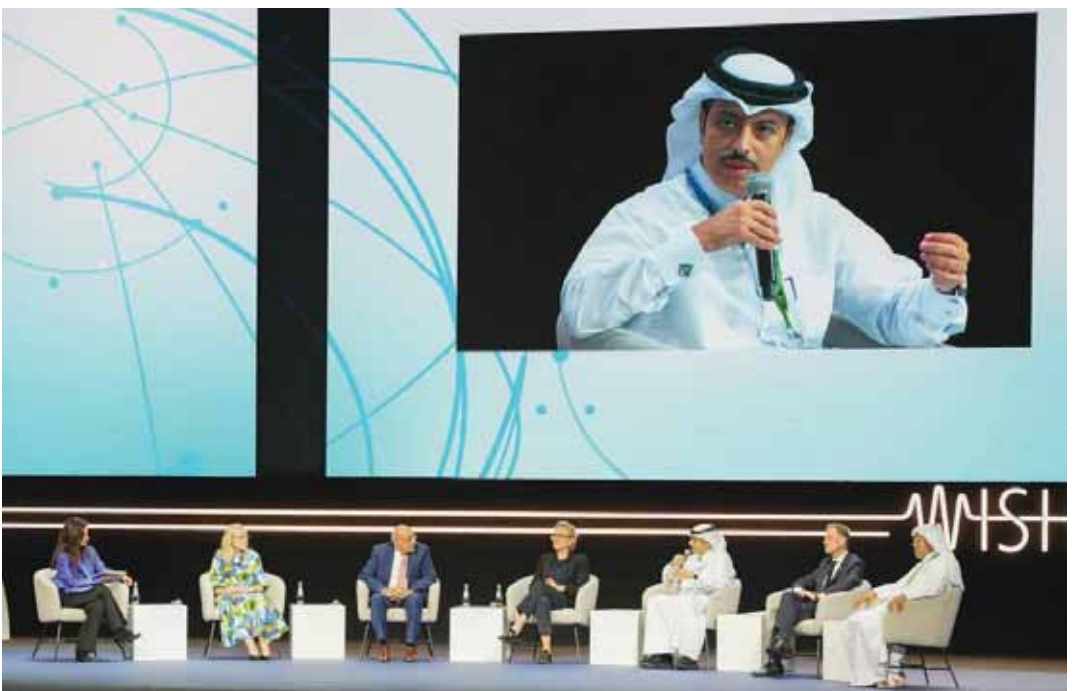
Sheikh Dr Mohammed bin Hamad al-Thani addressing WISH 2024.

He added that one of the programme's key strengths is its tailored, data-driven approach,