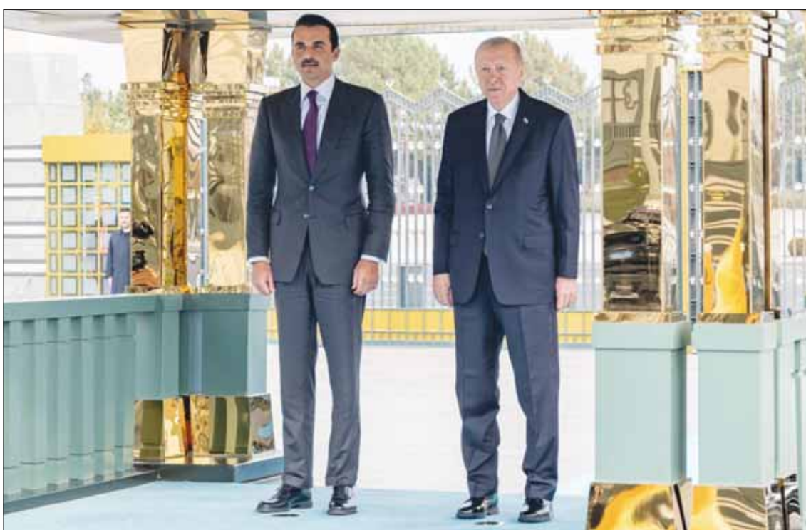
Amir, Erdogan witness signing of agreements