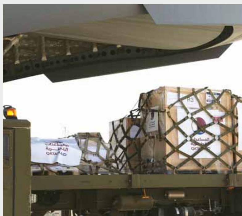
Qatar Development Fund (QFFD) has sent a Qatar Amiri Air Force aircraft carrying 16 tonnes of humanitarian aid to Afghanistan. In a statement yesterday, QFFD explained that this aid includes basic medical supplies and four ambulances. This initiative comes within the framework of the State of Qatar's ongoing efforts to enhance international co-operation and meet the urgent humanitarian needs of the people of Afghanistan. (QNA)