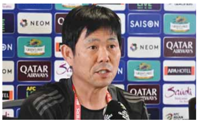
Japanese coach Hajime Moriyasu attends a press conference yesterday, on the eve of their 2026 World Cup Asian qualification match against Indonesian at Bung Karno Stadium in Jakarta.

"The Indonesian national team is very different from before," said Moriyasu.