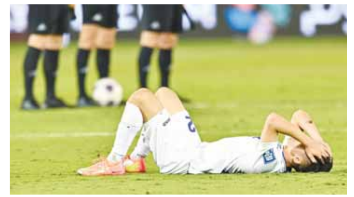
An Uzbekistan player can't hide his disappointment after heart-breaking defeat to Qatar at the Jassim Bin Hamad Stadium.