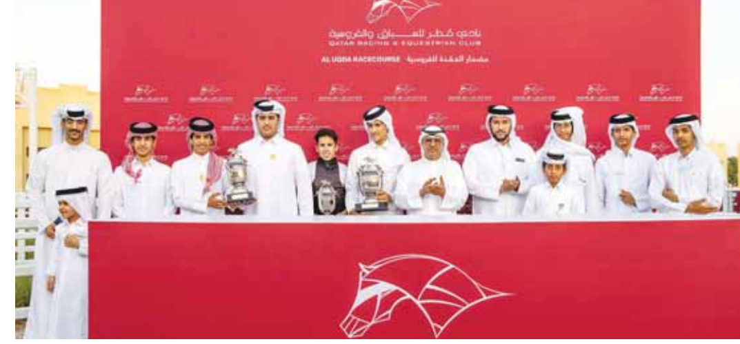
Connections of Medan celebrate after the grey mare won the Umm Bab Cup at the Al Uqda Racecourse yesterday.