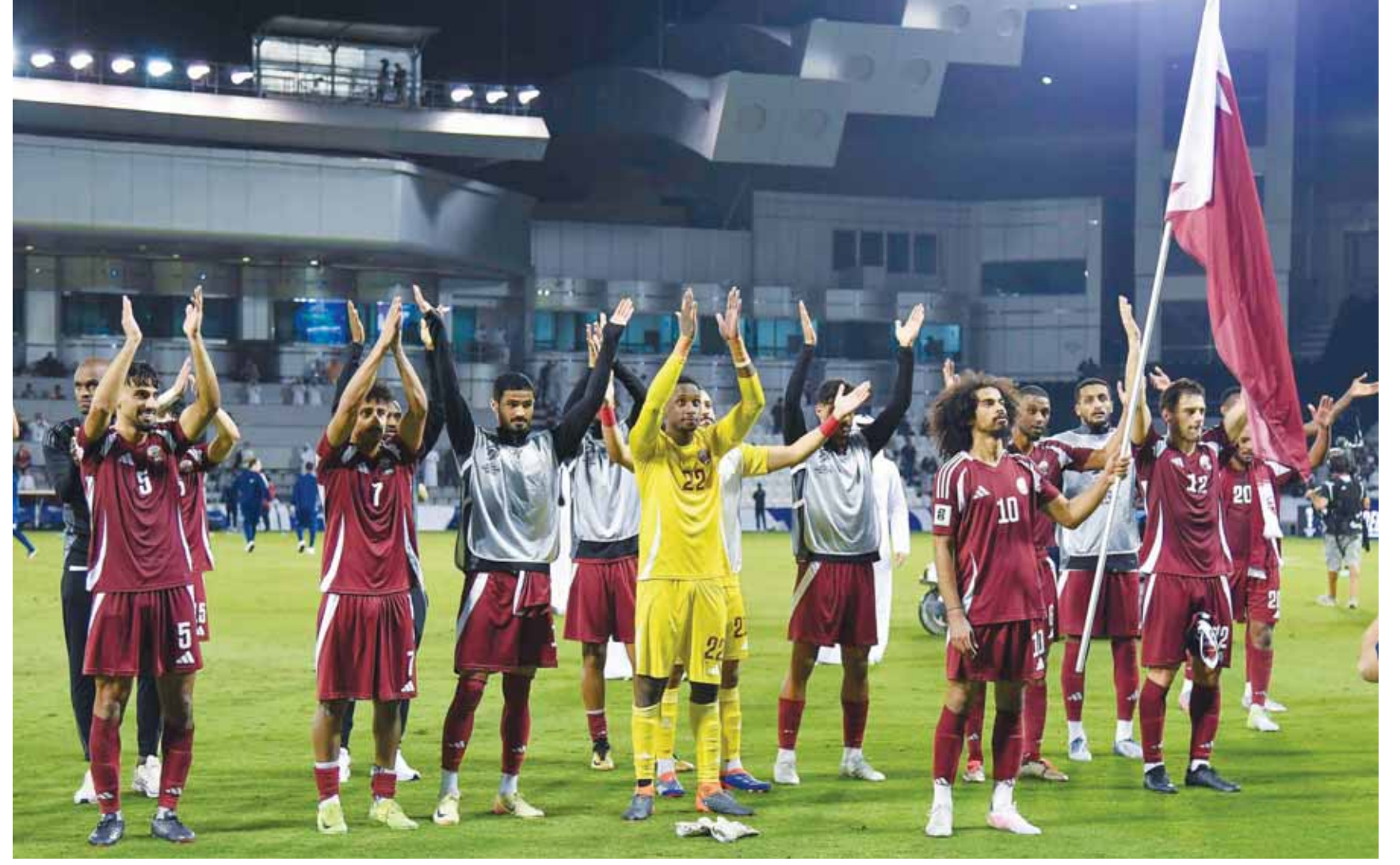
Star striker Akram Afif holds the Qatar flag as he celebrates with teammates after Al Annabi's thrilling victory over Uzbekistan in the 2026 World Cup qualifying match at the Jassim Bin Hamad Stadium yesterday.