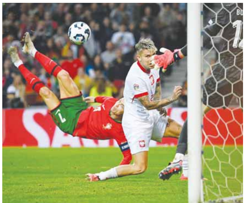
Portugal's forward Cristiano Ronaldo (left) scores a spectacular goal during the UEFA Nations League football match against Poland in Porto.

The hosts broke from the resulting corner to score less than 60 seconds later, as Leao powered forward before finding