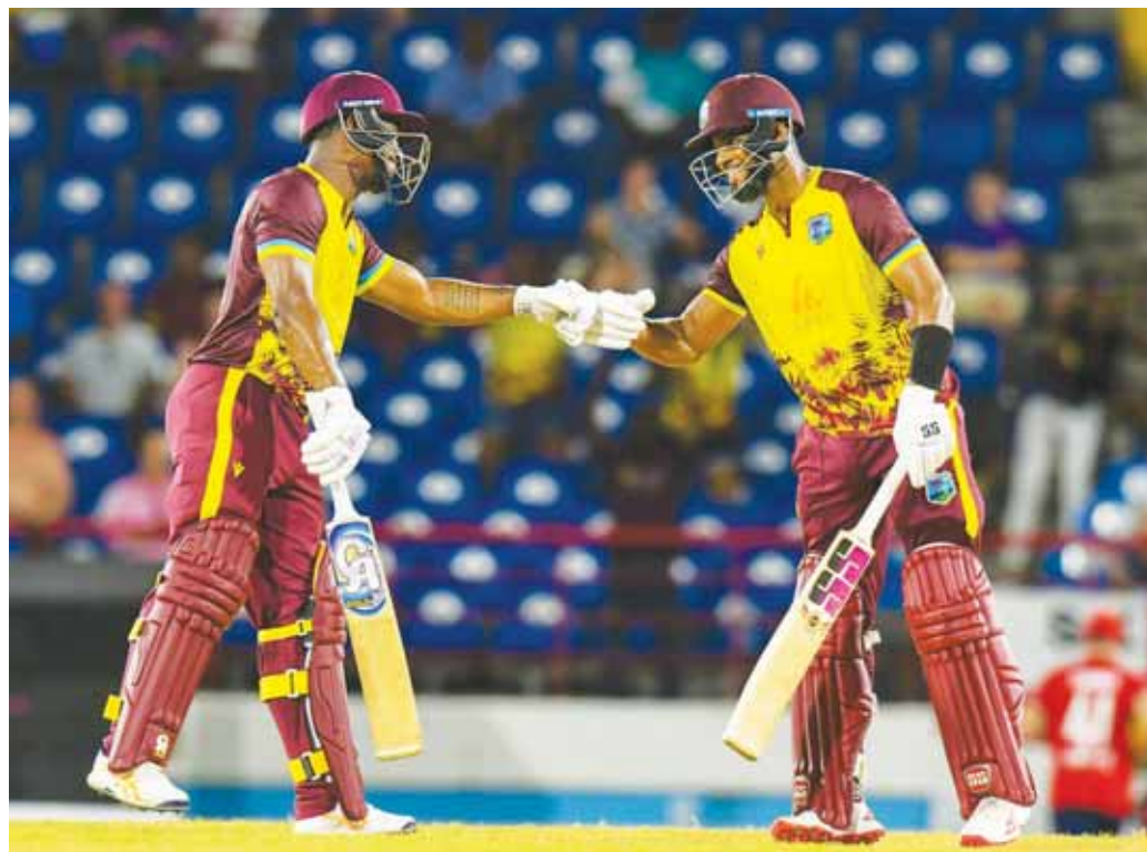
Evin Lewis (left) and Shai Hope of West Indies celebrate their 100-run partnership during the 4th T20I match against England at Daren Sammy Cricket Ground in Gros Islet, Saint Lucia, on Saturday.

Salt, who now has 640 runs against West Indies in T20 cricket