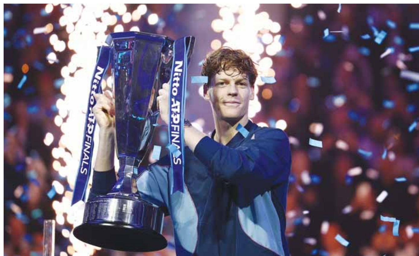
Italy's Jannik Sinner celebrates with the trophy after winning the ATP Finals against Taylor Fritz of the US at Inalpi Arena, Turin, Italy, yesterday. Sinner won 6-4, 6-4.

'It's amazing, it's my first title in Italy and it means so much to me'