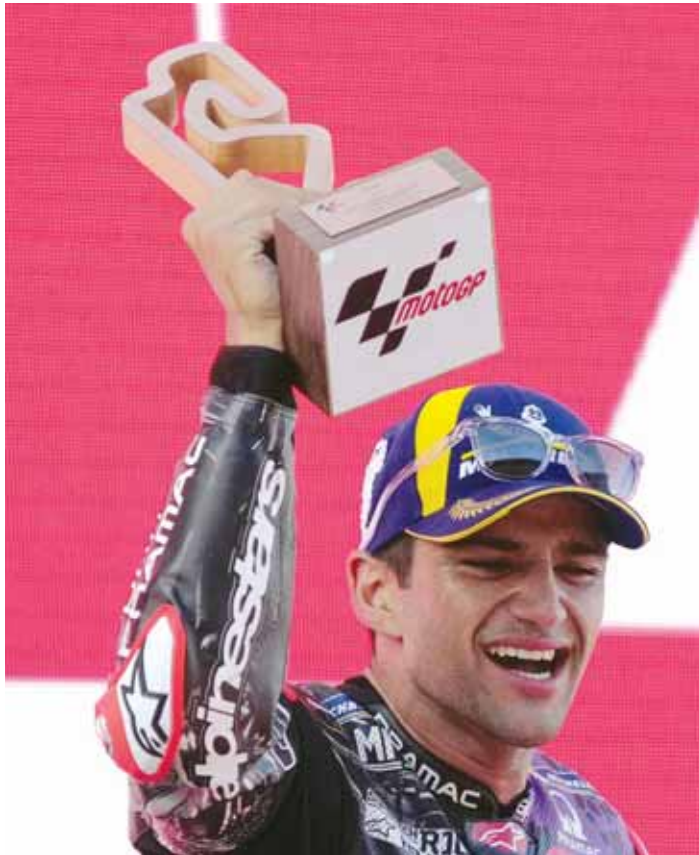
The new world champion Ducati Spanish rider Jorge Martin celebrates on the podium after winning the MotoGP Solidarity Grand Prix of Barcelona at the Circuit de Catalunya in Barcelona yesterday.

After finishing third in Saturday's sprint he knew he had only to finish in the top nine to secure the title, turning the tables on Bagnaia who went into last year's final race with a 21-point lead. Bagnaia,