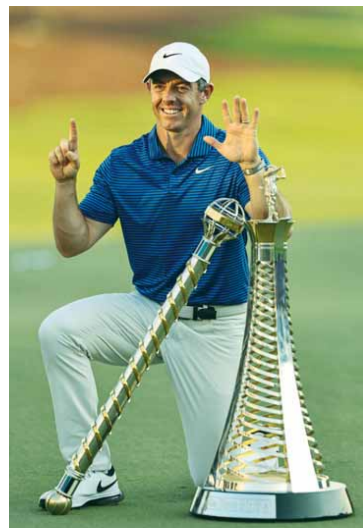
Northern Ireland's Rory McIlroy gestures as he poses for a picture with the trophy after winning the DP World Tour Championship at Jumeirah Golf Estates in Dubai yesterday.