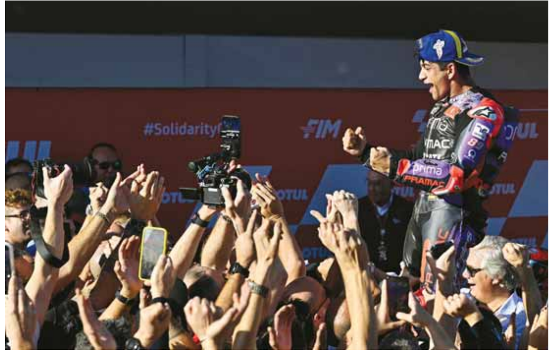
Prima Pramac Racing's Jorge Martin celebrates with teammates after winning the MotoGP World Championship yesterday.