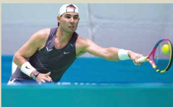
Spain's Rafael Nadal plays a return during a training session ahead of the Davis Cup at the Martin Carpena sports hall in Malaga, Spain.

decisions based on the fact that it's my last week as a professional tennis player." French Open and Wimbledon champion Carlos Alcaraz will be Spain's leading player and his presence offers Nadal a real chance of retiring on a high note. "Probably one of the most special tournaments that I'm going to play. Last tournament of Rafa, I'll be able to be next to him in the last moments on a tennis court for him," said Alcaraz who played alongside Nadal in doubles at the Olympics in Paris this year. "I think it's most important for Rafa, for his last tournament. I really want him to retire with a title. It's going to be really, really emotional and a really special tournament for me." Representing Spain, Nadal won singles gold at the Beijing Olympics in 2008 and triumphed in the doubles at Rio 2016 alongside Marc Lopez. But former world number one Nadal's injury setbacks in the twilight of his career