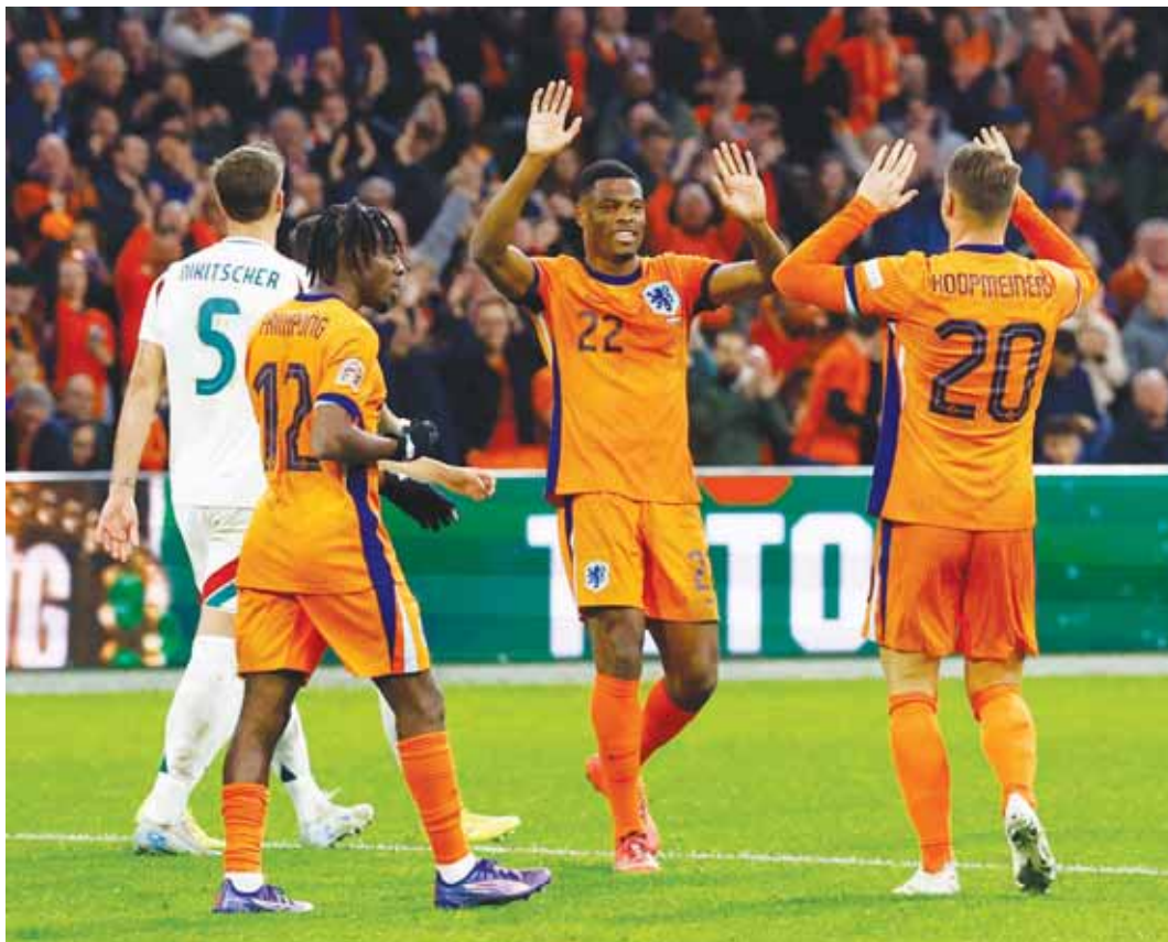
Netherlands' Teun Koopmeiners celebrates with teammates after scoring their fourth goal against Hungary during the Nations League match in Amsterdam.

Denes Dibusz was the busier of the two goalkeepers as the first period wore on and had to be alert to