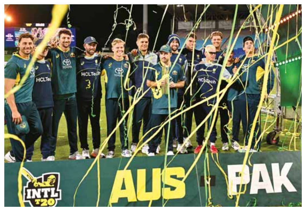
Australia players celebrate with the trophy after the third Twenty2O against Pakistan at the Bellerive Oval in Hobart yesterday. Australia won the match by seven wickets to take the three-match series 3-O.