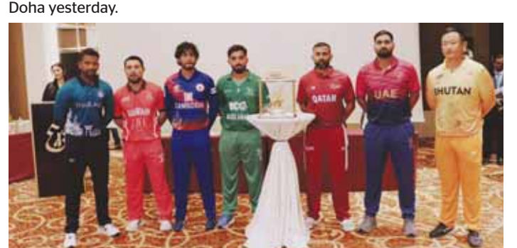
Captains of Qatar, Saudi Arabia, Bhutan, Bahrain, Thailand, the UAE and Cambodia pose with the trophy yesterday.