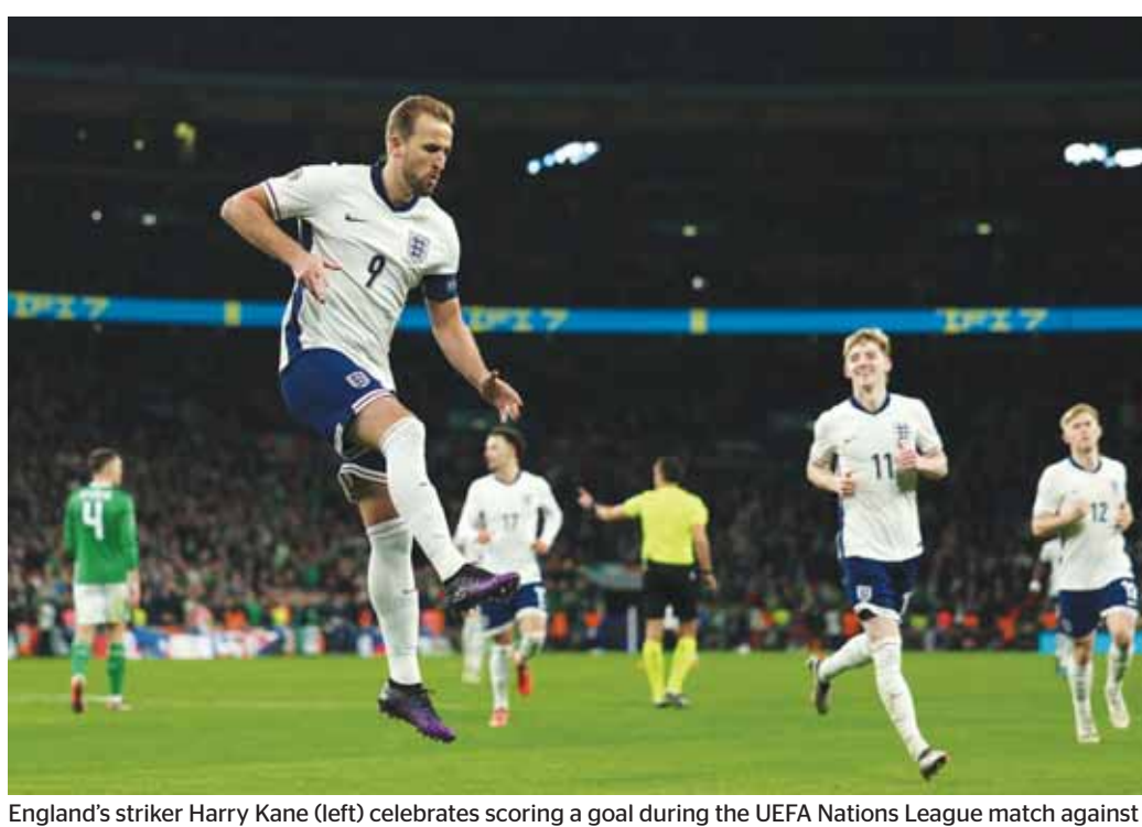
Ireland at Wembley Stadium in London.

told the Press Association. I don't like to look too far ahead