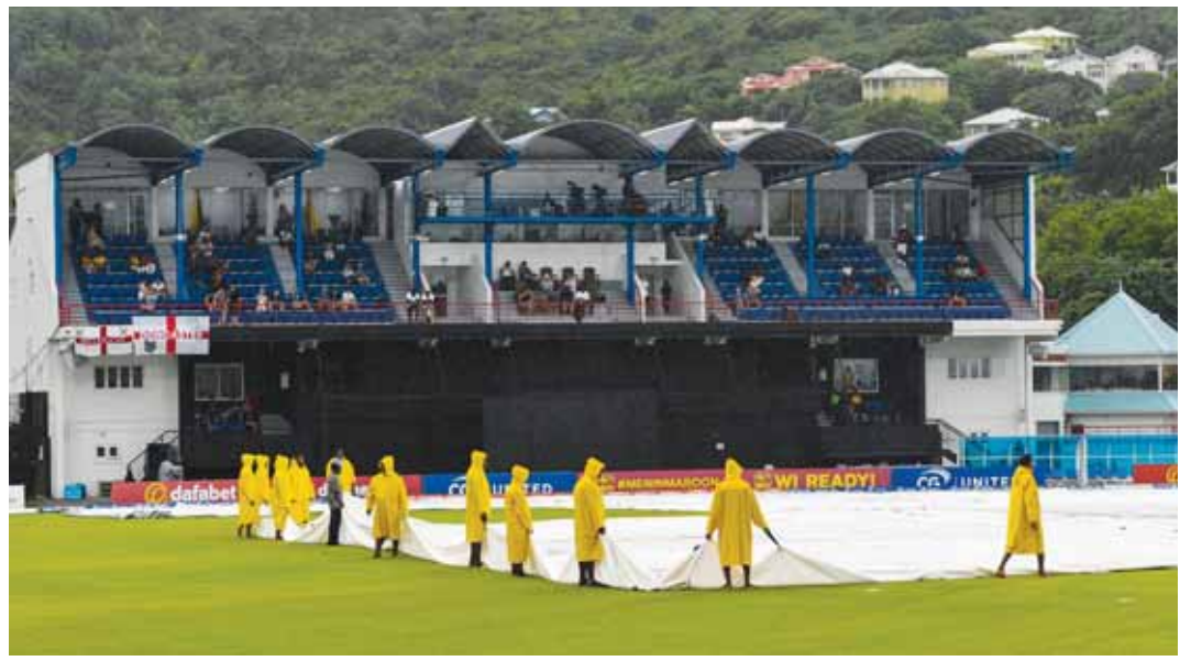
Ground staff cover the field during a rain delay of the 5th T2OI cricket match between England and West Indies and at Daren Sammy Cricket Ground in Gros Islet, Saint Lucia, on Sunday.