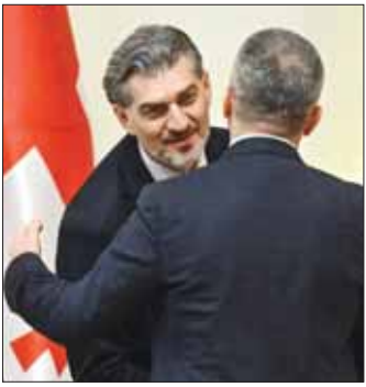
Mikheil Kavelashvili (left) is congratulated by lawmakers after being elected as Georgia's new president at the parliament in Tbilisi.