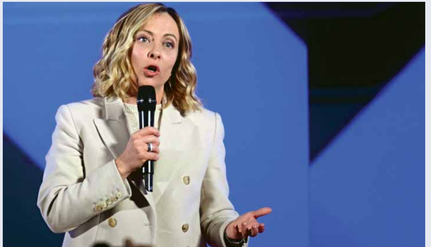
Italian Prime Minister Giorgia Meloni speaks during the Atreju political meeting organised by the young militants of Italian right wing party Brothers of Italy (Fratelli d'Italia) yesterday in Rome.