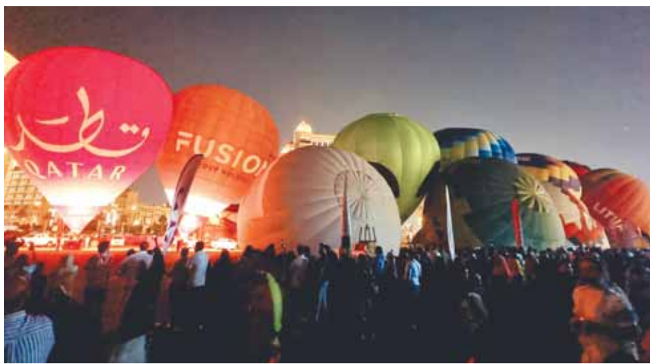
The 'Nightglow' attracted a large number of spectators on Friday.

Nightly "Nightglow" events and laser light and flame shows offer further spectacles.