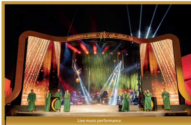
Live music performance