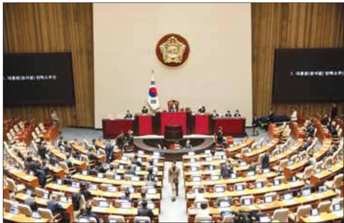
South Korean lawmakers cast their votes during a plenary session of the impeachment vote of President Yoon Suk-yeol at the National Assembly.