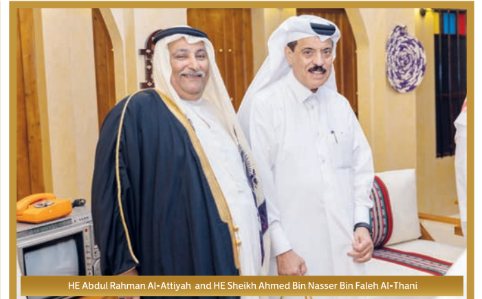
HE Abdul Rahman Al-Attiyah and HE Sheikh Ahmed Bin Nasser Bin Faleh Al-Thani