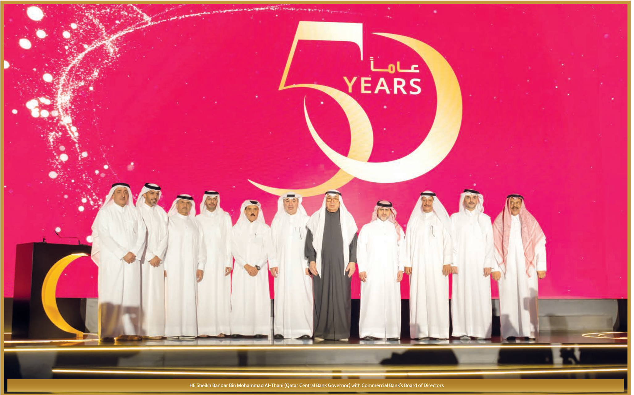
HE Sheikh Bandar Bin Mohammad Al-Thani (Qatar Central Bank Governor) with Commercial Bank's Board of Directors

Doha, Qatar: Commercial Bank, a leader in innovative digital banking solutions in Qatar, marked the monumental occasion of its 50 th anniversary with an exclusive Gala Dinner held on 9 December 2024 at the National Museum of Qatar.