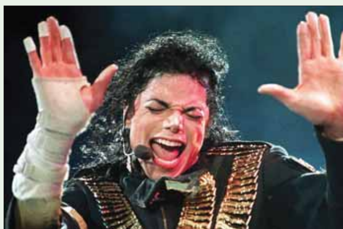
JUST BEAT IT: The songs cannot be released for legal reasons.