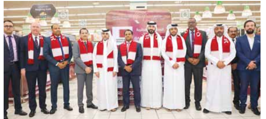
Snapshots from the launch event.