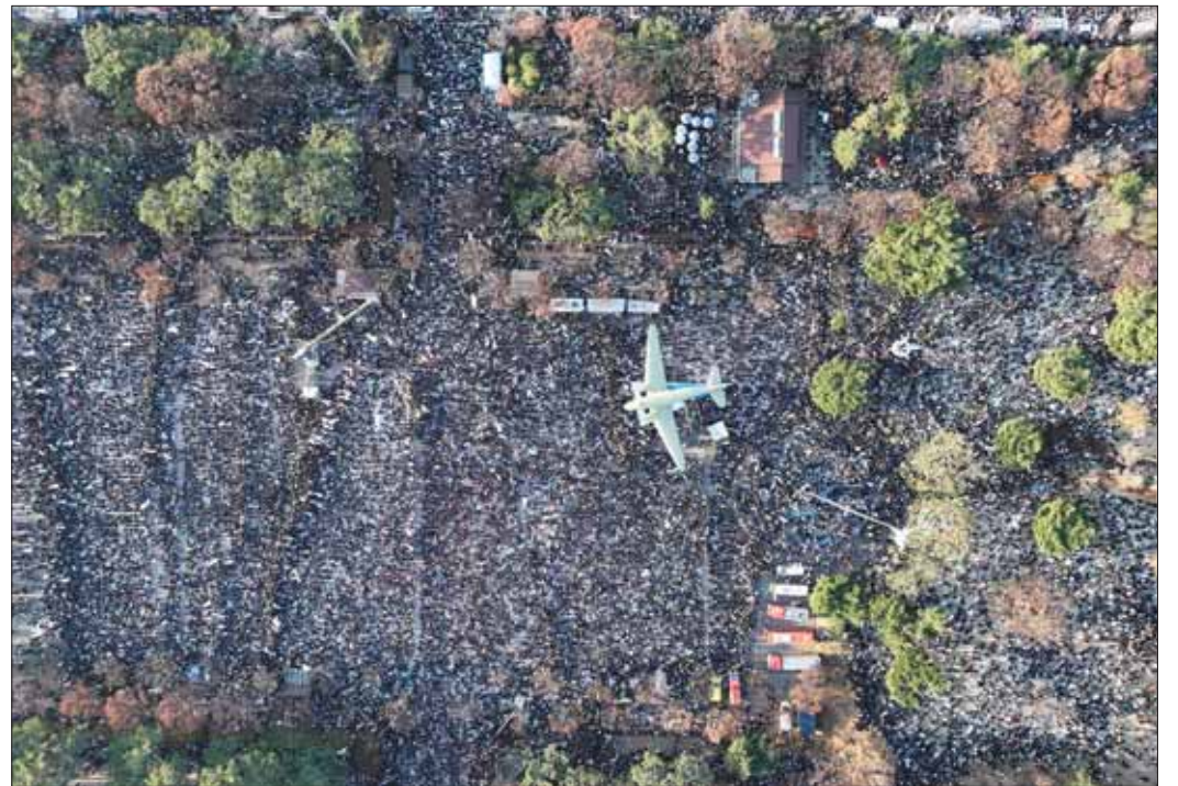
This aerial photograph taken yesterday shows protesters calling for the ouster of South Korea President Yoon Suk-yeol gathering to await the outcome of the second martial law impeachment vote in Seoul.

A Seoul police official told AFP at least 200,000 people had massed outside parliament in support of removing the president.