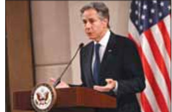
US Secretary of State Antony Blinken delivers a statement to the press after meeting with the foreign ministers of the Arab Contact Group on Syria.

In Aqaba, Blinken took part in talks that brought together top Arab and European diplomats as