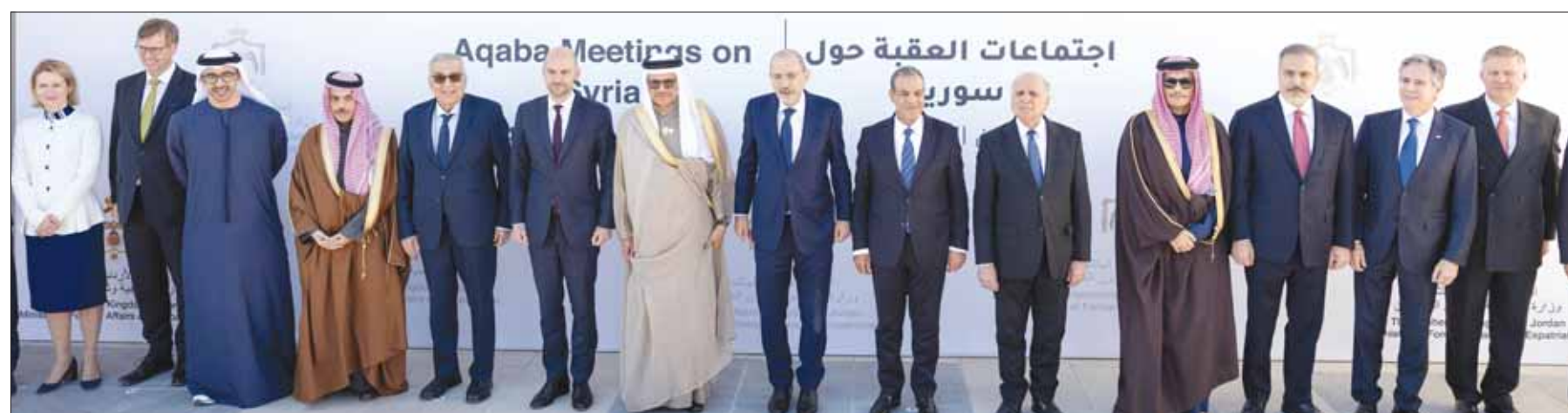
HE the Prime Minister and Minister of Foreign Affairs Sheikh Mohammed bin Abdulrahman bin Jassim al-Thani participated in an expanded ministerial meeting on Syria in the Jordanian city of Aqaba yesterday.

Qatar Charity has announced the launch of a humanitarian aid convoy to support the people of Syria, consisting of 40 trucks as the first batch. This effort aims to address their urgent basic needs considering the ongoing crisis they are facing. The announcement was made at a press conference held at the convoy's starting point on the Syrian-Turkish border. Page 12