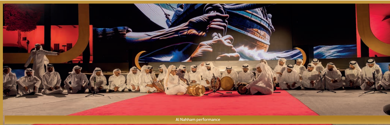
Al Nahham performance