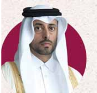
the cultivation of 3.1mn baby fish has exceeded annual targets.

He said that the ministry has developed the National Food Security Strategy for 2024-2030, incorporating cutting-edge technologies such as hydroponic and vertical farming, highlighting that