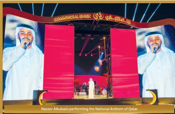
Nasser Alkubaisi performing the National Anthem of Qatar