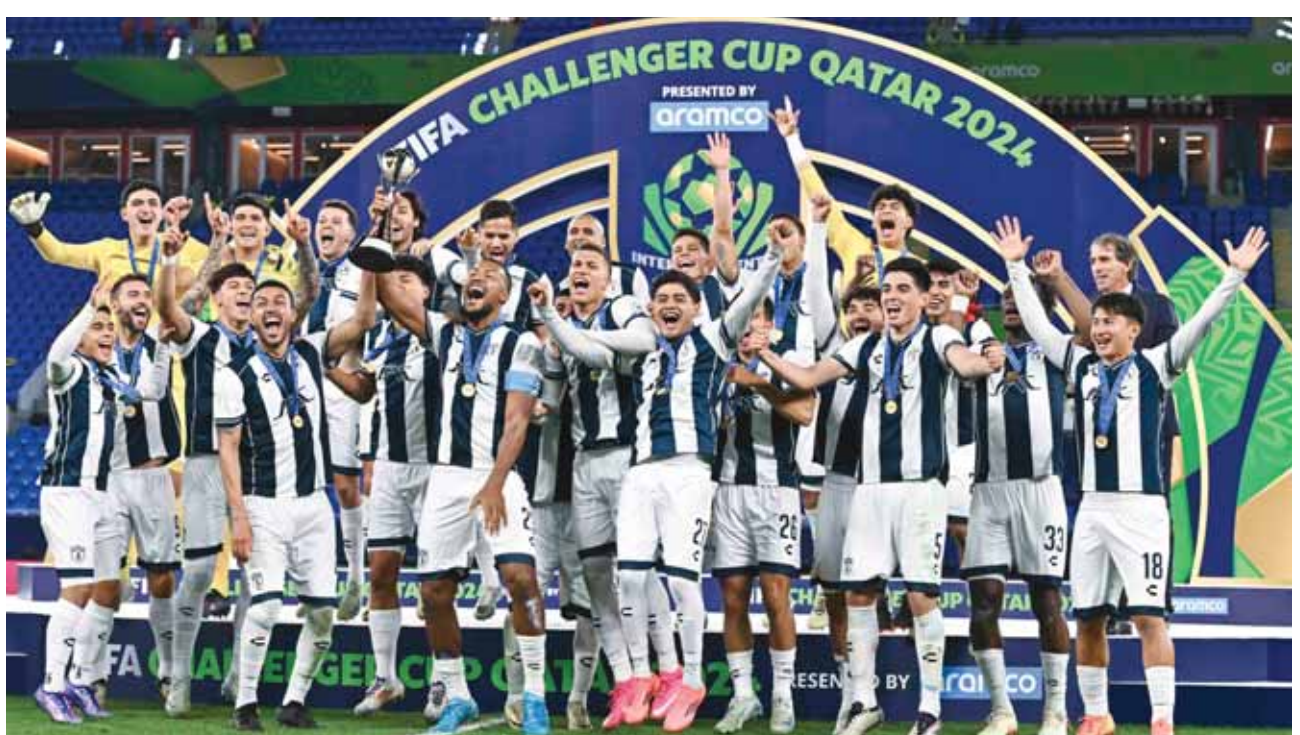
Pachuca's players celebrate after winning the FIFA Challenger Cup match against Egypt's Al Ahly at Stadium 974 in Doha yesterday.

Abdel-Fattah struck the bar in the shootout, denying Egypt's Ahly a victory that seemed within grasp