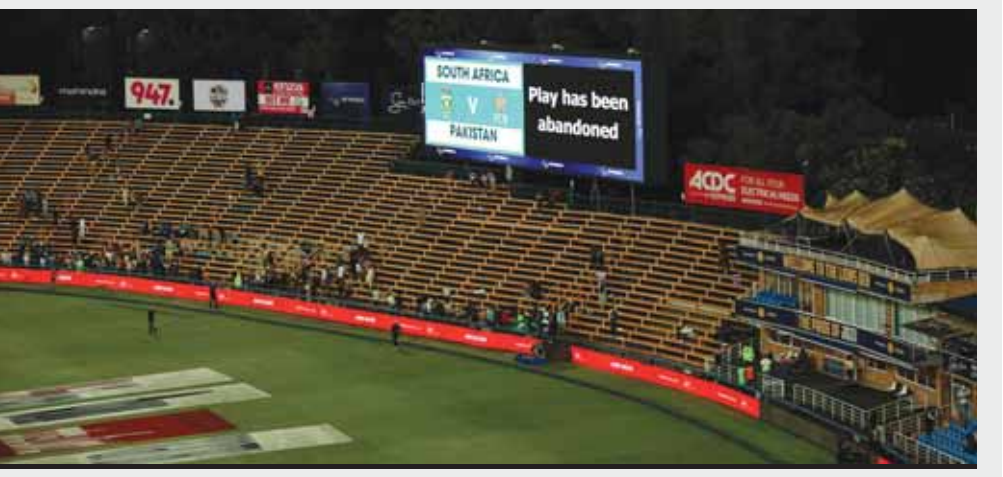
A general view of the electronic board displaying the message "play has been abandoned" due to bad weather during the third T20I between South Africa and Pakistan at Wanderers stadium in Johannesburg yesterday.

The third T20I between South Africa and Pakistan in Johannesburg was washed out by persistent rain without a toss. The game was initially delayed by lightning strikes in the area, before a steady drizzle set in. The drainage at the Wanderers is exemplary, and the groundstaff remained poised. When the rain briefly relented, an official inspection was announced and the groundstaff sprung into action. But before it could happen, the rain returned once more. It means South Africa sealed the three-match T20I series 2-0, having triumphed in the first game by 11 runs, and the second by seven wickets. It's South Africa's first bilateral series victory since August 2022. The teams begin a three-match one-day international series on Tuesday in Paarl, followed by two Tests in Centurion and Cape Town.