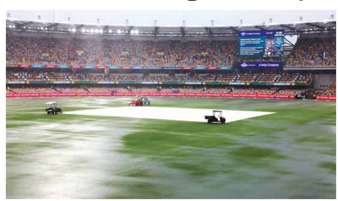
A general view of The Gabba as rain delays play on the first day of the third Test between Australia and India in Brisbane yesterday.

As it was, India will have to wait until day two to show their skills and may need early wickets to force a third consecutive result in