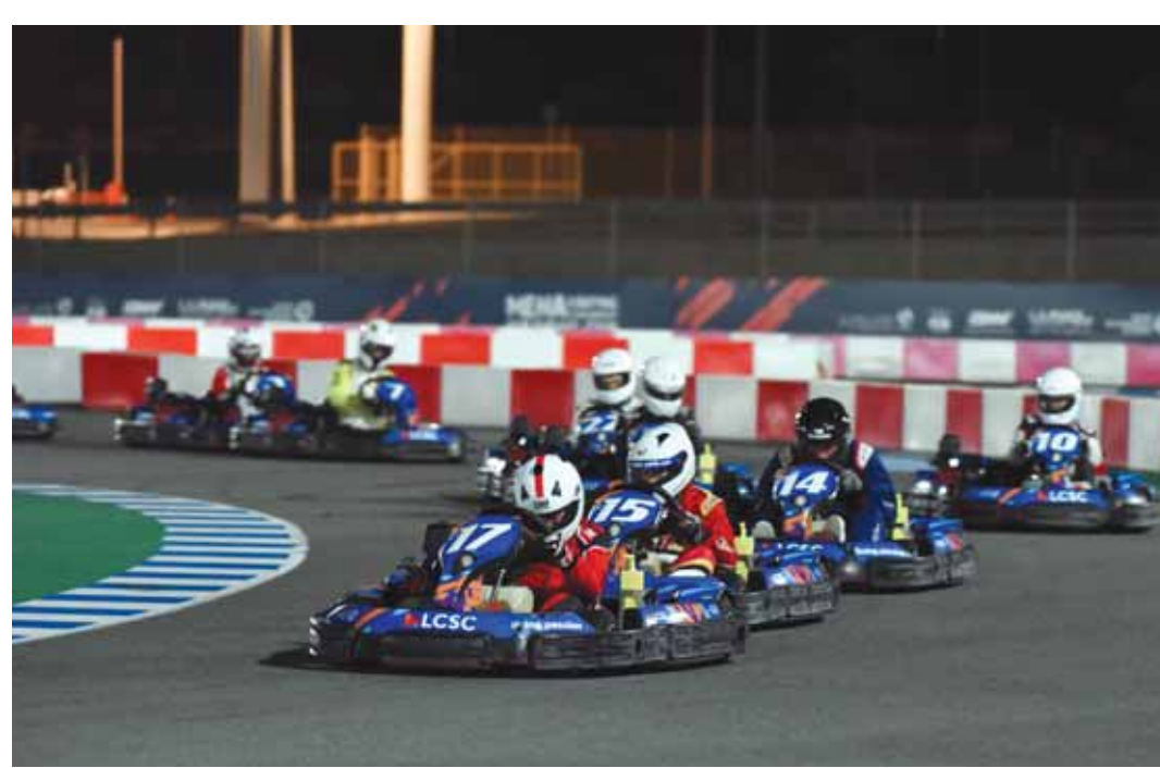
The championship will be held from December 19-21 at the LIC's karting track.

To ensure seamless access to the venue, visitors arriving in personal vehicles can utilise the designated General Admission Parking area and take advantage of the complimentary shuttle service to the karting track. A dedicated dropoff/pick-up point is also available for taxi services.