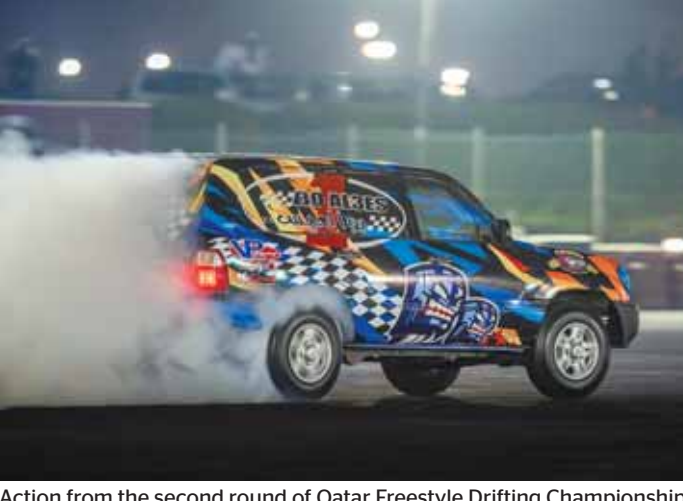
Action from the second round of Qatar Freestyle Drifting Championship.

vres: drifting, reverse driving, the knot move, and the reverse drive. These manoeuvres must be completed within a total time frame of four minutes, and the faster the