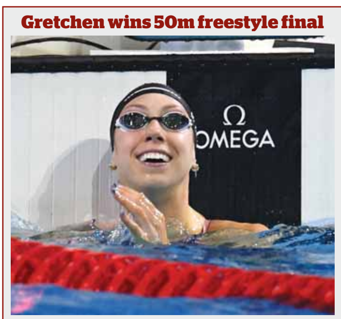
US Gretchen Walsh celebrates winning the women's 50m freestyle final during the World Aquatics Swimming Championships (25m) 2024 at Duna Arena in Budapest yesterday.

"I have family in Australia who will come to watch me," he said. "It's going to be amazing."