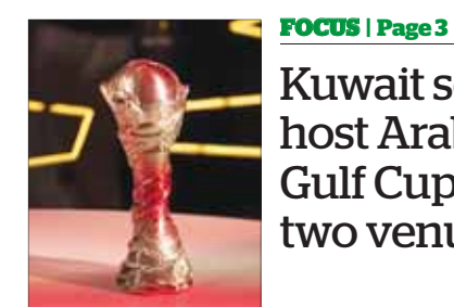
Kuwait set to host Arabian Gulf Cup at two venues