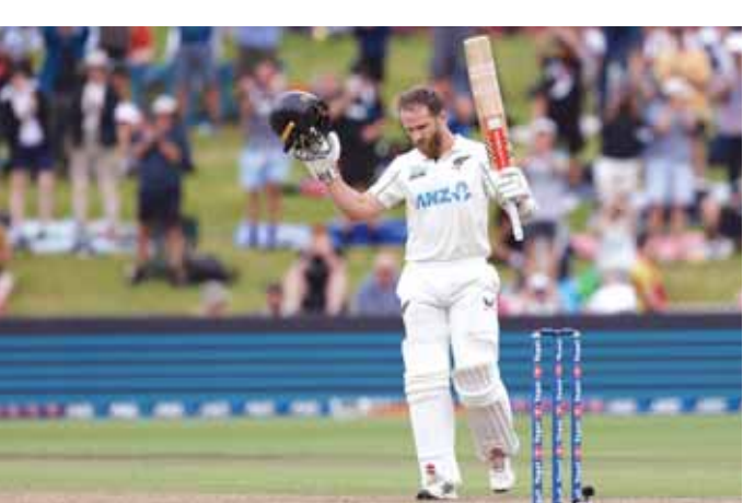
New Zealand's Kane Williamson celebrates a century on day three of the third Test match against England at Seddon Park in Hamilton yesterday.

afterwards when he fired a delivery down the off side at Ben Duckett and the England opener got a thick inside edge onto his stumps for four.