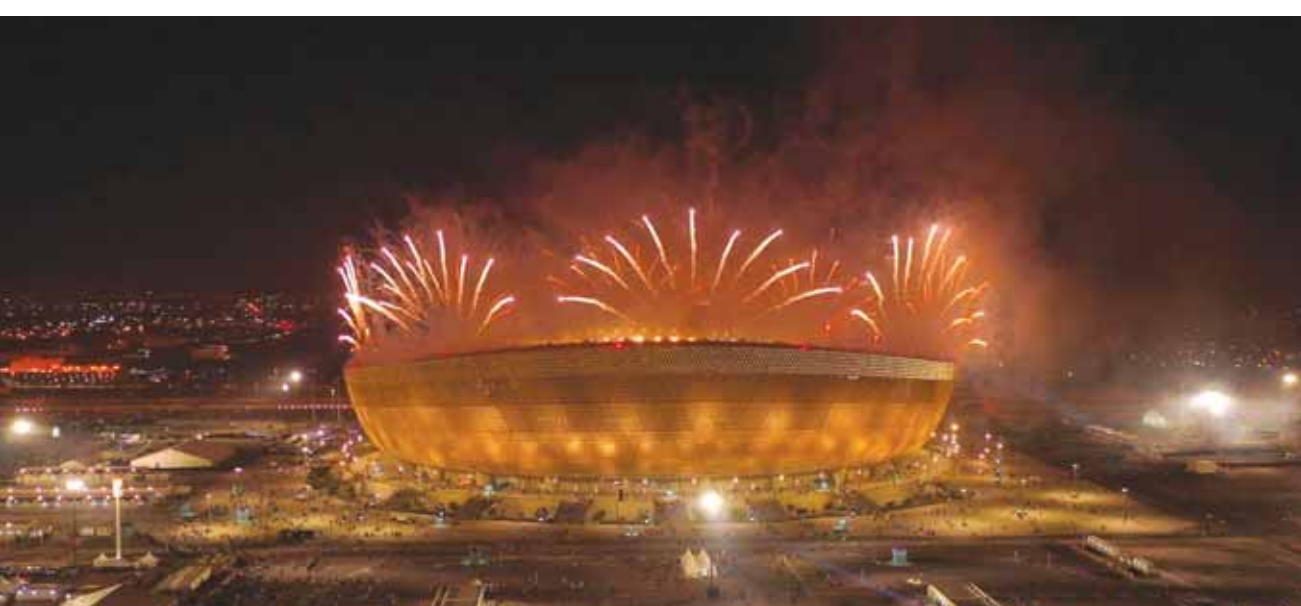
FIFA Intercontinental Cup Qatar 2024 Final will be held on December 18 at Lusail Stadium.

Lusail Stadium has several accessible seating options, and will offer Audio Descriptive Commentary and a sensory room during the match. Inquiries for accessible tickets can be made to accessibil-