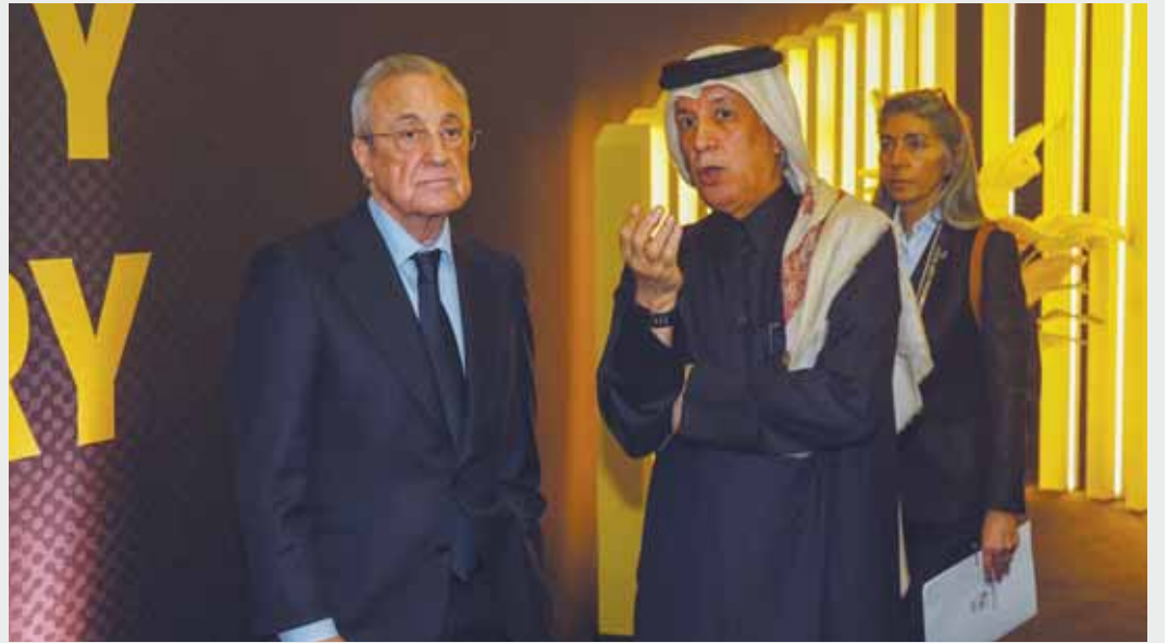
Qatar's Minister of State for Foreign Affairs Sultan bin Saad al-Muraikhi speaks to Real Madrid president Florentino Perez during the Best FIFA Football Awards 2024 ceremony at Aspire Academy.