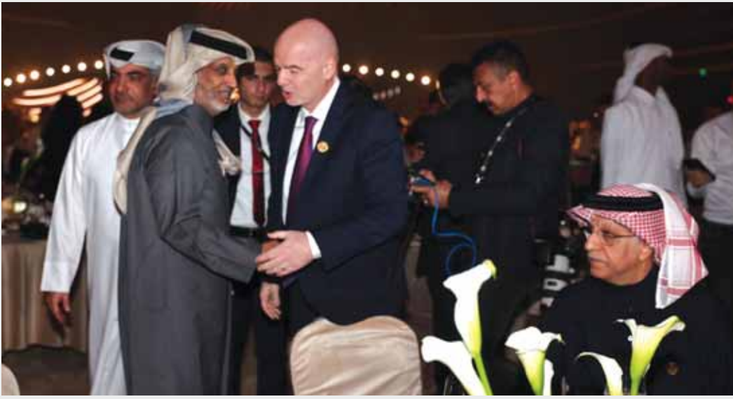
Minister of Sports and Youth HE Sheikh Hamad bin Khalifa bin Ahmed al-Thani met FIFA President Gianni Infantino during the Aspire Academy's 20th Anniversary celebration gala dinner and The Best FIFA Football Awards 2024 ceremony in Doha yesterday.