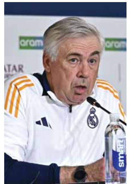
Real Madrid coach Carlo Ancelotti speaks at a press conference in Lusail.