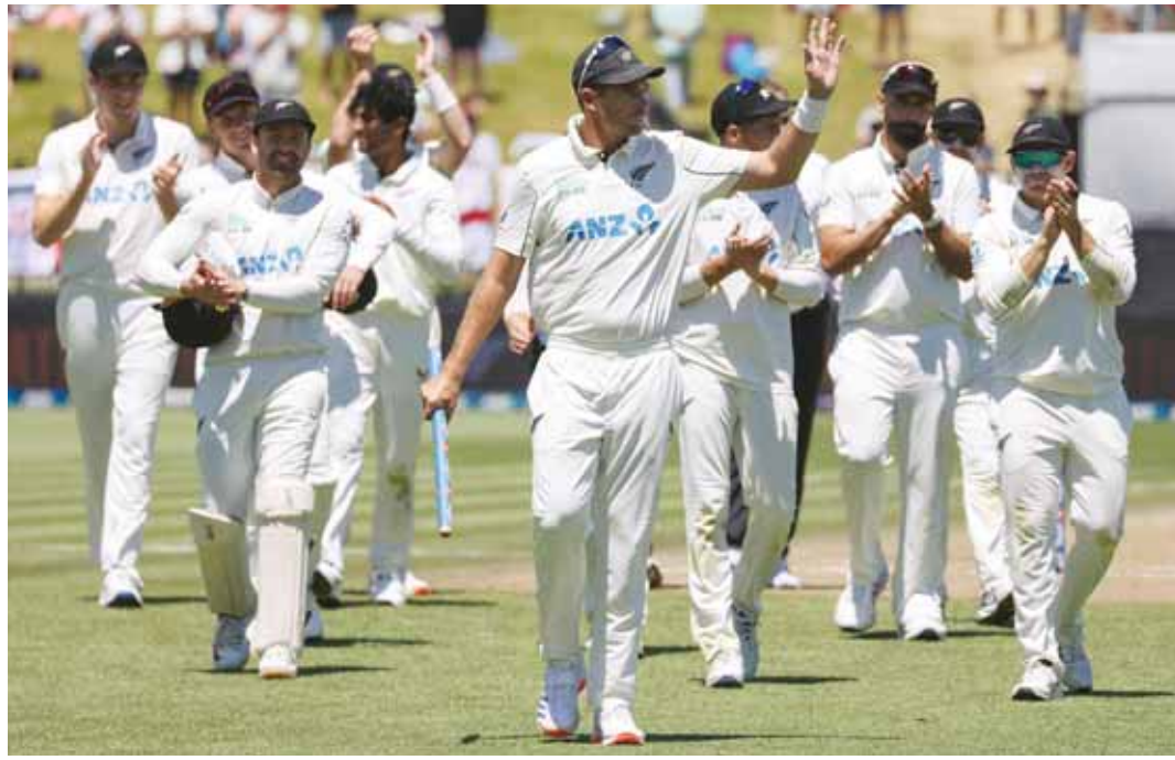
New Zealand's Tim Southee gestures to the crowd as he leaves the field in his final Test after victory during day four of the third test against England at Seddon Park in Hamilton yesterday.

quite at our best those first couple of games, but I think the way we came in here and were able to adapt to the surface was very pleasing."