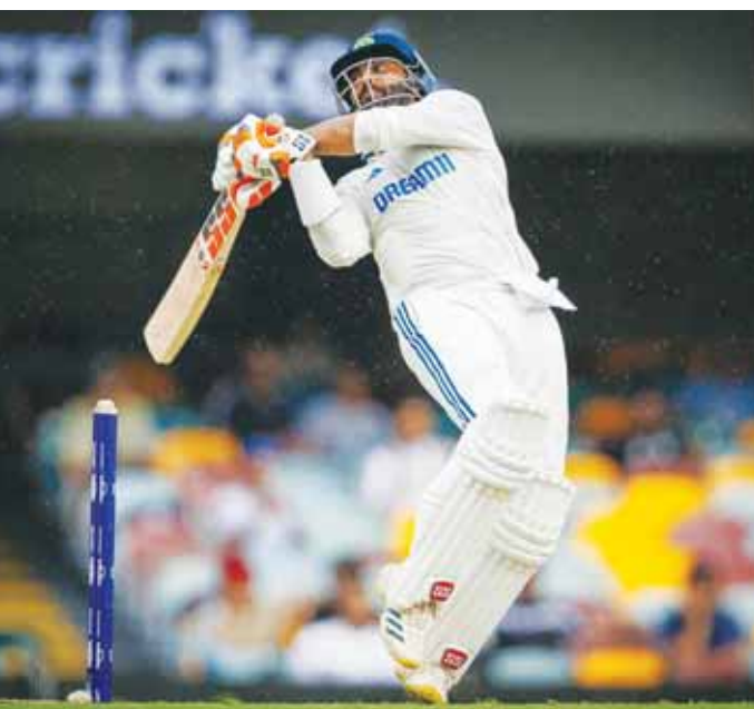
India's Ravindra Jadeja hooks Australia's captain Pat Cummins on day four of the third Test at The Gabba in Brisbane yesterday.

off Cummins to fall for 77, with Mitchell Marsh bolting in from deep square leg to take a fine, low catch.