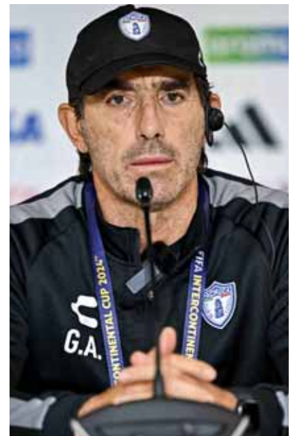
Pachuca coach Guillermo Almada.