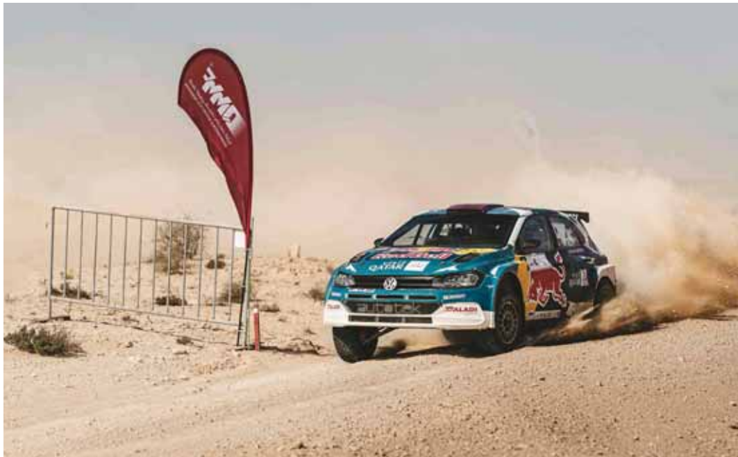
Qatar's Nasser Saleh al-Attiyah in action during the 2024 Qatar International Rally.

Runs through the Waab Al Mashrab, Al Waab and Al Khor stages to the north of Doha will