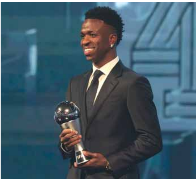
Vinicius Junior of Real Madrid poses with The Best FIFA Men's Player Award at Aspire Academy in Doha yesterday.