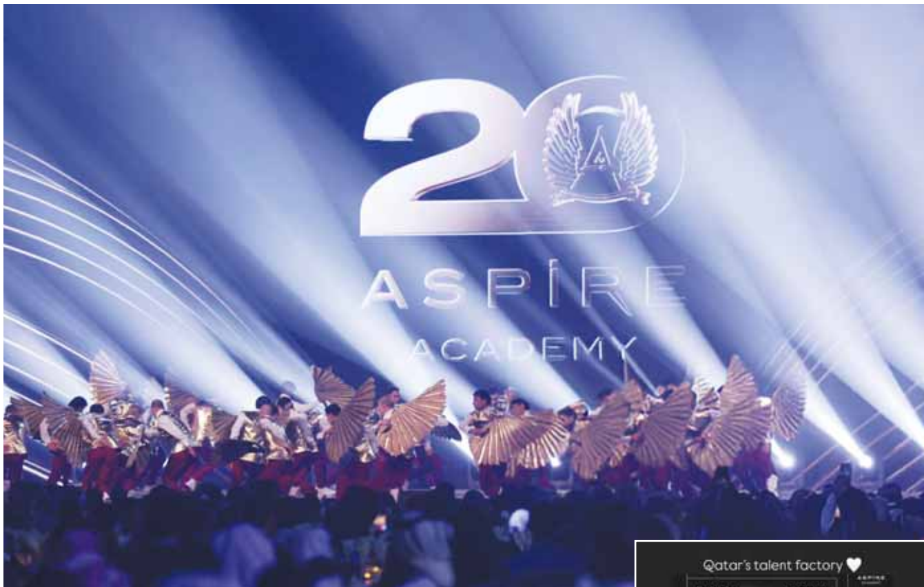
A glimpse of Aspire Academy's 20th anniversary celebration yesterday.

"Visitors are immediately struck by the facilities that we have here and how the place is, but we always stress one thing: yes, the facilities are incredible, and there is