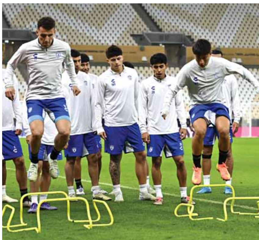
Pachuca player's warm up before a training session at the Lusail Stadium yesterday.

Madrid have endured significant injury setbacks, with defenders Dani Carvajal and Eder Militao sidelined long-term due to ACL tears, and David Alaba yet to return from a similar injury. Mbappe, Ferland Mendy, and Eduardo Camavinga are also dealing with short-term fitness issues. Vinicius Junior is also part of the squad having made his return from injury in