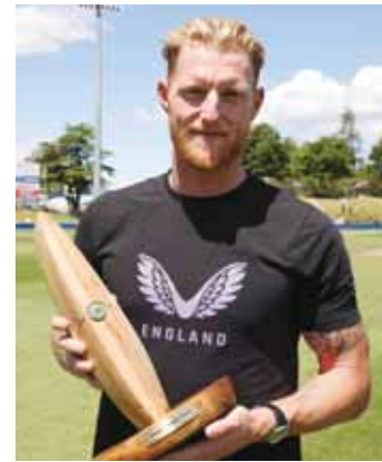
England's Ben Stokes holds the series trophy at Seddon Park in Hamilton yesterday.

Monday but he did take two wickets in his final innings to finish his career with 391, the second highest for a New Zealander behind Richard Hadlee. "We're certainly leaving one of the greats behind, but I'm sure he's got a bright future ahead of him, whatever that may be," added Latham, who was front and centre as Southee was honoured by Hadlee after the match.