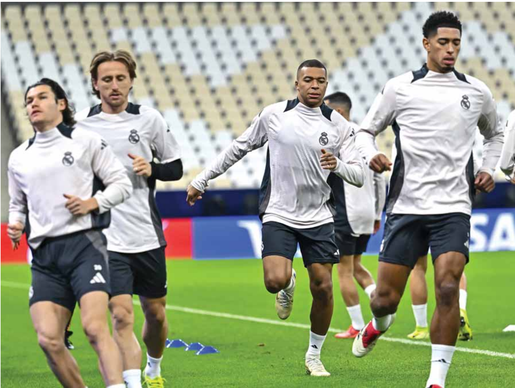
FROM LEFT: Real Madrid players Fran Garcia, Luka Modric, Kylian Mbappe and Jude Bellingham train at the Lusail Stadium yesterday, on the eve of the FIFA Intercontinental Cup final against Mexican side Pachuca.

THE REAL COACH TAD CAUTIOUS ABOUT KYLIAN MBAPPE'S AVAILABILITY FOR THE FINAL