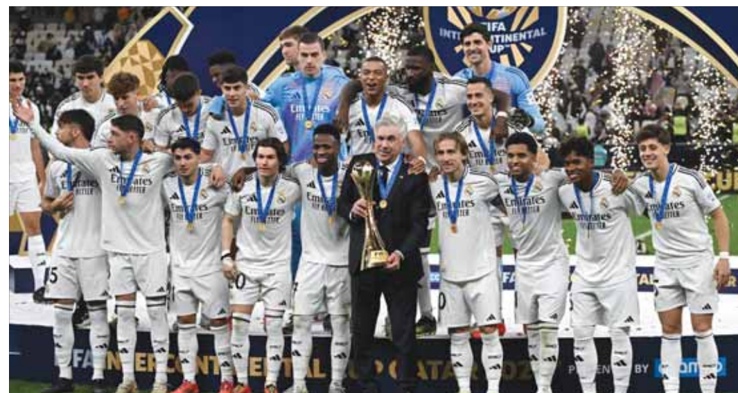
Kylian Mbappe and Vinicius Junior both scored as Real Madrid cruised to a 3-0 victory over Mexican side Pachuca in the Intercontinental Cup final in Doha yesterday. Mbappe opened the scoring in the 37th minute before Rodrygo doubled Madrid's lead early in the second half. Vinicius sealed a comfortable win for the Spanish and European champions with a late penalty. Sport Page 1