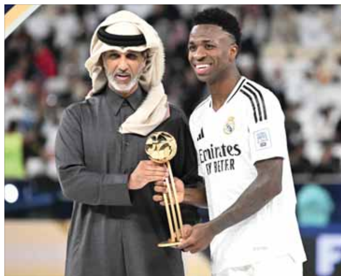
Sports and Youth Minister HE Sheikh Hamad bin Khalifa bin Ahmed al-Thani presents Real Madrid's Brazilian forward Vinicius Junior with the golden ball trophy after the 2024 FIFA Intercontinental Cup final against Mexico's Pachuca at the Lusail Stadium in Doha yesterday.