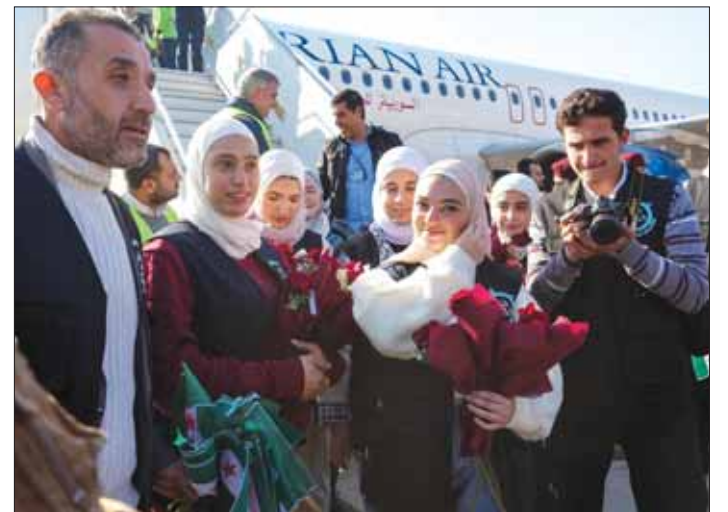
Passengers disembark from a Syrian Air aircraft arriving from Damascus, at the airport of the northern city of Aleppo, yesterday.

In the terminal, the new flag also replaced the one linked to Assad's era. An airport official told