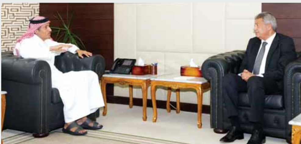
HE Chairperson of Qatar Media Corporation Sheikh Hamad bin Thamer al-Thani met with Head of Supreme Council for Media Regulation of the Arab Republic of Egypt Khaled Abdel Aziz. During the meeting, they discussed the media relations between the two countries and ways to support and develop them. (QNA)