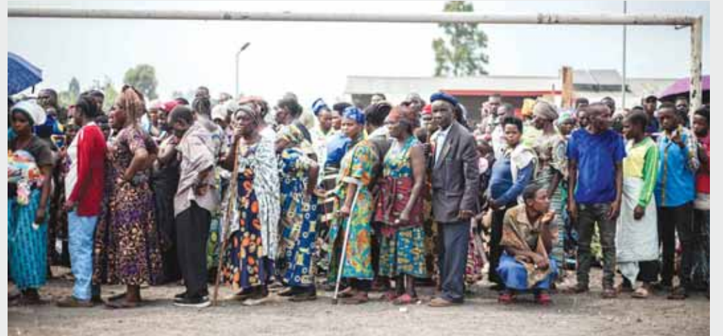
Voters in the elections for the Bulengo Internally Displaced Persons Camp (IDP) representatives in Bulengo, outside Goma, queue, yesterday. Internally Displaced Persons elected their representative at the camp, home to a population of more than 40,000 who fled the M23 conflict that has forced hundreds of thousands of civilians to flee their homes.