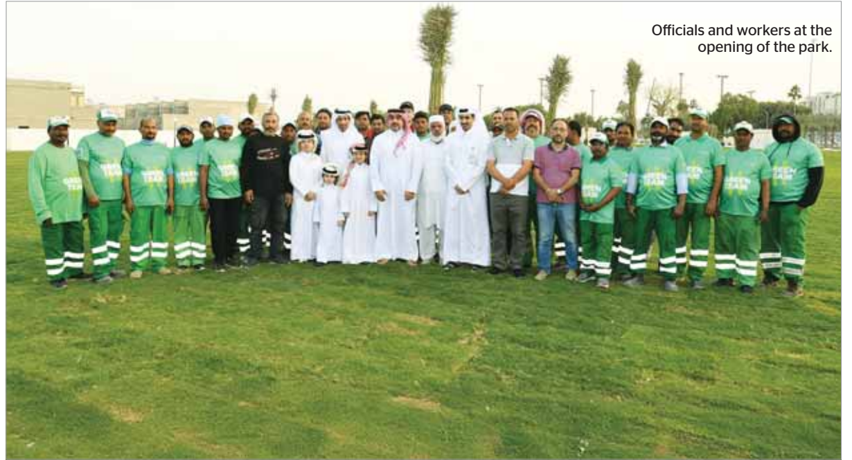
Officials and workers at the opening of the park.