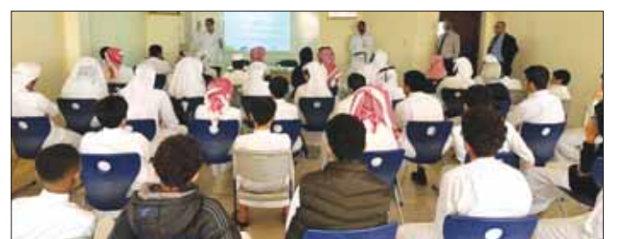
An awareness session by the Tobacco Cessation Centre.

The Tobacco Cessation Centre intensified awareness campaigns in educational institutions by launching a campaign in collaboration with the Ministry of Education and Higher Education across several schools in Qatar. The campaign aimed to raise awareness, provide accurate information, and correct misconceptions about tobacco and its products, while also reducing tobacco use among youths.