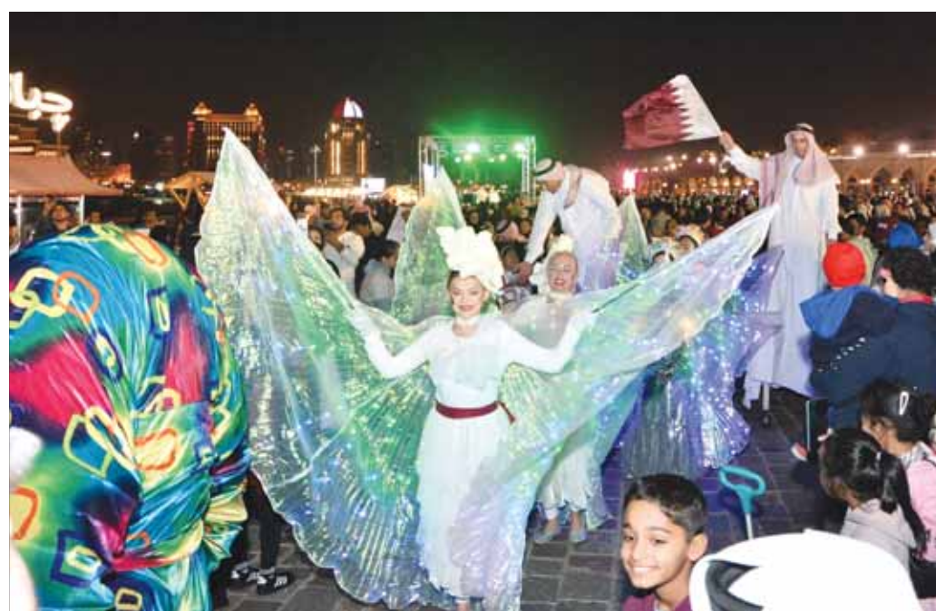
Katara Cultural Village's Qatar National Day celebrations concluded yesterday, after attracting thousands of citizens and expatriates who enjoyed the national and heritage events and the impressive military displays. Page 11