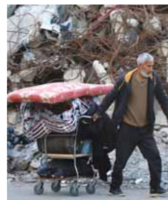
A Palestinian man evacuates from his home with his belongings, at the Bureij refugee camp in the central Gaza Strip yesterday.

Medics said an Israeli air strike killed at least 10 people in a house in the northern town of Beit Lahiya while six were killed in separate air strikes in Gaza City, Nuseirat camp