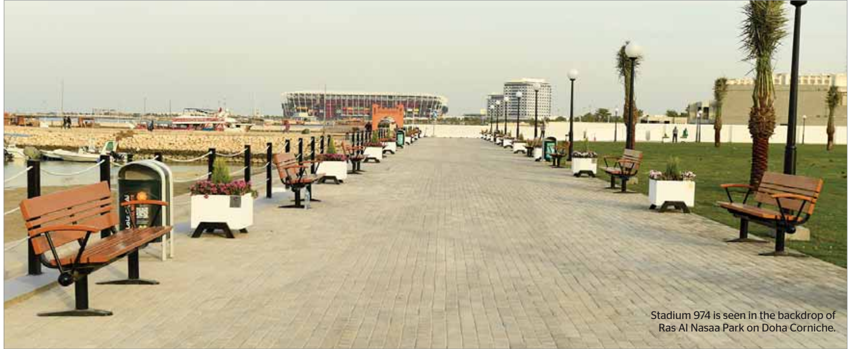
Stadium 974 is seen in the backdrop of Ras Al Nasaa Park on Doha Corniche.

Abbas explained that the park, completed in a record time of 30 days, used materials from Expo 2023 Doha, such as seating, lighting, irrigation systems, and more. The park spans a green area of about 14,000sq m, of which 10,000sq m are dedicated to natural grass, trees, and palm trees irrigated using advanced modern systems.