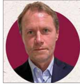
French ambassador in Doha Jean-Baptiste Favre.

He emphasised the commitment of both Qatar and France to promoting peace and resolving regional and international issues through peaceful means and dia-