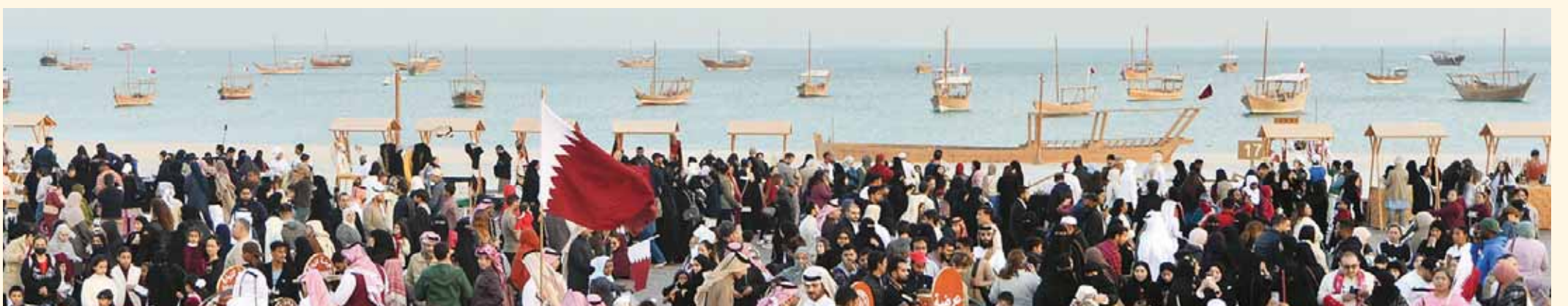
Katara's QND celebrations concluded yesterday after attracting thousands of visitors.