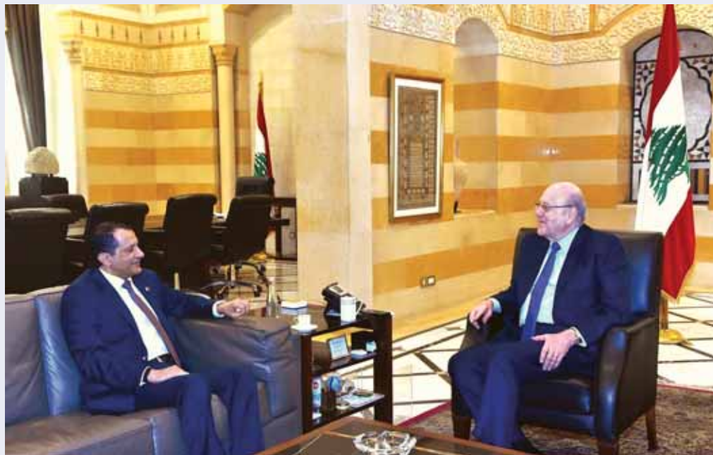
Lebanese Caretaker Prime Minister Najib Mikati met yesterday with Qatar's ambassador in Beirut Sheikh Saud bin Abdulrahman al-Thani. The meeting discussed bilateral relations. (QNA)