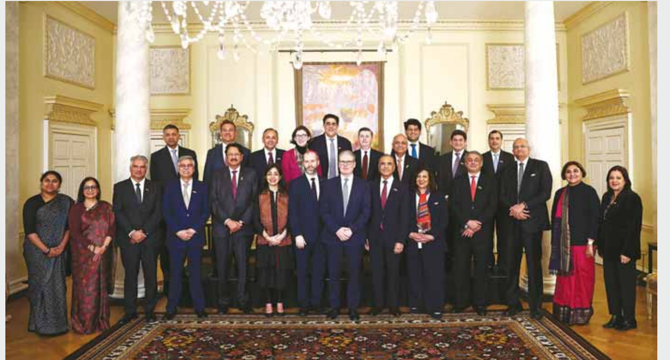
Britain's Prime Minister Keir Starmer poses for a group photo with Indian investors and CEOs, before hosting a meeting with them inside 10 Downing Street in central London yesterday.