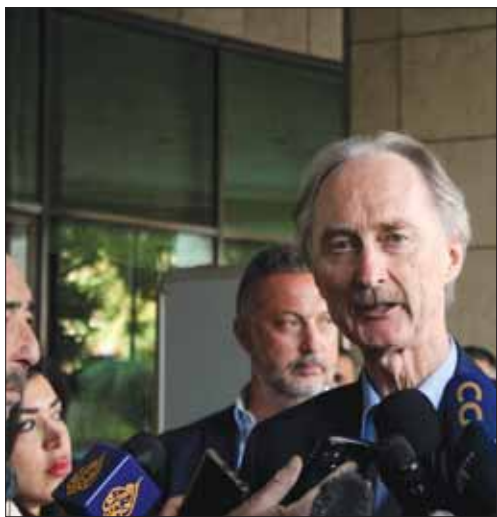
Geir Pedersen, UN Special envoy to Syria, talks to media before departing Damascus, yesterday.

"Syria will not be divided," he told AFP, adding that "the Kurdish people are one of the components of the Syrian people." HTS has also vowed justice for the crimes committed under Assad's rule, including the disappearance of tens of thousands of people into the complex web of detention centres and prisons that was used for decades to silence