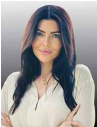
By Laura Iancu Founder of Diplomats.Digital

P icture this: A diplomat steps into a negotiation room equipped not just with policy briefs, cultural insights and traditional intelligence but also a rich dataset that maps public sentiment, economic indicators, social trends, emerging concerns and potential allies in the opposing nation. With a few clicks, the diplomat identifies key influencers, potential allies, and confidently navigates the conversation, offering tailored solutions and anticipating objections.