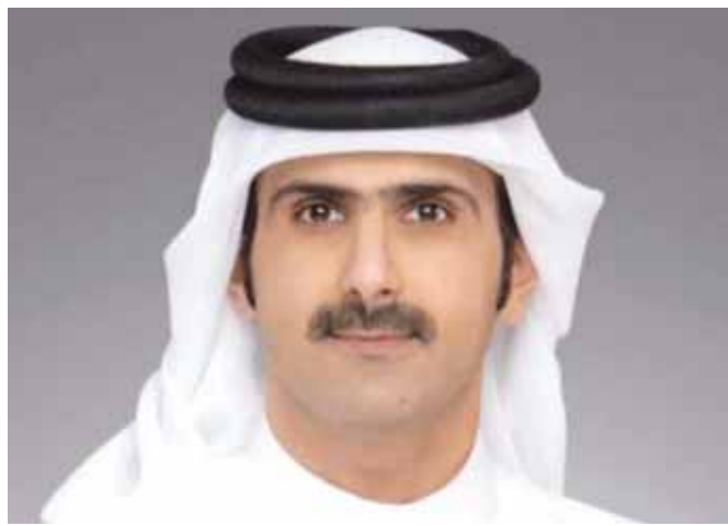
HE the Minister of Culture Sheikh Abdulrahman bin Hamad al-Thani

tion to continue its development journey, strengthen its leadership across all sectors, and strive for further progress and prosperity, reflecting its visionary approach to a brighter future.