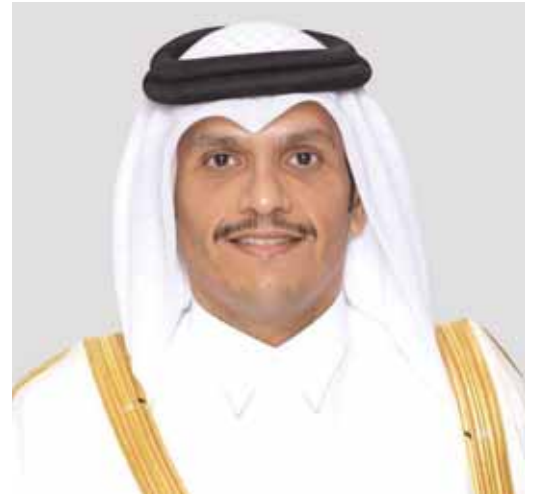
HE the Prime Minister and Minister of Foreign Affairs Sheikh Mohammed bin Abdulrahman bin Jassim al-Thani

Concluding his statement, HE Sheikh Mohammed reaffirmed Qatar’s deep commitment to its ambitious strategy. He emphasised the country’s determina-