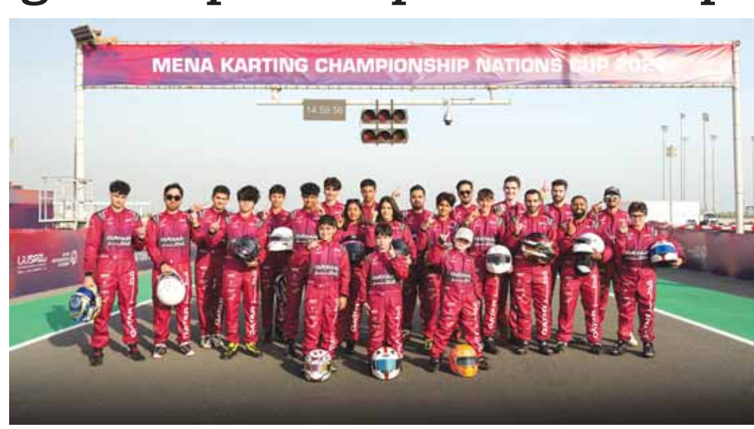
Qatar drivers participating in the Mena Karting Championship Nations Cup pose at Lusail International Circuit.

Limited trackside seating will be available for spectators to catch action, secure your spot now by registering yourself here (https:// events.lcsc.qa/preregistration).