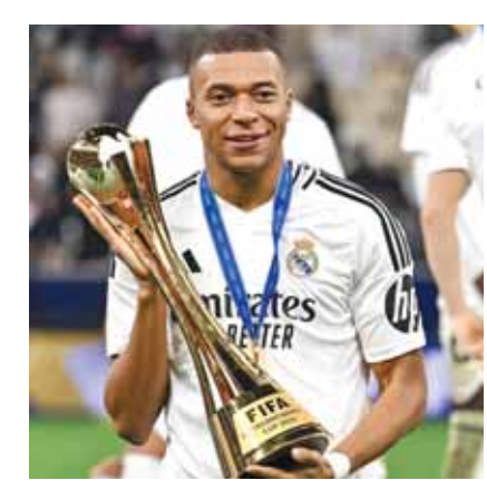
Kylian Mbappe poses with the trophy.

This is the first edition of the FIFAbacked Intercontinental Cup, which broadly maintains the format of the previous Club World Cup. The latter is being expanded to include 32 teams in 2025 and will now be played every four years. A past version of the Intercontinental Cup ran from 1960 to 2004, involving the champions of Europe and South America.