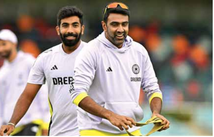
This picture taken on December 1, 2024 shows India's spin bowler Ravichandran Ashwin (right) attending a warm-up session with teammate Jasprit Bumrah at Manuka Oval in Canberra yesterday.

every bit of the journey" with the bowler. "Your skill and match-winning con-