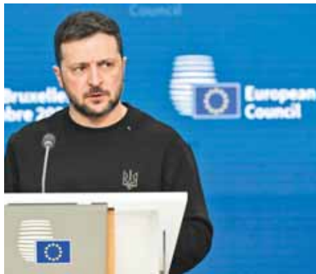
Zelensky is seen during his press conference following the European Council meeting at the EU headquarters in Brussels.

"If we are talking about a contingent, we need to be specific - how many, what they will do if there is aggression from Russia," Zelensky said.