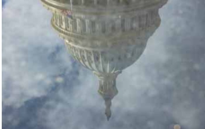
A reflection of the US Capitol in Washington is pictured after US President-elect Donald Trump called on lawmakers to reject a stopgap bill to keep the government funded beyond this week, raising the likelihood of a partial shutdown.

Trump and his ally Elon Musk, the world's richest person, effectively torpedoed the spending deal