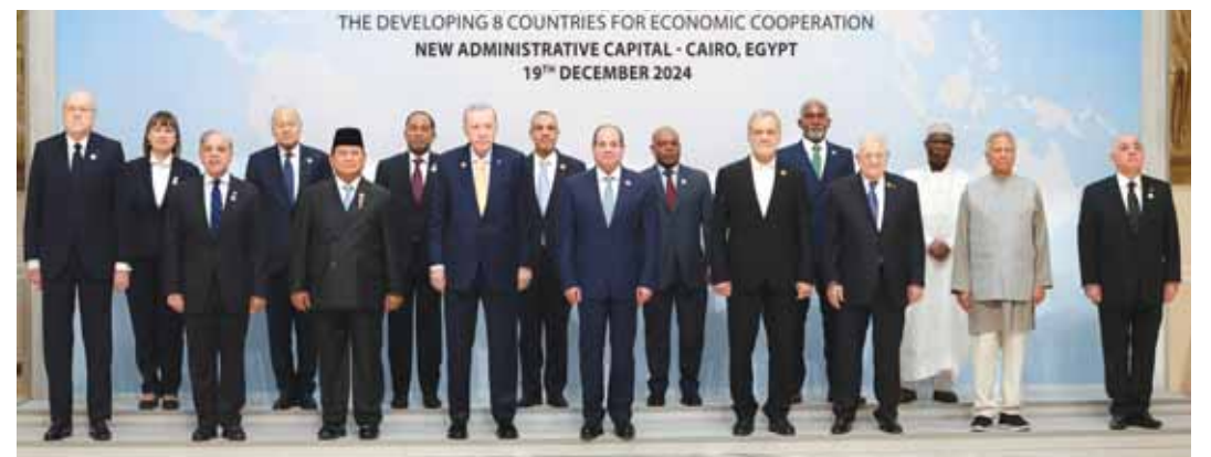
Iranian President Masoud Pezeshkian , Egyptian President Abdel Fattah al-Sisi , Turkish President Recep Tayyip Erdogan pose with other leaders for a group photo during the D-8 summit in Cairo yesterday.

Iran's Foreign Minister Abbas Araghchi visited Egypt in October, while his Egyptian counterpart Badr Abdelatty travelled to Tehran