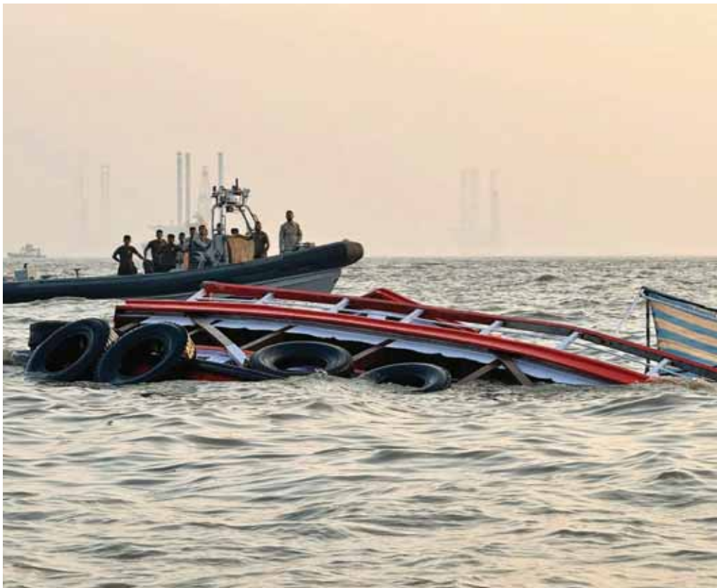
Indian defence personnel carry out rescue operation after an accident off the coast of Mumbai.

A move by Indian opposition parties to impeach Vice-President Jagdeep Dhankhar for allegedly performing his job in a partisan manner was rejected, parliament said yesterday. The vice-president, India's second highest constitutional office, acts as the chair of the upper house of parliament, known as the Rajya Sabha, and opposition parties have accused Dhankhar of being partisan in his role. Sansad Television, parliament's TV channel, said the opposition's notice has been dismissed. Harivansh Narayan Singh, deputy chairman of parliament's upper house, said the notice to impeach Dhankhar was "severely flawed" and aimed at demeaning the constitutional office of vice-president. The winter session of parliament has been disrupted several times with government and opposition parties accusing each other of not allowing legislative business by creating political controversies.