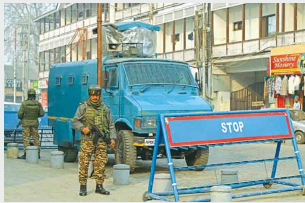
Indian security personnel stand guard along a street in Srinagar yesterday. Security forces in Kashmir yesterday killed five terrorists in clashes, the army said, the latest outbreak of violence in the region.