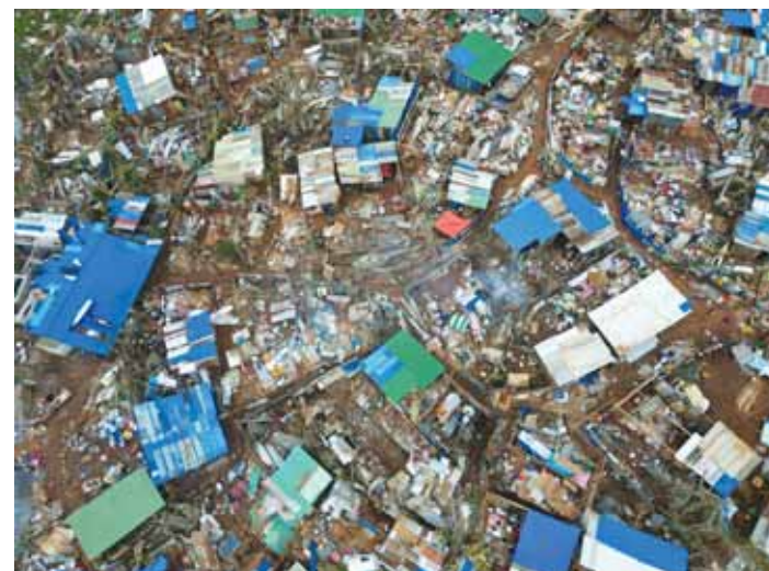
A drone view shows damaged houses in the aftermath of Cyclone Chido, in Kahani, Mayotte.

Assessing the toll is further complicated by illegal immigration into Mayotte, especially from the Comoros islands to the north,