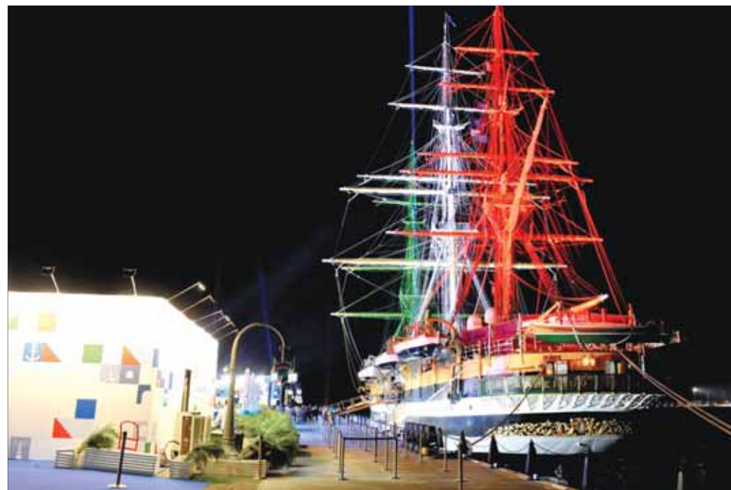
Showcasing the vividness of Italian culture, tradition, cuisine and its position in innovation and agri-tech, the Villaggio Italia exhibition was opened at Old Doha Port yesterday. Open until Sunday (December 22), the exhibition, featuring Italian products is a part of the global tour of the historic sailing ship 'Amerigo Vespucci' which arrived in Doha to convey the message of peace and partnership and testify to the diplomatic relations between Qatar and Italy. Page 12