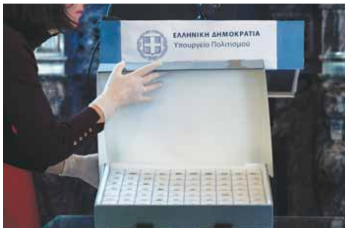
These photographs show some of the stolen ancient coins that Greece returned to Turkiye in the first repatriation of its kind between the historic rivals and neighbours, at the Numismatic Museum in Athens.