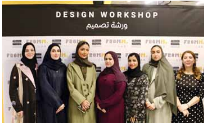
talents, and we look forward to further collaborations that can elevate design standards in Qatar."