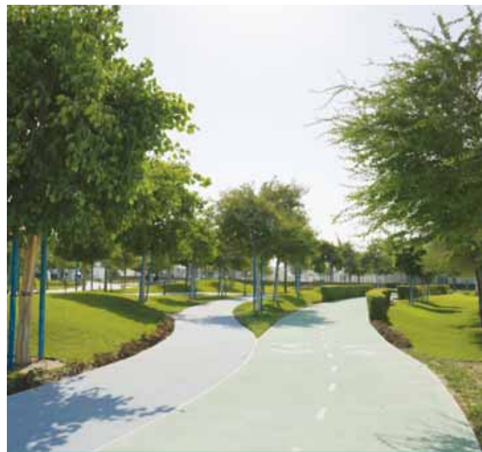
The green space increased by 2.3% all over the country, amounting to a total of 18mn sq m, during 2024.

The Ministry also attained several global recognitions for the Qatari cities, including the Best Visual Work Award for the Digital Twin Project for Rainwater Measurement Stations in Sydney,