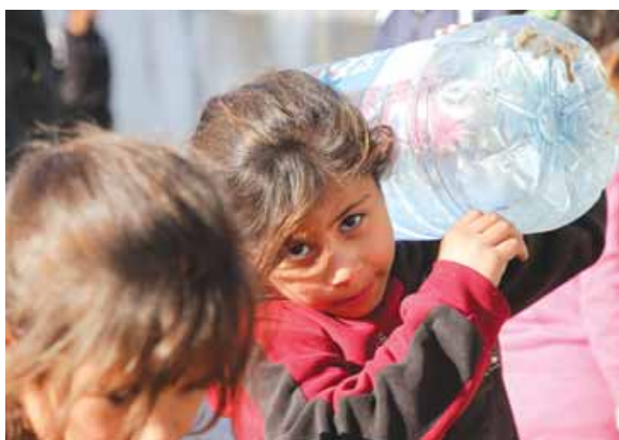
A Palestinian child carries a water container in Khan Younis in the southern Gaza Strip yesterday.

Israel's offensive since October 2023 has killed at least 45,129 people in Gaza, a majority of them civilians, according to figures from the Hamas-run territory's health ministry