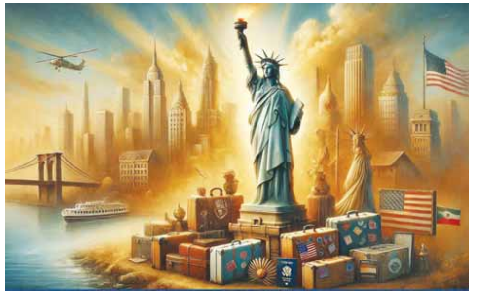
Most of the immigrants taken into custody by US Immigration and Customs Enforcement (ICE) are caught illegally crossing the border or are referred from state and local prisons and jails.

The vast majority of the immigrants in the US illegally in 2022 were prime working age, according to the DHS report. About 8.7mn of the 11mn were ages 18-54. Farm groups have