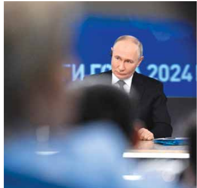
Putin is seen during his annual end-of-year press conference in Moscow.

"We cannot live with a frozen conflict in our territory," he told reporters.