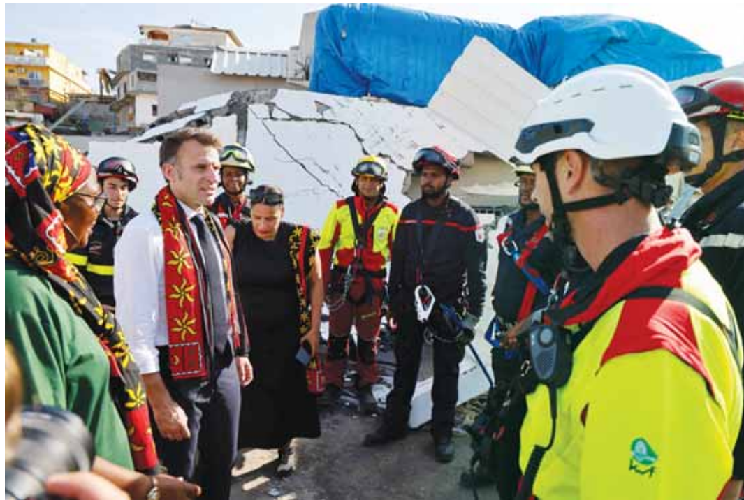
France's President Emmanuel Macron speaks with rescuers and firefighters during his visit at the kavano district in Mamoudzou, on the French Indian Ocean territory of Mayotte, yesterday.

At Mamoudzou hospital centre, windows were blown out and doors