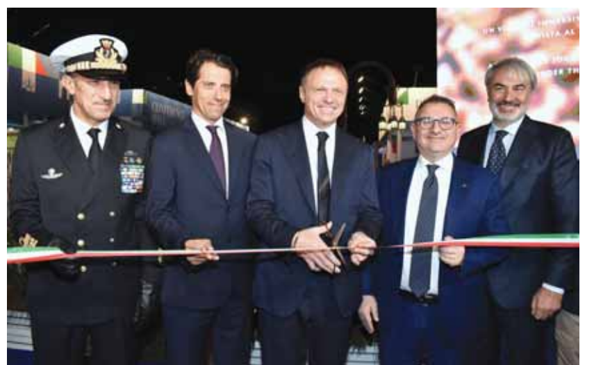
Italian Agriculture Minister Francesco Lollobrigida and other dignitaries opening the Villaggio Italia at Old Doha Port yesterday.

“At Expo 2023 Doha, Italy participated while showcasing the innovations in the agriculture sector and technology,” he