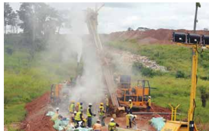
Employees work at a gold mine located approximately 200km northwest of the port city of Abidjan.

Mining Minister Mamadou Sangafowa Coulibaly has urged